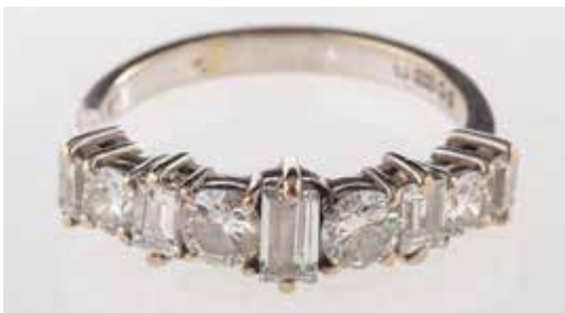
639 An 18ct gold and diamond ring , half set with alternating brilliant cut and baguette cut diamonds, approximately 1.20 carats total, stamped 750 with full London hallmarks for 1984, ring size M *£800 - 1200