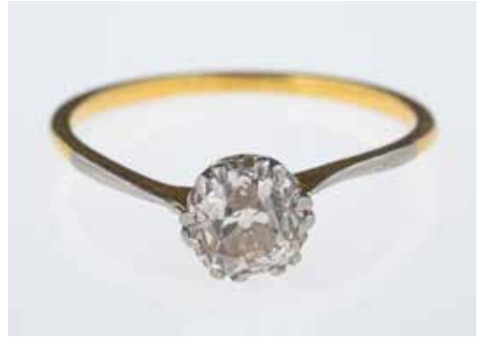
593 A solitaire diamond ring, set with an old cut stone estimated to be 0.85 carat, in platinum claw setting with yellow gold band, ring size O *£700 - 1000