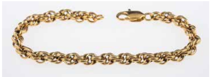
678 A gold fancy link bracelet, length 18 cm, testing as 14 ct gold