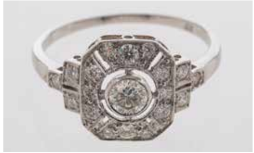
586 A platinum openwork set plaque ring in millgrain setting, centre stone estimated at 0.25 carat, ring size N-O *£600 - 800