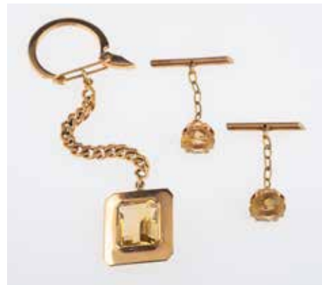
634 Citrine set cufflinks with chain and bar fitting, and a matching citrine set key ring *£120 - 160