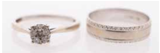
620 Two white gold rings , a diamond cluster ring, and a gold band with relief decoration, both 9ct gold, ring size Q