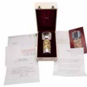
81 Aurum Designs Ltd, a silver parcel gilt Hereford Cathedral limited edition commemorative goblet by John Sutherland Hawes, London 1976, no. 180 of 676, 336g (10.8 oz), 16.5cm (6 1/2in) high; with its certificate and box