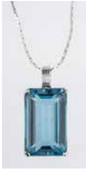
637 A blue topaz pendant , the rectangular faceted stone of good 'sea blue/green' colour, stone estimated at 40 carats, set in 18ct white gold mount and chain *£300 - 500