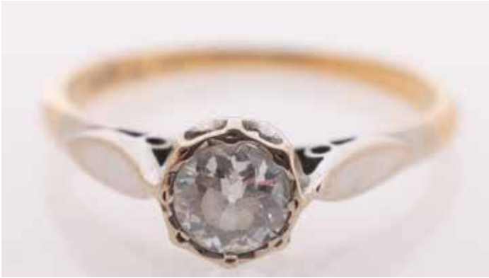
535 A diamond single stone ring, the old brilliant cut diamond, estimated to weigh 0.45 carats, in a collet setting, stamped 18ct Plat, ring, size K 1/2 *£400 - 600