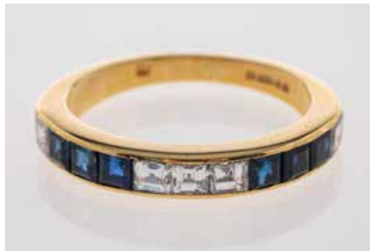
646 A sapphire & diamond set half eternity ring with square cut sapphires and diamonds in 18ct yellow gold mount, ring size J-K