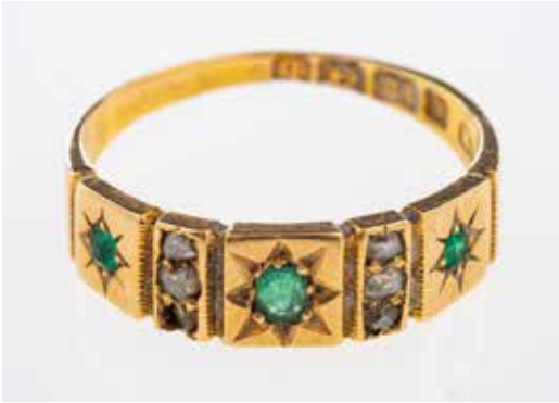
743 A Victorian band ring set with small emerald and rose cut diamonds, 18ct gold, hallmarks for Birmingham 1876, in Victorian circular box *£100 - 150