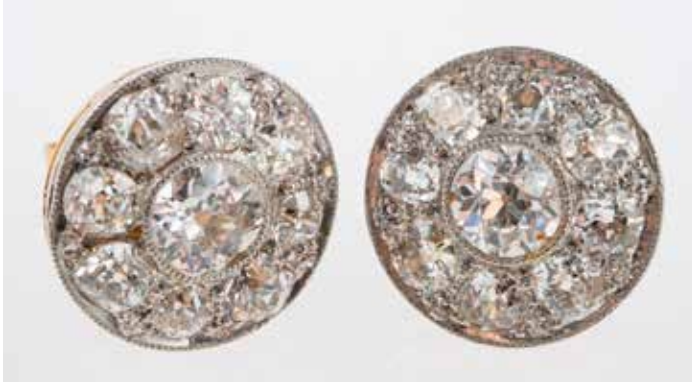
566 An Edwardian diamond set earrings, set with old cut stones in a millgrain setting, the principle diamonds estimated at 0.50 carat and the total 2.60 carats, unmarked gold and platinum *£800 - 1200