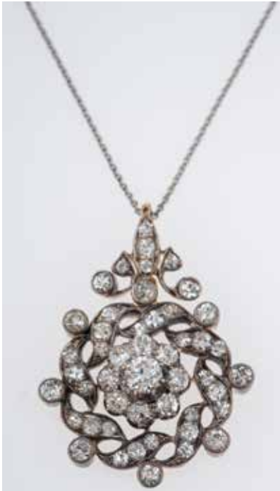
568 An antique diamond pendant C1910, the central floral setting with a diamond of 0.33 carats, silver and gold setting, total diamond weight estimated at 2.50 carats, on white metal chain, in fitted case by Goldsmiths and silversmiths, pendant length 3 cm, with white metal chain. *£800 - 1200