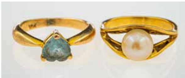
842 A pearl ring set in 18ct gold and a blue topaz ring unmarked, both ring size H