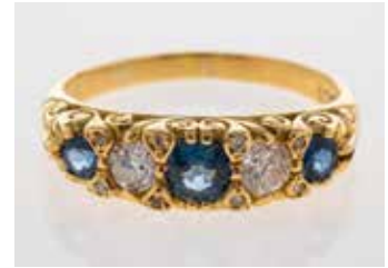
589 A sapphire & diamond five stone ring in carved 18ct yellow gold mount, sapphires are mid blue, diamonds are brilliant cut with diamond point accents, size T-U *£700 - 1000