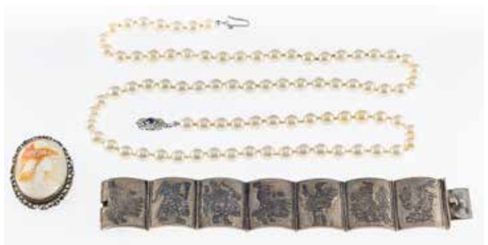
520 No Lot