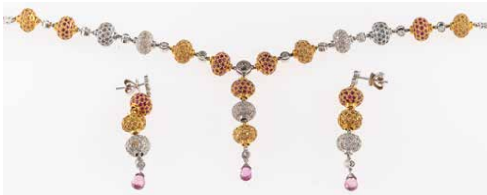
544 A contemporary diamond, ruby and pink sapphire pendant necklace, gem encrusted 18ct white and yellow gold 'baubles' with single diamond set spacers, pink sapphire drop, and matching earrings, length 5cm