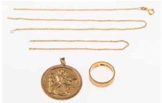
817 A group of gold jewellery St Christopher pendant, stamped 375 with Birmingham hallmarks, 2.7cm diameter; a 9ct gold ring, ring size J 1/2; and a 9ct gold chain *£150 - 250