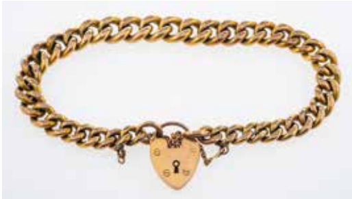
834 A gold curb link bracelet with heart clasp, 9ct, each link stamped *£350 - 450