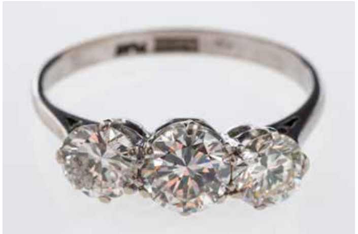
567 A three stone diamond ring, the principle brilliant cut diamond of approximately 1 carat, total diamond weight estimated at 2.00 carats, set in 18ct white gold and platinum, ring size Q *£1000 - 1500