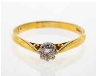
701 An 18ct gold solitaire diamond ring, brilliant cut stone of around 0.25 carat, ring size P