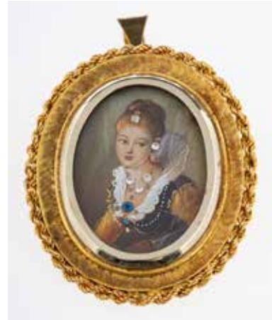
516 A gold portrait brooch , with painting of lady in 18th Century costume, studded with paste stones, locket 4.2 cm, marks for 18ct gold, gross weight, 12.3 grams