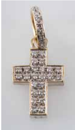
679 A diamond set crucifix pendant , total estimated diamond weight ca. 0.40ct, with Italian control marks for 18ct gold, total length (inc jump ring) ca. 2.8cm, total weight ca. 6.3gms, accompanied by pouch