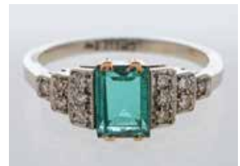
538 An Art Deco style green topaz and diamond ring set in 18ct white gold mount, ring size J *£150 - 250