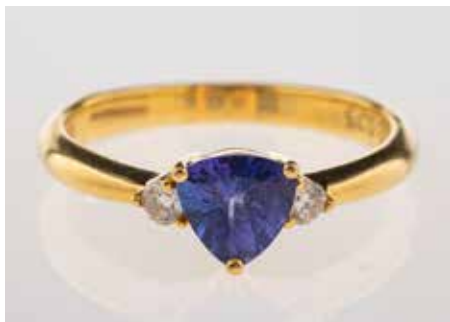
651 A tanzanite and diamond ring, the triangular cut tanzanite claw set between two brilliant cut diamonds, stamped 750 for 18ct with London hallmarks, ring size N *£300 - 500