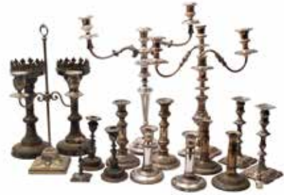
4 A mixed collection of silver plated candlesticks, including: a pair by Elkington and Co, Birmingham, with Romano-Greco cherubs, 17cm (6in), together with four pairs of early 19th century candlesticks and three candelabra, (13)