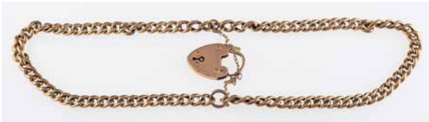
829 A double twist link chain bracelet with heart form clasp, 9ct gold