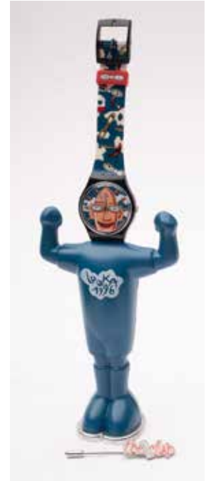
417 Swatch a blue Looka watch in original box. Swatch a C-Monsta on the Beach red watch with green swimming cap, original box.