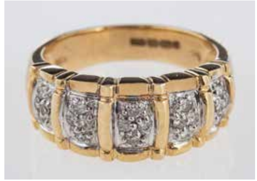
624 A gold diamond set dress ring, with four pave set panels, total diamond weight 0.25 carat, ring size P *£250 - 350