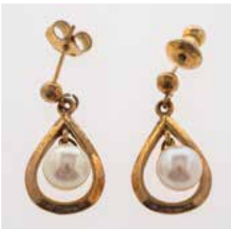
677 A gold pear form earrings with pearl drop, 9ct