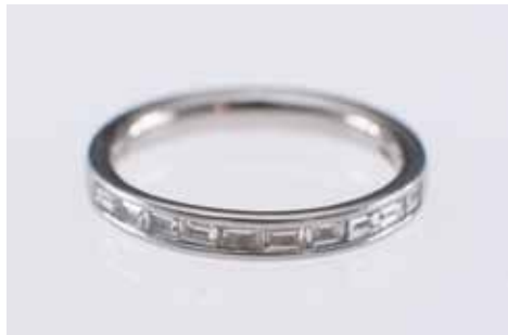
664 A platinum eternity ring channel set with baguette diamonds, ring size J