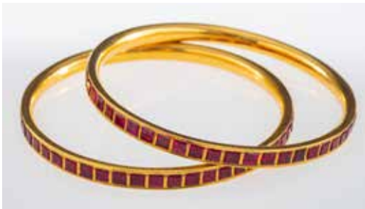
689 Two Indian high carat gold bangles set with square cut rubies, interior measurement, 6.2 cm, weight 37.9 grams *£500 - 800

Note: the stones are in a closed back setting, it is not possible to determine inclusions there is a slight variation in cut of the stones and a very slight variation in colour