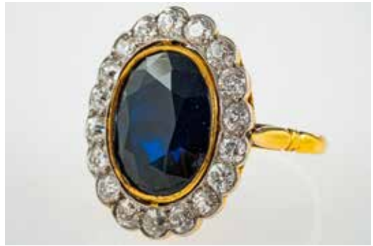
644 A dark blue sapphire and diamond ring, the oval faceted sapphire estimated at 7.4 carats, total diamond weight estimated at 1.44 carats, ring size L-M, set in unmarked gold