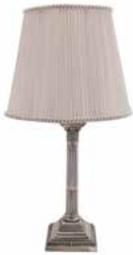
1 An electroplated Corinthian column table lamp, unmarked, 20th century, 38cm (15in) to top of fitting; with a shade