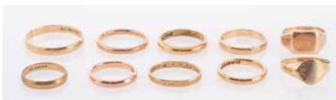
838 A group of 9ct gold wedding bands, hallmarked and one yellow metal band, gross weight 27.4 grams *£400 - 600