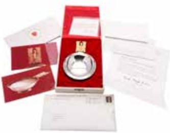
82 Aurum Designs Ltd, a silver parcel gilt St Pauls Cathedral limited edition commemorative bowl by Jocelyn Burton, London 1975, no.288 of 900, 239g (7.65 oz), 17.3cm (6 3/4in) long; with its certificate and box