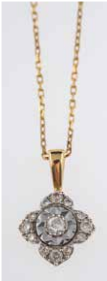
699 A flower head pendant set with small diamonds in white and yellow gold, on fine gold chain, both marked 18ct