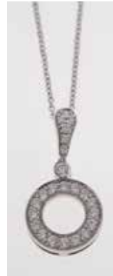
632 A white gold diamond set pendant with chain, 18ct, pendant size 2.2 cm *£400 - 600