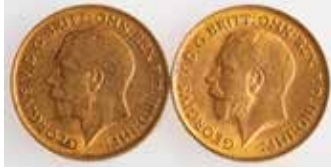
809 Two gold George V half sovereigns, 1911 and 1915, 8g gross