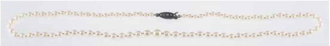
841 A string of Japanese cultured pearls by Kitamura, the single sting of pearls set to a silver clasp, pearl size graduating from 3.5 to 7.5mm, necklace length 48 cm, cased, C 1970