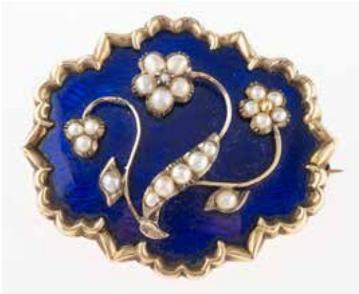
515 A late Victorian enamel, pearl and diamond brooch , circa 1890, the oval blue enamel panel with a scalloped and pointed border, with applied foliate detail set with pearls and a rose cut diamond, the reverse with plaited hair beneath a glazed panel, 4cm wide