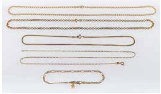
826 Five gold chains, all 9ct, gross weight 29 grams *£300 - 400