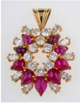
703 A ruby and diamond set pendant, garland form set with cabouchon rubies, marquise form and brilliant cut diamonds, in 18ct gold, diamond weight estimated at 3.65 carat, length 32cm *£500 - 800