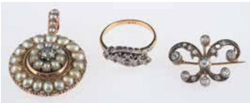
523 An Edwardian pearl and diamond locket , central rose cut diamond estimated at 0.30 carat, within a border of pearls, and a locket back with inscription, length 3.5 cm together with a diamond set brooch, both unmarked gold *£200 - 300