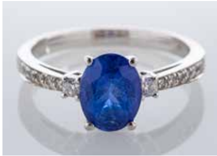
649 A tanzanite and diamond ring, the oval cut tanzanite claw set between brilliant cut diamond set shoulders, stamped 14K, ring size N *£300 - 500