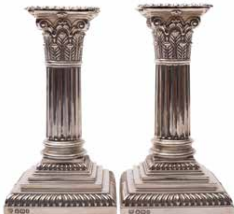
139 A pair of short Victorian Corinthian column candlesticks by Hawkesworth, Eyre & Co, Sheffield 1896, detachable scones, square loaded bases, 14cm (5 1/2in), 944g total weight *£150 - 250