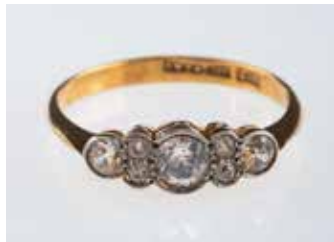
756 A vintage white sapphire ring in platinum and 18ct gold mount, the ring size O and a garnet set ring, 9ct