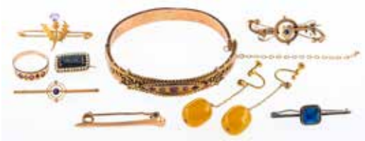
827 A group of antique jewellery, rose gold bracelet with paste stones, similar ring, with ruby and pearl, memorial brooch with seed pearls, Scottish brooch with amethyst thistle, three other gold brooches all 9-15ct, a silver butterfly wing brooch and a pair of Bakelite type drop earrings *£80 - 120