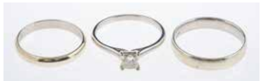
658 A princess cut diamond solitaire ring , diamond of 0.50 carat set in 18ct white gold, ring size P & two 9ct white gold bands, all boxed