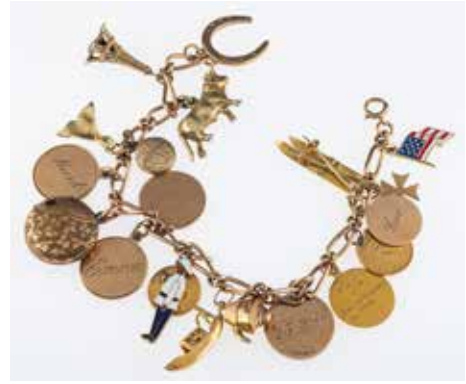
820 A gold bracelet with charms , including a pair of skis, Eiffel tower, gondola a Victorian locket and name plaques, the majority marked 9ct, gross weight 44 grams *£500 - 800