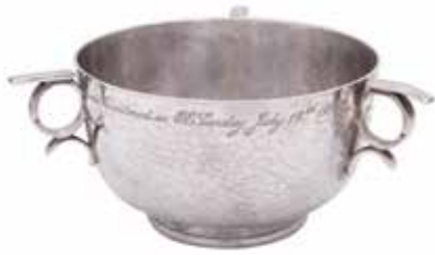
74 An Edwardian silver three handled christening bowl by James Dixon & Sons Ltd, Sheffield 1907, with a hammered finish, presentation inscribed, 13.5cm (5 1/4in) across handles, 298g (9.6 oz)