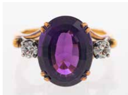
652 An 18ct gold, amethyst and diamond ring, the oval cut amethyst claw set between two brilliant cut diamonds, stamped 18ct, ring size K 1/2 *£300 - 500