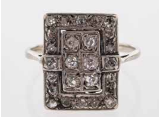
718 A diamond panel ring, the rectangular panel set with old cut diamonds, ring size P. *£400 - 500