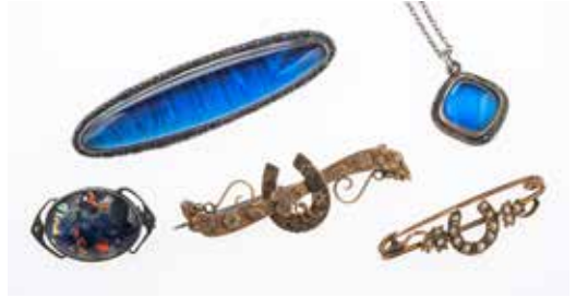
786 A group of jewellery , Victorian shoehorn brooch with seed pearls, another similar with clover, both 9ct, silver butterfly wing brooch and pendant and a foiled glass brooch *£50 - 80