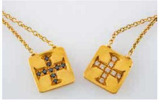
675 A two diamond pendants with Greek cruciform motifs, on a belcher-link chain, total estimated diamond weight ca. 0.35ct, stamped '750', length of pendants ca. 1.4cm, total length ca. 83cm, total weight ca. 17gms, accompanied by case