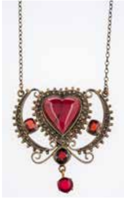
629 An early 20th Century Scandinavian filigree silver gilt pendant set with heart form and faceted amethysts, cased *£70 - 100