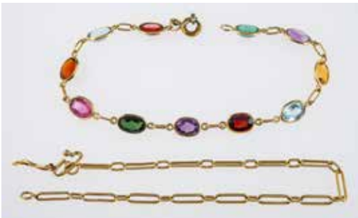
773 A multi gem set bracelet set with pink and blue topaz, amethyst and garnet, in unmarked gold, and an oblong link chain and a gold chain *£120 - 160