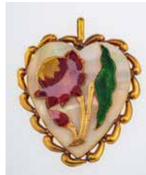
690 A gold heart form pendant with enamelled floral decoration on a mother of pearl ground, 5.7 cm *£100 - 150

Note: the stones are in a closed back setting, it is not possible to determine inclusions there is a slight variation in cut of the stones and a very slight variation in colour