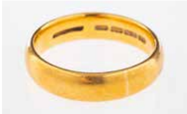
832 No Lot