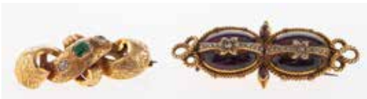
525 An emerald and diamond brooch , the scrolling panel with engraved foliate motif, set with a rectangular cut emerald and two old cut diamonds, 3.5cm wide; and a garnet and diamond brooch, 5cm wide *£200 - 400