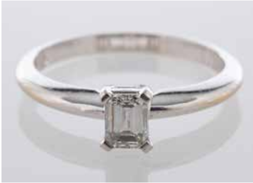
625 An 18ct gold, rectangular step-cut diamond ring, estimated diamond weight ca. 0.40ct, G-H colour, VS1-2 clarity, ring size N, total weight ca. 3.3 grams *£250 - 350