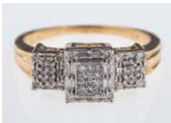
684 An Art Deco style diamond set ring pave set with small diamonds in a three square setting, size O-P