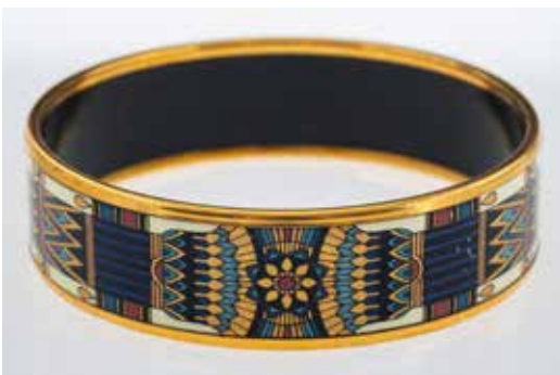
788 A Michaela Frey bangle with enamel decoration, internal measurement 6.3cm *£50 - 80