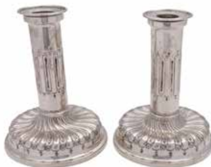
140 A pair of Victorian silver candlesticks by John Septimus Beresford, London 1886, in the Charles II style, with chased and engraved decoration, 13.5cm (5.5in.) high, 305g (10.75 oz) *£80 - 120