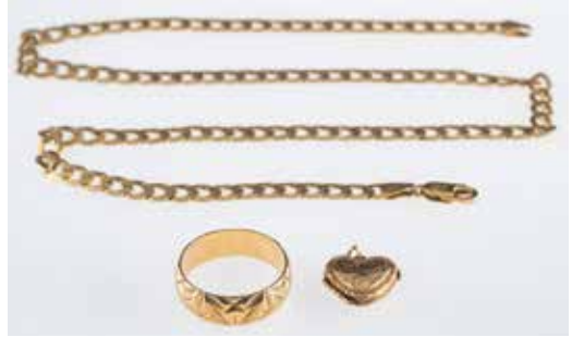
828 A group of gold jewellery, a wedding band with flower head and leaf design in relief ring size S, a flat link gold chain, and a heart locket *£250 - 350