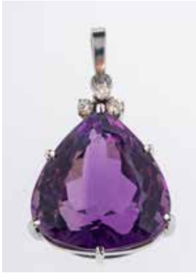
612 An amethyst & diamond pear form pendant. set in 18ct white gold, total diamond weight 0.15 carat, pendant length 3cm, gross weight 6.4grams