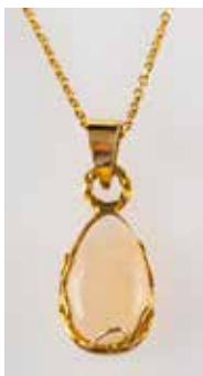
545 An opal pendant, the pear shaped cabochon opal in a scrolled setting, stamped 14k, on a belcher link chain, pendant 4cm long *£300 - 500