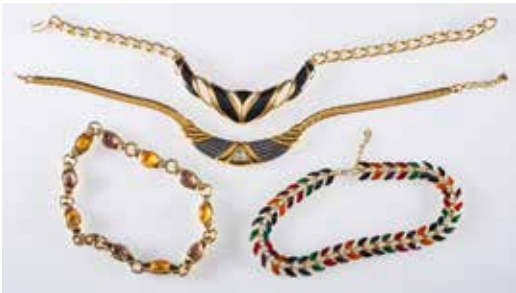
787 A group of 1980's costume jewellery including a Francesca Romano necklace with ametrine, citrine and quartz another with enamel leaves, two Lanvin necklaces and other items including silver brooch, silver white stone ring part illustrated