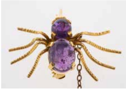
697 A Spider brooch set with cabochon amethyst stones, unmarked yellow metal