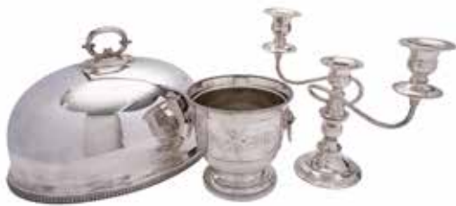
3 An electroplated meat dome by The Goldsmiths & Silversmiths Co. Ltd, 36cm (14in) long; a wine cooler and a three light candelabrum (3)