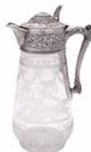
160 A Victorian silver mounted clear glass claret jug by William & George Sissons, Sheffield 1870, with a pierced trefoil thumb piece to the domed cover cast with a fruiting vine band, a leaf-capped angular handle and a fruiting vine collar, the tapered glass engraved with classical quadrigas, 26.5cm (10 1/4 in) high, loaded