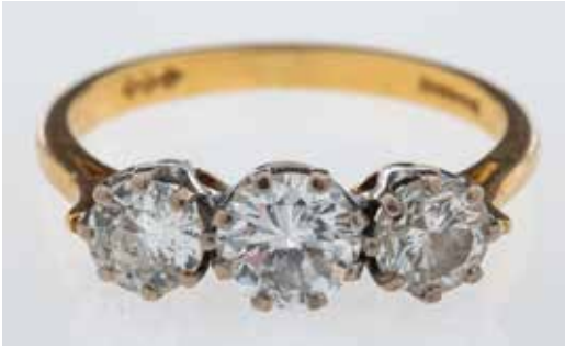
585 A three stone diamond ring , set with brilliant cut diamonds, the centre stone, 0.75 carat, total diamond weight estimated at 1.75 carats, set in 18ct white and yellow gold, ring size O-P *£1500 - 2500