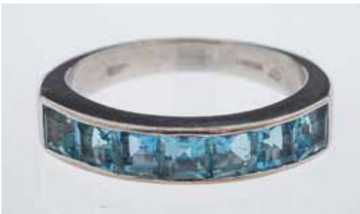
621 A modern aquamarine set ring , the square cut stones channel set in 18ct white gold, ring size Q-R