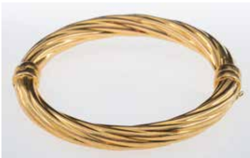
823 A hinged bangle with twist design , 9ct gold, weight 15.2 grams *£180 - 220