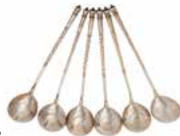
333 A set of six Russian silver gilt teaspoons by Ivan Alexeyev, Moscow 1890, 84 zolotniki, engraved with geometrics and flowers to the backs of the bowls, the stems part twisted, 12.8cm (5in) long, 91g (2.95 oz) *£80 - 120