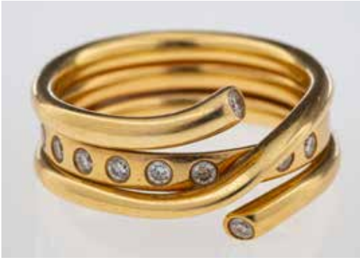
617 George Jensen a Magic ring combination of a gold band inset with brilliant cut diamonds and a crossover ring with diamond set terminals, both rings signed and numbered, 18ct gold, ring size N-O