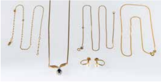
825 A sapphire and diamond set pendant necklace, a pair of pearl earrings with screw fastening, two fine 18ct gold chains, and another 9ct *£150 - 250