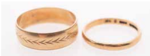
836 A gold wedding band with leaf form engraving, London 1987 3.8 grams, and a plain 14ct wedding band, 2.7 grams *£100 - 150