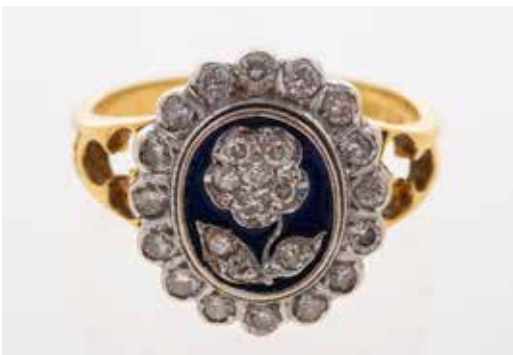
645 A vintage diamond and enamel set ring hallmarks for 18ct London 1975, ring size J