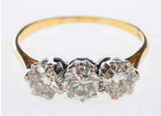
592 A three stone diamond ring set with brilliant cut diamonds in 18ct white and yellow gold, total diamond weight in excess of 1.00 carat *£300 - 500