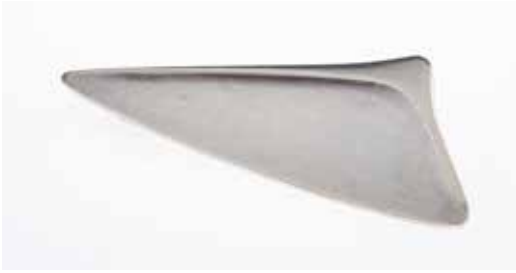
785 Georg Jensen Henning Koppel silver brooch of triangular abstract form, detailed Georg Jensen Sterling Denmark 327, length 6.1cm, weight 19.6 grams, with associated Georg Jensen box *£70 - 100