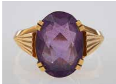
616 A dress ring set with an oval faceted amethyst, the shoulders cut with fan form grooves, marked 750 for 18ct gold, amethyst 10 x 14mm, weight 5.8 grams, ring size P *£200 - 300