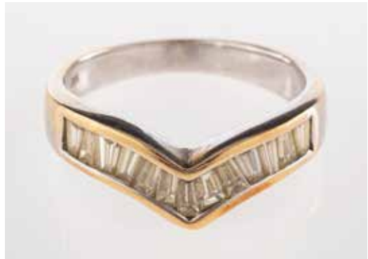
656 A diamond ring , set with baguette cut diamonds, approximately 0.65 carats total, stamped 14k, ring size L