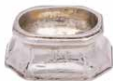
161 A George II silver trencher salt cellar, maker's mark IS, a pellet between, a cinquefoil above (not in Grimwade), canted-rectangular with ogee sides, 7.5cm (3 in) long, 62g (1.95 oz) *£70 - 100