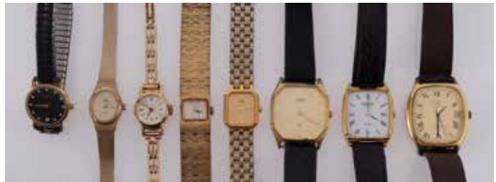
423 Five lady's gold-plated wristwatches including Raymond Weil, Timex, Lorus, Seiko and Tissot.