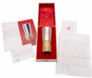
84 Aurum Designs Ltd, a silver parcel gilt York Minster limited edition commemorative goblet by Hector Miller, London 1972, no. 434 of 500, 469g (15.05 oz), 16.5cm (6 1/2in) high; with its certificate and box