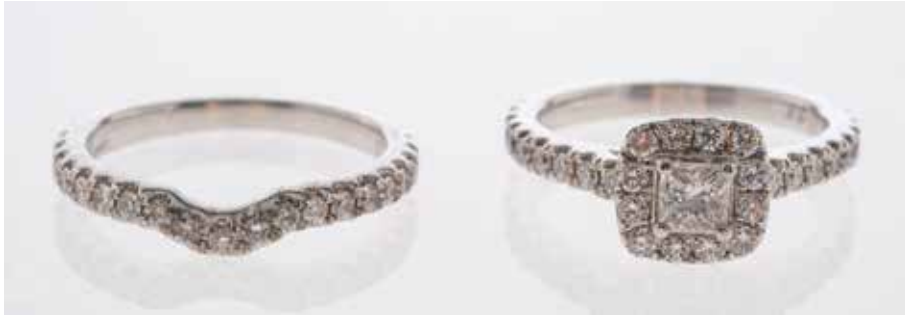
660 Neil Lane diamond set engagement ring and wedding band duo, halo set ring total diamond weight 0.81 carat and V form wedding band 0.33 carat, 14 ct gold ring size J-K