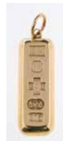
686 A 9ct gold ingot pendant , 8.5 grams