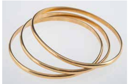
822 Three yellow metal D form bangles , testing as 9ct gold, internal measurement 6cm, weight 34.6 grams *£450 - 550