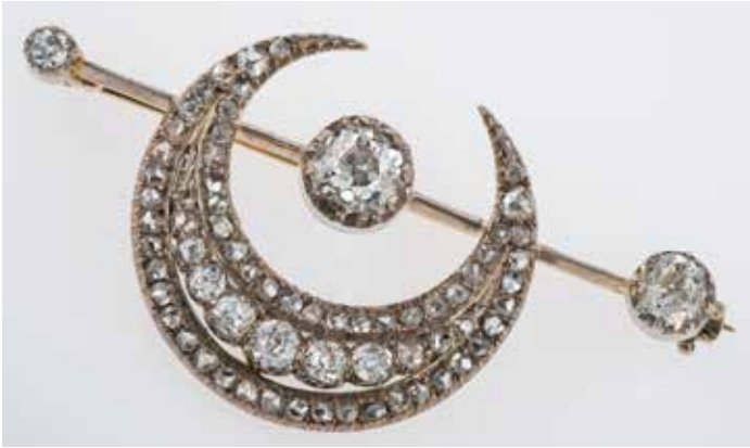
563 An Edwardian diamond set sun and moon brooch, set with old cut stones, the principle diamond estimated at 1.50 carat the second diamond of 0.75 carat, smaller diamonds central section old cuts within a border of rose cut diamonds, brooch length 5.5cm *£2000 - 4000