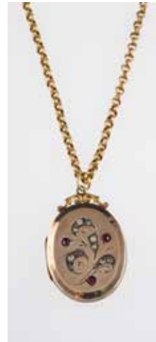
757 A Victorian gold belcher chain and a gold front and back locket set with paste stones, weight 8.3 grams