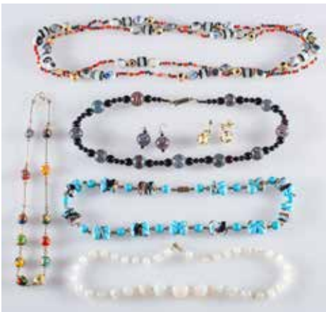
779 Six vintage Venetian glass necklaces and two pairs of earrings *£50 - 80