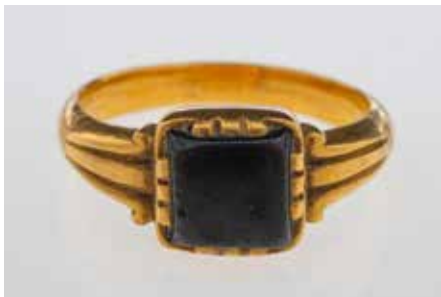
691 An antique gold signet ring set with black jasper, in hand crafted high carat gold setting, weight 5 grams, ring size J-K *£200 - 300