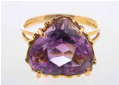
615 A vintage gold amethyst ring, handcrafted yellow metal mount, ring size S-T *£100 - 150