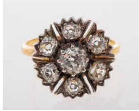
522 An antique dress ring , the flower head setting, with old cut diamonds set in silver with gold mount, centre stone approx 0.50 carat, total diamond weight estimated 1.70 carat *£400 - 600