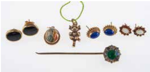
517 A rose gold bangle , two crosses, three pairs of hoop earrings, heart clasp other gem set stud earrings, all 9ct and a paste stick pin