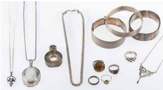
795 A group of silver jewellery, three silver bangles with engraved or engine turned decoration, pendant with large white labradorite stone, tigers eye ring, amethyst set pendant, heavy silver chain necklace and other items