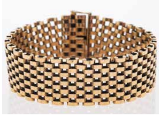
630 A 9ct gold bracelet, composed of polished brick links, with a concealed clasp, stamped 375 with Birmingham hallmarks, 41g *£700 - 1000