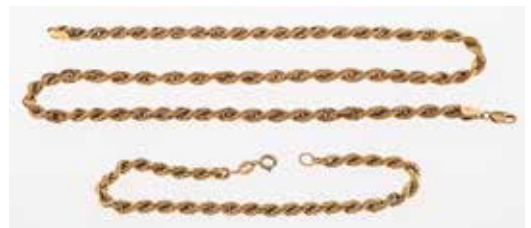
707 A 9ct gold ropetwist necklace, stamped 9k, 47cm long; and a 9ct gold ropetwist bracelet, stamped 375, 21cm long, 10g gross *£100 - 200