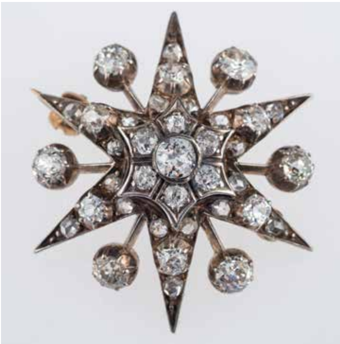
565 A Victorian diamond set star brooch, the six point star and rays set with old cut diamonds, set in gold and silver, central stone estimated at 0.33 carats, total diamond weight, including rose cuts around 2.00 carats, 3cm, gross weight 6.2 grams, box by Barnett 71 Burlington Arcade *£700 - 1000