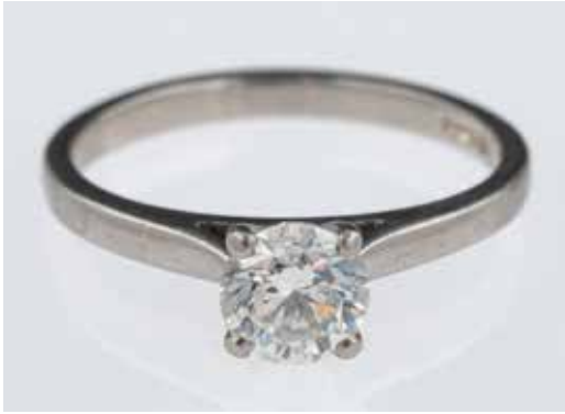
635 Solitaire diamond ring, brilliant-cut diamond single-stone ring , estimated diamond weight estimated at 0.70 carat, F-G colour, VVS2-VS1 clarity, claw set in platinum ring size L *£800 - 1200