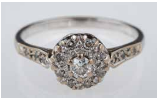
720 A diamond cluster ring, the central old brilliant cut diamond claw set within a surround of eight cut diamonds, with eight cut diamonds set to the shoulders, ring size S. *£300 - 400