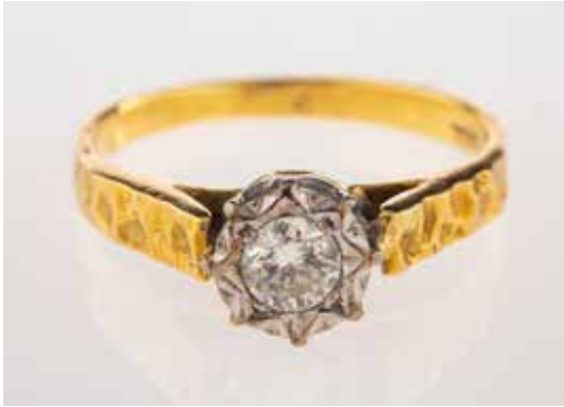
749 A diamond single stone ring, the brilliant cut diamond, estimated to weigh 0.25 carats, stamped 18ct, ring size J *£200 - 300