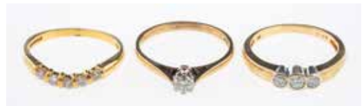
776 Three diamond set rings , an 18ct gold ring set with five diamonds, total diamond weight 0.25 carat, three stone ring and a solitaire both 9ct gold *£200 - 300