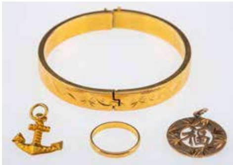
816 A small group of yellow metal items with Oriental marks, anchor and disk pendant, bracelet and a ring, various marks, untested *£200 - 300