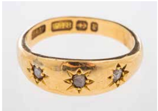
748 A Victorian gold ring with three small rose cut diamonds in gypsy setting, Birmingham 1898, ring size L, weight 4.8 grams *£150 - 250