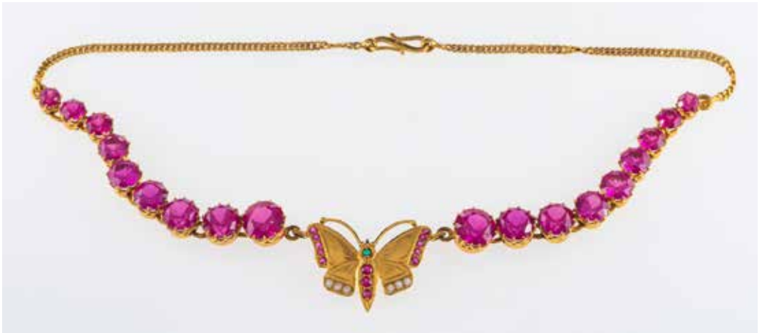
705 A 22ct Indian gold pendant necklace, the central gem set butterfly and eighteen large synthetic rubies, Makers stamp S.B C 1930-50 *£800 - 1200