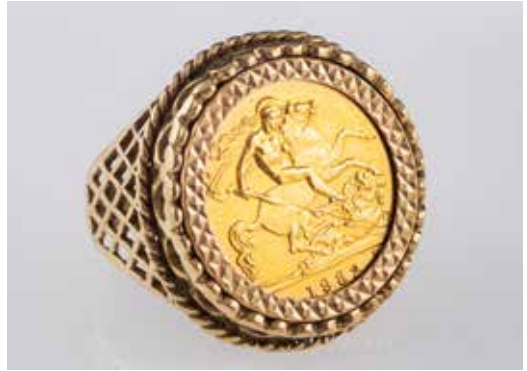
815 A 1/2 Sovereign ring, the 1982 1/2 Sovereign in a ring mount, stamped 375, ring size Q 1/2, 10g *£250 - 350