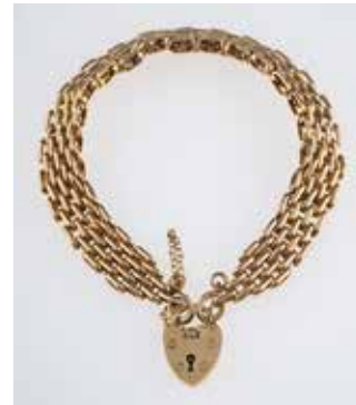
835 A gold gate link bracelet with heart clasp, 9ct gold length 18cm *£300 - 400