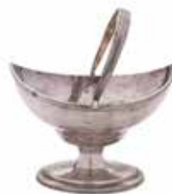
157 A George III silver navette sugar basket by Peter & Ann Bateman, London 1798, with a threaded swing handle, threaded rims, engraved with a meander band, the reserve engraved with a crest, on an oval pedestal, 13cm (5 in) long, 153g (4.9 oz)