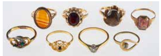
518 A garnet dress ring , an agate ring and six others