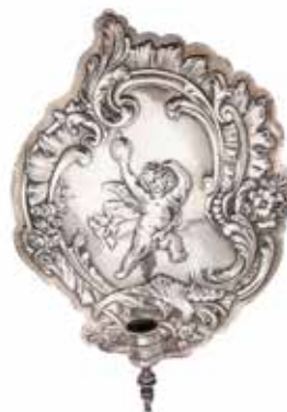
142 A late Victorian silver wall sconce, maker's mark FW (not traced) over-striking that of another, London 1890, the shaped oval backplate cast with a cherub holding aloft an orb within a scroll, rocaille and floral border, the cast scroll branch with a reel sconce, 30.5cm (12in) high, 631g (20.3 oz) *£250 - 350