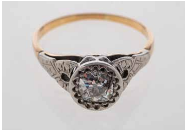
536 A diamond single stone ring, the old cut diamond, estimated to weigh 0.45 carats, ring size I *£300 - 400