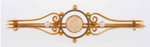
745 A gold and opal bar brooch C1900, central cabochon open in 15ct wirework setting with two seed pearls, length 5cm, fitted case *£80 - 120