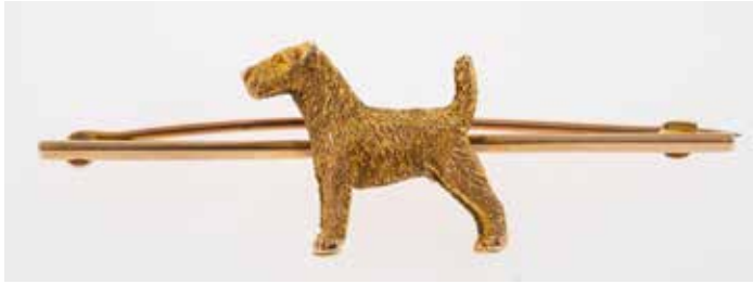
839 An early 20th Century gold, terrier bar brooch ,9ct, length 5cm, cased