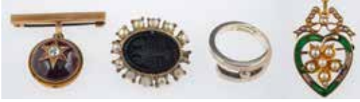
521 A Victorian garnet and diamond pendant , the circular cabochon garnet set with an old cut diamond in a star setting, suspended from a 9ct gold bar brooch fitting, a heart form enamel and pearl brooch, a silver ring and costume brooch *£200 - 300