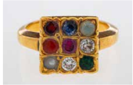
688 Nine Planet Indian Naba Graha ring set with nine gemstones representing the influence of the planets, in high carat gold mount, weight 6.2 grams, ring size I-J *£200 - 300