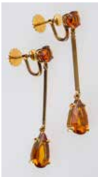
633 A pair of tangerine citrine set drop earrings, set in unmarked gold, screw fittings, length 4.4 cm *£80 - 120