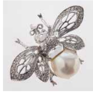
698 A pearl set "Bee" brooch in 14ct white gold with small diamonds, 3.3cm