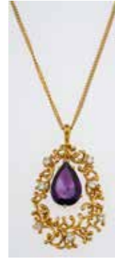
648 A gold pendant set with a pear form amethyst drop and small diamonds in naturalistic setting, 3.7 cm on 18ct gold chain *£400 - 600