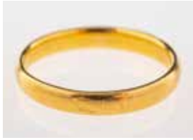
830 A 22ct gold wedding band, stamped 22 with full London hallmarks, ring size M, 3.3 grams *£100 - 150