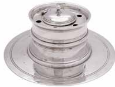
77 A late Victorian silver capstan inkwell by Edward Barnard & Sons Ltd, London 1896, with a ball finial to the hinged cover, five pen apertures, girdled and with a plain flange base, 15.5cm (6in) diameter, 322g (10.35 oz)