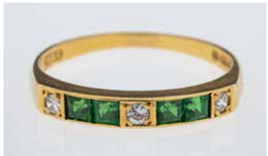
622 An emerald & diamond ring set with square cut emeralds and brilliant cut diamonds, in 18ct gold, ring size P