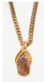
546 A pendant set with opal and small diamonds in unmarked yellow metal, opal 11 x 8 mm *£200 - 300