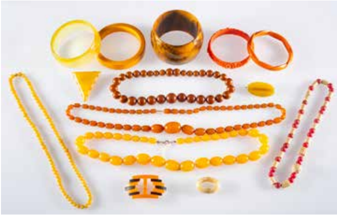
777 A group of early Bakelite, phenolic, and resin jewellery 1930's to 1950's including amber style necklaces *£80 - 120