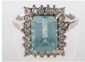
588 An aquamarine and diamond ring , the rectangular cut aquamarine claw set within a surround of brilliant cut diamonds, stamped 750 with London hallmarks, ring size L *£250 - 350