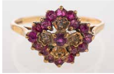
717 A 9ct gold, ruby and diamond cluster ring, set with circular cut rubies and eight cut diamonds, stamped 375 with Birmingham hallmarks, ring size N. *£80 - 120