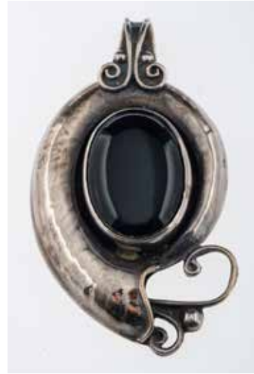
793 A large vintage silver and onyx pendant, with cabochon stone and stylized tendrils, C 1970 length 7.5cm