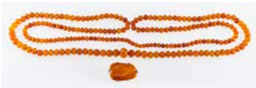
821 A 1920's amber flapper girl necklace , length 120 cm, and an amber brooch *£100 - 150