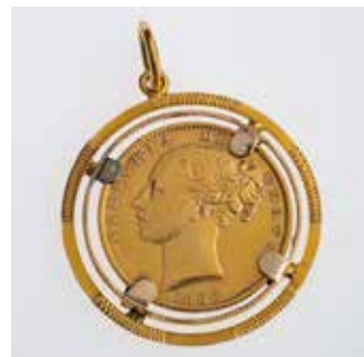
818A A Victorian gold sovereign coin, 1880 shield back in gold mount, gross weight 11 grams *£350 - 450