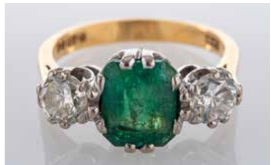
721 An 18ct gold, emerald-cut emerald and round, brilliant-cut diamond, three-stone ring, estimated emerald weight ca. 2.10cts, total estimated diamond weight ca. 0.80ct, G-H colour, VS1-2 clarity, length of ring head ca. 1.8cm, ring size J1/2, total weight ca. 3.9gms. *£800 - 1000