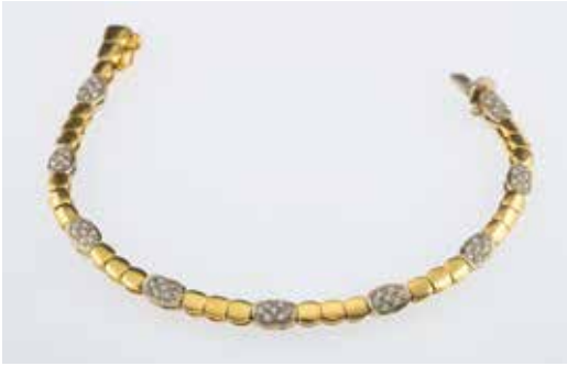
674 A bracelet of articulated links in 18ct yellow gold interspersed with diamond set plaques in white gold, concealed clasp with safety catch total diamond weight estimated at around 0.63 carat, bracelet length 19,5cm