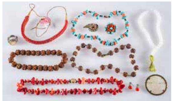
780 Tibetan carved beads with faceted chalcedony spacers, chalcedony beads and other items with coral and turquoise *£50 - 100