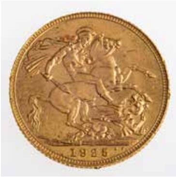
805 A George V gold sovereign coin, 1925.