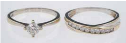
619 Canadian Ice diamond solitaire ring and a diamond set band ring (single stone ring diamond), 40 carat, both set in white gold, ring size N-O, boxed and with certificates