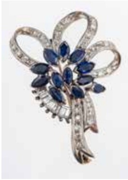
641 A vintage diamond and sapphire set flower and bow brooch, set with marquise form sapphires, brilliant and baguette cut diamonds in 18ct white gold, 4cm