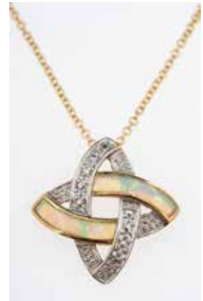
663 A gold and opal pendant marks for 14ct and a gold twist chain