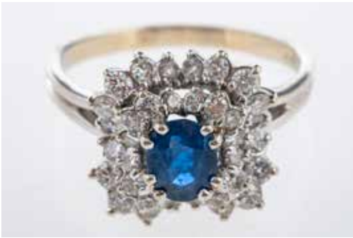
643 A sapphire and diamond cluster dress ring, central mid blue sapphire, 7 x 5 mm, within an informal border of small diamonds, in white gold mount, ring size V