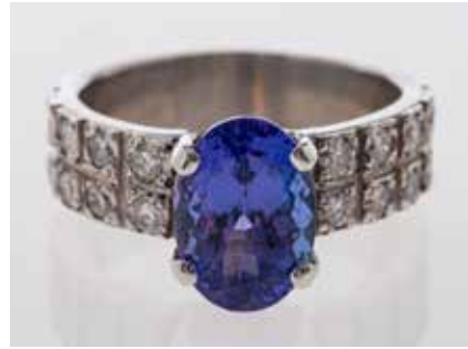
650 A tanzanite & diamond ring set with an oval faceted stone of around 2.5 carats, bordered by double rows of diamonds, in unmarked white metal assessed as platinum, ring size P *£500 - 700