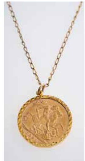
812 A Victorian gold sovereign, 1886 in a pendant mount and a 'coin' with non milled edge, yellow metal