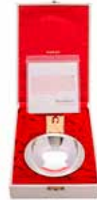
83 Aurum Designs Ltd, a silver parcel gilt St Pauls Cathedral limited edition commemorative bowl by Jocelyn Burton, London 1975, no.249 of 900, 231g (7.4 oz), 17.3cm (6 3/4in) long; with its certificate and box