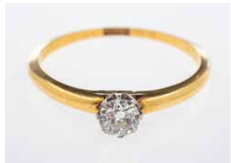
598 A gold ring set with a single brilliant cut diamond estimated at 0.40 carat, in gilt leather box *£200 - 300