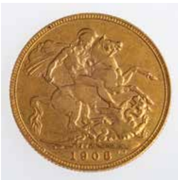
807 An Edward VII sovereign coin 1908.