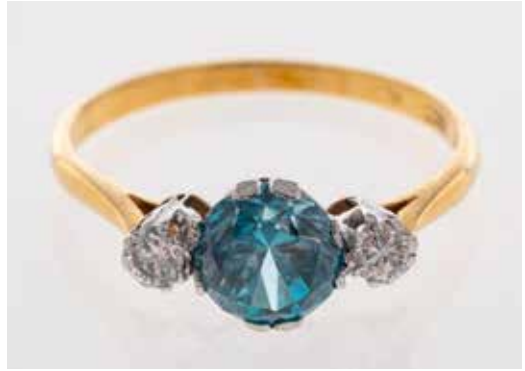
642 A Three stone ring set with natural blue zircon and two brilliant cut diamonds, total diamond weight estimated at 0.30 carats, set in 18ct gold and platinum, ring size Q