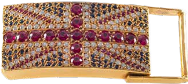
676 A Chrome Hearts Union Jack belt buckle, set with diamonds, rubies and sapphires, total estimated diamond weight ca. 1.30cts, stamped to verso 'Chrome Hearts 2000 22K', total length ca. 5.7cm, total weight ca. 78.8gms, accompanied by pouch