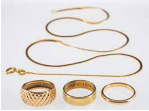
819 A group of gold jewellery , band ring with woven design, two wedding bands and a fine chain, all marked or testing as 14ct *£350 - 450