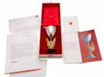
85 Aurum Designs Ltd, a silver parcel gilt St Pauls Cathedral limited edition commemorative goblet by Jocelyn Burton, London 1975, no. 146 of 600, 306g (9.85 oz), 16cm (6 1/4in) high; with its certificate and box