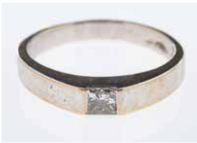
682 A contemporary white gold ring set with princess cut diamond of 0.25 carat, 18ct, ring size L