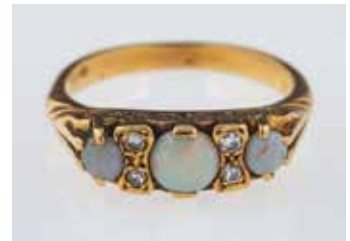
596 An opal and diamond ring, the three circular cabochon opals with eight cut diamonds in between, ring size O 1/2 *£350 - 450