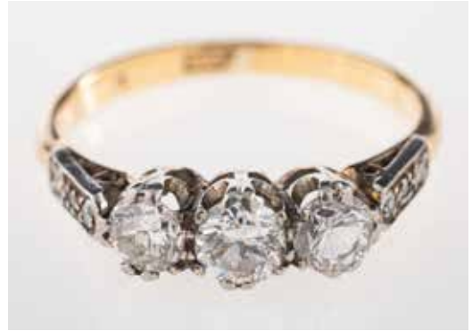
750 A diamond three stone ring, the three brilliant cut diamonds, approximately 0.55 carats total, with eight cut diamonds set to the shoulders, ring size L *£250 - 350