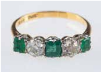
587 An emerald and diamond ring , the three square cut emeralds with old brilliant cut diamonds, approximately 0.50 carats total, stamped 18ct Plat, ring size O *£500 - 700