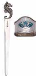
79 An Arts & Crafts silver and enamel napkin ring by Liberty & Co., Birmingham 1914, embossed and enamelled with a foliate design, 5.3cm (2 1/8in) long; and a letter opener by Guild of Handicraft (Hart Gold & Silversmiths), London 1994 with a seahorse terminal, 18cm (7in) long (2)