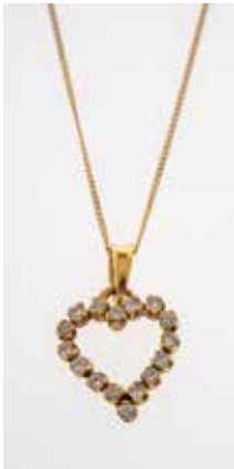
661 A heart form pendant set with diamonds, on fine chain 18ct gold