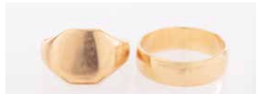
837 A gold D form wedding band, size P and a signet ring, both 18ct, gross weight 10.7 grams *£300 - 500