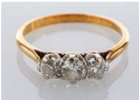
597 A diamond three stone ring, set with three brilliant cut diamonds, approximately 0.50 carats total, ring size N *£160 - 180