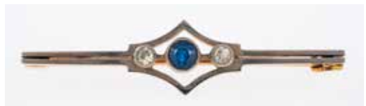
746 An Edwardian bar brooch with small sapphire and diamonds, in unmarked gold, a stick pin with owl motif, cased and another with Japanese Shakudo scene with stork *£50 - 80