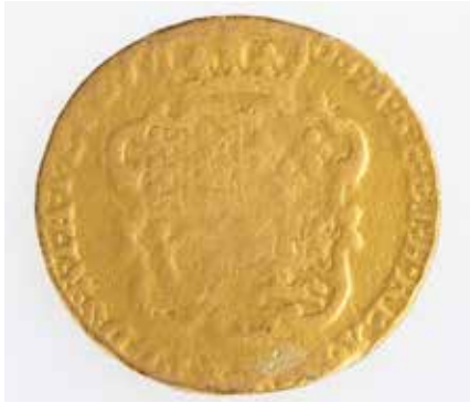
814 A George III sovereign coin, weight 7.8 grams *£200 - 300