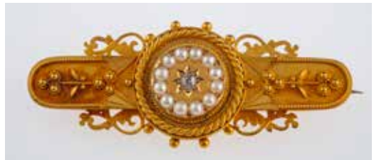
524 A Victorian gold brooch set with small diamond and seed pearls, in bloomed gold, unmarked, 4cm, cased *£100 - 150