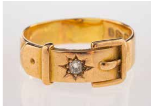
754 A gold and diamond buckle ring, the buckle ring set with an old cut diamond, stamped 18 with Chester hallmarks, ring size Q 1/2, 5.5g *£150 - 250