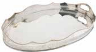
5 An early 20th century silver plated on copper oval gallery tray, not marked, 61cm wide