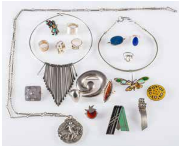
778 A group of mainly mid-century jewellery including a torque necklace and textured silver ring, stamped SW, London 1971 *£50 - 80