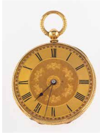
399 An 18ct gold lady's open face pocket watch with a cylinder escapement, the case stamped inside K18 with the cuvee unmarked, diameter 34mm, total weight ca. 28.42gms. *£650 - 750