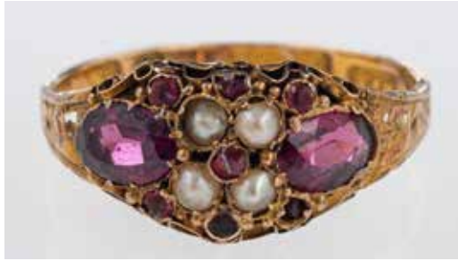
755 A Victorian ring set with amethyst and seed pearls, engraved band, marks for 15ct, Birm, 1879, ring size O