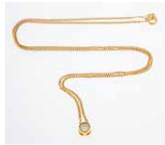
683 A contemporary diamond set pendant , the brilliant cut stone of 0.25 carats in rubover 18ct gold setting, chain length 44 cm