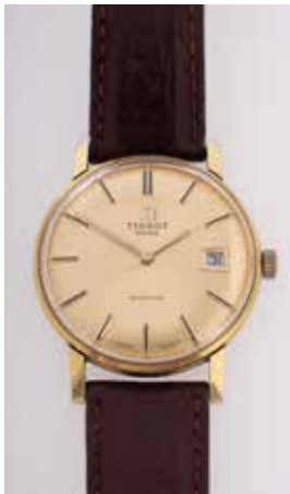
422 Tissot Seastar a gentleman's quartz wristwatch with a gold-plated case and leather strap, diameter 33mm.