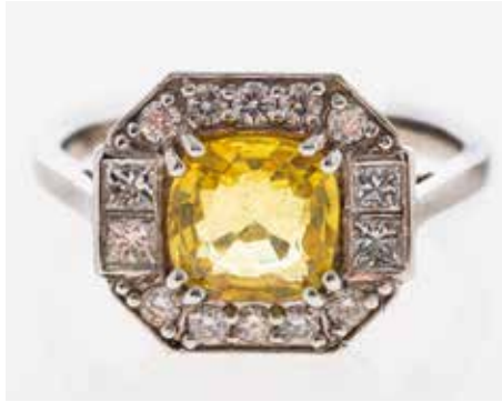
542 A plaque ring of octagonal form set with a yellow sapphire within a border of brilliant cut diamonds, 18ct white gold mount, ring size M *£800 - 1200