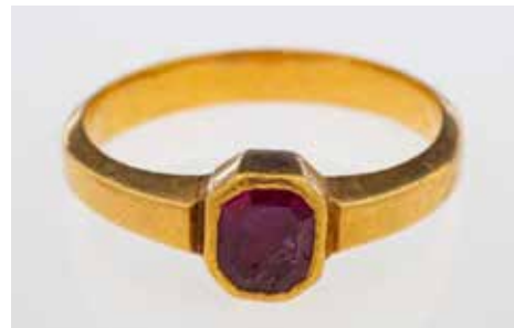
692 A ruby single stone ring in high carat gold, rub-over setting with closed back, weight 3.8 grams ring size J-K *£150 - 250