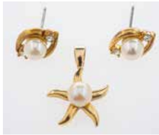
662 A starfish gold pendant set with a single pearl and a pair of pearl earrings, in Cornwall pearl pouch