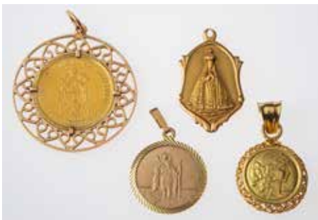
818 A gold medal depicting Pope John XXII, Principality of Liechtenstein 22ct in 14ct gold mount, two other pendants 18ct, and a 9ct St Christopher (4) *£250 - 350