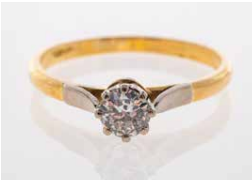
747 A solitaire diamond ring, the brilliant cut stone estimated at 0.30 carat, set in 18ct gold, ring size M *£300 - 500