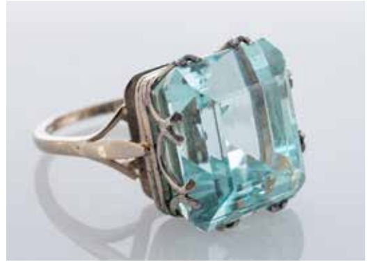
636 A single stone aquamarine ring , the octagonal step cut stone claw set in a plain white metal mount gallery setting, length of ring head ca. 1.8cm, ring size O *£1200 - 1800