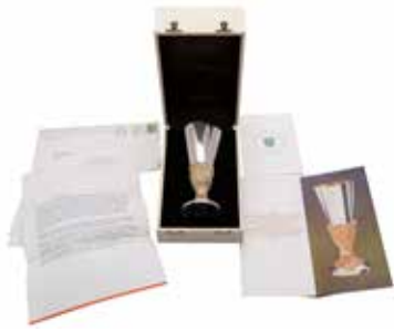
80 Aurum Designs Ltd, a silver parcel gilt Chichester Cathedral limited edition commemorative goblet by Desmond Clen-Murphy, London 1975, no. 119 of 600, 315g (10.15 oz), 16.5cm (6 1/2in) high; with its certificate and box