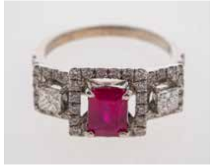
704 A 1940's style ruby and diamond ring with central step cut ruby and square cut diamonds, all within a boarder of square brilliant cut stones, 18ct white gold, ring size N *£300 - 500