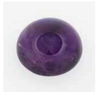
760 A Collection of loose stones, aquamarine, amethyst, largest stone approximately 22 carats, others citrine, blue topaz, chrome tourmaline and tiger's eye and four oval opal doublets