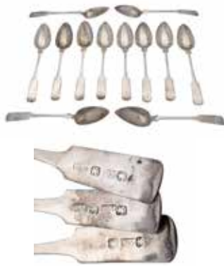
166 A set of twelve Scottish provincial silver Oar pattern teaspoons by Charles Murray, Perth circa 1816-36, engraved with a script C, 14cm (5.5in) long, 183g (5.85 oz)