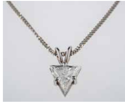
638 A trilliant cut diamond pendant , set in 18ct white gold, on fine chain, estimated 1.00 carat, clarity I1 colour E With AnchorCert certificate *£1000 - 1500