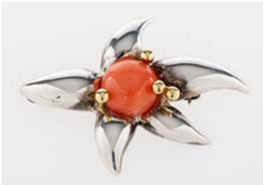
631 A coral brooch by Tiffany & Co., circa 1993, the circular cabochon coral with gold coloured bead detail with silver coloured radiating points, signed Tiffany & Co., stamped 925 750, 4cm wide *£200 - 300