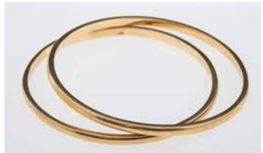
824 Two plain bangles , marks for 9ct gold, internal measurement 6cm, weight 27.9 grams *£300 - 500