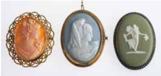
771 A shell cameo brooch in filigree gold mount, 9ct, a Limoge porcelain brooch and a Wedgwood Jasper ware brooch, largest 4cm *£80 - 120