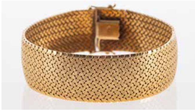
614 A fine vintage Norwegian gold bracelet of woven flat links with satin finish and bright borders, concealed clasp with safety catch, marks for 14ct and H Gams-Haugosen Bergen, length 19cm, boxed *£1000 - 1500