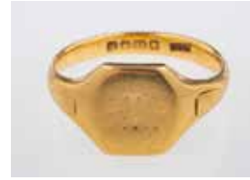
831 A gold ring signet ring, hallmarked 18ct, Birmingham 1936, weight 7.1 grams, in leather ring box *£200 - 300