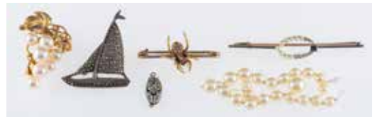
774 An Edwardian bar brooch set with sapphire and seed pearls, a gold brooch in the form of a fruiting vine, set with cultured pearls, length 3.7 cm, marks for 9ct, a yellow metal pearl set spider brooch and a silver example of a sailing boat, together with some loose pearls with clasp *£120 - 160