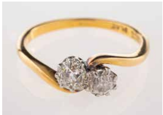
591 A two stone diamond ring , claw set with two old mine diamonds, in an 18ct and platinum mount, ring size O *£300 - 500