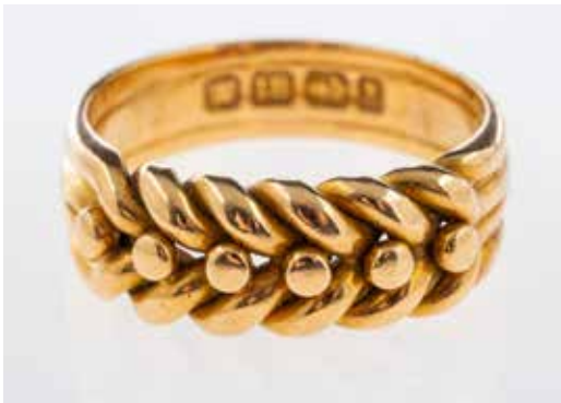
753 An antique gold keeper ring, 18ct pale rose gold, hallmarks for Sheffield 1911, weight 5.8 grams, ring size L *£150 - 250