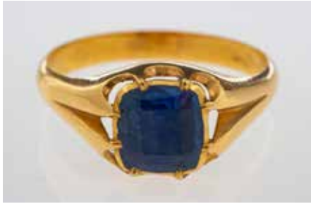
687 A fine gold ring set with a faceted sapphire of good colour, closed back claw setting, unmarked, weight 4.2 grams, ring size O-P *£300 - 500