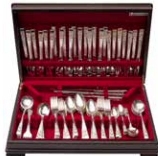
6 A silver plated canteen of Community flatware, place setting for twelve, in a stained oak and walnut box