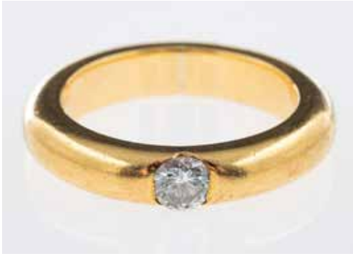
623 A heavy gold band ring single stone diamond ring inset with a diamond of 0.25 carats, 18ct gold *£300 - 500