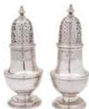
159 A pair of George II silver casters by Charles Alchorne, London 1737, vase shape with bell finials to the panelled scroll and dot pierced domed covers, the vase shaped bases with a scroll chased upper band, on spreading bases, one cover lined, 15cm (6 in) high, 411g (13.2 oz) *£300 - 500