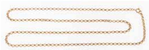
706 A 9ct gold chain, composed of belcher links, 63cm long, stamped 375, 10.8g *£150 - 250