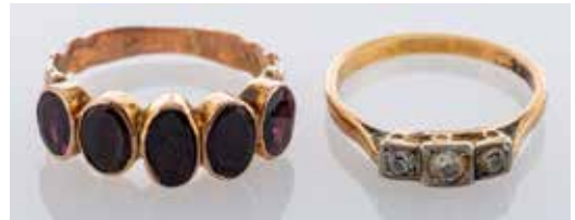
772 A three stone diamond ring , claw and millegrain set with three brilliant cut diamonds; and a 19th Century five stone garnet ring , collet and closed set with oval shaped flat cut garnets. Ring size M and O *£100 - 150