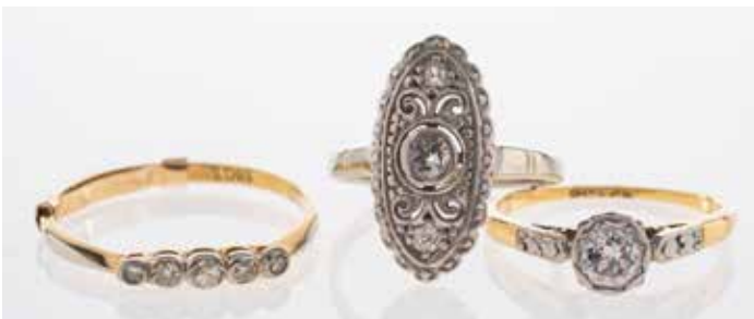
537 Three diamond rings, to include;- a diamond single stone ring, the old brilliant cut diamond, estimated to weigh 0.30 carats, stamped 18ct, ring size K; a five stone diamond ring, ring size P; and a diamond panel ring, the navette shaped panel set with old cut diamonds, ring size K *£500 - 700