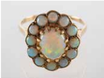
594 An opal ring, the central oval cabochon opal claw set within a surround of circular cabochon opals, stamped 9ct, ring size N 1/2 *£350 - 450