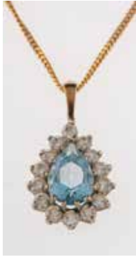
647 An aquamarine and diamond pendant, the pear cut aquamarine claw set within a surround of brilliant cut diamonds, on a curb link chain, stamped 9kt, pendant 2cm long *£200 - 300