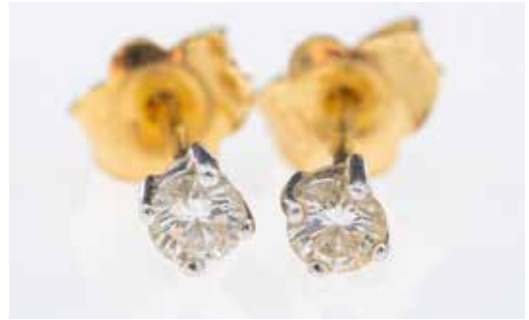
680 A pair of diamond solitaire earrings , brilliant cut diamonds, total 0.20 carats, gold posts, boxed *£150 - 250