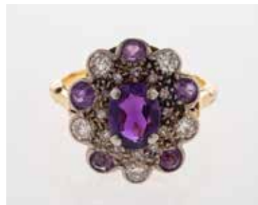
702 An 18ct gold, Amethyst & diamond cluster ring