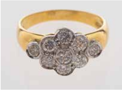
716 A dress ring set with diamonds in 18ct white and yellow gold, hallmarks for 1991, ring size Q. *£600 - 800