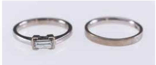
654 A white gold ring set with a baguette form diamond, in 18ct, hallmark for Edinburgh 2005 and a matching wedding band, ring size I-J