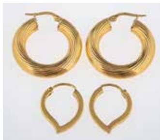
685 A pair of gold hoop earrings with ribbed design and another pair tear form, both marked 750 for 18ct gold, weight 6.2 grams