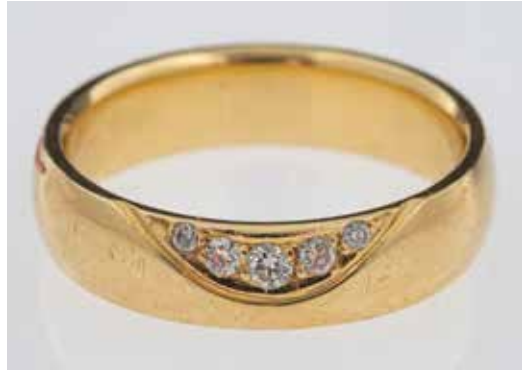
618 Nuran Denmark , a contemporary gold band ring with wave design inset with diamonds, 14 ct gold, ring size N