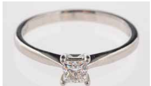
640 A platinum and diamond ring , the square cut diamond, estimated to weigh 0.25 carats, in a four claw setting, stamped 950 with full London hallmarks for 2013, ring size P 1/2 *£400 - 600