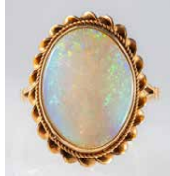
543 An opal dress ring in gold mount with rope twist edge, 9ct, ring size K-L, 3.3 grams *£100 - 150