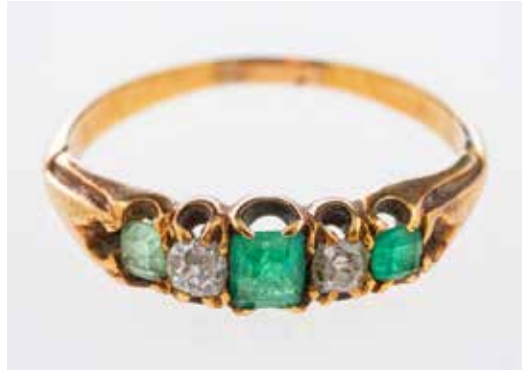
744 An Edwardian emerald and diamond ring set with two old cut diamonds, each 0.10 carat and three emeralds, unmarked gold, ring size L-M, in shield form antique box *£70 - 100