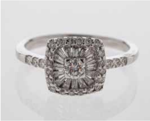
653 A diamond cluster ring with unusual setting of central diamond and baguette cut diamonds in sunburst effect, diamond set shoulders, set in 18ct white gold, ring size P-Q