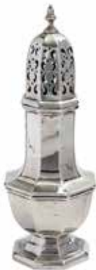
78 A silver sugar caster by Elkington & Co., Birmingham 1912, of octagonal vase shape, 16.5cm (6 1/2in) high, 90g (2.85 oz)