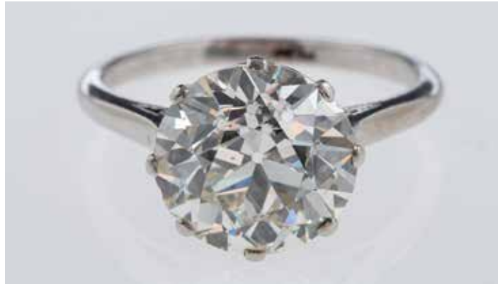
564 A solitaire diamond ring, the transitional cut stone of around 3.12 carat in a platinum crown with heart forms, ring size J *£7000 - 10000