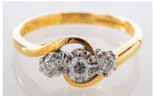
719 An 18ct gold, round, brilliant-cut diamond, three-stone, cross-over ring, total diamond weight stamped 0.33ct, H-I colour VS2-SI1 clarity, length of ring head ca. 1.2cm, ring size O, total weight ca. 4.3grams. *£120 - 160