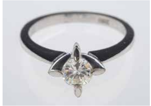
626 A contemporary diamond solitaire engagement ring, the brilliant cut diamond of 0.50 carat, set in white gold, ring size L-M *£400 - 600