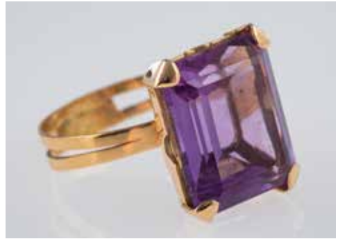
613 A vintage cocktail ring set with a large amethyst in hand crafted gold mount, unmarked believed to be 14ct, amethyst 15 x 12 x 7 mm, ring size O *£100 - 150