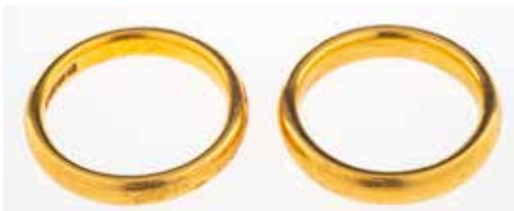
627 Two 22ct gold wedding D form bands London 1896 and Birmingham 1861, L-M and M sizes, 12.7 grams *£500 - 800