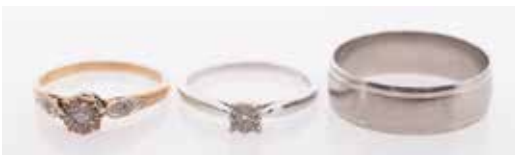
657 Three rings to include;- a modern palladium band ring, 4.9 grams, a 9ct white gold cluster ring, and an illusion set 9ct gold cluster ring with diamond points set in leaf form shoulders