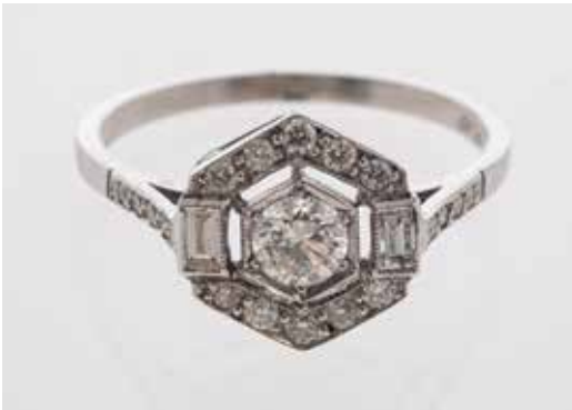
655 An Edwardian style diamond ring , set with a centre stone estimated at 0.30 carats, baguette and brilliant cuts, very small possibly French control marks, ring size P