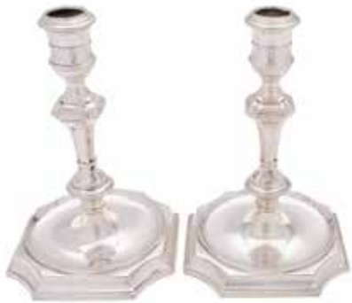
76 A pair of Scottish cast silver candlesticks, maker's mark RIX (not traced), Edinburgh 2004, with reel capitals, the square dished bases with incurved angles, 15cm (6in) high, 662g (21.3 oz)