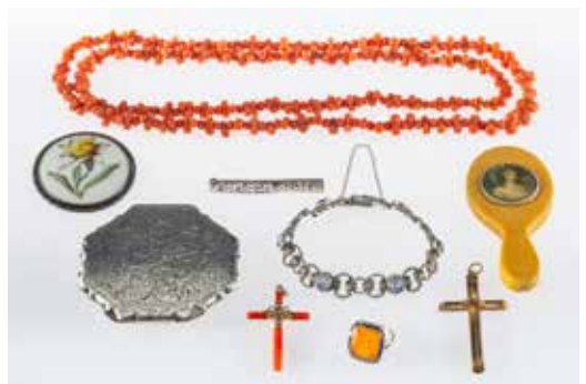
789 A coral bead necklace , coral cross, another in gilt metal, silver ring and white metal compact in a wooden jewellery box