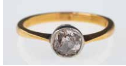
770 A single stone ring set with an old cut diamond estimated at 0.45 carat, collet setting in platinum with yellow gold band, ring size F *£300 - 400