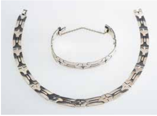
792 A mid 20th Century modernist design necklace and bracelet, hand crafted articulated links, concealed box clasp, Mexico 1960-1970, 925 silver marks, necklace 42 cm, bracelet 19cm, weight 40 grams