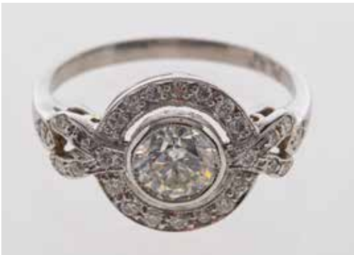
590 A platinum ring set with a central diamond estimated at 0.70 carat, diamond set halo and shoulders, ring size M-N *£700 - 1000