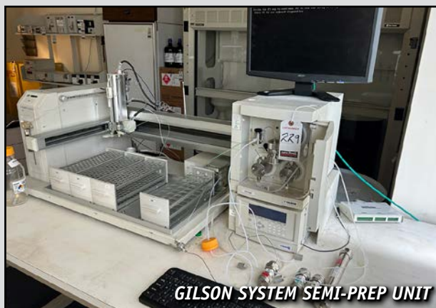
GILSON SYSTEM SEMI-PREP UNIT