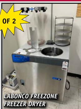
LABONCO FREEZONE FREEZER DRYER