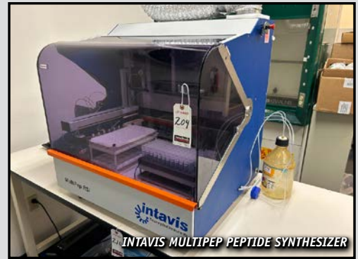
INTAVIS MULTIPREP PEPTIDE SYNTHESIZER