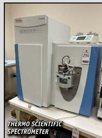
THERMO SCIENTIFIC SPECTROMETER