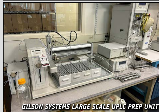
GILSON SYSTEMS LARGE SCALE UPLC PREP UNIT