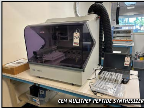
CEM MULTIPREP PEPTIDE SYNTHESIZER