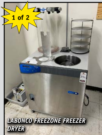
LABONCO FREEZONE FREEZER DRYER