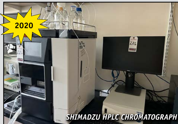
SHIMADZU HPLC CHROMATOGRAPH