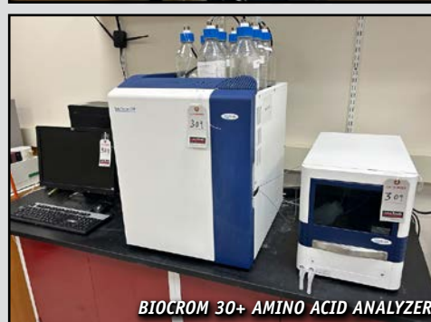
BIOCROM 30+ AMINO ACID ANALYZER