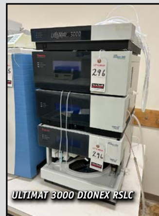
ULTIMAT 3000 DIONEX RSLC