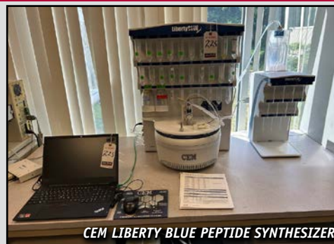
CEM LIBERTY BLUE PEPTIDE SYNTHESIZER