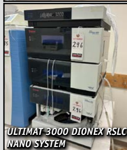
ULTIMAT 3000 DIONEX RSLC NANO SYSTEM