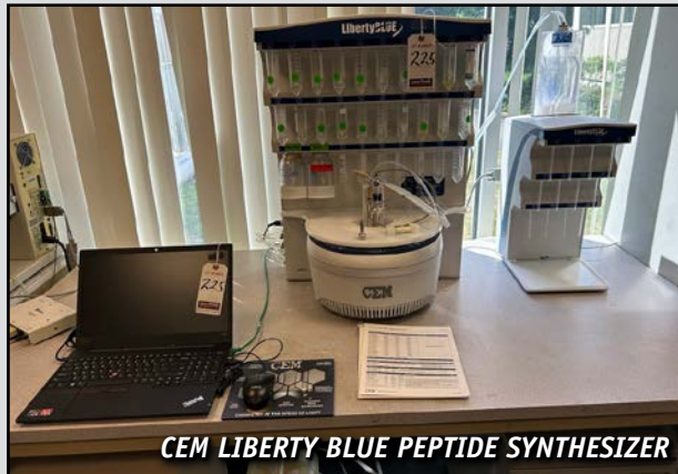
CEM LIBERTY BLUE PEPTIDE SYNTHESIZER

INSPECTIONS: THURSDAY, OCTOBER 9 TH , 10:00 A.M. TO 4:00 P.M. & MORNING OF SALE – 8:30 A.M. TO 11:00 A.M.