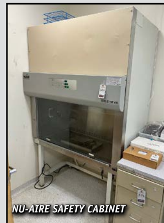
NU-AIRE SAFETY CABINET