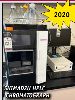
SHIMADZU HPLC CHROMATOGRAPH