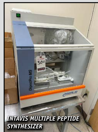
INTAVIS MULTIPLE PEPTIDE SYNTHESIZER