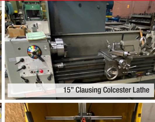
15" Clausing Colcester Lathe