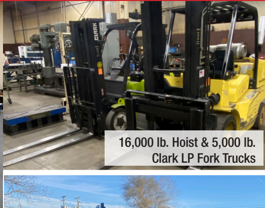
16,000 lb. Hoist & 5,000 lb. Clark LP Fork Trucks