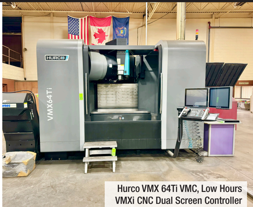
Hurco VMX 64Ti VMC, Low Hours VMXi CNC Dual Screen Controller