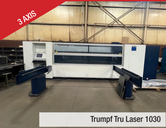
Trumf Tru Laser 1030

BUYERS PREMIUM • 18% WEBCAST • TIMED SALE