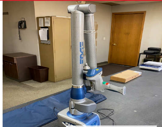
Faro "Edge" Portable CMM