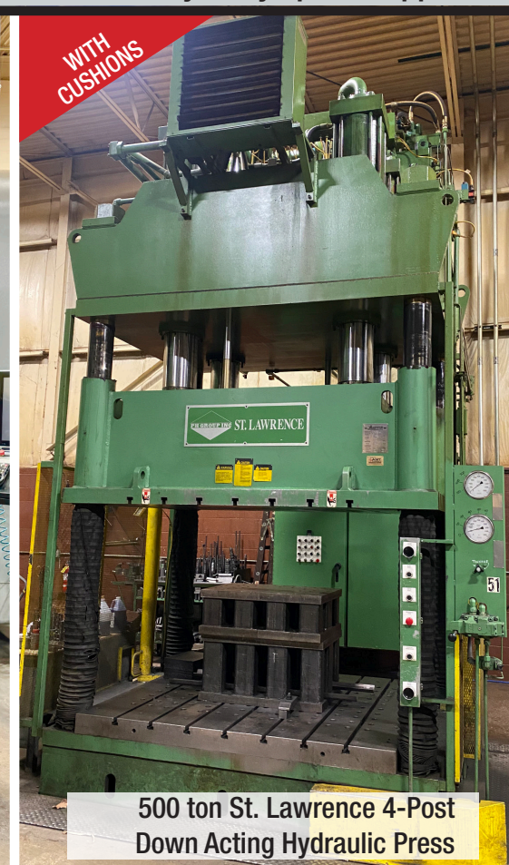
500 ton St. Lawrence 4-Post Down Acting Hydraulic Press

Hydraulic Presses up to 1,000 tons • CNC Machining Centers • Press Brakes • CNC Lasers Rolling Stock • Tool Room • Saws • Air Compressors • Punch Press • Lathes • Welding Equipment Dump Hoppers • Heavy Racking • CMM • Faro Arm • Stake • Trucks