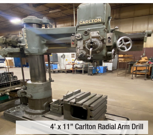
4' x 11" Carlton Radial Arm Drill