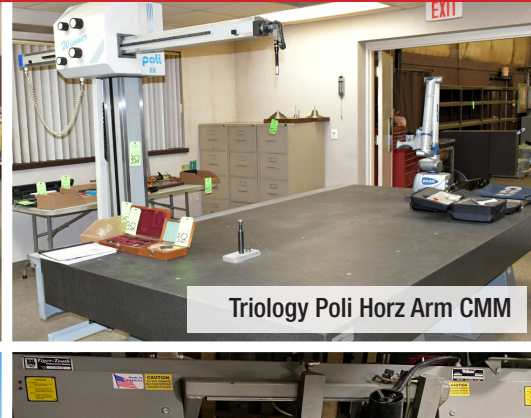
Triology Poli Horz Arm CMM