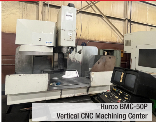
Hurco BMC-50P Vertical CNC Machining Center