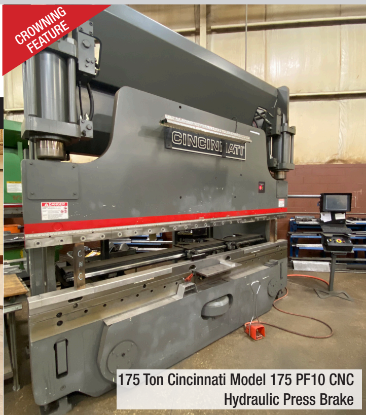
175 Ton Cincinnati Model 175 PF10 CNC Hydraulic Press Brake