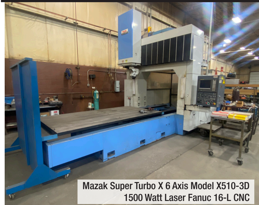
Mazak Super Turbo X 6 Axis Model X510-3D 1500 Watt Laser Fanuc 16-L CNC

Inspection Dates • January 30, 31, February 1, 2 • 9:00 am to 4:00 pm EST Daily