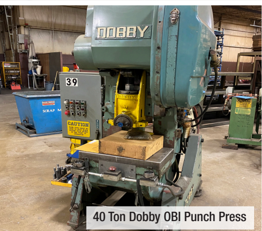
40 Ton Dobby OBI Punch Press