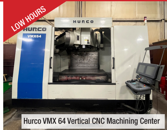
Hurco VMX 64 Vertical CNC Machining Center