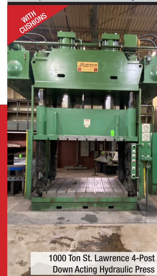
1000 Ton St. Lawrence 4-Post Down Acting Hydraulic Press

Inspection Dates: January 30, 31, February 1, 2 • 9:00 am to 4:00 pm EST each day or by special appt.