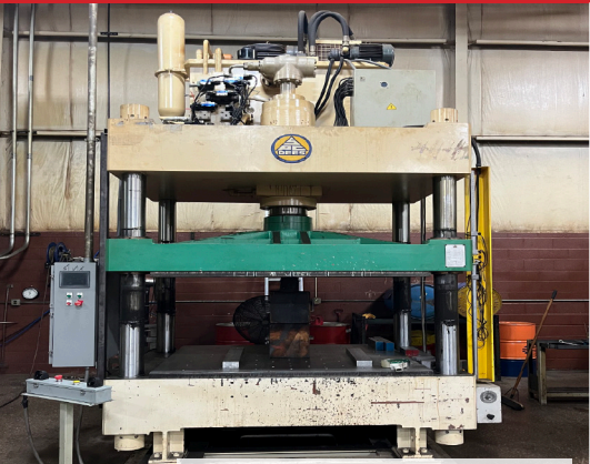
150 Ton Dees Hyd. 4 Post Press