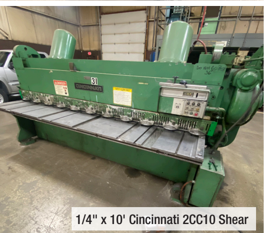
1/4" x 10' Cincinnati 2CC10 Shear