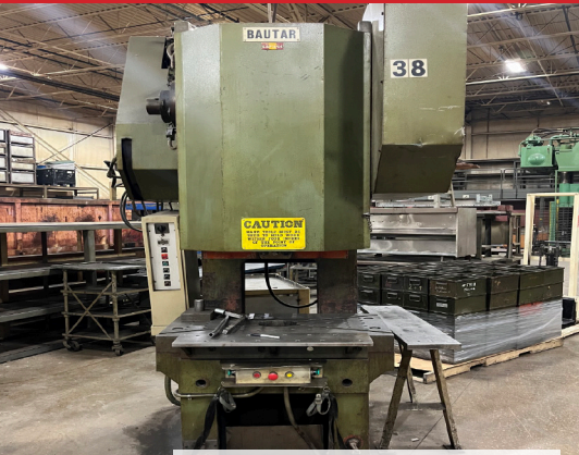
100 Ton Bautar Gap Fram Press