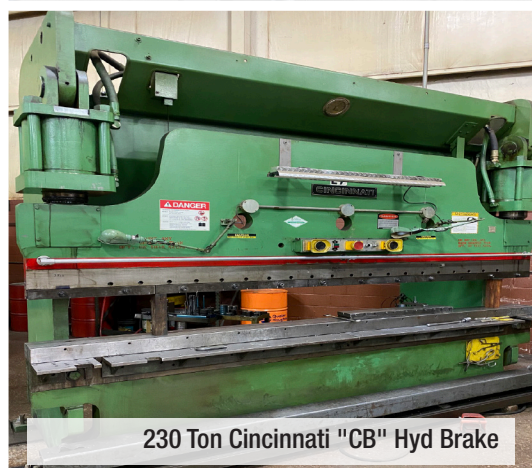
230 Ton Cincinnati "CB" Hyd Brake