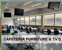
CAFETERIA FURNITURE & TV'S