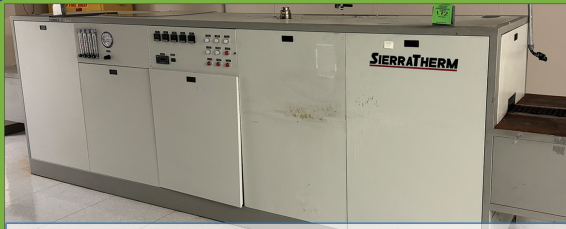
(2) SIERRA THERM BELT FURNACE