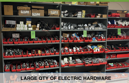
LARGE QTY OF ELECTRIC HARDWARE