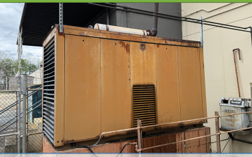
KOHLER FAST RESPONSE GENERATOR

VIEW COMPLETE CATALOG AT CHARLESTONAUCTIONS.COM