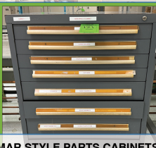
VIDMAR STYLE PARTS CABINETS