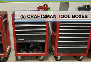
(5) CRAFTSMAN TOOL BOXES