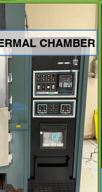
(2) BLUE M THERMAL CHAMBER