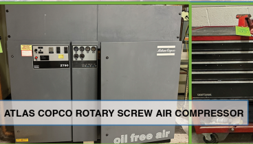
ATLAS COPCO ROTARY SCREW AIR COMPRESSOR