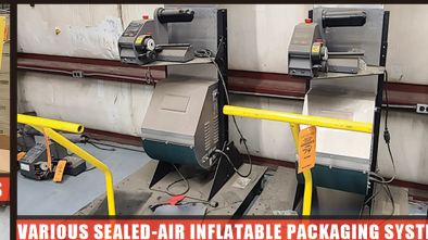
VARIOUS SEALED-AIR INFLATABLE PACKAGING SYSTEM