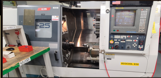
MORI SEIKI SL-2535 HORIZONTAL MACHINING CENTER

VIEW COMPLETE CATALOG CHARLESTONAUCTIONS.COM