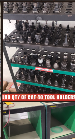
LRG QTY OF CAT 40 TOOL HOLDERS