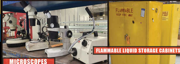
FLAMMABLE LIQUID STORAGE CABINETS