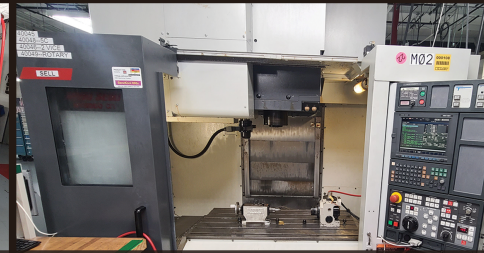
MORI SEIKI NV500 1A VERTICAL MACHINING CENTER