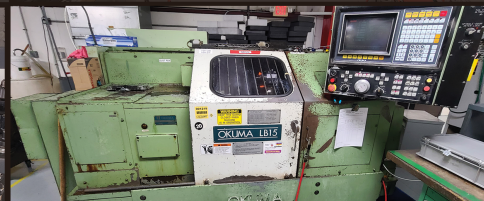
OKUMA LB-15 HORIZONTAL MACHINING CENTER