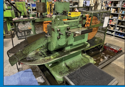
Waterbury Farrel #40 Mid Frame