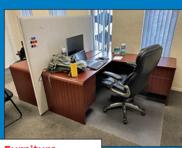
Clean Office Furniture