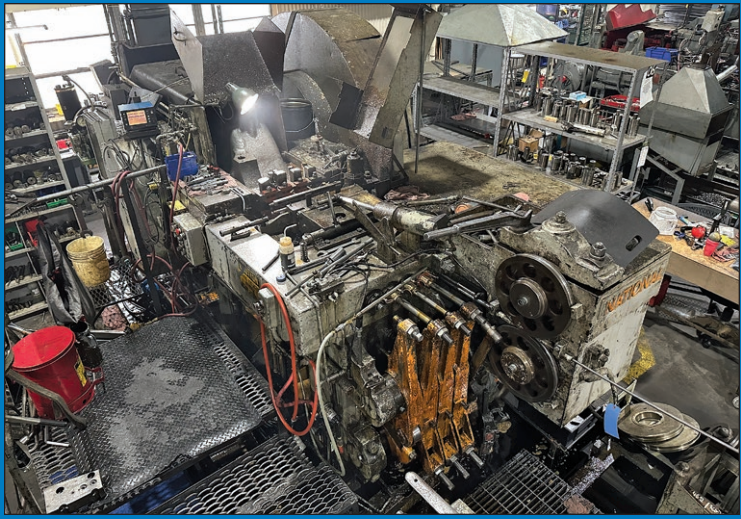
National Four-Die Boltmaker