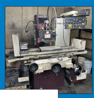
Toolroom Machinery - Lathes and Grinders