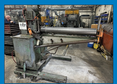
(4) FE and RMG Wire Uncoilers