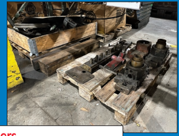
Parts for National 1000 and Other Headers