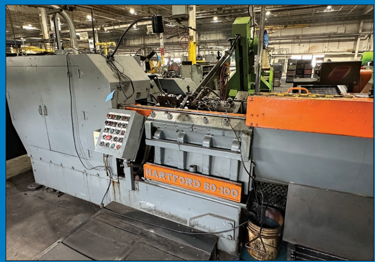
1" Hartford Model 60-100 High Speed Thread Rolling Machine