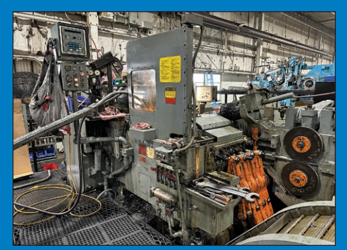
x 5" National S3 Boltmakers