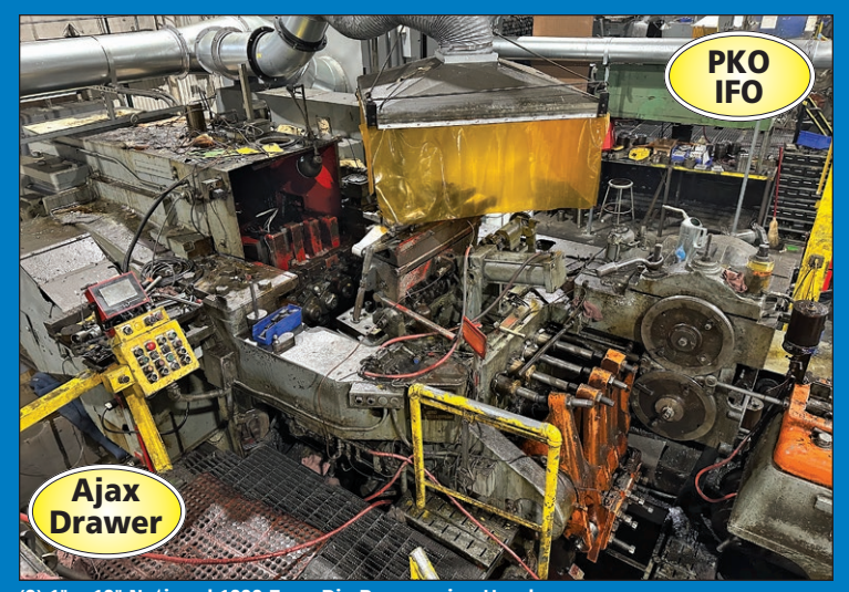
x 10" National 1000 Four-Die Progressive Headers