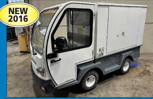
Taylor Dunn ET-030-48 Heavy Duty Electric Cart