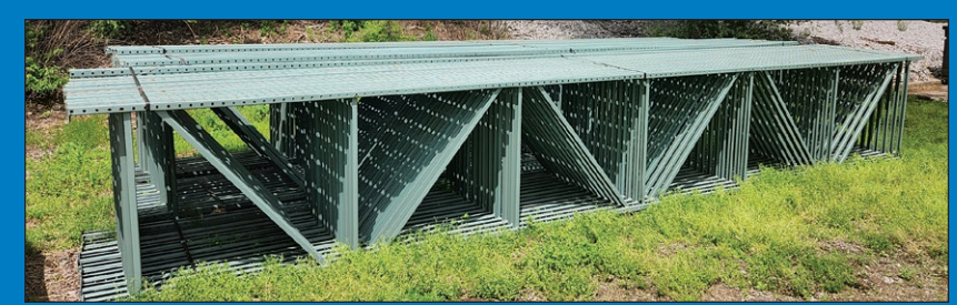
(50) 24' x 42" Interlake Pallet Rack Uprights