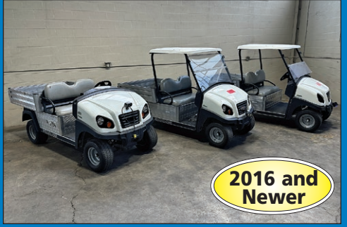
(5) Club Car Carryall 550 Electric Golf Carts