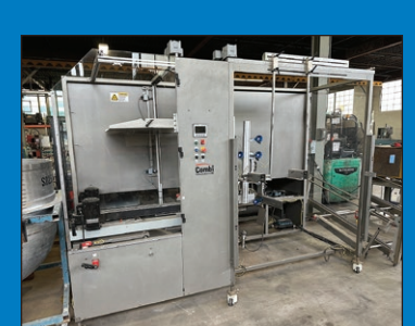
Combi 2EZXL Box Taper