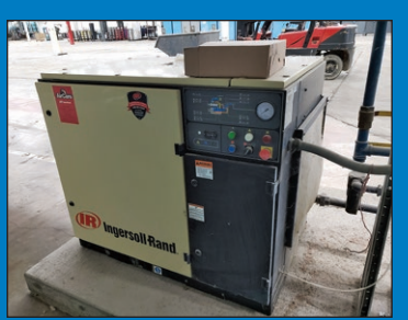
(10) Air Compressors 2HP to 50HP