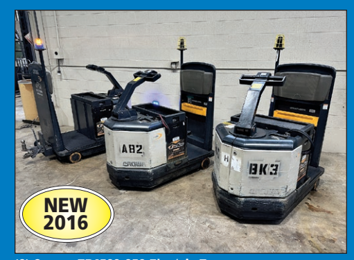
(6) Crown TR4500-250 Electric Tuggers