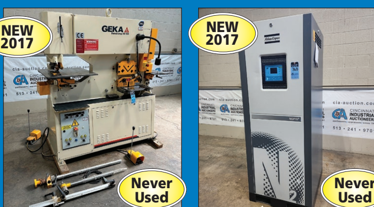
Geka Bendicrop 60SD Ironworker