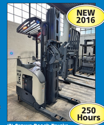
(2) Crown Reach Trucks - (1) w/ 250 Hours