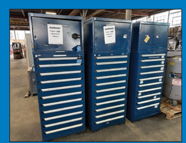
Very Clean Shop Equipment