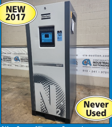
Atlas Copco Nitrogen Generators