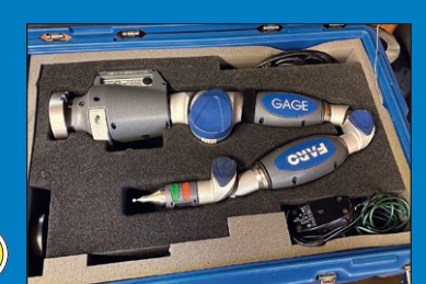
(2) Faro Arm CMM's w/ Accessories