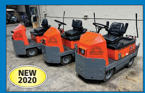
(3) 15 Ton Taylor Dunn Electric Tow Tractors