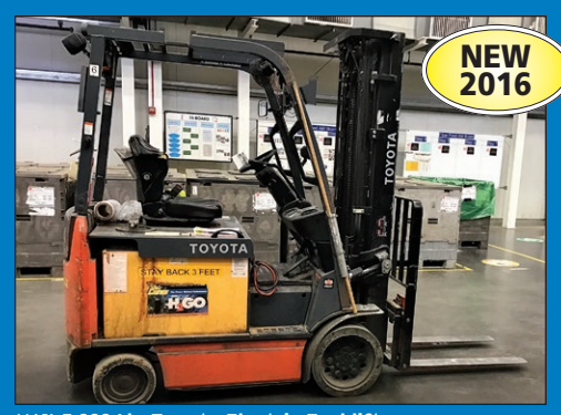
**(4) 5,000 Lb. Toyota Electric Forklifts