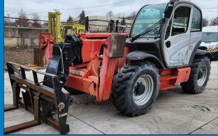
10,000 Lb. Manitou MT-1044 4X4 Telehandler, 1,500 Hours