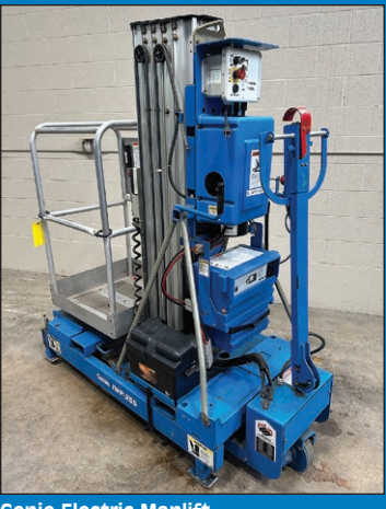
Genie Electric Manlift