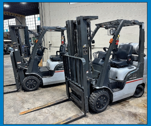
5,000 Lb. Nissan LPG Forklifts