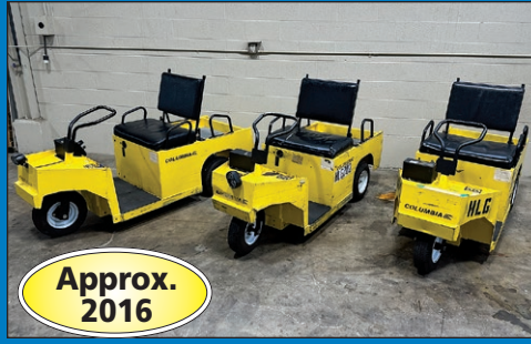
(5) Columbia Expediter 3-Wheel Electric Personnel Carts