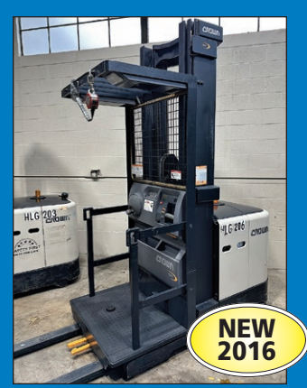
(6) Crown Stand-Up Order Pickers