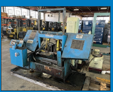
Toolroom and Maintenance Machinery