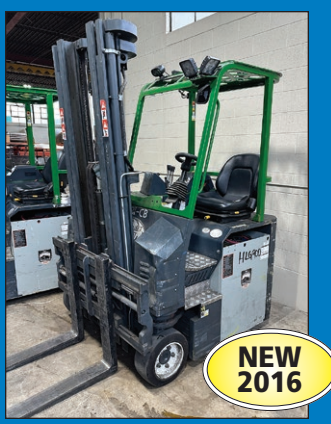
Combilift Multi-Directional Forklifts