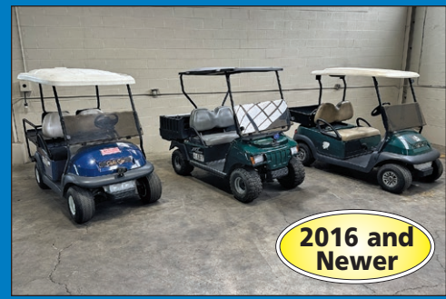
(8) Club Car Electric Golf Carts