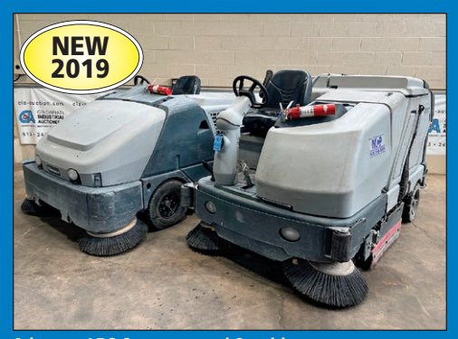
Advance LPG Sweeper and Scrubber