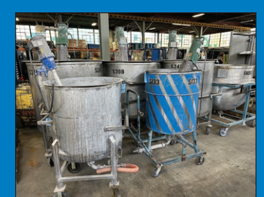
Stainless Steel Tanks w. Agitators