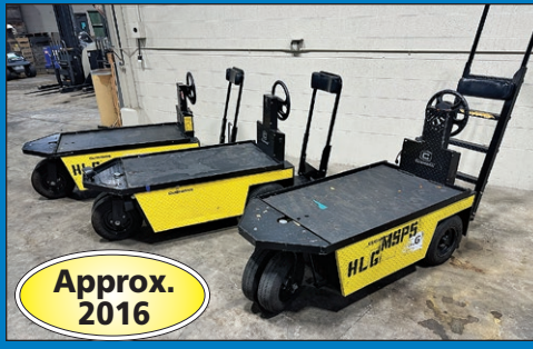
(5) Stand-Up Electric Personnel Carts