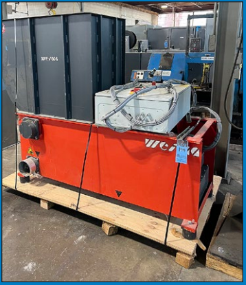
30-HP Weima WL4 Wood Shredder