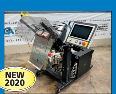
APS Autobag 600 Baggers