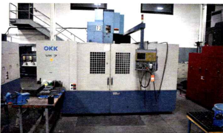
(2) (Circa 2001) OKK CNC Vertical Machining Centers, Model VM-7