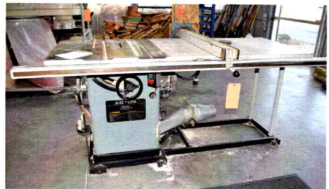
Delta 10" Table Saw, Model Unisaw 34-802, 12.4 Amp Single Phase, Tilting Arbor, Extended Table, Biesemeyer Fence