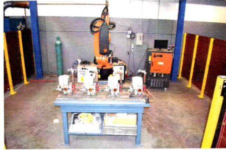
(2021) Kuka 6 Axis Robotic Welding Cell To Wit: Kuka Industrial Robotic Arm, Model KR16R1610-2/SEL