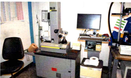
(2011) Zoller Tool Setter, Model Smile 600