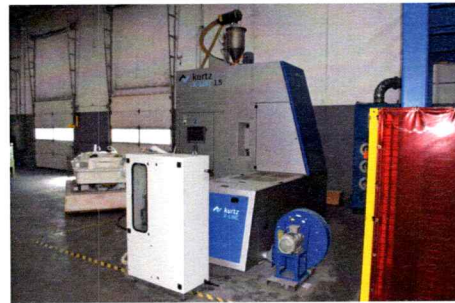
(2018) Kurtz ERSA Expandable Polystyrene (EPS) BATCH Pre-Expander, Model X-Line 1.5