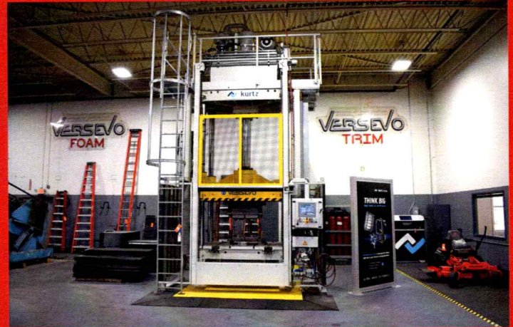
(2015) Kurtz 100 Ton/4 Post Hydraulic Trim Press, Model KP51000-16-8, Like New