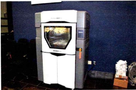
(2021) Strata SYS 3D Production Printer, Model Fortus 450MC