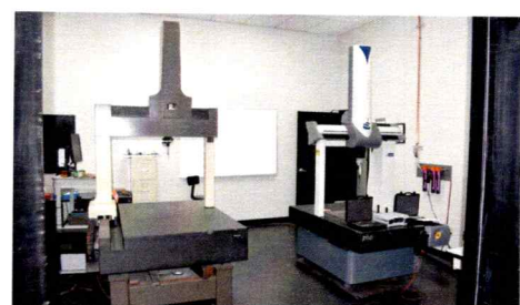
Mitutoyo CMM (Coordinate Measuring Machine), Model BH710, Renishaw PH1 Probe Head, Mitutoyo MAG-3 PC Type Control, Flat Panel Monitor, Etc.