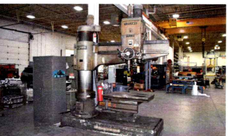
(1978) Ogawa Radial Arm Drill, Model HOR-D 1700