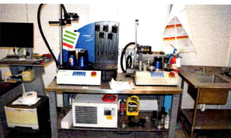
(2015) Haimer Heat Shrink Power Clamp Tool Setter, Model PC2006