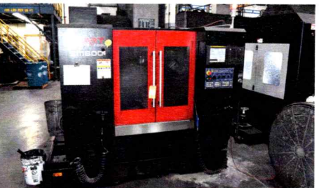
(Circa 2020) Smart Machine Tool (Taiwan) CNC Vertical Machining Center, Model SM600