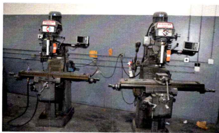
(2) Clausing/Kondia Vertical Mill, Model FV-1