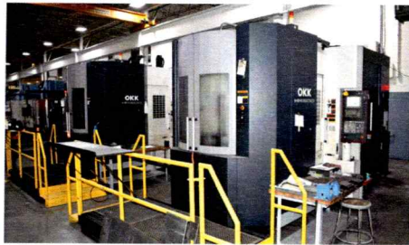
(2) (Circa 2013) OKK Twin Pallet CNC Horizontal Machining Centers, Model HM600