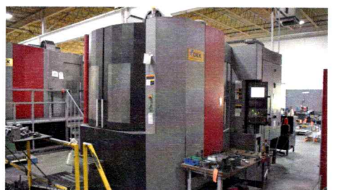
(Circa 2016) OKK Twin Pallet CNC Horizontal Machining Center, Model HM800S