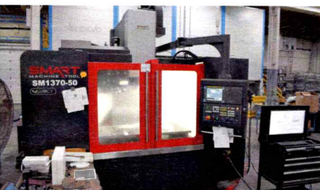
(2023) Smart Machine Tool (Taiwan) CNC Vertical Machining Center, Model SM1370-50, Renishaw Probe System