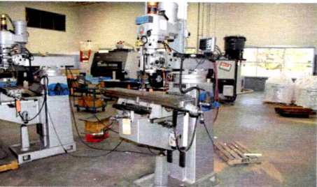
(2) (2017) Sharp Vertical Mills, Model TMV