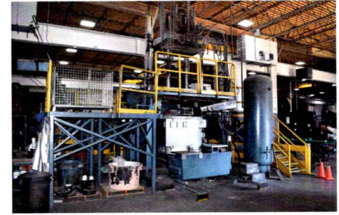
(1998) Kurtz 4 Post Low Pressure Hydraulic Die Casting System To Wit: Kurtz Model A110-7SC Die Caster, Kurtz 8 Circle Die Cooling System, Hindenlang Furnace