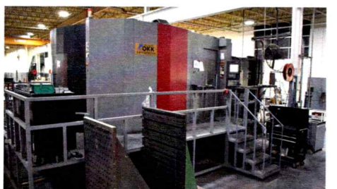
(Circa 2015) OKK Twin Pallet CNC Horizontal Machining Center, Model HM12500s