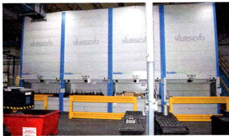
(2015) VLM-1 Kardex Remstar (Germany) Vertical Lift Storage Module, Model Shuttle-XP-500-2450X864-US