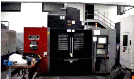
(Circa 2013) OKK CNC Vertical Machining Center, Model VM76R