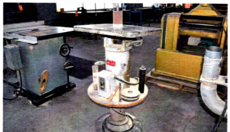
State Spindle Sander, Model 4, 7 Various Dia. Spindles, Tilting Table