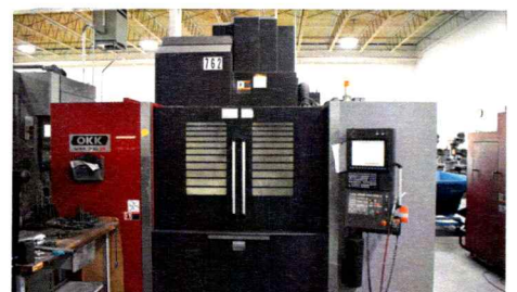
(Circa 2013) #762 OKK CNC Vertical Machining Center, Model VM76R