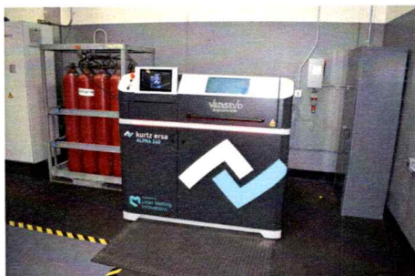
(2021) Kurtz ERSA 3D Metal Powder Printer, Model Alpha 140