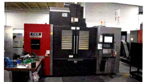
(Circa 2012) #761 OKK CNC Vertical Machining Center, Model VM76R