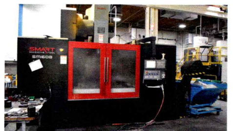
(Circa 2019) Smart Machine Tool (Taiwan) CNC Vertical Machining Center, Model SM1608, Renishaw Probe System