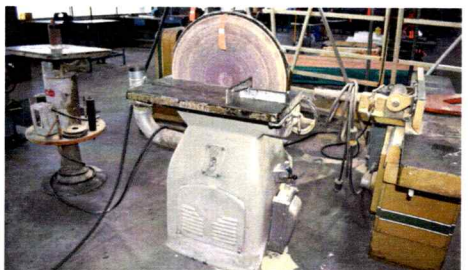
Kindt Collins Master 24" Disc Sander, Forward/Reverse Switch, Tilting Table