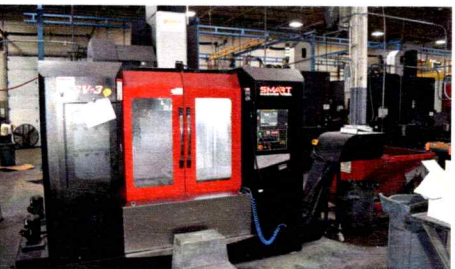
(Circa 2021) Smart Machine Tool (India) CNC Vertical Machining Center, Model SV3, Renishaw Primo Probe System