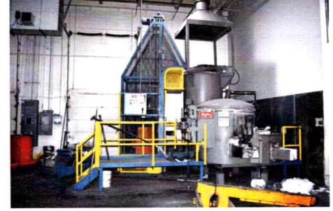
(2008) Modern Equipment Co. Aluminum Melting Furnace System