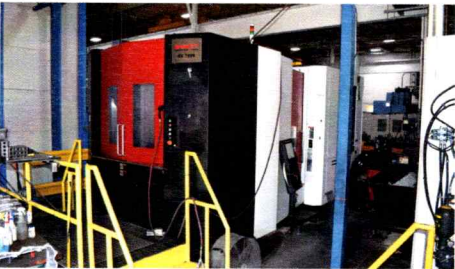
(Circa 2019) Smart/Nigata (Japan) Twin Pallet CNC Horizontal Machining Center, Model NX7000