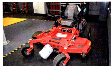
(2019) Gravely 60" Zero Turn Ride On Lawn Mower, Model Proturm Z60/991196, 142 hrs.