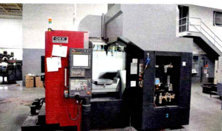
(Circa 2016) OKK 5 Axis CNC Vertical Machining Center, Model VC-X500, Renishaw Probe System