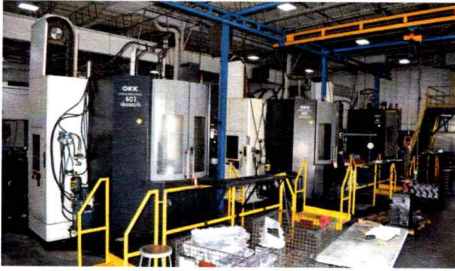
(3) (Circa 2006) OKK Twin Pallet CNC Horizontal Machining Centers, Model HM600