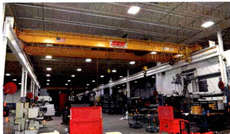
(Circa 2014) SCC (Superior Crane Corp.) 20 Ton Twin Trolley Overhead Bridge Crane System