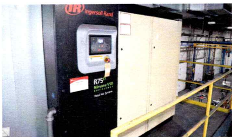
(2) (2015) Ingersoll Rand Screw Type Air Compressor Packages, Model R75N-TAS-Nirvana VSD, 100 HP, 138 PSIG Max, R404a Refrigerant Type, I-R PLC Controls