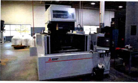
(Circa 2021) Mitsubishi CNC Wire Type EDM, Model MV4800S, Auto-Threading/chopper, Like New