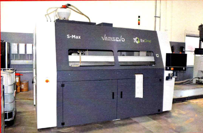
(2024) ExOne Large Format Sand Core 3D Printer, Model S-Max-Pro, purchased July 2024 for over $800,000