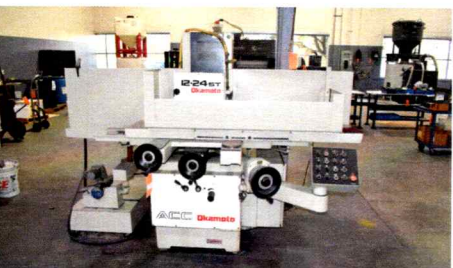
(Circa 1997) Okamoto Surface Grinder, Model ACC-12.24ST