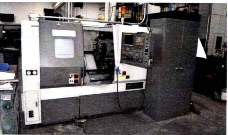
(2013) SMEC Samsung CNC Turning Center, Model SI20BML, Live Tooling