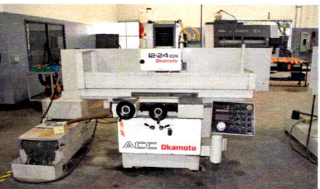
(Circa 1999) Okamoto Programmable Surface Grinder, Model ACC-12.24DX