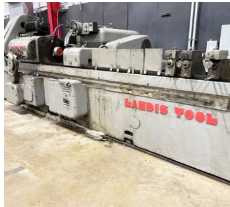
LANDIS PLAIN CYLINDRICAL GRINDER 22" X 120"