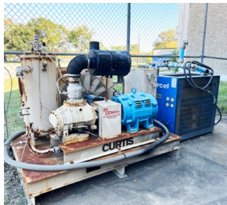
100HP CURTIS SCREW TYPE AIR COMPRESSOR Model: R/S100 D A/E-B251, S/N: 17J030002, 100 PSI

All items must be removed by: Wednesday, February 28 at 3pm