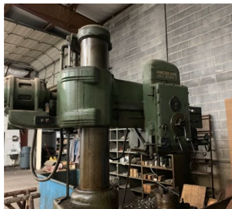
AMERICAN HOLE WIZARD RADIAL ARM DRILL WITH 30" X 30" X 20" T SLOTTED TABLE