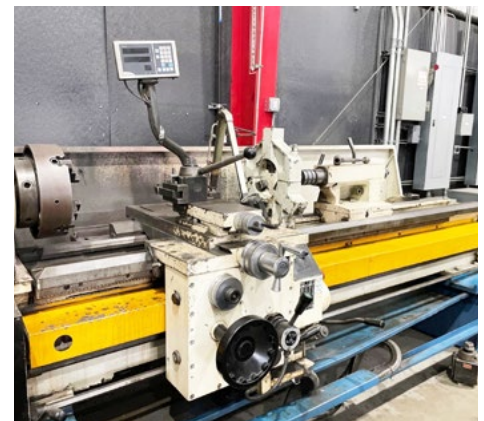
SUMMIT ENGINE LATHE 16 X 80 MODEL B