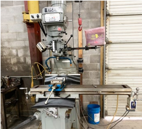
EISEN MODEL 813AB MILLING MACHINE