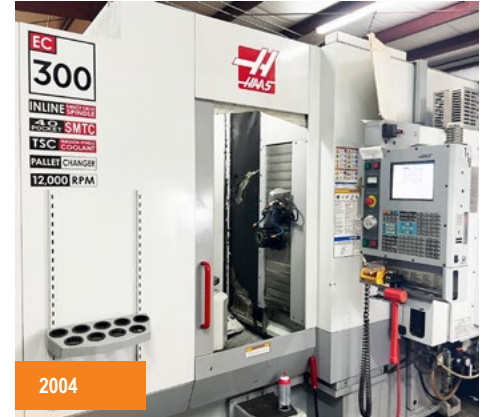
HAAS EC300 HORIZONTAL MACHINE CENTER