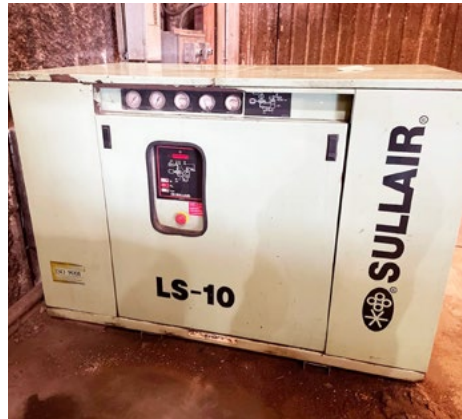
SULLAIR LS-10 AIR COMPRESSOR