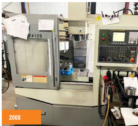
SHARP SV-2412S VERTICAL MACHING CENTER