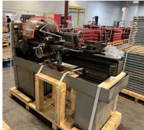
STANDARD MODERN 13/40 LATHE 7" 3 Jaw Chuck, Aloris Tool Post, Tail Stock Taper, with Tooling, 6" 3 Jaw Chuck, Inserts