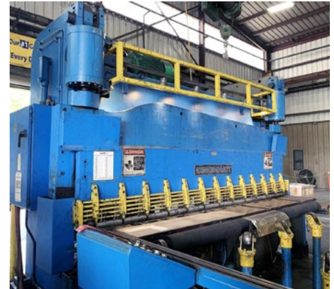
3/4" X 144" CINCINNATI MODEL 6SE12 HYDRAULIC POWER SQUARING SHEAR