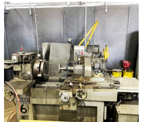
BRYANT UNIVERSAL INTERNAL GRINDER 24