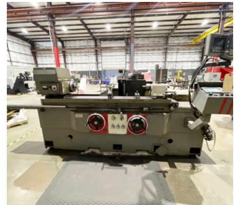
CHEVALIER 12" X 40" UNIVERSAL GRINDER- CG-1240A