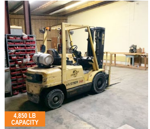
4,850 LB CAPACITY