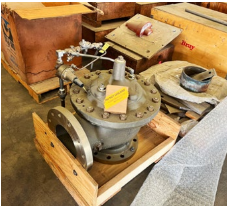
8 INCH CAL-VAL PRESSURE RELIEF VALVE