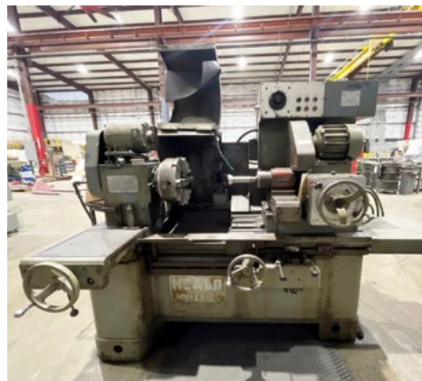
HEALD UNIVERSAL INTERNAL GRINDER MODEL 273A