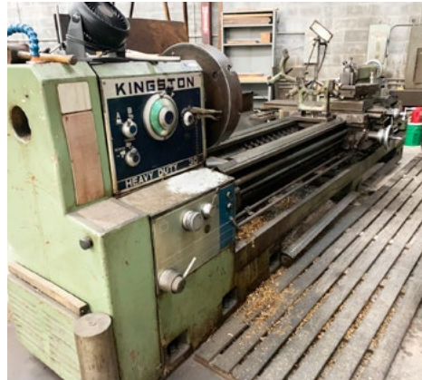
KINGSTON HEAVY DUTY 30 LATHE, MODEL HR3000