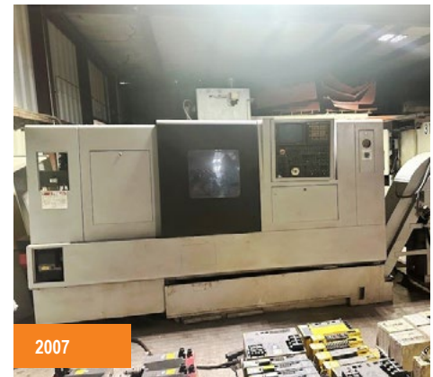
DAEWOO PUMA 3000 CNC LATHE