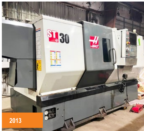
HAAS ST-30 CNC LATHE