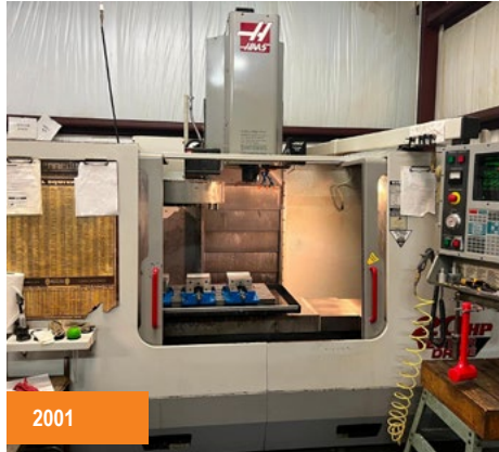
HAAS VF3 VERTICAL MACHINE CENTER

OKUMA LB2511-M CNC LATHE , OSP700L CONTROL, 12" hydraulic chuck, live tool turret, no tailstock chip conveyor