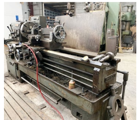
MORI SEIKI MH-1500 24" X 60" ENGINE LATHE