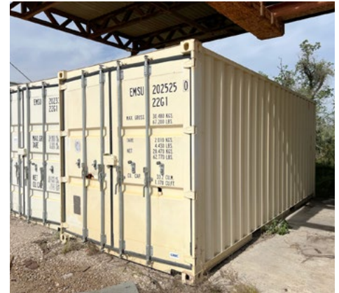
(2) 20 FT CONTAINER