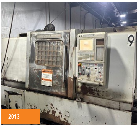
MORI SEIKI NLX2500MC/700