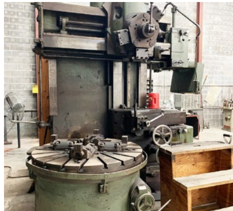
49" SCHIESS CLEVER TURRET LATHE