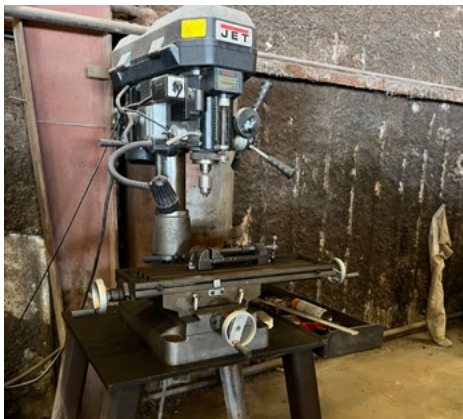
JET MILLING / DRILLING MACHINE MODEL JMD-18