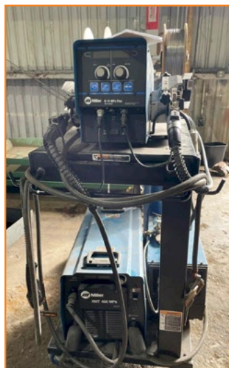
MILLER XMT450 MPA W/ D-74, AND WIRE FEEDER