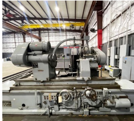
NORTON GRINDER 42" X 72"

(17) MULTIPLE LOTS OF DIAMOND GRINDING WHEELS various size & type