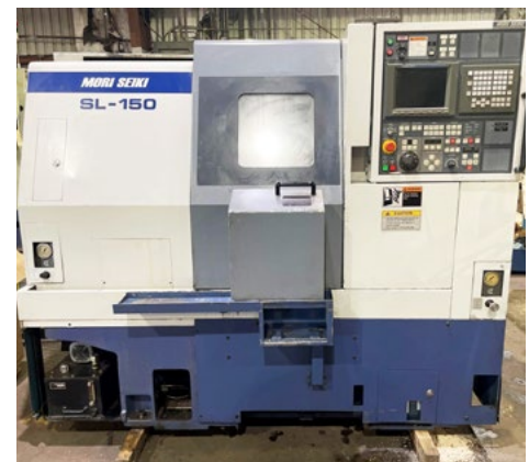
MORI SEIKI SL-150S CNC TURNING CENTER W/ SUB SPINDLE