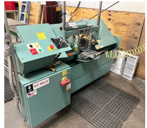
WELLS W9 HORIZONTAL BAND SAW WITH CONVEYOR S/N W127477