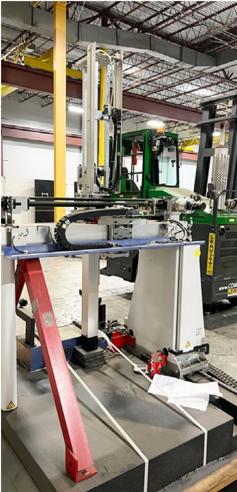
MITUTOYO COORDINATED MEASURING MACHINE