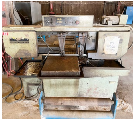
HYDMECH S20 BANDSAW