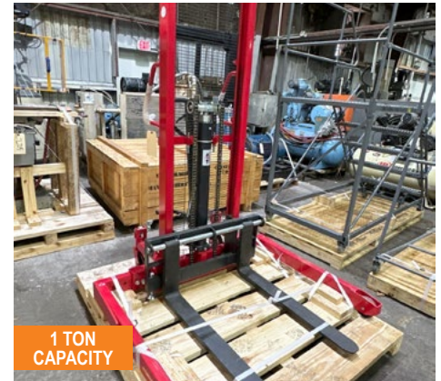
1 TON CAPACITY