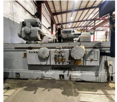
CINCINNATI UNIVERSAL CYLINDRICAL OD GRINDER 16" X 72"