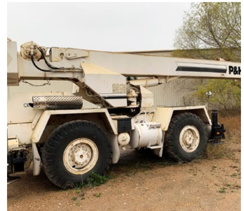
CENTURY II P&H 20 TON CHERRY PICKER