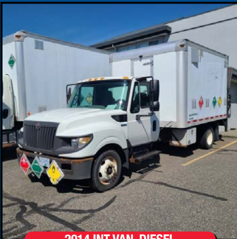
2014 INT VAN, DIESEL