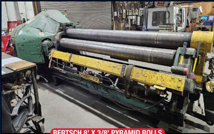
BERTSCH 8' X 3/8' PYRAMID ROLLS

Bid from your office in real time via the internet. Register at www.bidspotter.com