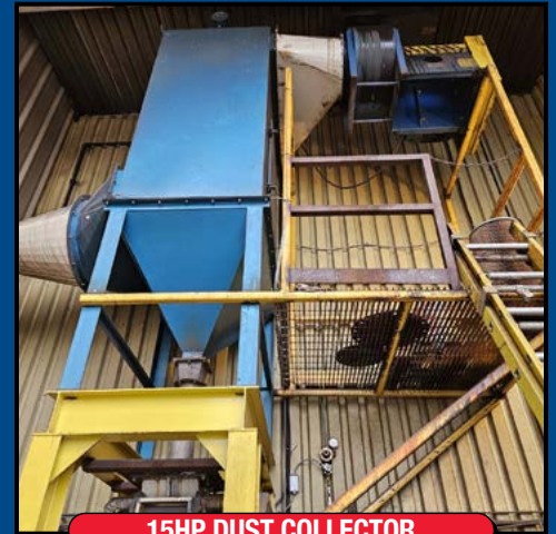
15HP DUST COLLECTOR