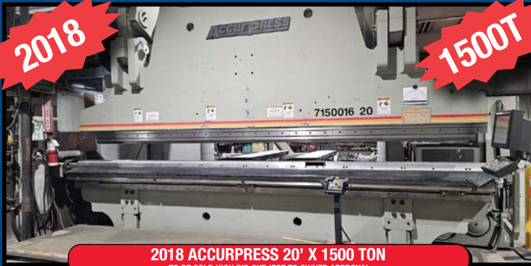
2018 ACCURPRESS 20' X 1500 TON TO BE SOLD HIGH BID SUBJECT TO OWNER APPROVAL

PLACE: 2255 TOWNLINE RD., ABBOTSFORD, BC • PREVIEW: WED., APR. 10TH - 9AM TO 4 PM