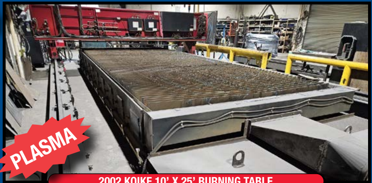
2002 KOIKE 10' X 25' BURNING TABLE