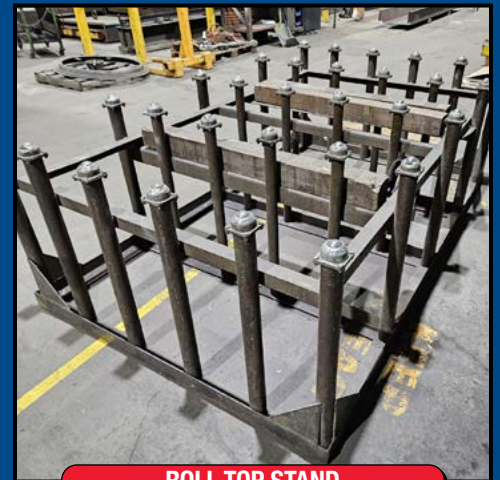
ROLL TOP STAND

SELLING OUT? SURPLUS EQUIP? NEED AN APPRAISAL?