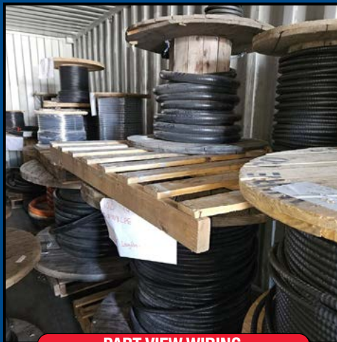
PART VIEW WIRING