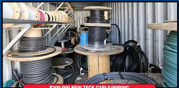
$200,000 NEW TECK CABLE/WIRING

PRESS BRAKE 2018 Accurpress 20' x 1500 ton, Mod. 7150016/20, s/n 12911, 460v/3ph, Control 120v/1ph., w/ engineered foundation drawings To be sold "High bid subject to owner approval". BURNING TABLE 2002 Koike burning table 10' x 25', Mod. MGM3100, s/n MGM202, Capacity 3100-MM, with Hypertherm HT4400 plasma power source SCISSORS Accurshear 16' x 3/8" - 1980, hydraulic, power back gauge; Keetona 10' x 1/4" - mechanical PYRAMID ROLLS Bertsch rolls 8"x3/8", 8" rolls, s/n 8320, 15hp/550v BANDSAW Hyd-Mech T-25A, 10 & 3 HP/575V, s/n 70587013 w/auto infeed & 40' outfeed rollcase, 16' x 16' x 12'H all steel shed & 40' x 31" roll o/f rollcase - sold separate CONTAINERS (2) 40' seacans (offsite in Abbotsford) VAN TRUCK 2014 International, Terrastar SFA 4x 2, Commercial 12'6" truck box, approx.. 258,025kms, Maxforce advanced diesel, auto, lift gate, MISCELLANEOUS Pallet rack sections, new welding electrode, more items to come etc. APPROX. $200,000 OF TECH CABLE & WIRE - to be sold in detailed lots.