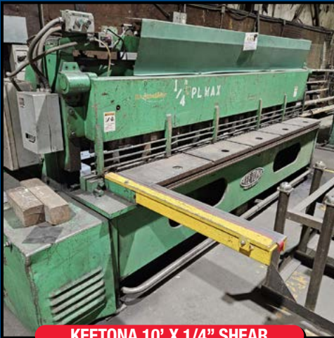
KEETONA 10' X 1/4" SHEAR