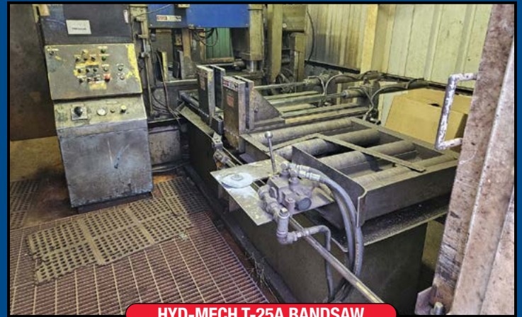
HYD-MECH T-25A BANDSAW