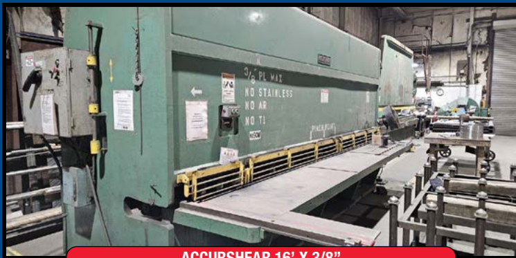
ACCUR SHEAR 16' X 3/8"