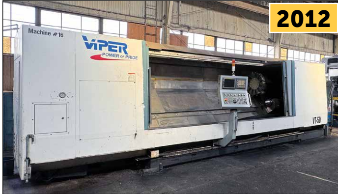
Mighty Viper VT-50AX/4000 CNC Turning Center