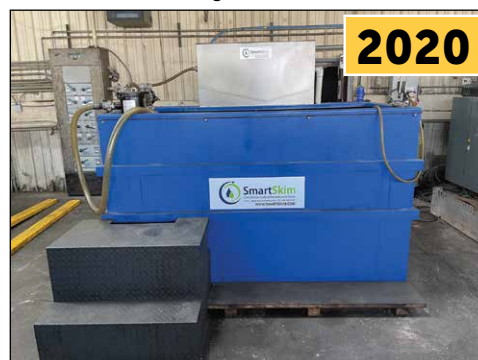
SmartSkim Coolant Loop Recycling System