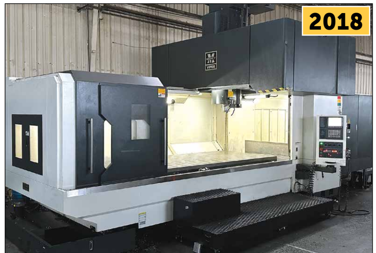
Might Viper PMC-3116AG CNC Bridge Mill

FOR TERMS, REMOVAL AND ADDITIONAL INFORMATION, go to: machinerynetworkauctions.com