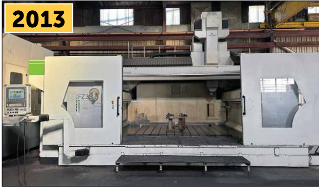
Zimmermann FZ-33 5 Axis Portal Milling Machine