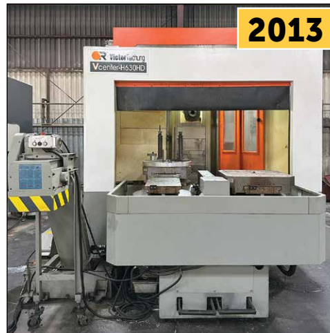
Victor Taichung VH-630HD CNC HMC