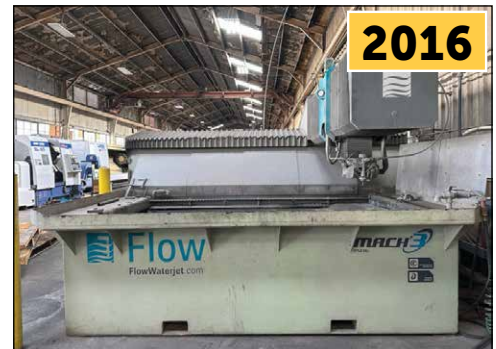
Flow Mach 3-2613 Waterjet