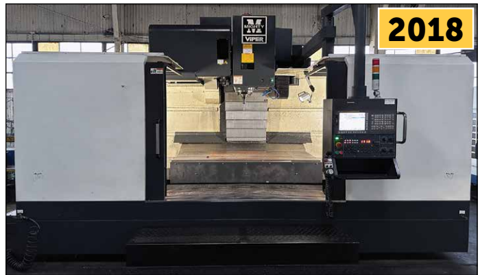
Mighty Viper VMC-1688AG CNC Vertical Machining Center