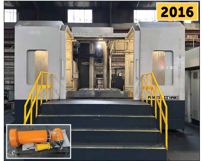
5.3" Might Viper PBM-135 CNC Table Type Horizontal Boring Mill