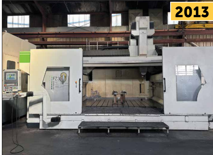
Zimmermann FZ-33 5 Axis Portal Milling Machine

FEATURING: Zimmermann 5-Axis Portal Milling Machine, Hyundai Wia & Mighty Viper CNC Vertical & Horizontal Boring Mills, Mighty Viper & Mori Seiki Bridge Mills, Mori Seiki & Mighty Viper CNC Turning, Flow Waterjet, and Hexagon CMM