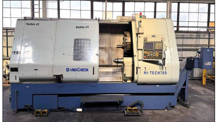
Mori Seiki SL-65A CNC Turning Center