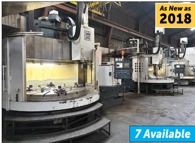
View of Mighty Viper CNC Boring Mills