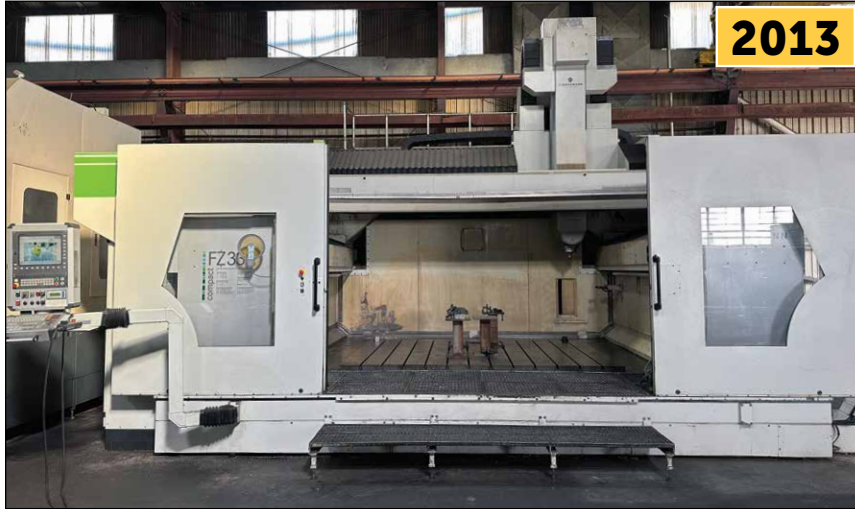
Zimmermann FZ-33 5 Axis Portal Milling Machine