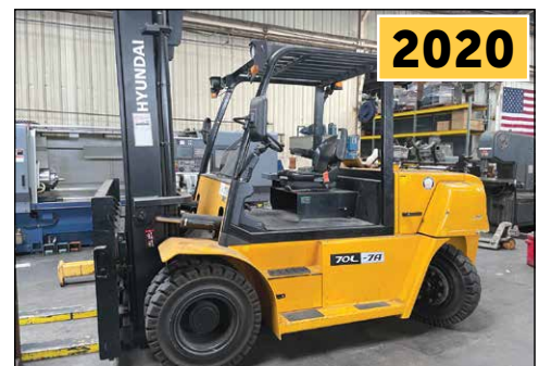
Hyundai 70L-7A Forklift, 15,000 Lb. Capacity