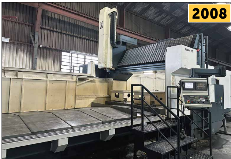
Might Viper PRW-5340 CNC Bridge Mill