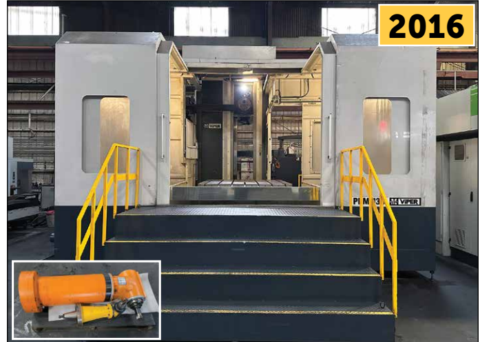
5.3" Might Viper PBM-135 CNC Table Type Horizontal Boring Mill