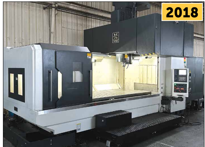
Mighty Viper PMC-3116AG CNC Bridge Mill