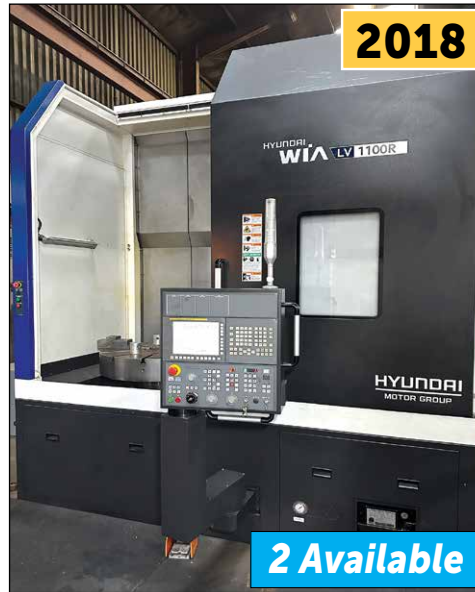
39" Hyundai Wia LV-110R CNC Vertical Boring Mill