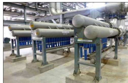
Celleco Cleanpac 350 Cleaning Bank System