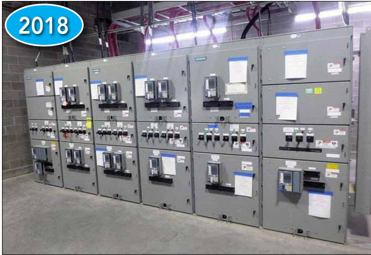
Switchgear SG-001 (with Arc Flash Detection) GM-SG, Manufactured 2018

SIEMENS TIASTAR MCC SECTION WITH DRIVES, MANUFACTURED 2018, (MANY SECTIONS AVAILABLE)