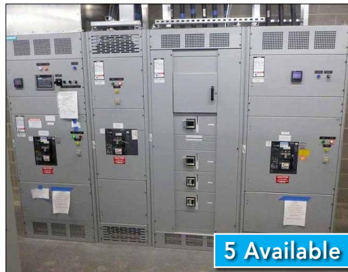
Siemens 480V Low Voltage Switchboard, Manufactured 2018, (5 Available)