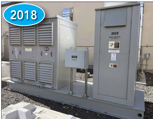
Asco 9000 Series Load Bank 1000KW, 480 Vac, 3PH 60HZ, with 1000KVA Mgm Transformer