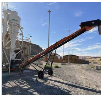
AGI BCX2-1539TDFL Grain Conveyor