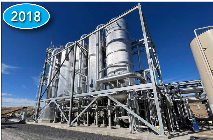
Rosenblad Design Group, Inc. Multi-Effect Evaporator System Manufactured 2018

FEATURING: Rosenblad Multi-Effect Evaporator System, Howden Twin Series Turbine Generator (6.9 MW), Victory Energy Voyager Series Boiler (90,000 PPH), 1,400 KW Cummins Natural Gas Generator, Hymac Wetlap Machine (Reconditioned 2018), Andritz 120-WT Heavy Duty Press, Bird Pressure Screens, (2) Andritz 50-1CP Refiners, Warren & Baerg Straw Recycling System, T-Bailey Tanks, Late Model Siemens Electrical Systems, Frac Trailers, Heat Exchangers, Pumps, Valves, Air Compressors and Much More!