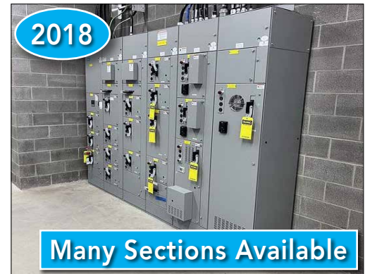
Siemens TiaStar MCC Section, with Drives, Manufactured 2018, (Many Sections Available)