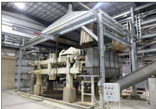
120" Rebuilt Press Technologies Heavy Duty 3.0m Twin Wire Wedge Thickener Model 120-WT