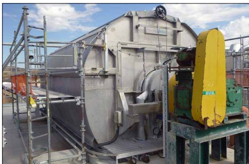
Alfa-Laval Celleco GL & V Hedemora CDP Disk Filter Type 3ML2-16-300 Savall