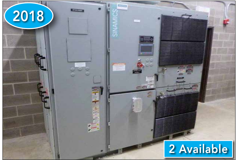
Siemens Perfect Harmony Drive 750 HP, Manufactured 2018, (2 Available)