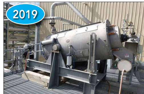
Vincent Model EF-30 Sludge Press S/S S/N 17590-8, Manufactured 2019