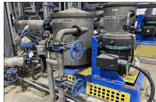
Bird M800 and M400 Pressure Screens Rebuilt by AFT in 2018