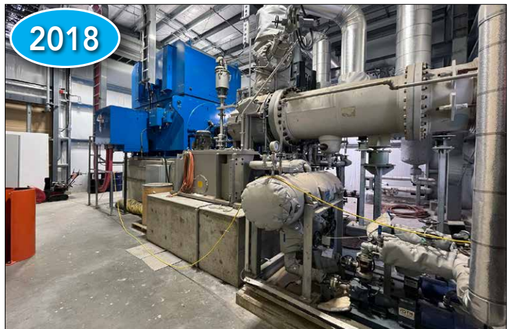
Howden Turbine Generator Twin Series Dual Casing Turbine SST-110 6.9 MW Capacity

CONTACT: Jordan Feldman at 215.692.0958 or email jordan@globalequipintl.com