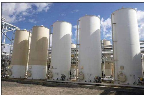
Large Various Sized Stainless Steel and Steel Tanks