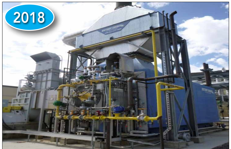
Victory Energy Voyager Series 90,000 LBS/HR PPH Natural Gas Boiler Manufactured 2018