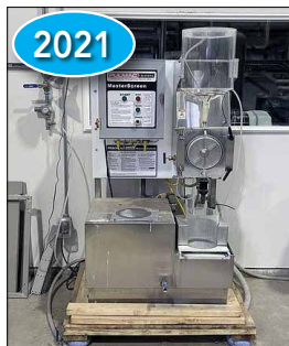
Pulmac Masterscreen Low Consistency Screening Device Model MS-134, Manufactured 2021