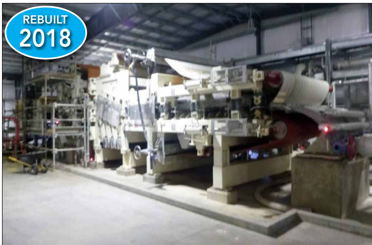
Hymac Wetlap Machine Model 100 HP-SF with Heavy Duty Press Rebuilt 2018 (Rated 300-400 TPD)