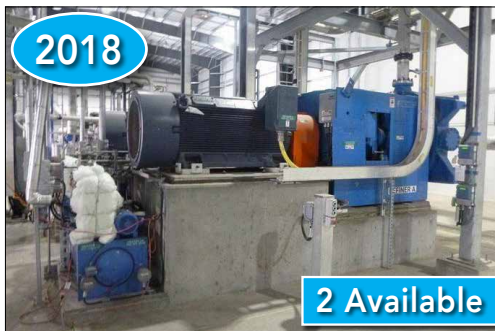
Andritz Refiner Model 50-1CP Pressurized Manufactured 2018 (2 Available)