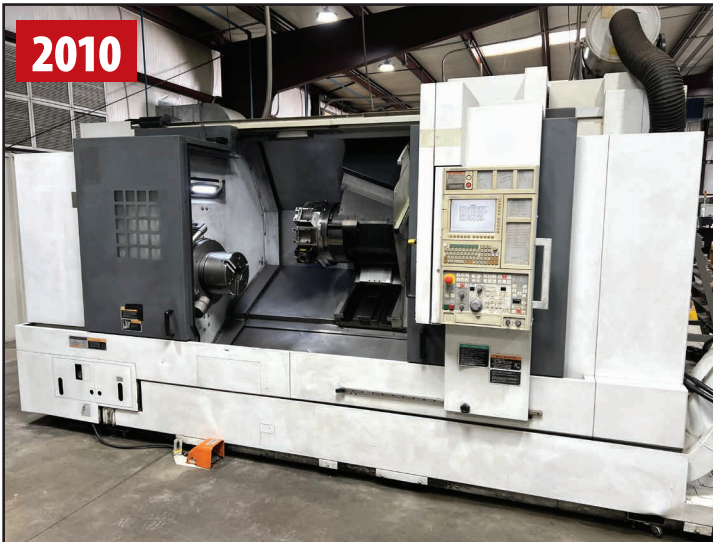
MORI SEIKI NL3000MC/1250 TURNING CENTER