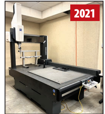
ZEISS CONTURA 9/18/6 CMM

FEATURING: (5) DOOSAN PUMA Turning Centers, new as 2022; (5) DMG MORI SEIKI Turning Centers, new as 2019; (2) DMG MORI SEIKI VMC's, 2013 WEILER CNC Lathe; (2) COSEN Bandsaws, new as 2013; UNISIG CNC Gun Drill, 2021 ZEISS CMM, 2022 KEYENCE Laser, Inspection Equipment, Manual Machines, Tooling, Bar Stock, Racking, Factory Support Equipment, Forklifts, Pick-up Trucks, and more