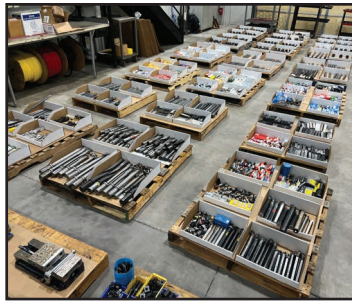
VIEW OF PERISHABLE TOOLING