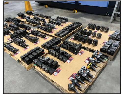
VIEW OF LIVE & STATIC TOOL HOLDERS