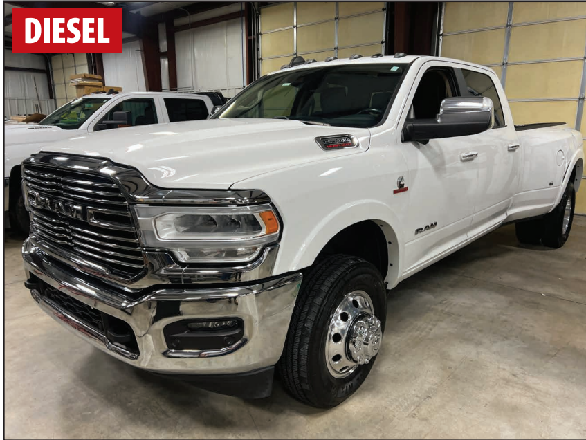
2019 RAM 3500 LARAMIE LIMITED EDITION DUALY PICKUP

NISSAN OPTIMUM 60 5,000 LB. LP FORKLIFT , s/n na, w/ 3-Stage Mast, 42" Forks