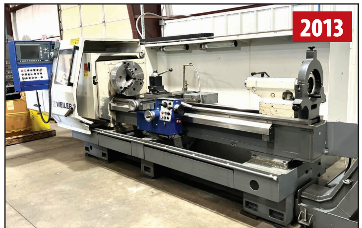
WEILER E50 X 2000 CNC LATHE

PRE-AUCTION OFFERS INVITED ON MAJOR ASSETS