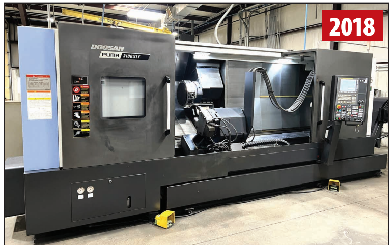
DOOSAN PUMA 3100 XLY TURNING CENTERS