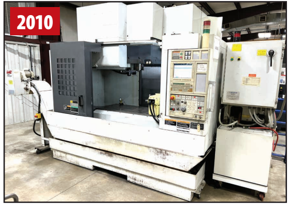
MORI SEIKI NV5000A1B/40 4TH AXIS VMC

2010 MORI SEIKI NV5000 1B/40 4TH AXIS VERTICAL MACHINING CENTER , s/n NV501JH6378, w/ MORI SEIKI MSX-511IV Control, 40" x 20" Table, X-40", Y-20", Z-20", 26" Under Spindle, 2640 Lb Table Capacity, Cat 40 Spindle Taper, 30 ATC, 14,000 RPM Spindle RPM, Chip Conveyor / Coolant with Chip Blaster High Pressure Pump, 8" Nikken RWA 320 4th Axis with Tailstock, (4th Axis to be Offered Separately)