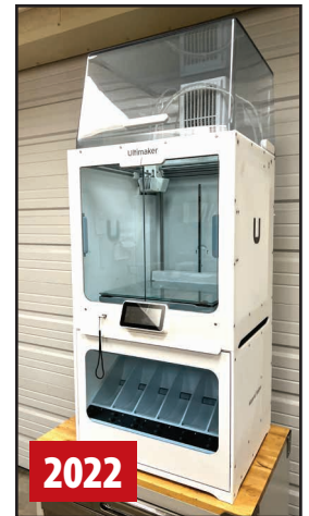
2022 ULTIMAKER S5 R2 DESKTOP 3D PRINTER