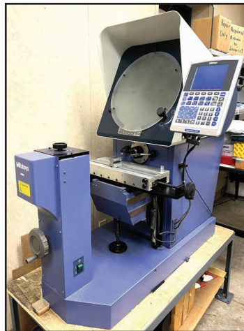
MITUTOYO PH-A14 OPTICAL COMPARATOR

ALSO: Height Gages, Outside Micrometers, Inside Micrometers, Blade Mics, Bore Gages, Calipers, Pin Gages, Gage Blocks, Granite Surface Plates and Much More