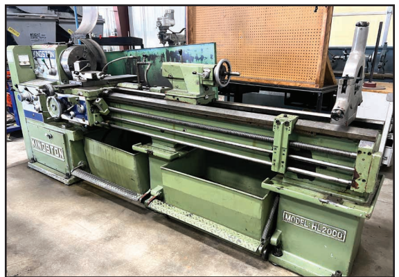
KINGSTON HL2000 18"/9" X 80" GAP BED ENGINE LATHE