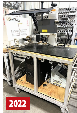
2022 KEYENCE 3-AXIS LASER MARKING MACHINE