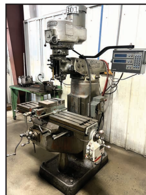
BRIDGEPORT 1.5 HP VERTICAL MILL