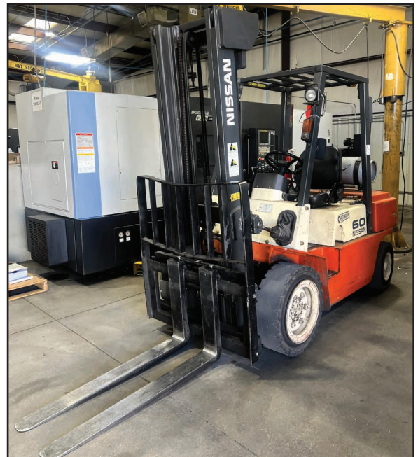
NISSAN 5,000 LB FORKLIFT