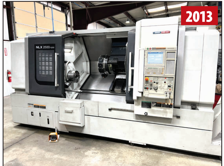
DMG MORI SEIKI NLX2500Y/700 TURNING CENTER