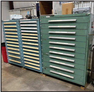
VIEW OF CABINETS