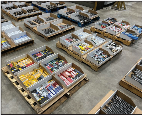
VIEW OF CARBIDE BITS