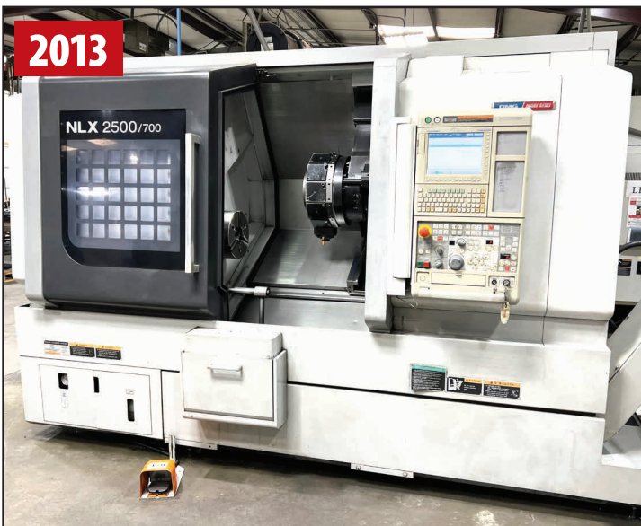
DMG MORI SEIKI NLX2500Y/700 TURNING CENTER