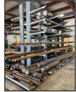
VIEW OF TOOL STEEL & CANTILEVER RACKING