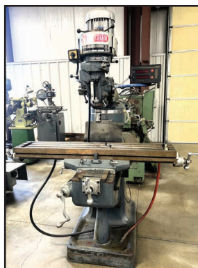
BIRMINGHAM 3 HP VERTICAL MILL