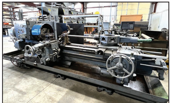
WARNER SWASEY 2A M-3470 SQUARE HEAD TURRET LATHE