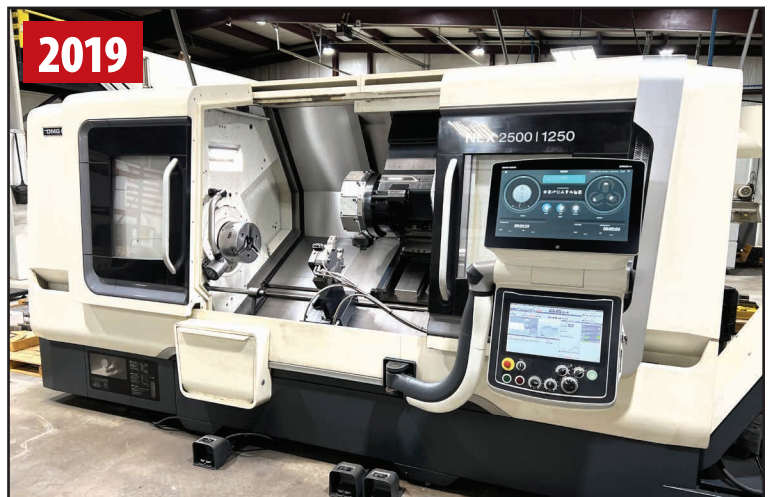
DMG MORI NLX2500/1250 TURNING CENTER