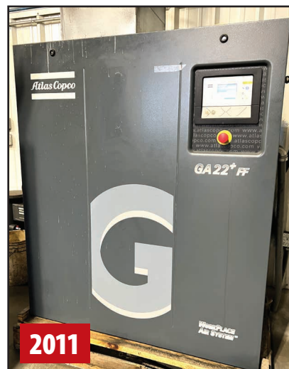
ATLAS COPCO 30 HP AIR COMPRESSOR