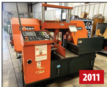
COSEN C-420NC AUTOMATIC HORIZONTAL BANDSAW