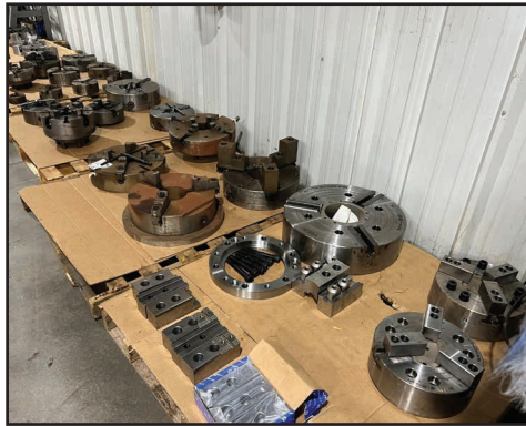
VIEW OF CHUCKS