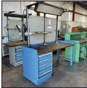
VIEW OF WORK BENCHES