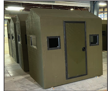
VIEW OF HUNT BLINDS

For auction inquiries, please contact Jennifer Reiner at (847) 545-6374 or jennifer@perfectionindustrial.com