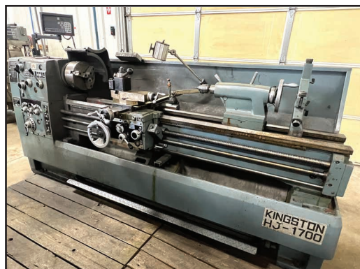
2011 KINGSTON HJ1700 16" X 64" GAP BED ENGINE LATHE