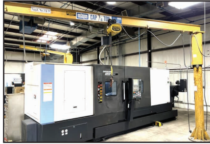
1/4 TON FREE STANDING JIB CRANES