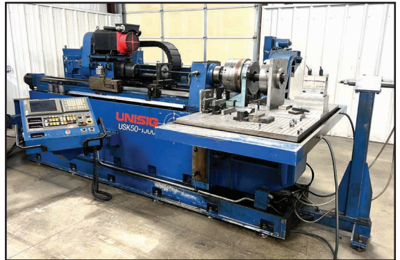
UNISIG USR-1000 CNC GUN DRILL

ALSO: Live and Static Tool Holders, CAT 50 Tool Holders, CAT 40 Tool Holders, Tool Bushings, EPPINGER Preci-Flec Tooling Adaptor Sets, Boring Bars, Turning Tools, Core Drills, Spade Drills, Carbide Inserts, High Speed Inserts, Gun Drills, Carbide End Mills, Reamers, Thread Mills, Assorted Collets, R8 Tooling, Machine Vises, Bench Vises, Clamping, Rotary Tables, Super Spacers, Large Variety of Chucks, Chuck Jaws and More