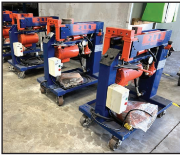
EZELEND 3 HP & 2 HP TUBE BENDERS