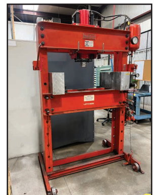
NUGIER 60 TON HYDRAULIC SHOP PRESS