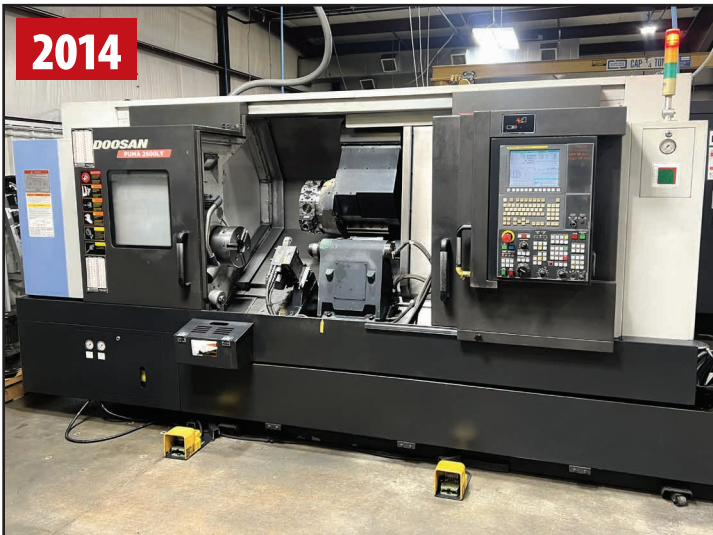
DOOSAN PUMA 2600 LY TURNING CENTER