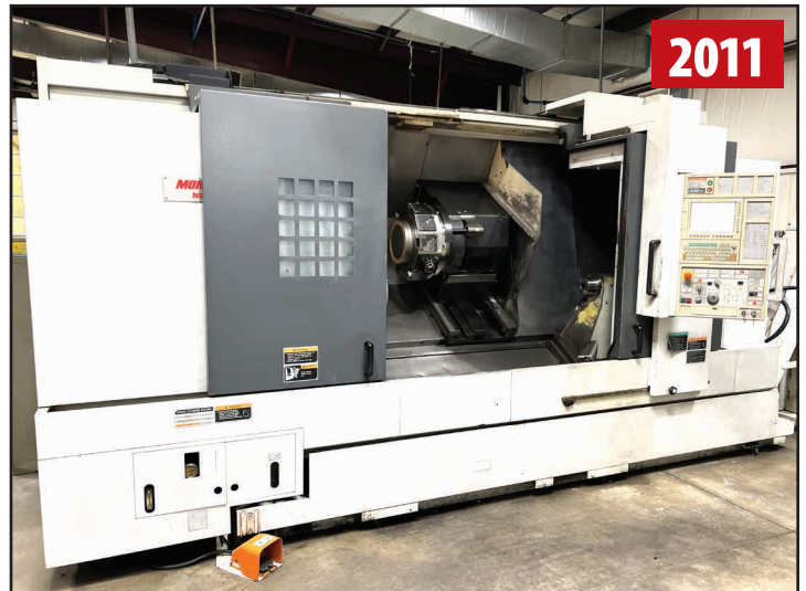
DMG MORI SEIKI NLX2500Y/1250 TURNING CENTER