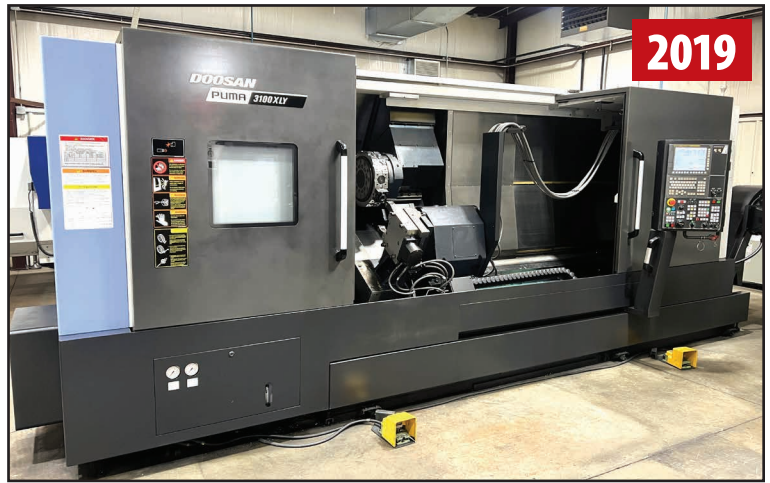
DOOSAN PUMA 3100 XLY TURNING CENTERS

2013 WEILER E50 X 2000 CNC LATHE , s/n IG05, w/ WEILER/SIEMENS CNC Control, 9.5" ROTA-S 3-Jaw Chuck, 22" x 78" Capacity, 6.5" Hole, 13" Swing Over X Slide, 10" Steady Rest, Chip Conveyor / Coolant