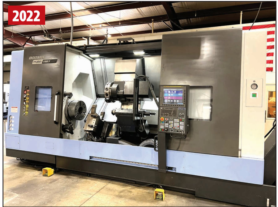
DOOSAN PUMA 5100 LYB TURNING CENTER

COMPLETE CATALOG & INFORMATION: https://perfection.global/rightway