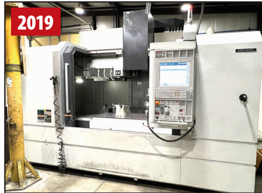
DMG MORI NVX 7000/50 4TH AXIS VMC