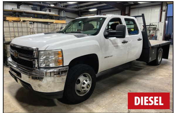
2011 CHEVY K3500 DUALY FLAT RACK TRUCK