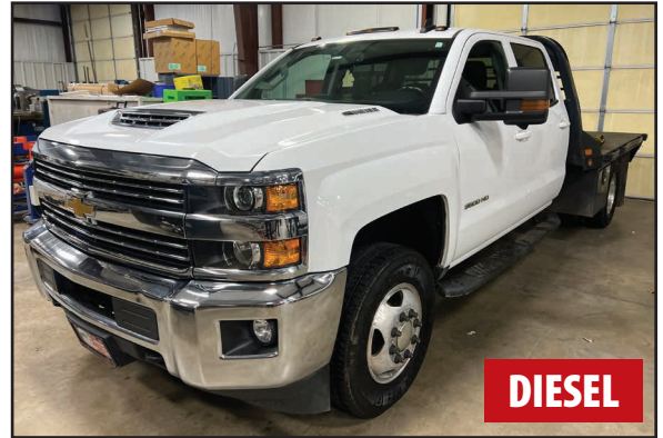
2017 CHEVY K3500 DUALY FLAT RACK TRUCK