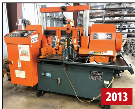
COSEN C-320GNC AUTOMATIC HORIZONTAL BANDSAW