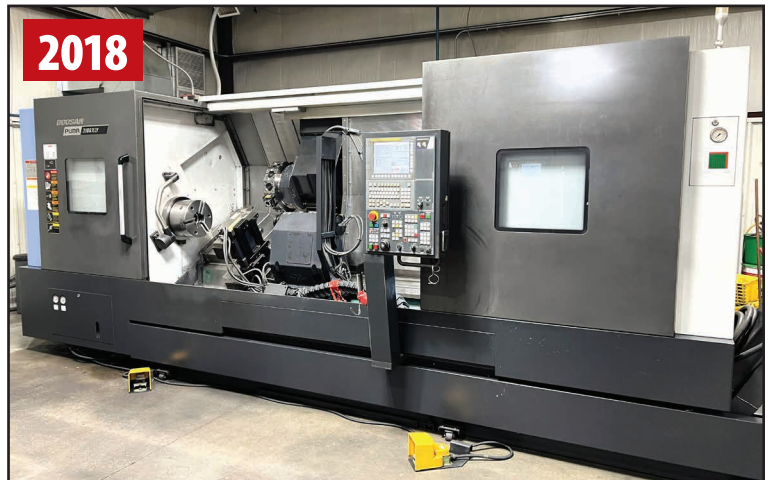
DOOSAN PUMA 3100 XLY TURNING CENTER