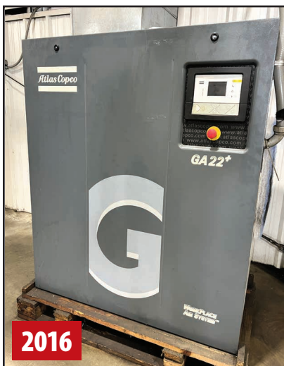
ATLAS COPCO 30 HP AIR COMPRESSOR

ALSO: LISTA and VIDMAR Modular Tool Cabinets, Toolboxes, Maple Top Work Benches, Hand Tools, Power Tools, Air Tools, Cantilever Racking, Steel Stock, Bar Stock, Tube Stock, Self-Dumping Hoppers, Free-Standing Jib Cranes, Pallet Racking, Hunting Blinds, and Much More