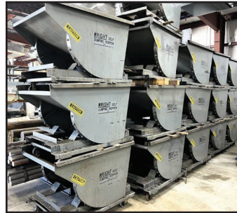
VIEW OF DUMPING HOPPERS