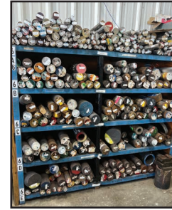
VIEW OF TOOL STEEL