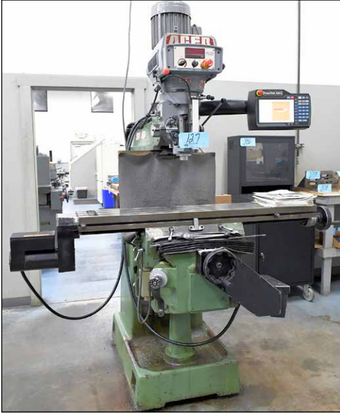
Proto Trak CNC Vertical Milling Machine, with Newer Acer Head and Newer Trak-KMX CNC Control

OFFERING ONLINE BIDDING ONLY, SIGN UP NOW!