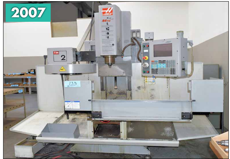
Haas Model TM-2 CNC Vertical Machining Center, (2007)