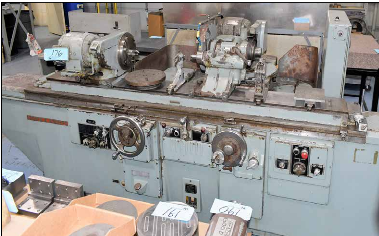
Brown & Sharpe No. 4 OD Grinder