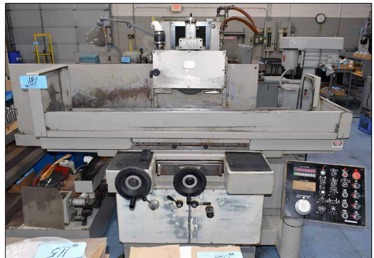
Okamoto Model ACC-124DX 12"x 24" Hydraulic Automatic Surface Grinder