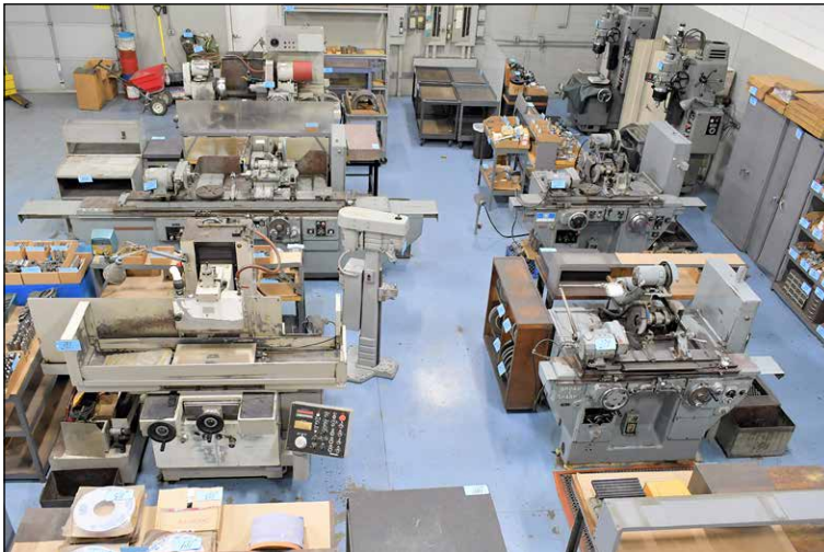
Extremely Clean Precision Grinding Machinery