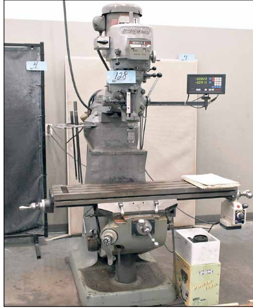
Bridgeport 2HP Variable Speed Vertical Milling Machine