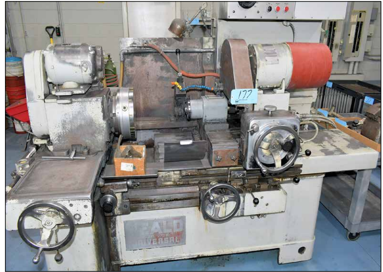
Heald Model 273A Universal Grinder