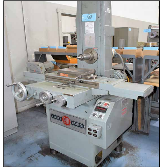
Parker Majestic 2Z, 6"x 18" Surface Grinder