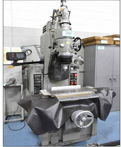
Moore No. G18 Jig Grinder