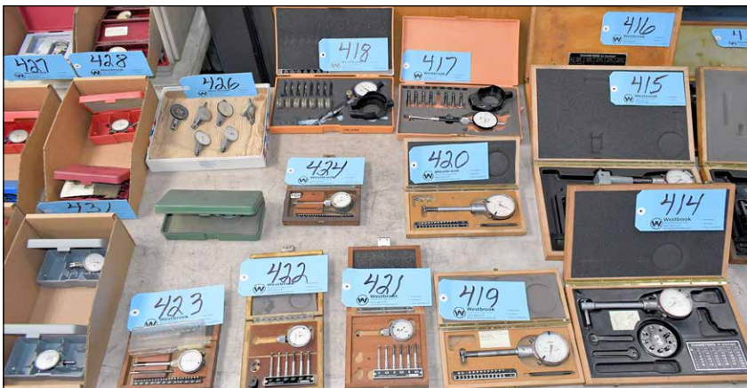
Large Assortment of Inspection Equipment