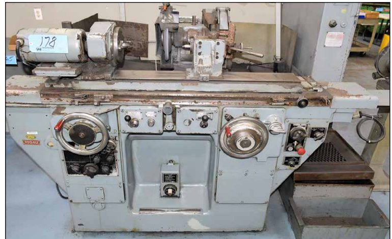
Brown & Sharpe Model 1024U Cylindrical Universal Grinder