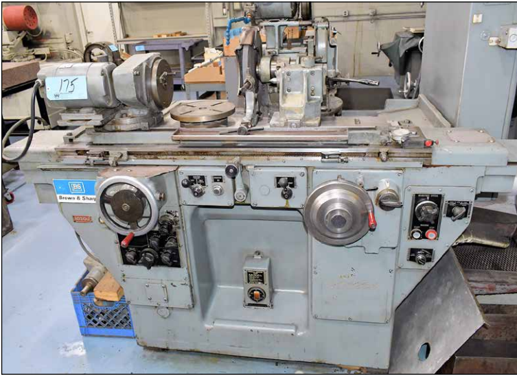
Brown & Sharpe Model 1020U Cylindrical Grinder