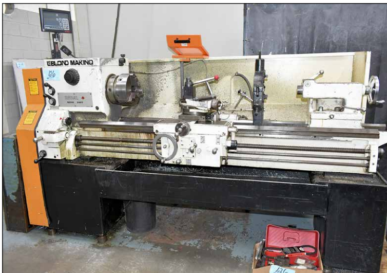
LeBlond Makino Regal Servo Shift 19"x 54" Geard Head Engine Lathe