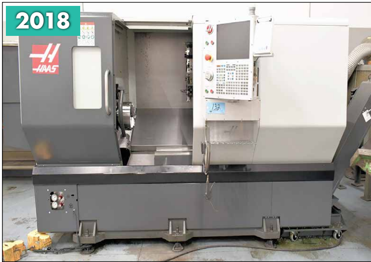
Haas Model ST-30 CNC Lathe, (2018)

LOCATION: 29450 Haas Road, Wixom, Michigan 48393