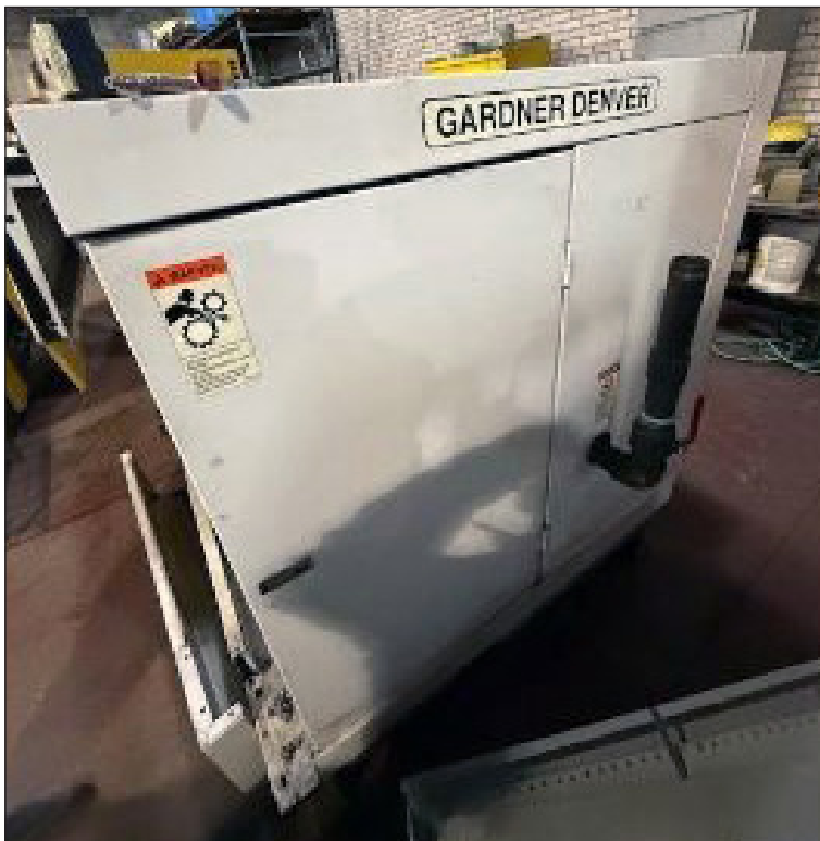
Gardner Denver Compressor, Model # EBPQMB, 100 H.P.