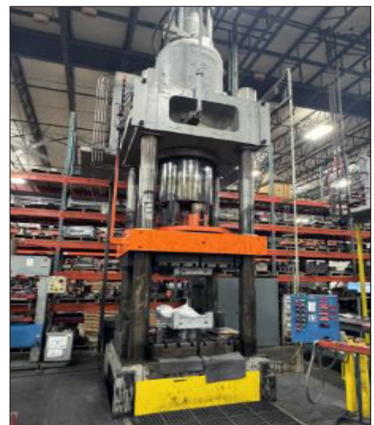
1000 Ton Hydraulic 4-Post Press Double Action Press with Cushion, 45" x 45" Between Posts