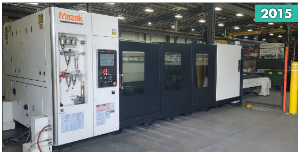
Mazak Model Optiplex 3015 Nexus Co2 Laser, 2.5 KW, 60" x 120", Dust Collector, Chiller