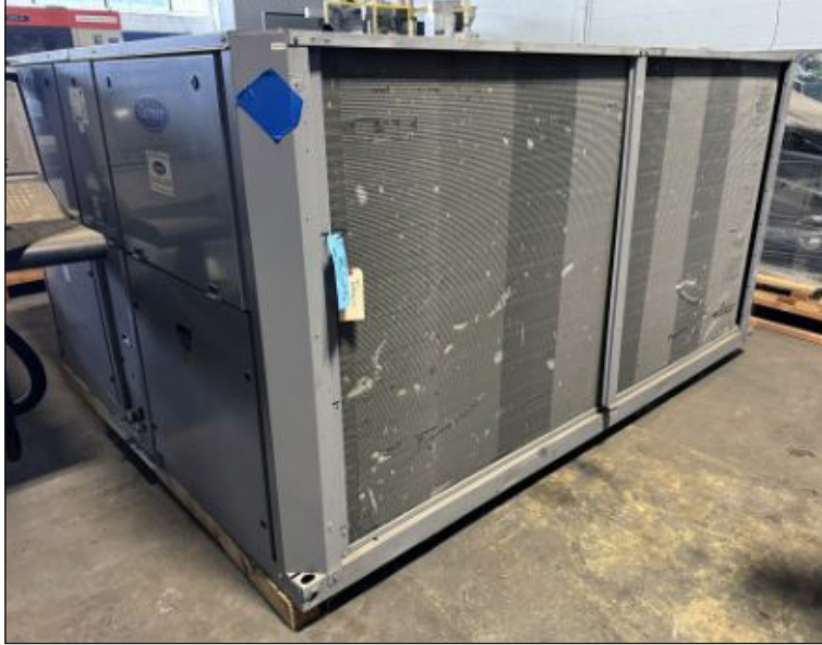
Carrier Chiller, Model 30RAN055-611KA

OFFERING ONLINE BIDDING ONLY, SIGN UP NOW!