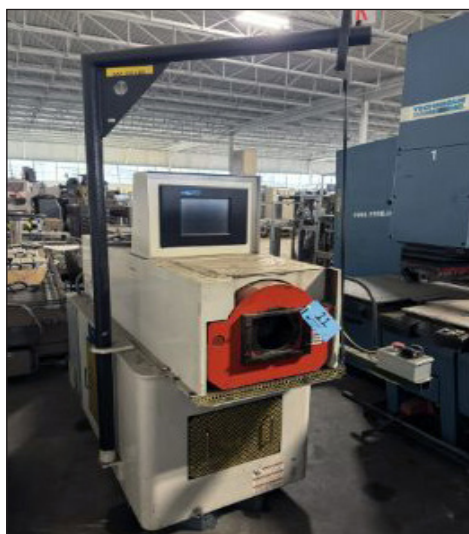
Eagle I/O 3000, CNC Tube End Sizer