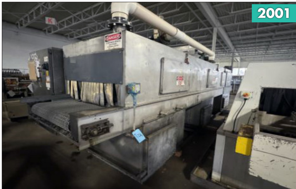
Stoelting Gas Fired Parts Washer Model AOF-236