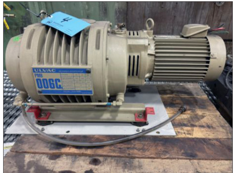
(Unused) Ulvac Model PMB 006C, Mechanical Booster Turbo Pump & Motor