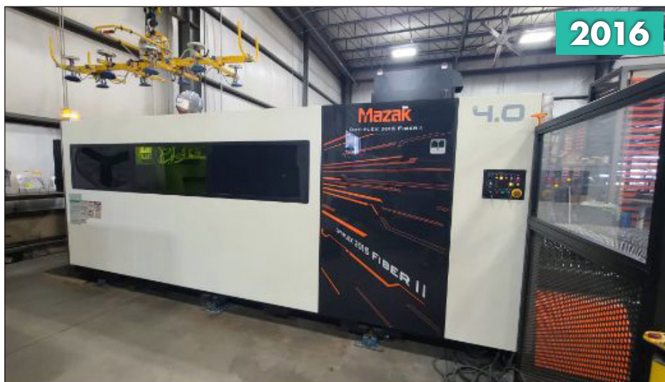
Mazak CNC Fiber Laser Cutting System Model Optiplex 3015, 4 KW, 60" x 120", Dust Collector, Chiller

LOCATION: Multiple Jackson, Michigan Locations