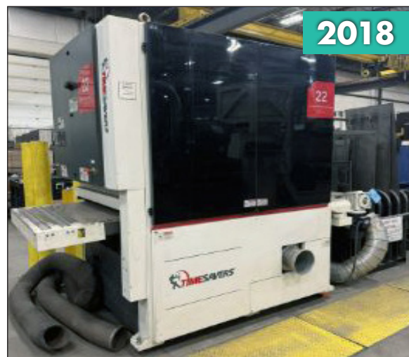
TimeSaver Model 2211-03-09, Rotary Brush Finishing Machine with Wet Type Collector