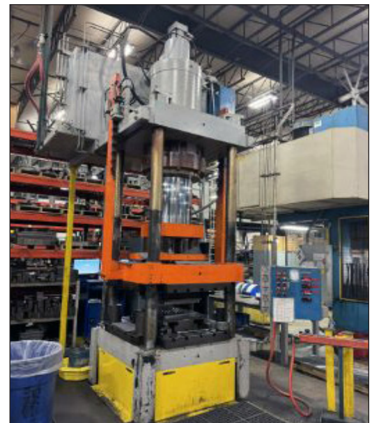
500 Ton Hydraulic 4-Post Press Double Action Press with Cushion, 35" x 35" Between Posts