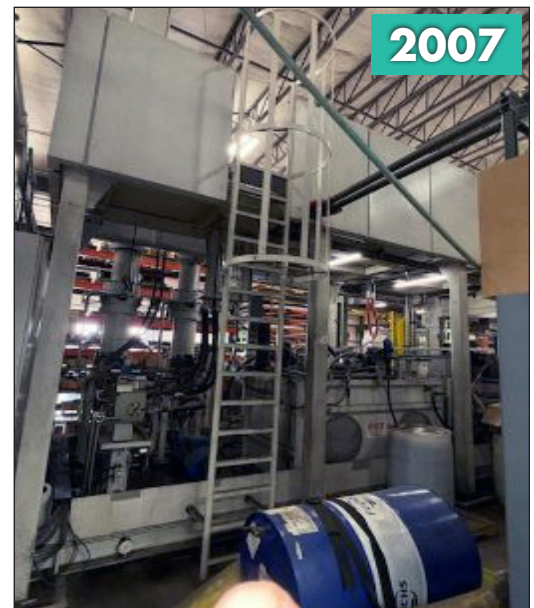
Schuler Tube Hydroform Press, Model SCH-1600-1.5 x 1.5