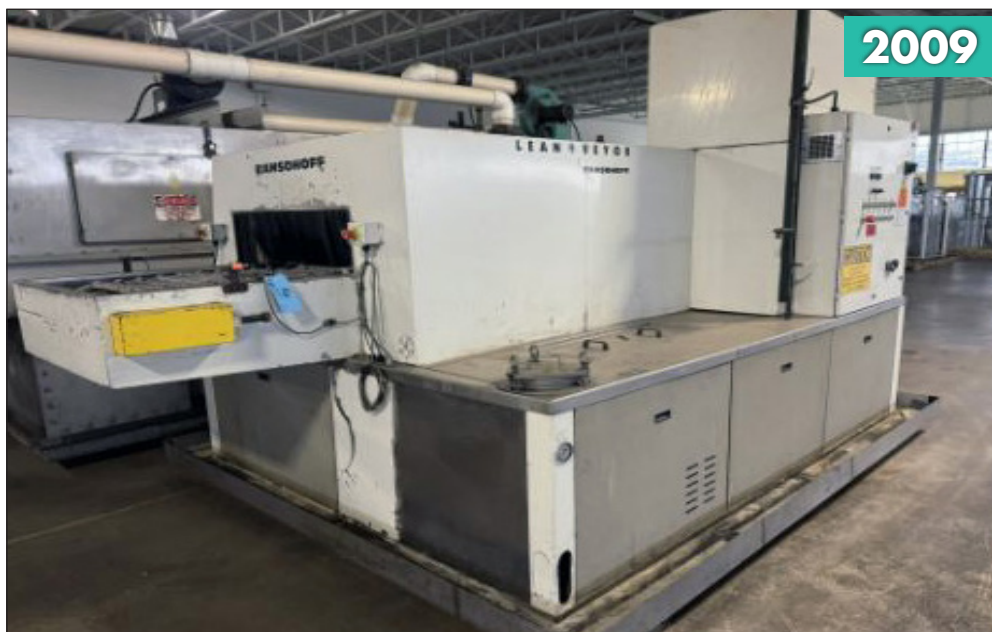
Ransoff Electric Parts Washer, 20" Belt Width, Extra Filters