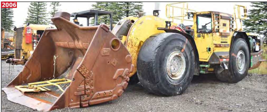
ATLAS COPCO ST14 underground scoop tram