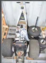
POWERMOVER electric cart pusher