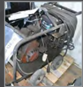
KARCHER pressure washer