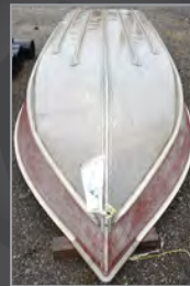
LUND (2015) 14' aluminum boat