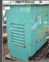
NEWAGE diesel-powered generator