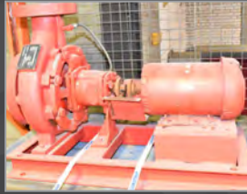
ARMSTRONG 4x3x8 pump & motor assembly