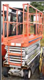
SKYJACK SJ0059 scissor lift