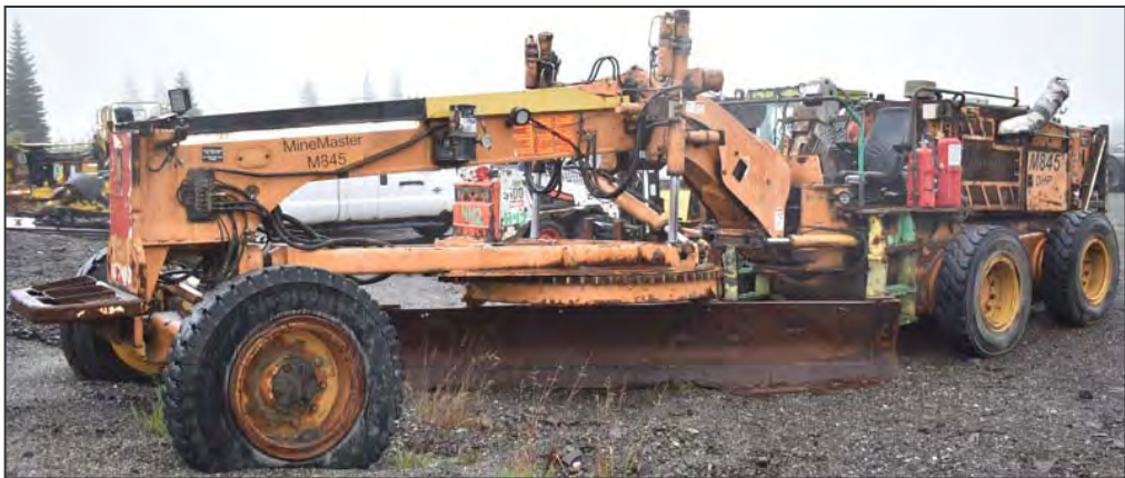
MINEMASTER/CASE M84DHP underground motor grader

CONTACT 416.962.9600 TO CONSIGN EQUIPMENT AT AN UPCOMING AUCTION