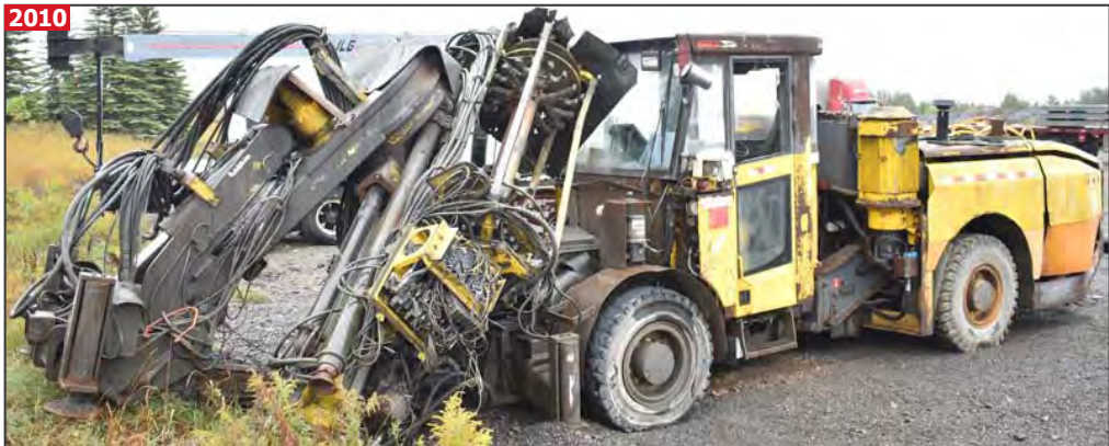
ATLAS COPCO SIMBA L6C hydraulic long-hole production drill rig