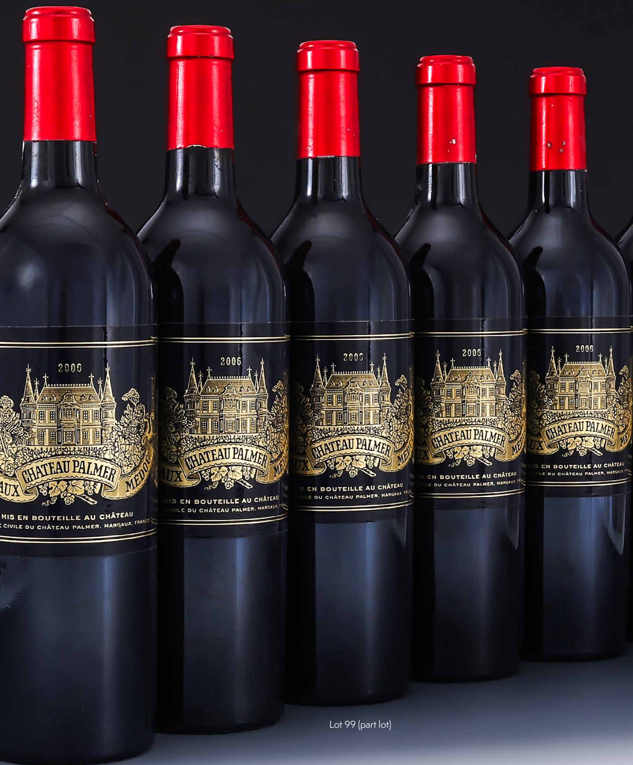
Lot 99 (part lot)

95 2005 Chateau Moulin Riche, Saint-Julien 12x75cl