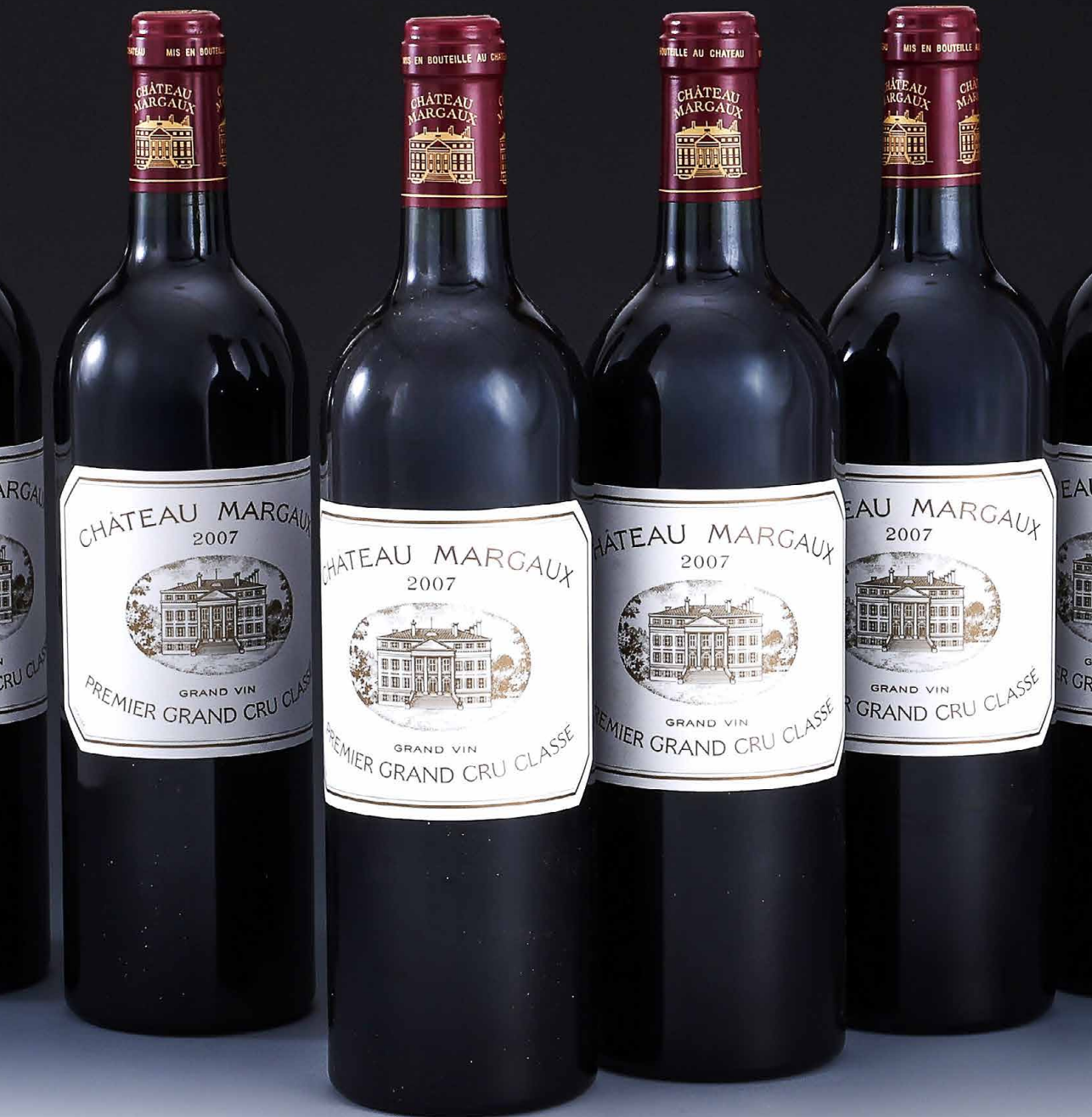
Lot 103 (part lot)

109 2007 Chateau Batailley 5eme Cru Classe, Pauillac OWC 12x75cl Previously stored at The Wine Society