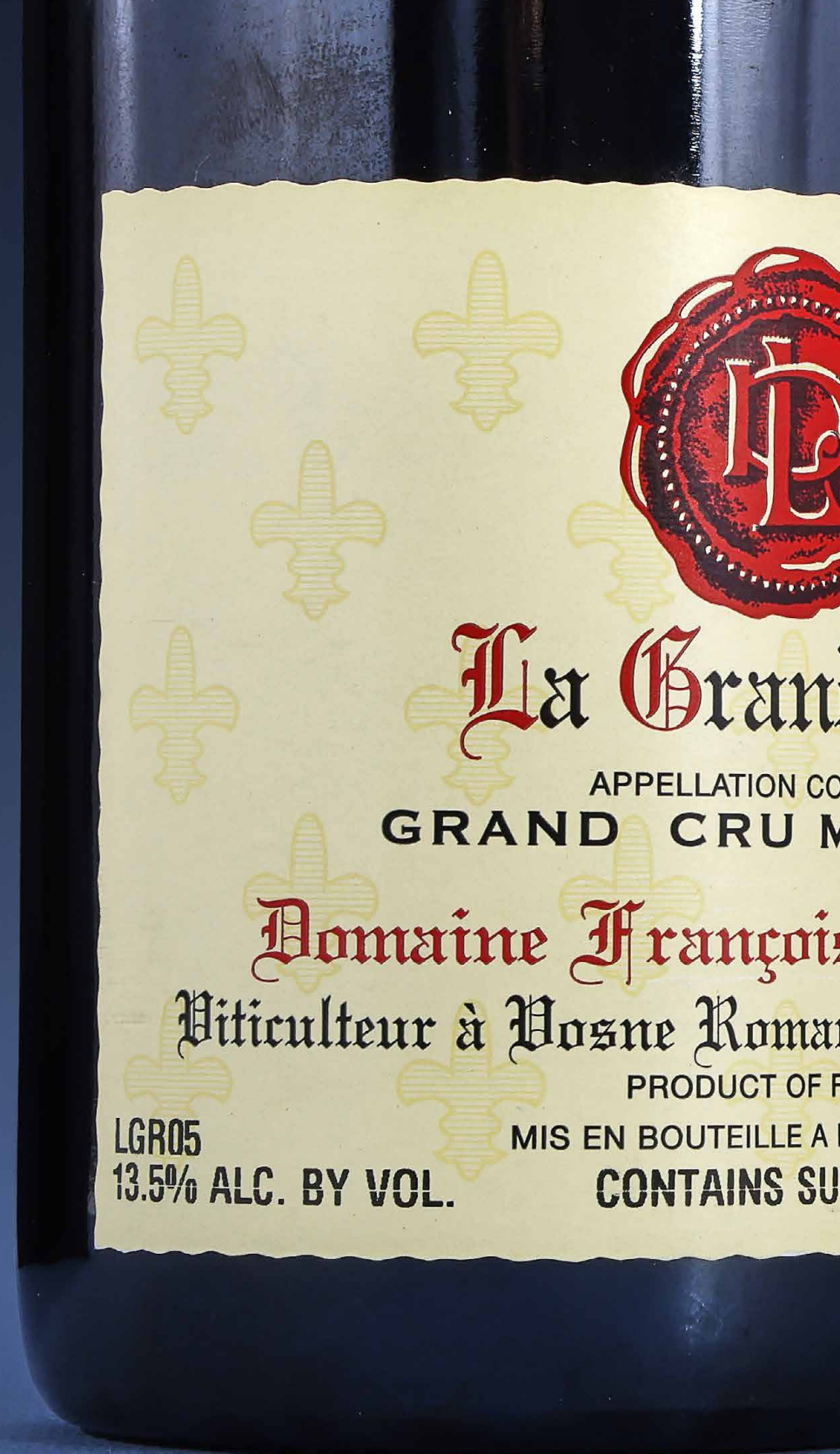
Lot 266 (part lot)