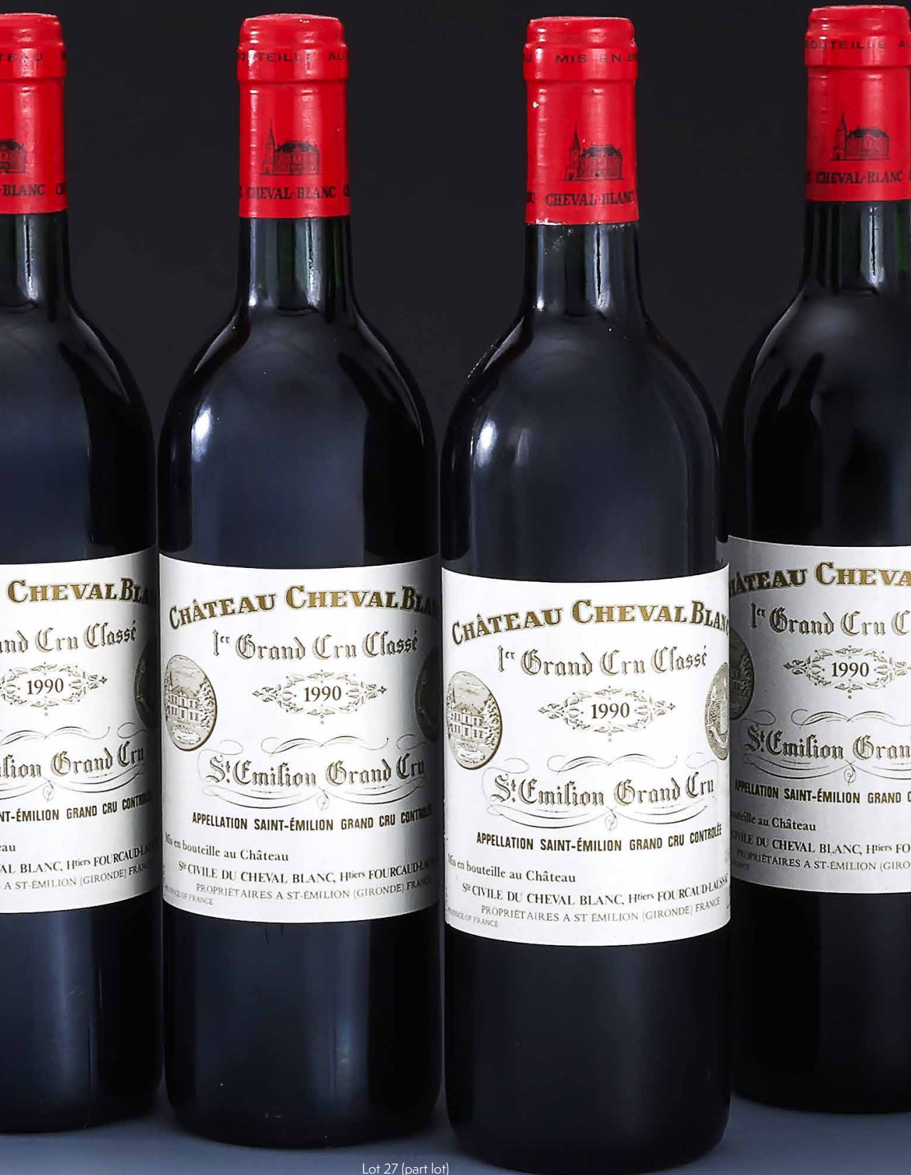
Lot 27 (part lot)

28 1993 Chateau Mouton Rothschild Premier Cru Classe, Pauillac 11x75cl