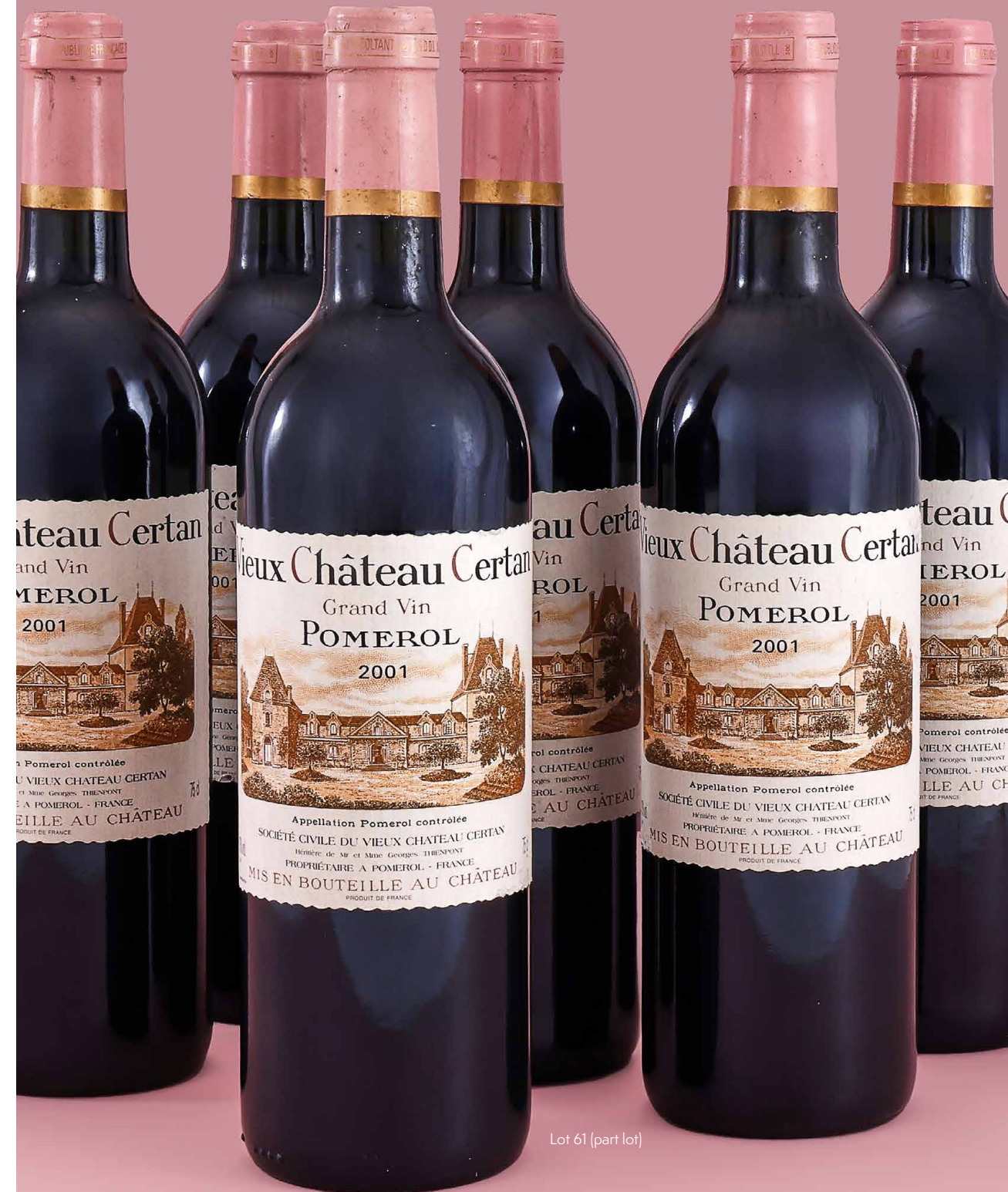
Lot 61 (part lot)