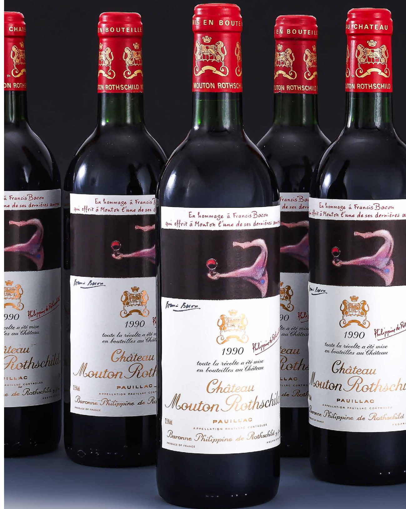
Lot 24 (part lot)