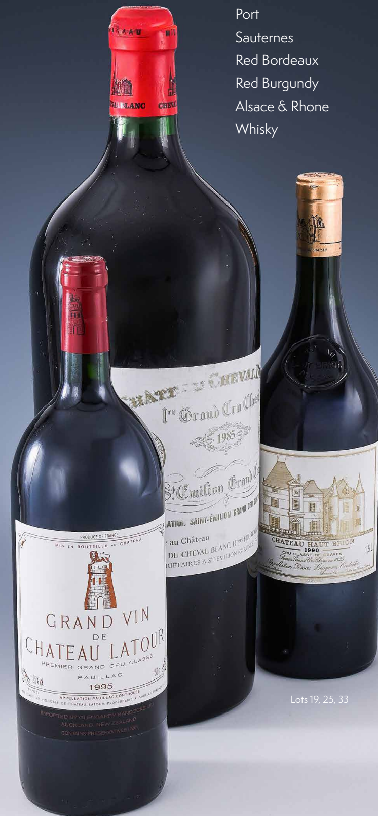
Lots 19, 25, 33