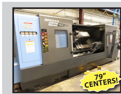
2018 DOOSAN 4100LMB

DIRECTIONS: In Tulsa, between Yale & Harvard, just south of 11th St. (Route 66) on Joplin Ave. SIGNS WILL BE POSTED.