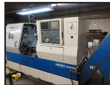
2004 PUMA 240L