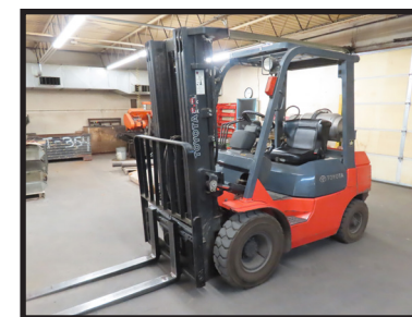
TOYOTA 5,000 LB