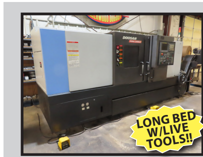
2010 DOOSAN 2600LM