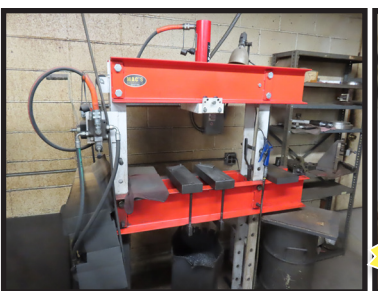
HYD. H-FRAME PRESS