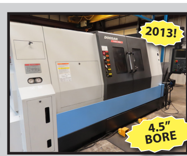
2013 DOOSAN 400MB