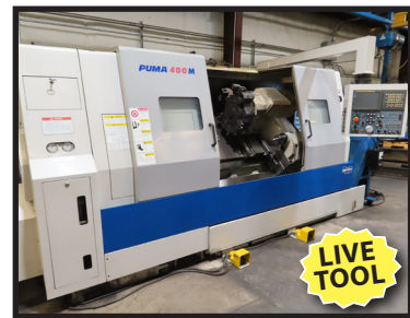
2007 DOOSAN 400MC