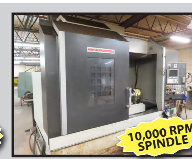
2007 DURAVERTICAL 5100