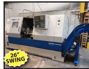
2006 DOOSAN 300MC