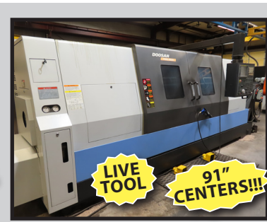
2007 DOOSAN 400LMC