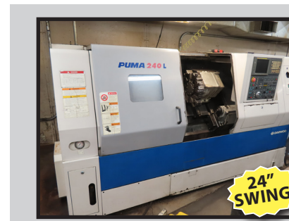
2004 PUMA 240L