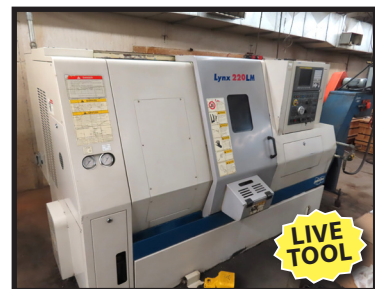
2007 LYNX 220LMA