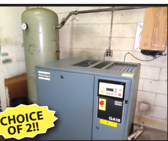
CHOICE OF 2!!