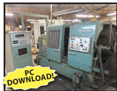
MORI SEIKI TL-3A