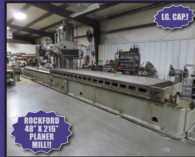
ROCKFORD 48" X 216" PLANER MILL!!

INSPECTION: MONDAY • APRIL 22 ND • 9:00AM-4:00PM