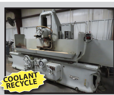
MATTISON 14.5" X 72"