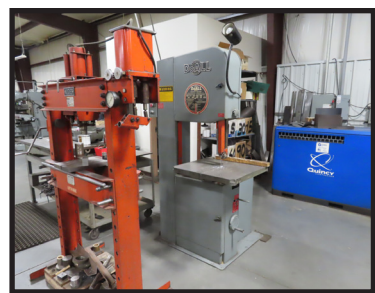
LOTS OF SUPPORT

TERMS: 15% buyer's premium - 18% buyers premium (ONLINE). A Deposit may be required. We accept cash, cashier's check, check with bank letter of guarantee, or wire transfer, FULL PAYMENT MUST BE MADE NO LATER THAN 24 HOURS OF WINNING BID. NO credit cards will be accepted! Sales tax will be charged without tax exemption in hand on sale day! ALL ITEMS MUST BE REMOVED BY WEDNESDAY, MAY 1ST, 2024 * 4:00PM. SEE COMPLETE TERMS AT DUCKWALLAUCTIONS.COM