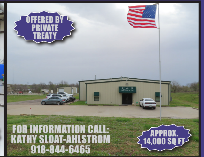
OFFERED BY PRIVATE TREATY