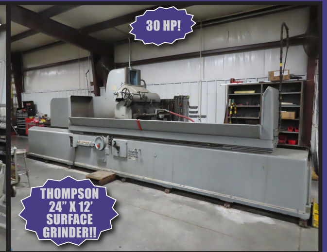
THOMPSON 24" X 12" SURFACE GRINDER!!