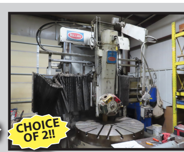
BULLARD 46" VTL'S