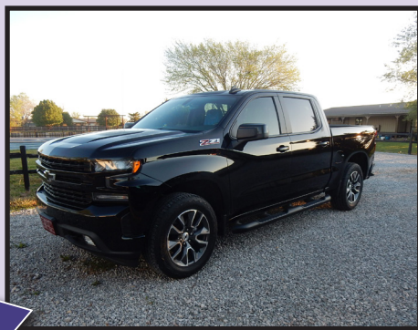
2019 CHEVY SILVERADO 1500 RST, 55,100 MILES, CREW, Z-71 4X4, SLIDING REAR GLASS.

FOR UPCOMING AUCTIONS SEE DUCKWALLAUCTIONS.COM