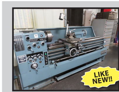
2021 KINGSTON HJ1700!!