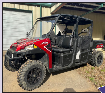
ATV PIC 2018 POLARIS XP1000, STREAT LEGAL & LOADED W/ACCESSORIES!!