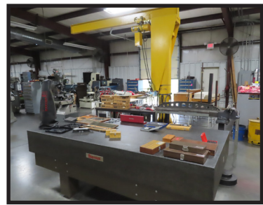
LOTS OF INSPECTION