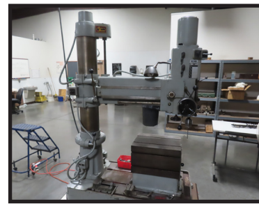
ARBOGA RADIAL DRILL