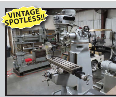
BRIDGEPORT ROUND RAM

YALE , M# GLC050VX, 5,000 LB. CAP, 2,248 HOURS, 60" FORKS, 3-SECTION LOW PROFILE MAST, SIDE SHIFT, HARD SURFACE TIRES, LPG