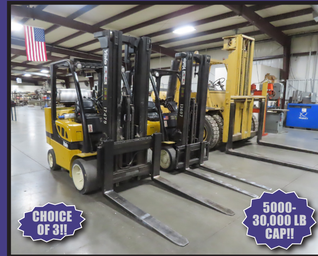
CHOICE OF 3!!