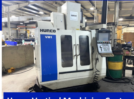
Hurco Vertical Machining Center