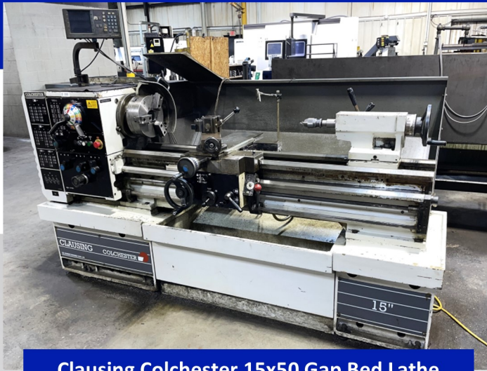
Clausing Colchester 15x50 Gap Bed Lathe