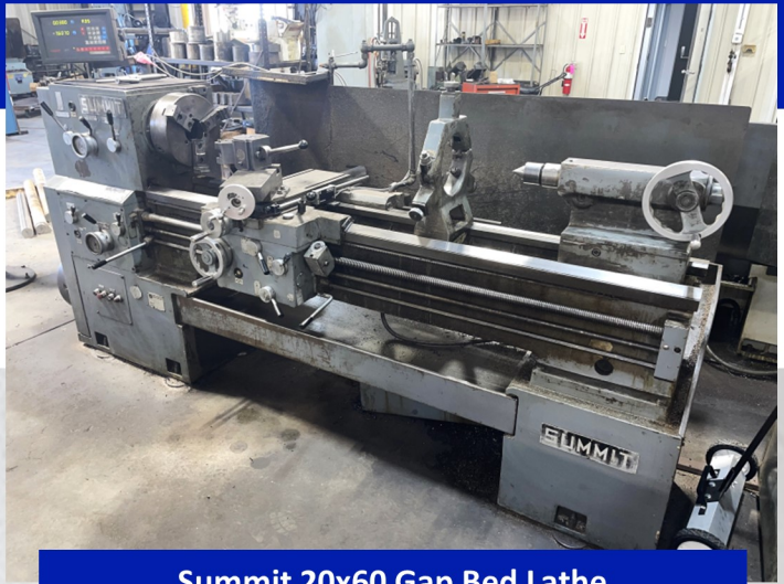
Summit 20x60 Gap Bed Lathe