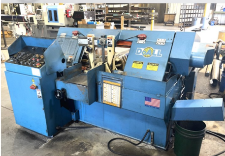
DoAll Horizontal Band Saw