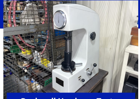
Rockwell Hardness Tester