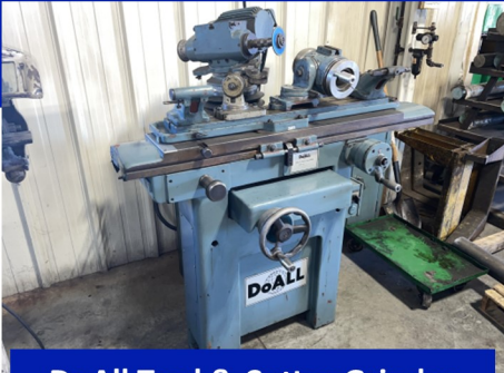
DoAll Tool & Cutter Grinder