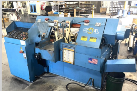
DoAll Horizontal Band Saw

Public Inspection • Monday, October 28th from 8:30am - 3:00pm