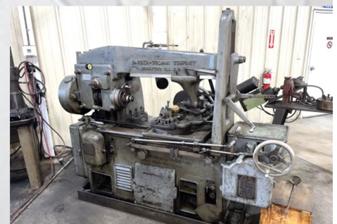
Barber-Colman Gear Hobber