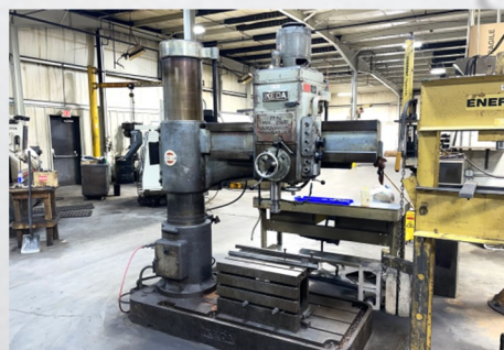
Ikeda RM1300 Radial Drill