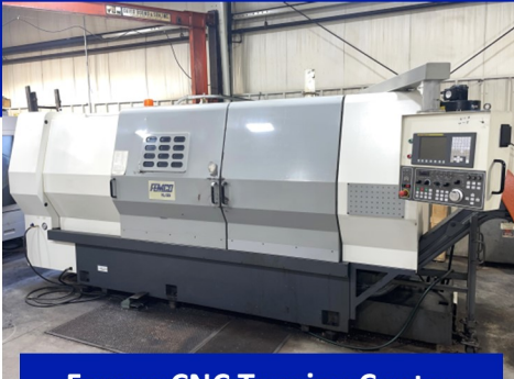
Femco CNC Turning Center