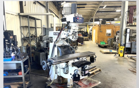
Vectrax Vertical Knee Mill