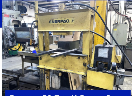
Enerpac 50-Ton H-Frame Press