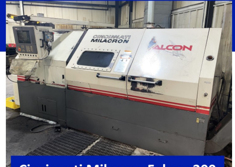
Cincinnati Milacron Falcon 300