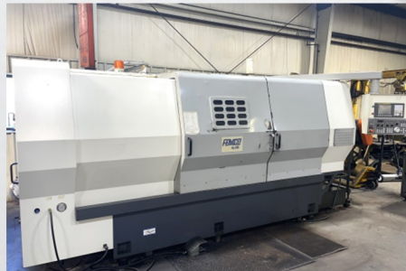
Femco CNC Turning Center