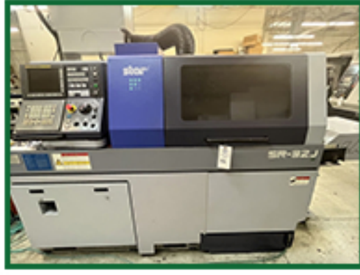
2018 Star SR-32J Type C, Fanuc 31i CNC