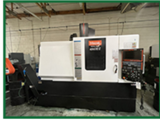
2010 Mazak Nexus 510C, Mazatrol Matrix CNC