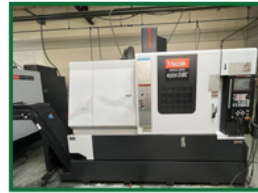
2006 Mazak Nexus 510C, Mazatrol 640M