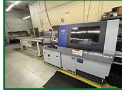
2021 Star SR-20RIV, Fanuc 31i CNC