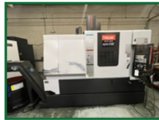
2006 Mazak Nexus 510C, Mazatrol 640M