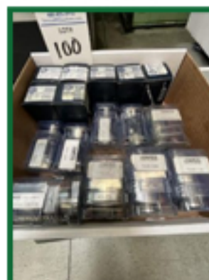
Hundreds of Collets Available