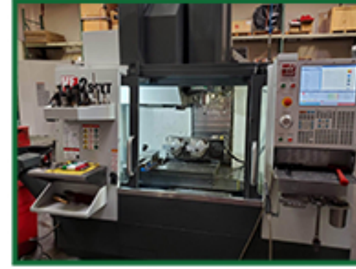
2020 Haas VF-2SSYT, CNC Vertical Machining Center