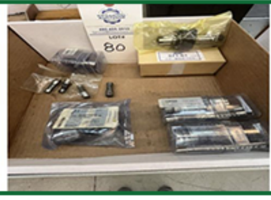
Multiple Lots of STAR Tooling Availalbe