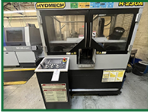
HYDMECH H-230A Bandsaw