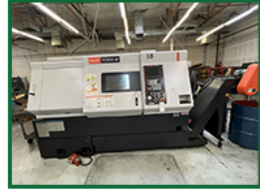
2005 Mazak Quick Turn Nexus 350, Mazatrol 640T Nexus Control