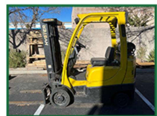
Hyster S50ST Forklift 4600

Pre-Auction Offers Invited For Major Assets