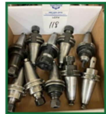
Dozens of Cat 40 Toolholders Availalbe