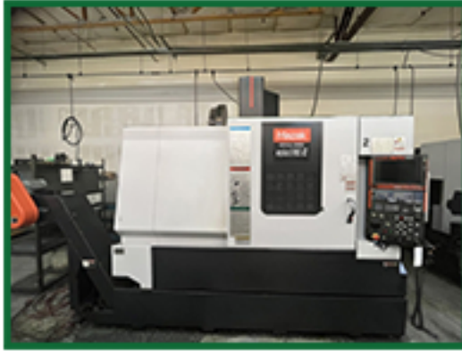
2007 Mazak Nexus 510C, Mazatrol Matrix CNC