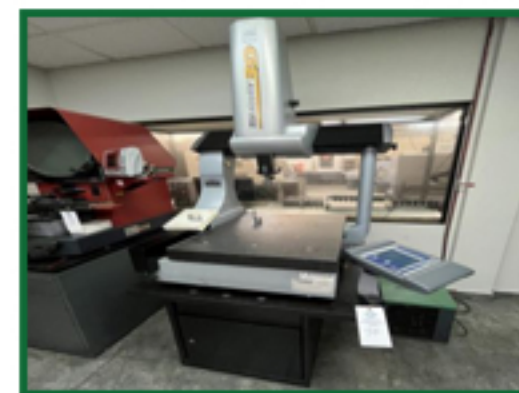
Tesa Micro-Hite 3D Measuring System