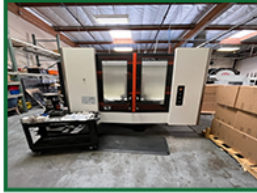
2021 Mazak HCN 4000, CNC Horizontal Machining Center