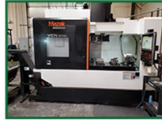
2020 Mazak VCN 570C, CNC Vertical Machining Center