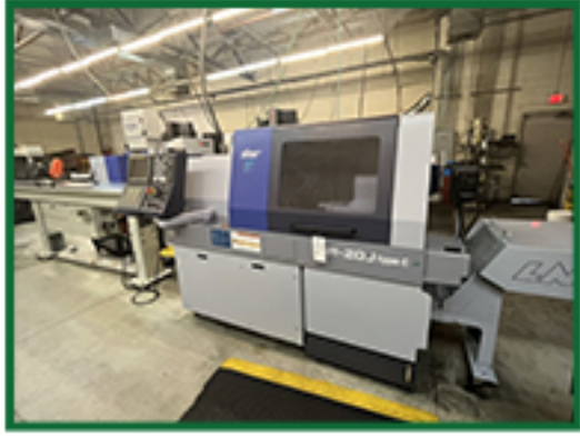
2019 Star SR-20J Type C, Fanuc 31i CNC

Please visit www.kdauctions.com for a complete list and bid online