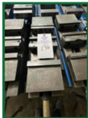
Over 25 Kurt Vices