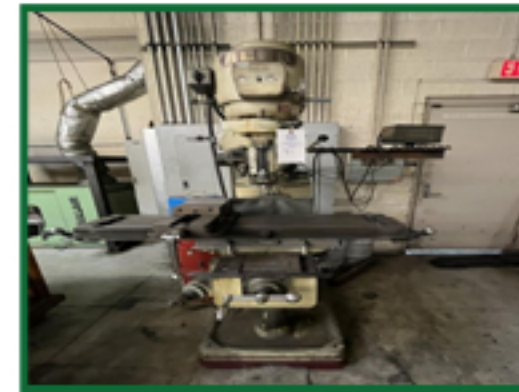
Acer Ultima Milling machine