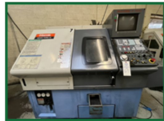
(3) Mazak QT-10, Mazatrol T-Plus Control