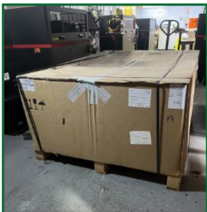
Gravograph LS1000XP 150-watt CO2 laser cutter system With Chiller