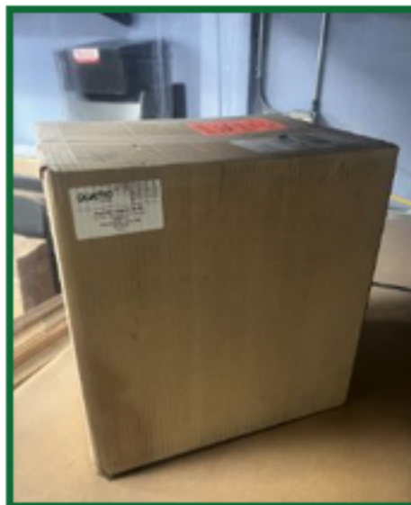
Gravograph IS400 Engraving Machine