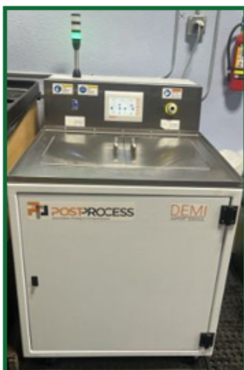
(2) PostProcess Tech. DEMI 800