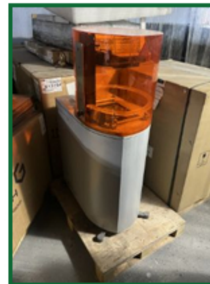
2017 EnvisionTEC Perfactory 4 LED Standard XL, DLP 3D Printer