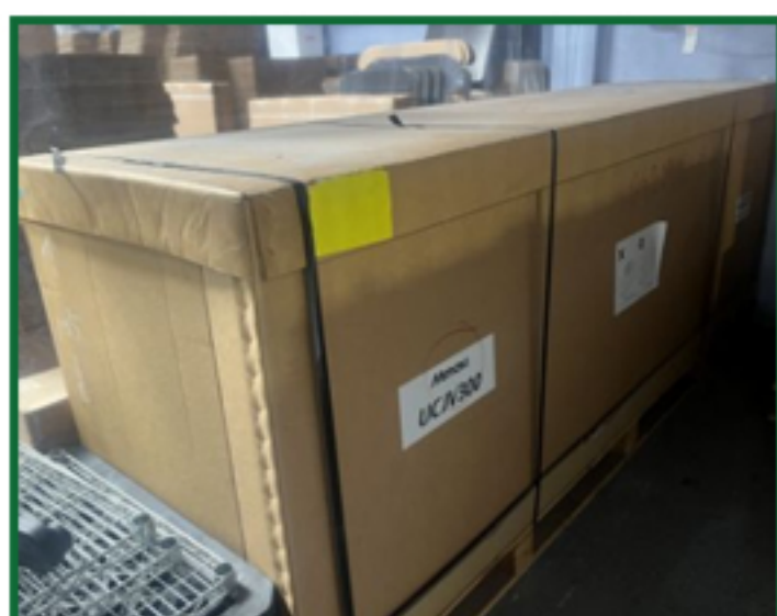
Mimaki UCJV300-107 UV LED 42", roll printer with inline cutter