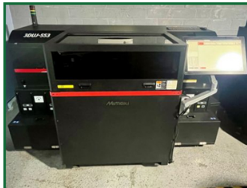
(10) Mimaki 3DUJ-553, 2020, 2019, 2018 & 2017