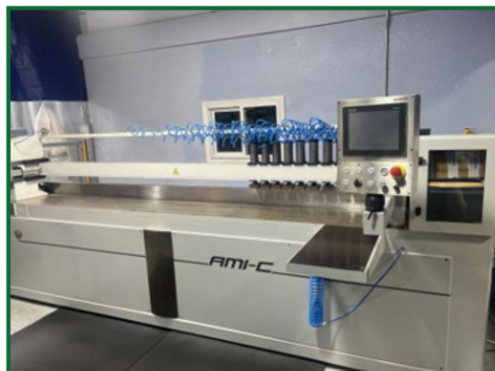
2022 Bermaq AMI-C 3100