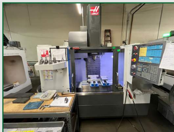
(3) Haas VF-2' Vertical Machining Centers