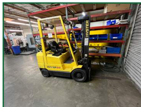
Hyster S50XM Forklift, 4,600 Lb HUNDREDS OF LOTS OF TOOLING