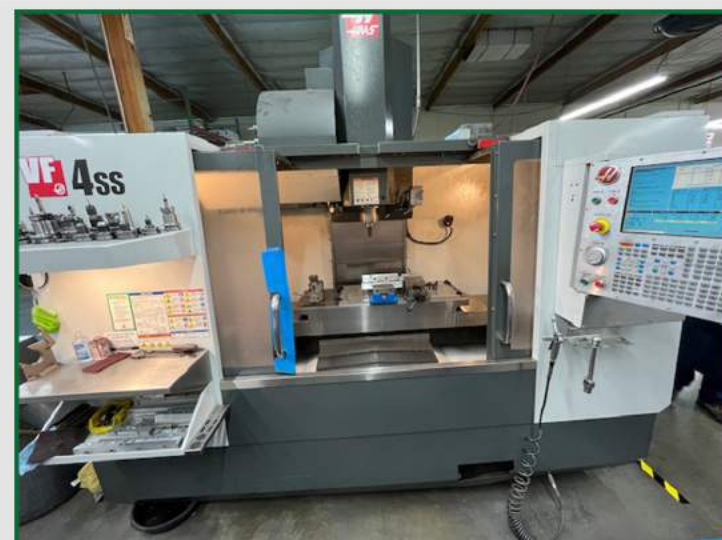
2011 Haas VF-4SS Vertical Machining Center

This brochure is only a partial listing. Please visit www.kdauctions.com for a complete list and bid online