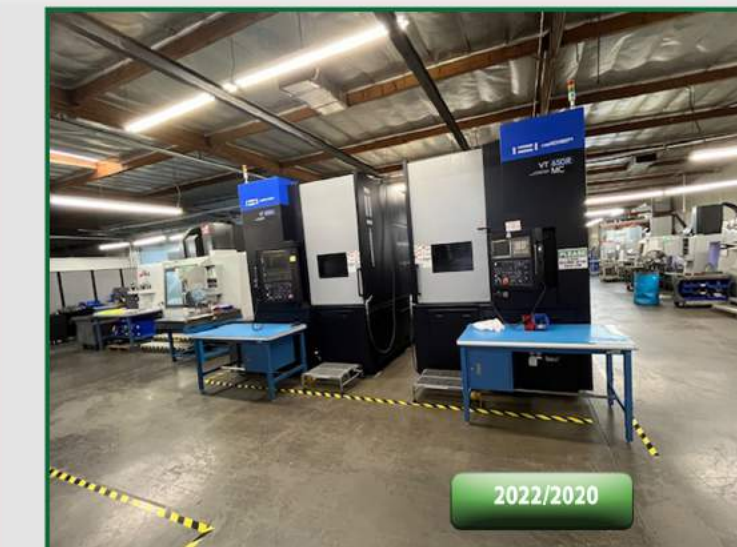
2022 & 2020 Hwacheon VT 650 VTL, Live Tooling!!!!