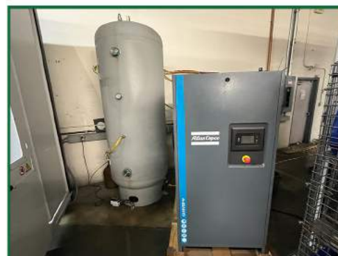
Atlas Copco GA18VSD + FF Compressor