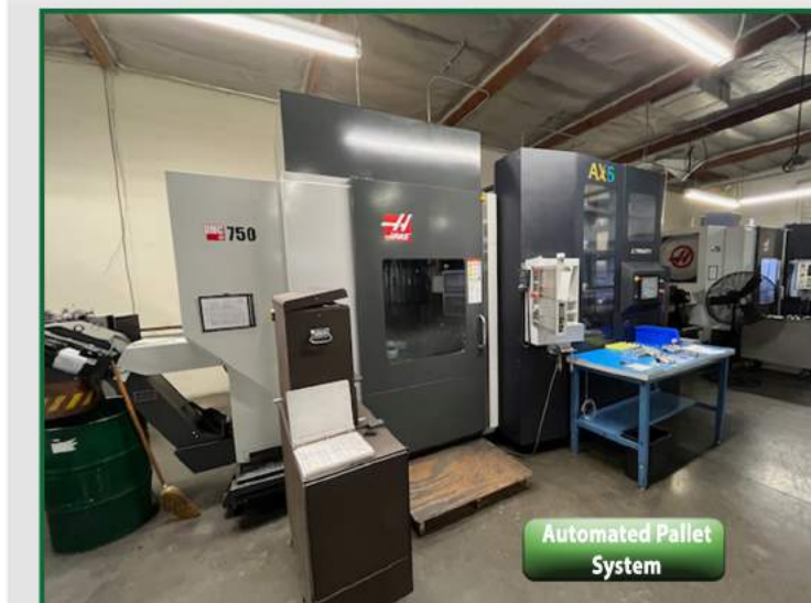
(2) Haas UMC 750 Horizontal Machining Center