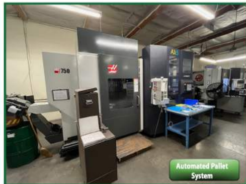
(2) Haas UMC 750 Horizontal Machining Center

Late Model CNC 5 Axis Horizontal/Vertical Machining Centers, CNC Turning Centers, VTLs, Inspection, Huge Assortment of CAT 40 and 50 Taper Tooling, Workolding, Welding and Testing Equipment, Material Handling and More!!!!