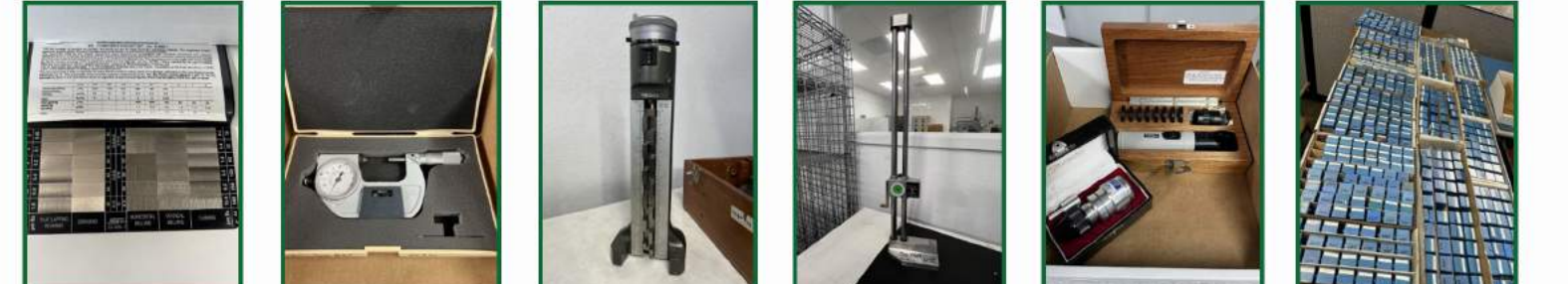
SPI 0-1" Super Micrometer SPI Composite Pocket Set Mitutoyo 1-2" Super Micrometer Mitutoyo 12" Precision Height Master Gage Aerospace Precision Height Gage 0-24" Fowler Peak Light Scale Lupe Large Lot of Various Size Deltronic Pin Gages Labeled