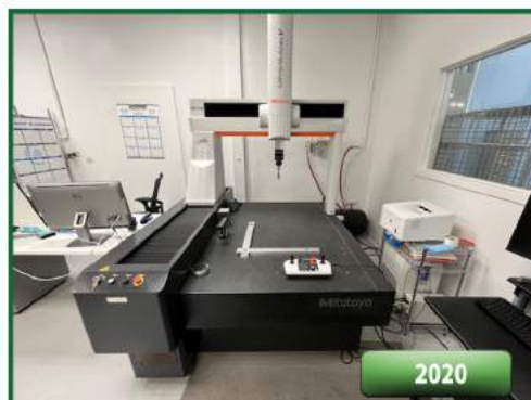
2020 Mitutoya CRYSTA-APEX V9106