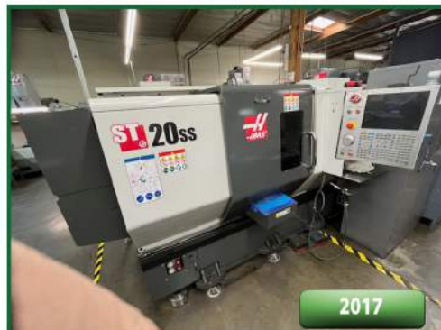
2017 Haas ST-20SS CNC Lathe