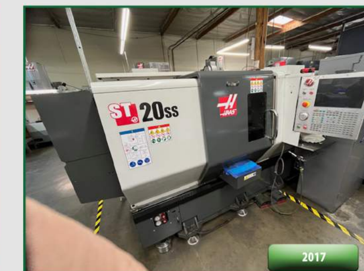
2017 Haas ST-20SS CNC Lathe