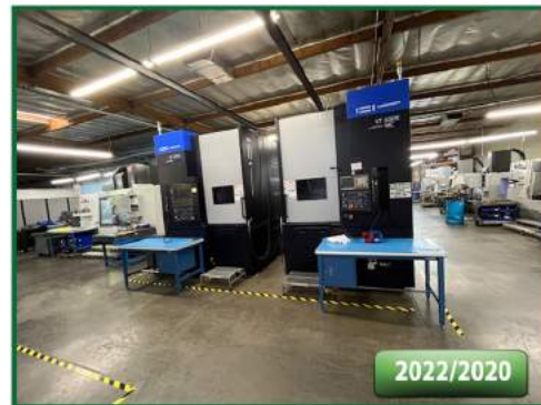
2022 & 2020 Hwacheon VT 650 VTL, Live Tooling!!!!