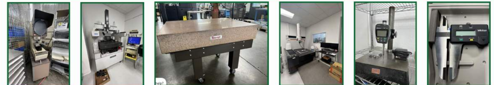
Mitutoyo Profile Projector PJ300 Mitutoyo AZZ Manuel CMM Renishaw PH1 Probe Starrett Crystal Pink Granite Surface Inspection Plate Mitutoyo CrystaApexV SMS Smart Measuring System Mitutoyo Digital Drop Dial Indicator on Inspection Stand Mitutoyo 0-24" Absolute Digimatic Caliper