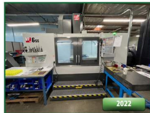
(2) Haas VF-6 Vertical Machining Centers as Late as 2022