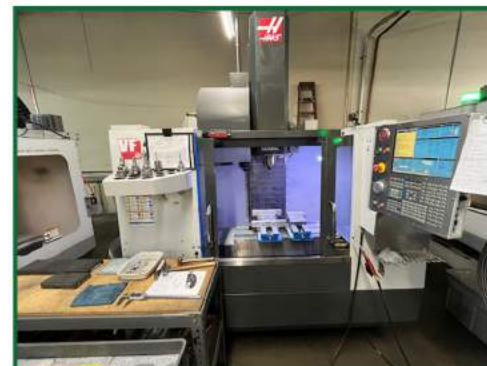
(3) Haas VF-2' Vertical Machining Centers