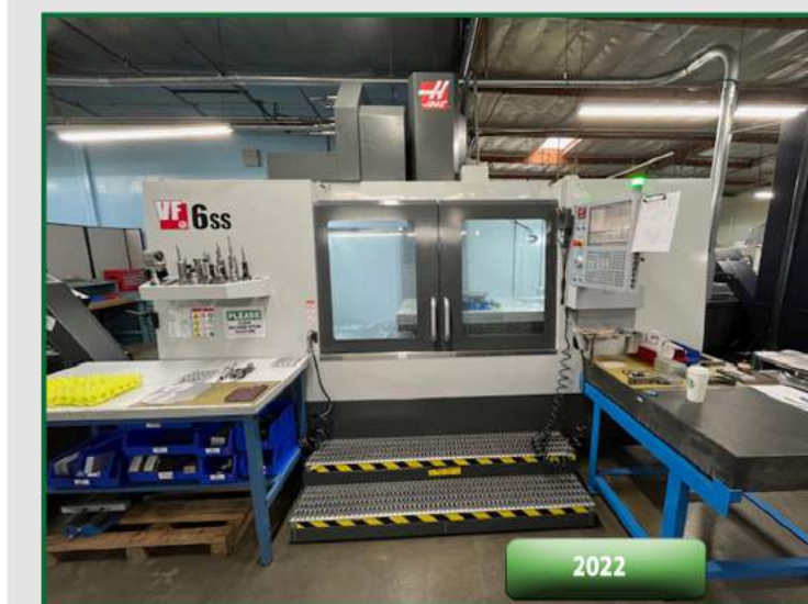
(2) Haas VF-6 Vertical Machining Centers as Late as 2022