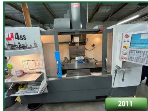
2011 Haas VF-4SS Vertical Machining Center