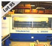
2002 TRUMATIC L2520 MODEL TLF 2000T