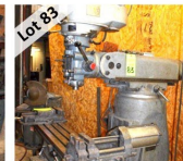
VICTOR KNEE MILL MODEL CD2V5