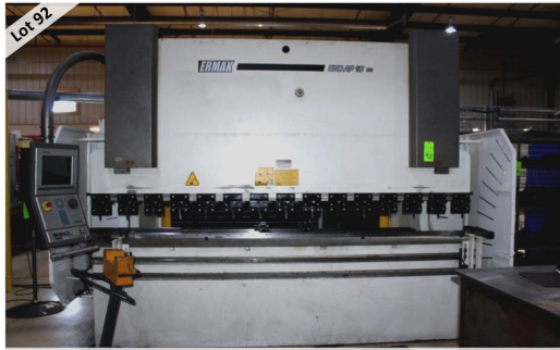
ERMAK CNC PRESS BRAKE MACHINE AP 10' 88 W/ DELEMDA-GGW TYPE CHAAP10X88 MODEL 2006