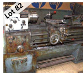
VICTOR MODEL 1640 ENGINE LATHE