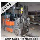
TOYOTA 4000LB. PROPANE FORKLIFT