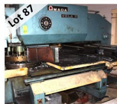
AMADA VELA II 30 TON CNC PUNCH PRESS