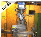
LINCOLN KNEE MILL MODEL 19X9