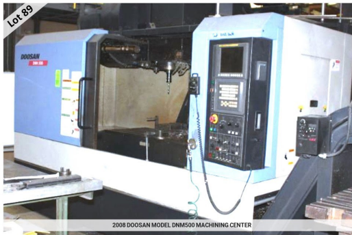
2008 DOOSAN MODEL DNM500 MACHINING CENTER

Metalworking Machinery, Gaging Equipment, Hand Tools, Tooling, MRO Material, Cutting Tools, Trumatic Laser, Router, Spot Press, Cutoff Saw, Band Saw, Surface Grinder, Press Brake and more!