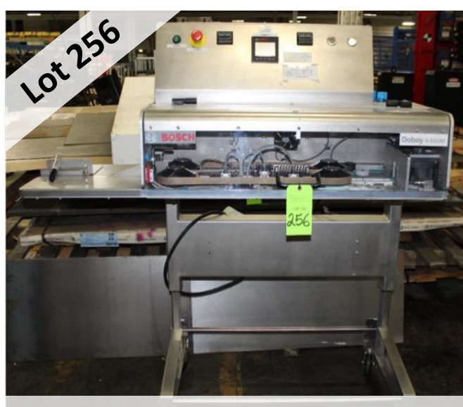
BOSCH B550-M MEDICAL BAND SEALER