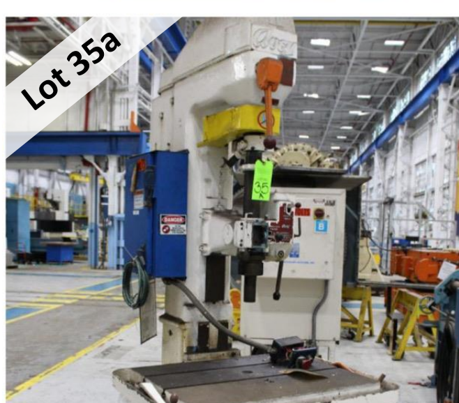
AVEY DRILL PRESS BMA-6