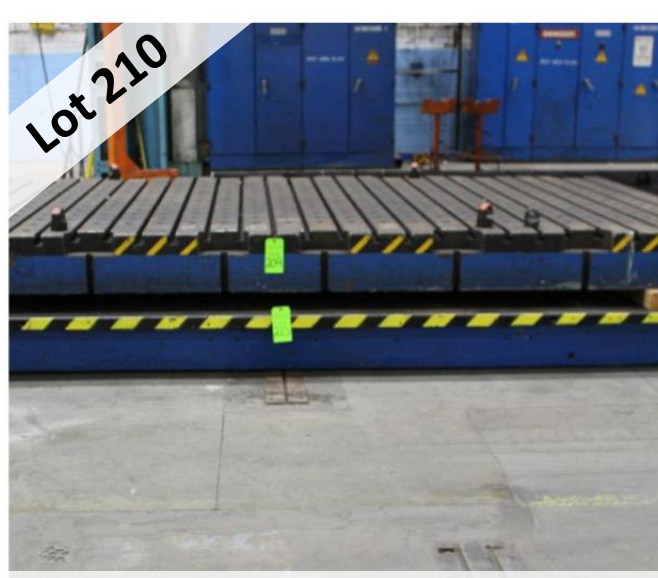
BOLSTER PLATE 168"X96"X12"