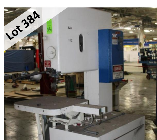
GROB 4V-24 VERTICAL BANDSAW