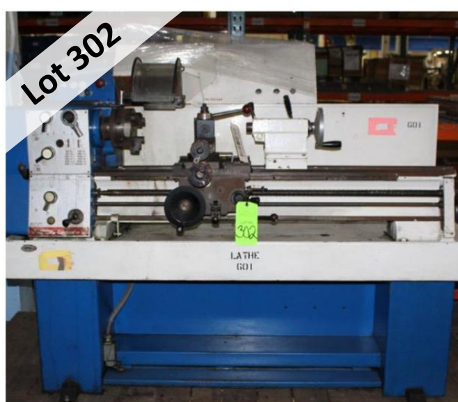
CLAUSING COLCHESTER 12" LATHE