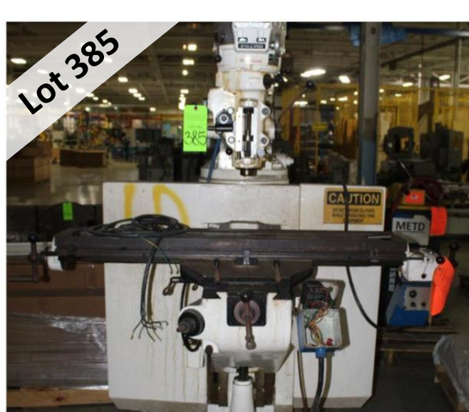
BRIDGEPORT MILLING MACHINE