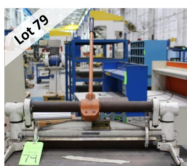
DI-ACRO SHEAR NO.24