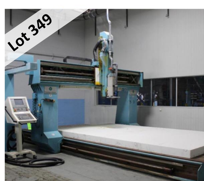
ZIMMERMAN FZ-20 MACHINING CENTER