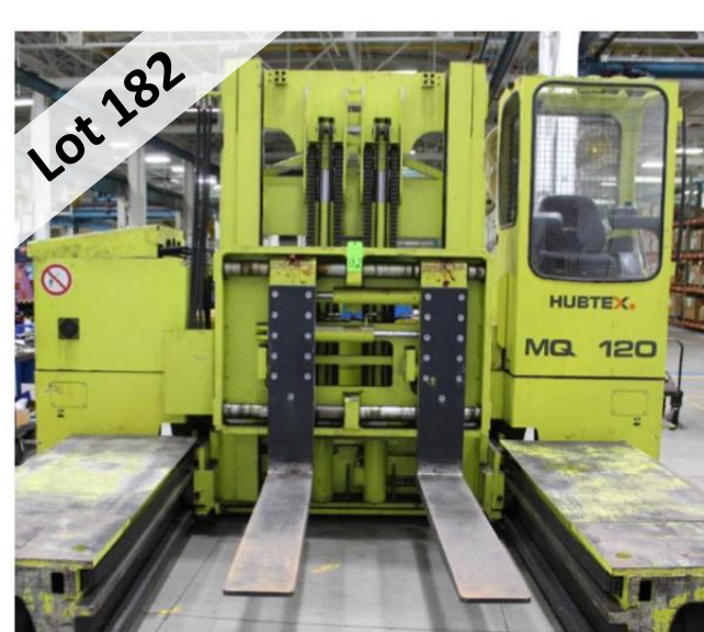
HUBTEX MQ120 SIDE LOADER FORKLIFT