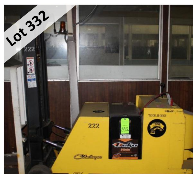
YALE 4000 LB. CAPACITY LIFT TRUCK