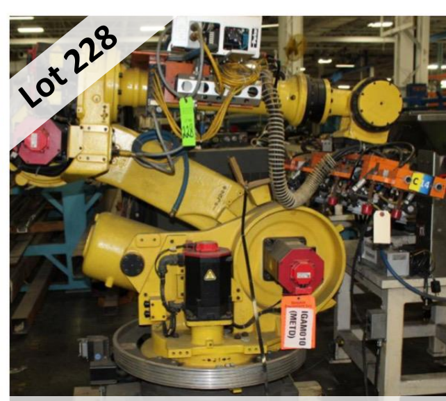
FANUC ROBOT R-2000 A/165F