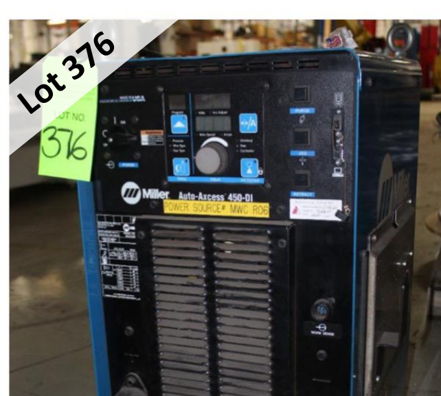
MILLER 450-DI POWER SOURCE