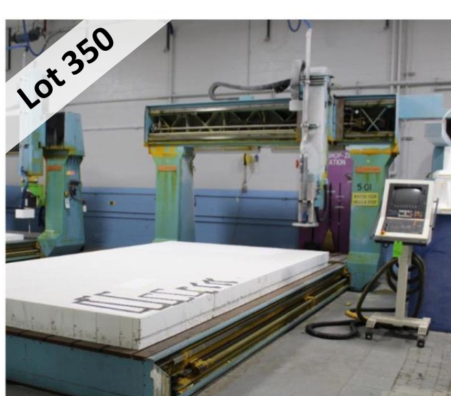
ZIMMERMAN FZ-30 MACHINING CENTER