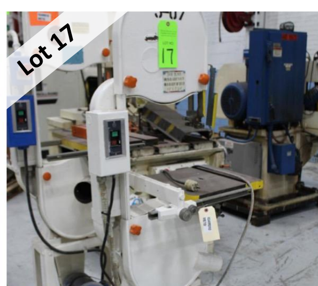
DELTA ROCKWELL VERTICAL BANDSAW