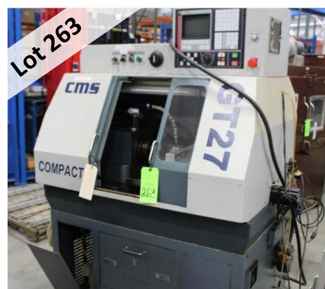
CMS COMPACT GT27 CNC LATHE