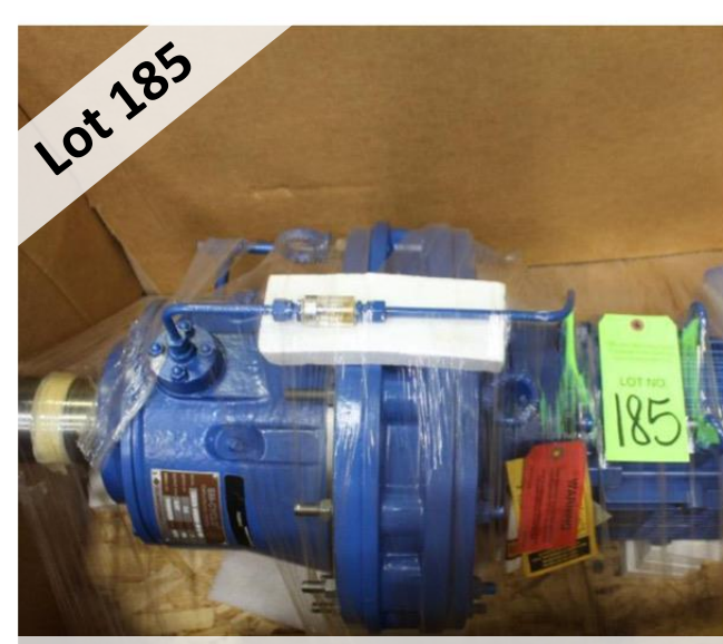
SUMITOMO SM-CYCLO MODE MOTOR