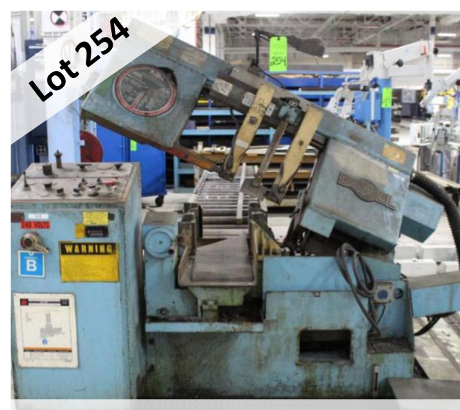
DO-ALL C260A HORIZONTAL BANDSAW