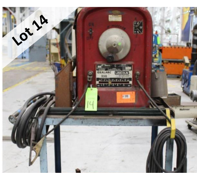
LINCOLN IDEALARC 250 ARC WELDER