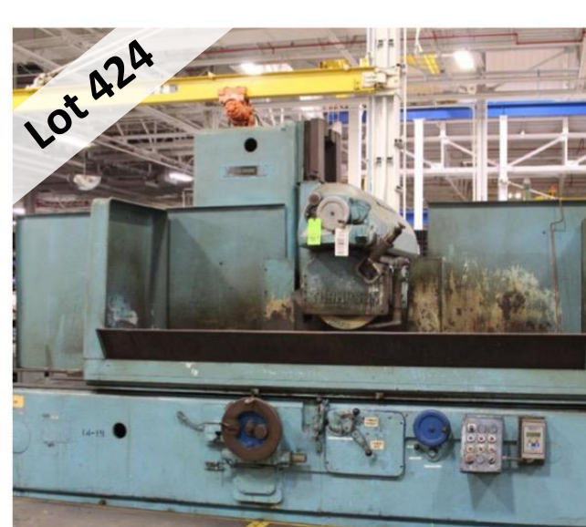
THOMPSON MODEL C SURFACE GRINDER