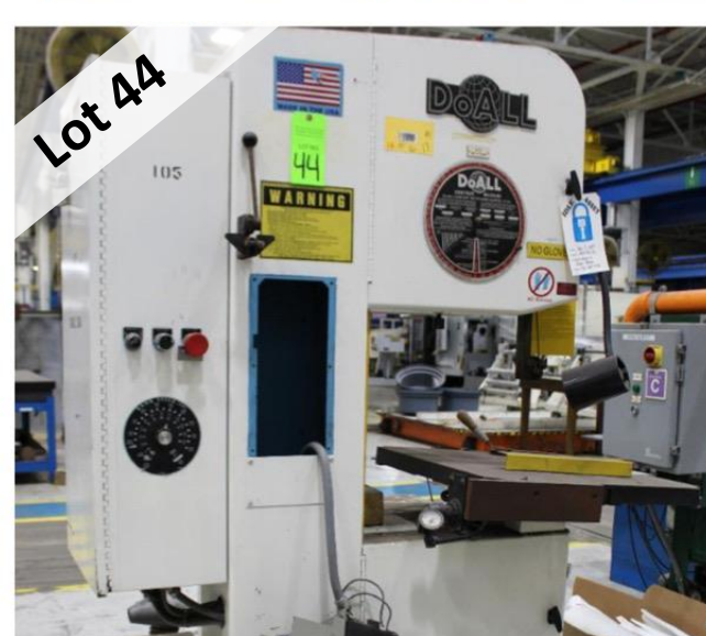
DO-ALL VERTICAL BANDSAW