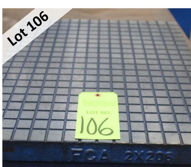
STEEL SURFACE PLATE 19"X24"