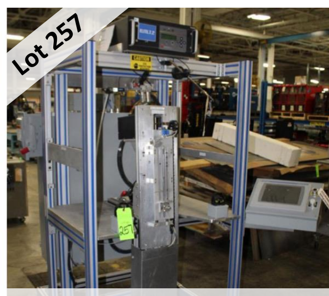
AMERITHERM INDUCTION WELDER