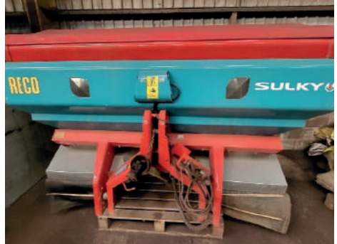
Reco Sulky X 36 Fertiliser Spreader (2008)