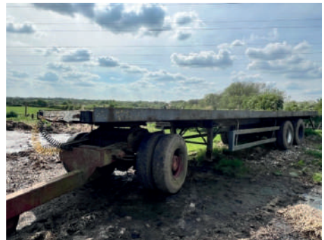
40ft artic low loader trailer with air brakes