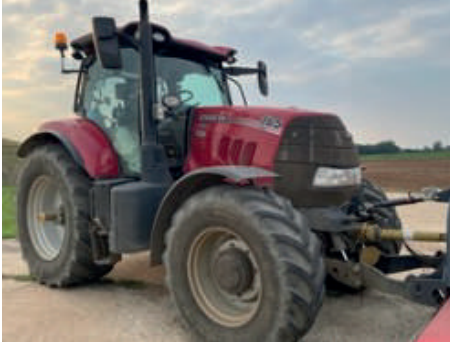
Case Puma 165 MC, 2019 Registered, only 3880 hours, Fr Linkage & PTO, 50K, Air Brakes, Fr & Cab suspension, Michelin 650/65R38 & 540/65R28 Tyres