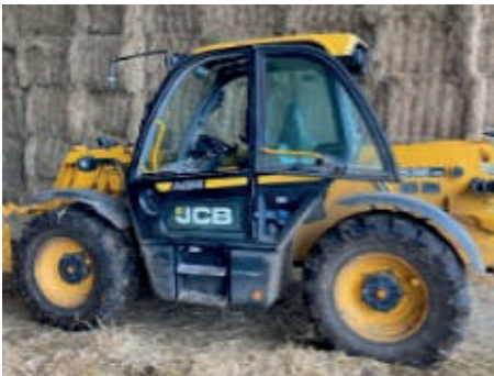
JCB 532-70 Agri Telehandler, Year 2020, only 3486 hours, A/C, PUH, Q-Fit Headstock cw Pallet Tines, 460/70R24 Tyres