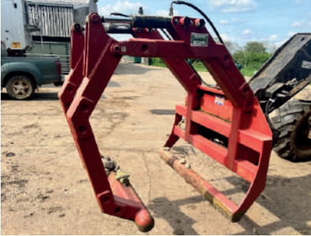
2011 Hall Bale Squeeze