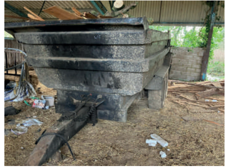
Twin axle hydraulic trailer