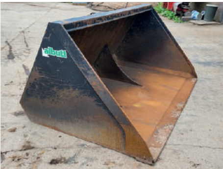
2.97m³ Albutt Grain Bucket with Merlo Fittings