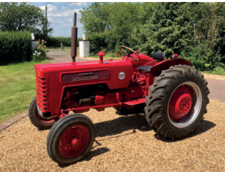
McCormick International B-275 Diesel Tractor, Original Owner & Operators Manual