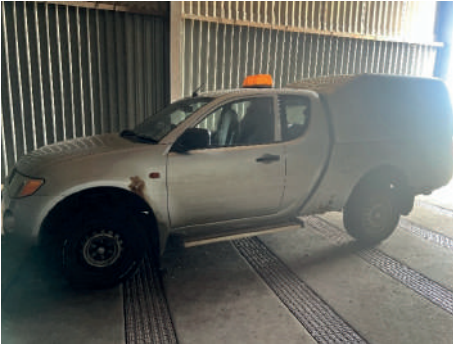
Mitsubishi L200 2 door, not taxed or MOT'd