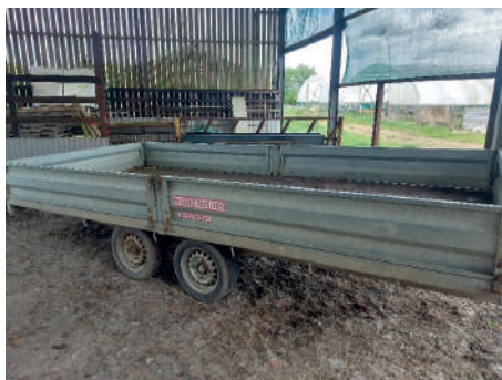
Wessex Trailer approx 14 x 6.5ft with mesh extensions