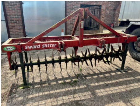
Opico Sward Slitter