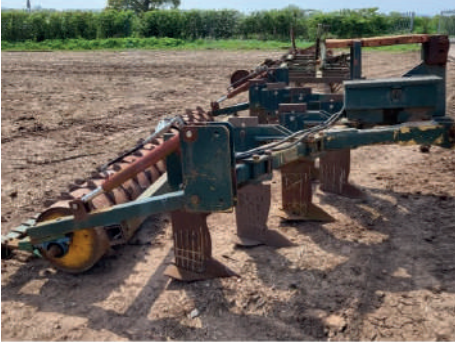
Cousins V-Form 3.5m 7 Leg Flat Lift Modified with Hydraulic Back Roll (age unknown)