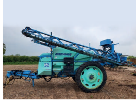
Berthoud Major 32 D.P. Tronic 24m Trailed Sprayer- 2002. NSTS Expired