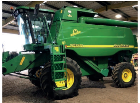
JD 9780 CTS HillMaster combine, 2004 Registered, 2861 & 3886 Hours, 25FT Header + Trolley cw Chopper & Chaff Spreader 800/65R32 Tyres