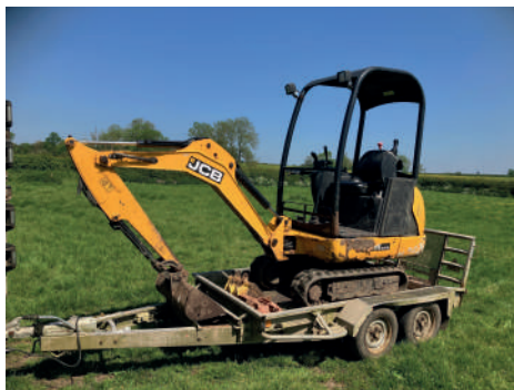
2014 JCB 8014 CTS 1.5T Mini Digger with 3 buckets. 1375 Hours & Bradley Plant trailer with ramp