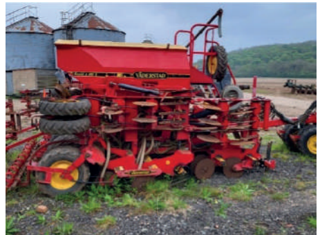
Vaderstad Rapid A400s 4m Disc Drill with Packer (2003)