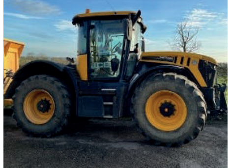
JCB 4220 Fastrac, Year 2018, 4832 hours, 60k, Air Brakes, Front Linkage & PTO