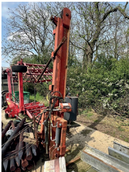
Multec tractor mounted post knocker (little use)