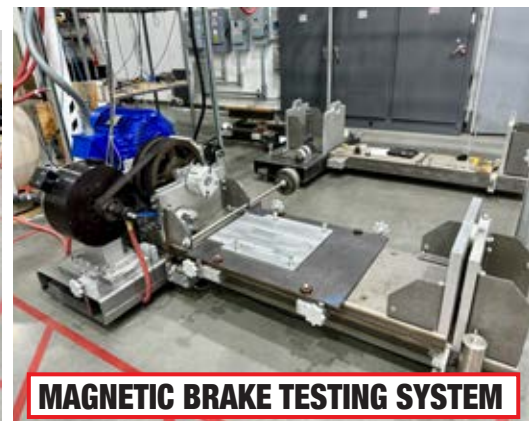
MAGNETIC BRAKE TESTING SYSTEM