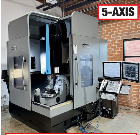
PURCHASED NEW FROM MACHINERY SALES CO., DELIVERED 12/7/2022

LOCATION: 1661 EAST FRANKLIN AVENUE, EL SEGUNDO, CA 90245