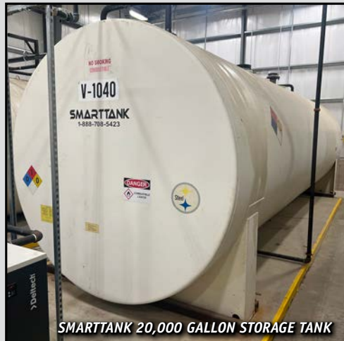
SMARTTANK 20,000 GALLON STORAGE TANK