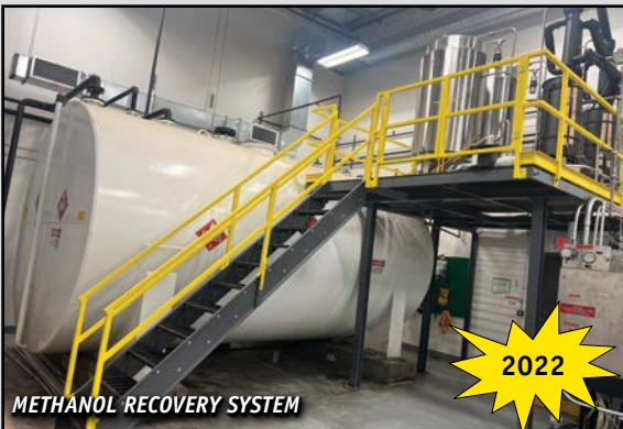
METHANOL RECOVERY SYSTEM