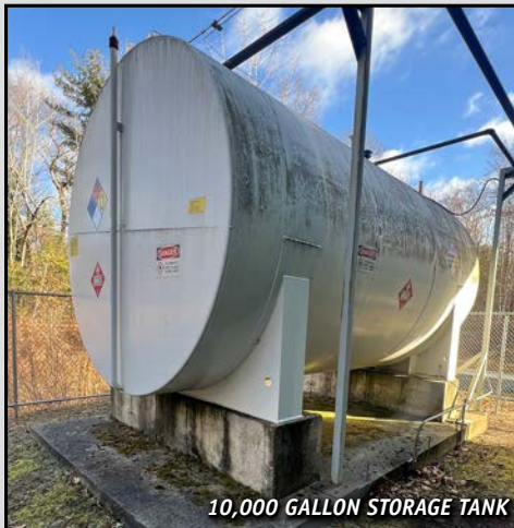
10,000 GALLON STORAGE TANK