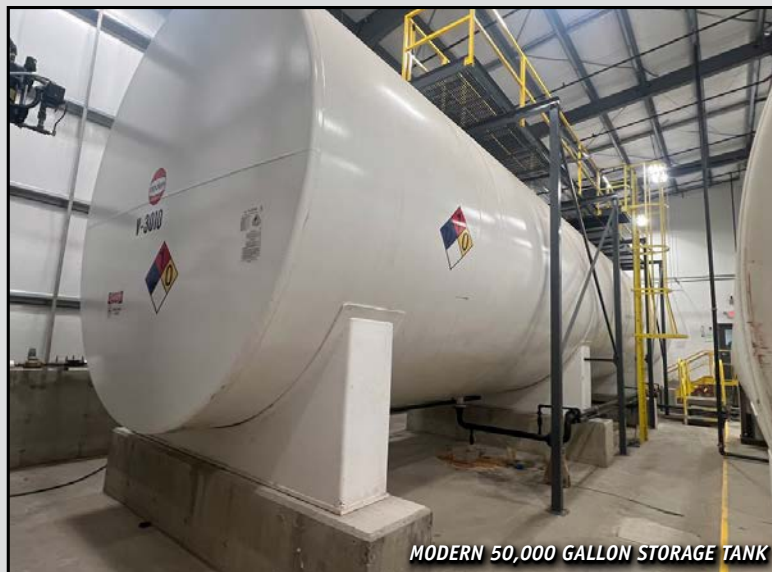
MODERN 50,000 GALLON STORAGE TANK