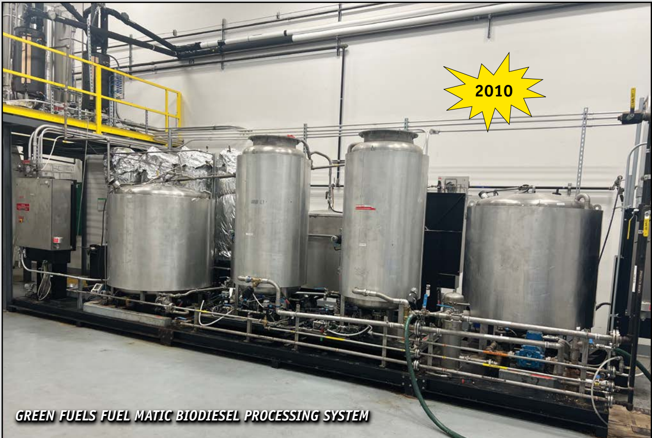
GREEN FUELS FUEL MATIC BIODIESEL PROCESSING SYSTEM

& MORNING OF SALE – 8:30 A.M. TO 11:00 A.M. OR UPON REQUEST