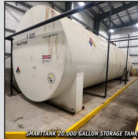
SMARTTANK 20,000 GALLON STORAGE TANK