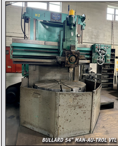
BULLARD 54" MAN-AU-TROL VTL