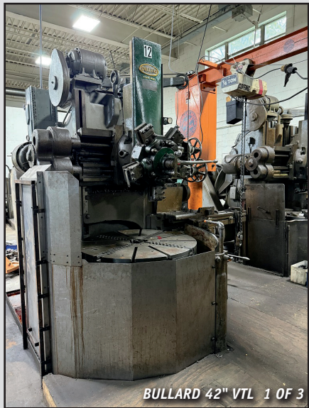
BULLARD 42" VTL 1 OF 3