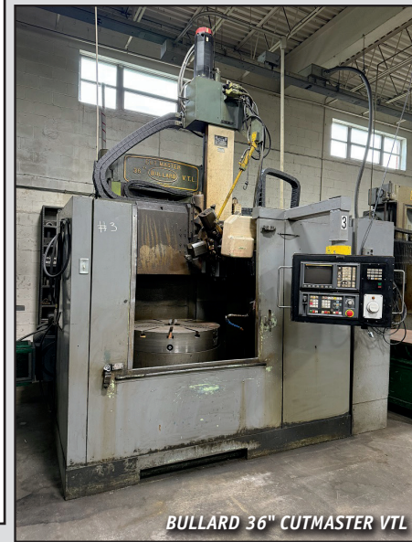
BULLARD 36" CUTMASTER VTL