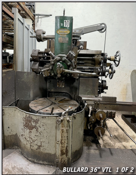
BULLARD 36" VTL 1 OF 2