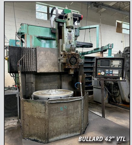
BULLARD 42" VTL