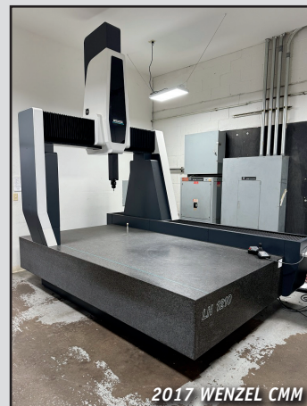
2017 WENZEL CMM