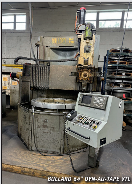
BULLARD 64" DYN-AU-TAPE VTL