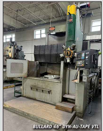
BULLARD 46" DYN-AU-TAPE VTL

TERMS OF SALE: 25% DEPOSIT CASH, WIRE TRANSFER OR CERTIFIED CHECK 15% BUYERS PREMIUM APPLIES ON ALL ONSITE PURCHASES 18% BUYERS PREMIUM APPLIES ON ALL ONLINE PURCHASES OTHER TERMS TO BE ANNOUNCED AT TIME OF SALE