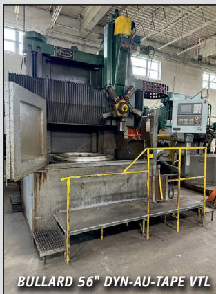
BULLARD 56" DYN-AU-TAPE VTL