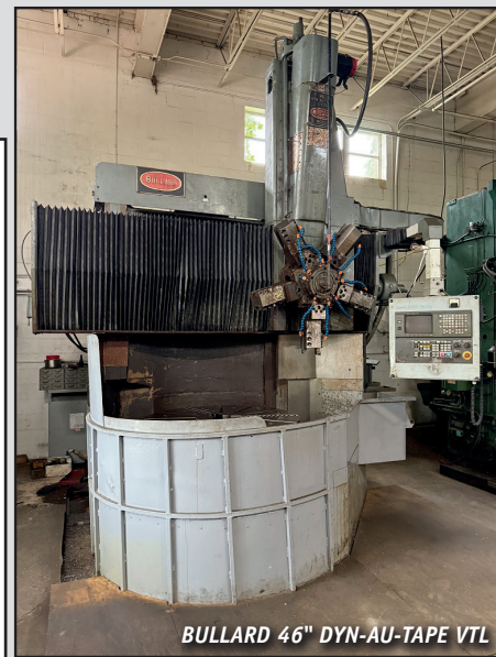
BULLARD 46" DYN-AU-TAPE VTL