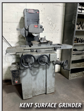
KENT SURFACE GRINDER