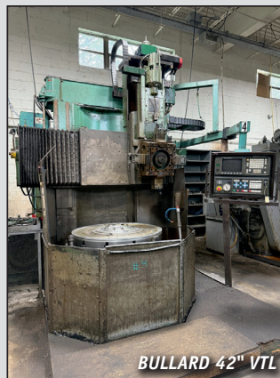
BULLARD 42" VTL