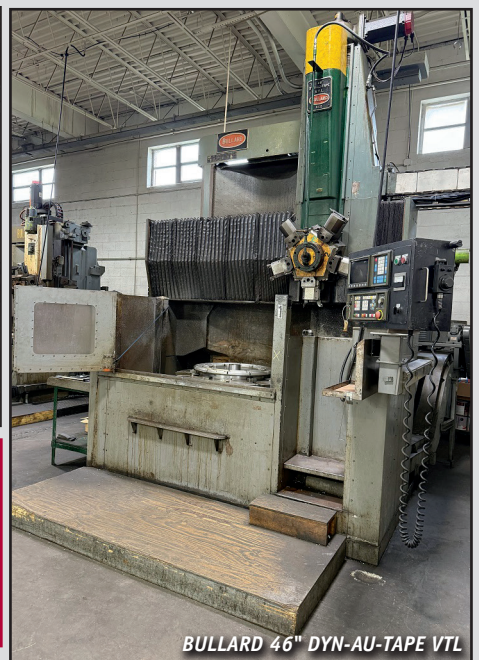
BULLARD 46" DYN-AU-TAPE VTL