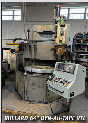
BULLARD 64" DYN-AU-TAPE VTL