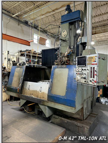
O-M 42" TML-10N ATL

THE INFORMATION DESCRIBED IN THIS BROCHURE IS CORRECT TO THE BEST OF OUR KNOWLEDGE BUT WE CANNOT GUARANTEE SAME. IT IS FOR THIS REASON THAT BUYERS SHOULD AVAIL THEMSELVES OF THE OPPORTUNITY FOR INSPECTION PRIOR TO THE SALE.