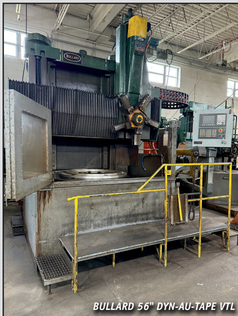
BULLARD 56" DYN-AU-TAPE VTL