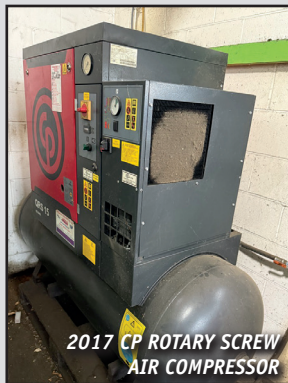
2017 CP ROTARY SCREW AIR COMPRESSOR