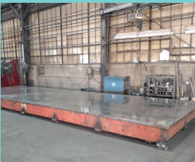
STEEL WELD TABLES, 9.8" W X 29" LONG X 2" THICK. MULTIPLE TO CHOOSE FROM