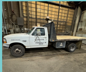
FORD F SERIES DIESEL, DUAL WHEEL STAKE TRUCK, 1997

ANOTHER AUCTION BROUGHT TO YOU BY AMG AUCTIONS • APPRAISALS • LIQUIDATIONS • CONSIGNMENTS