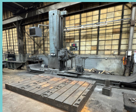
CINCINNATI GILBERT FLOOR TYPE "T" HORZ. BORING MILL, 144" X 96"