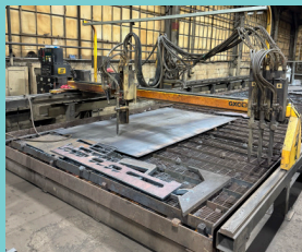
ESAB MODEL GXC-FALCON GANTRY SHAPE CUTTER .56" TABLE

Location: 1975 Hilton Rd. • Ferndale, MI 48220