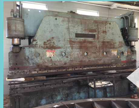
300 TON CINCINNATI HYD 16' PRESS BRAKE