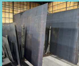
LARGE ASSORTMENT OF STEEL PLATE AND TUBING