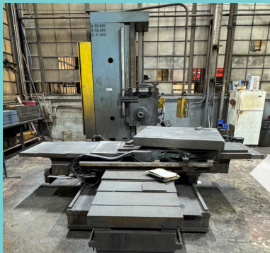
3.9" KURAKI HBM ROTARY TABLE

CUSTOM STEEL FABRICATIONS • FLAME CUTTING • WELDING • TOOLROOM MARVEL VERT SAWS • BRIDGEPORTS LATHES • LARGE ASSORTMENT OF STEEL SHOP SUPPORT • ROLLING STOCK • BORING MILLS