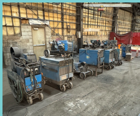
MULTIPLE PORTABLE MILLER WELDERS