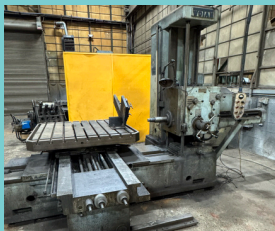
3" WOTAN HBM, 3 AXIS DRO. 55" X 55" ROTARY