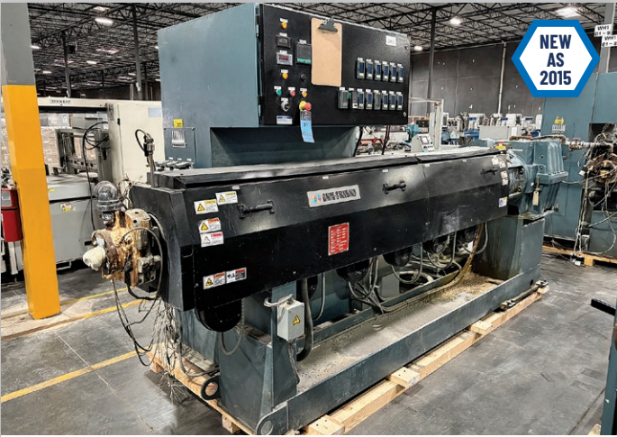
(2) 3.5" Davis-Standard Super Blue 3.5 Single Screw Extruders