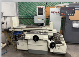
Late Model Very Clean Toolroom Machinery