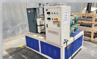
Kiwex Dual Lane Puller