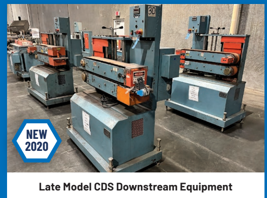
Late Model CDS Downstream Equipment