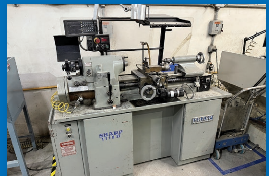
Very Clean Toolroom Machinery