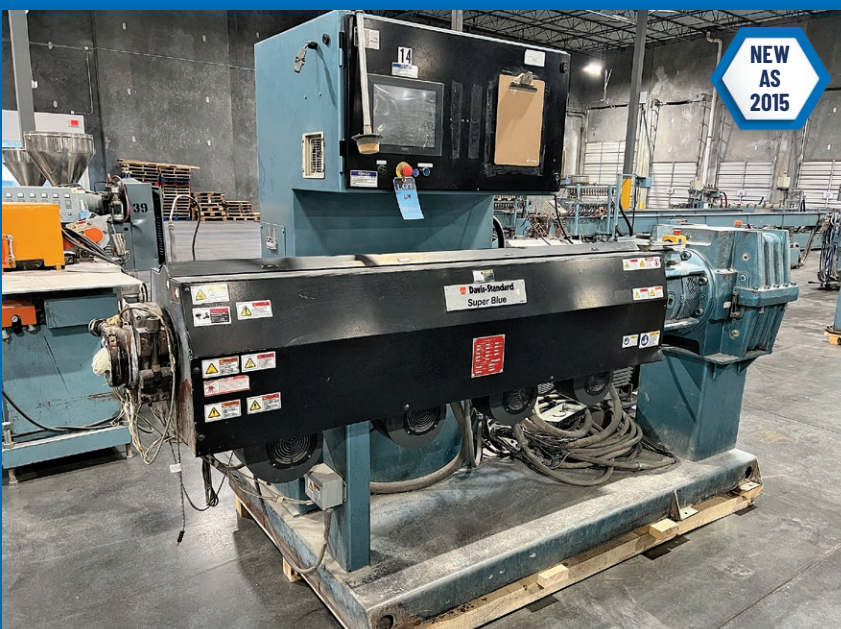
75-MM and 2.5" Davis-Standard Single Screw Extruders w/ Co-Extruders