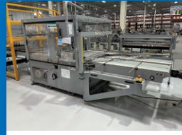
Texwrap Packaging Lines