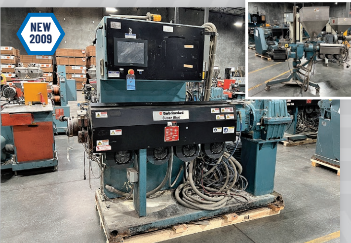
(4) 2.5" Davis-Standard Super Blue 250 Single Screw Extruders