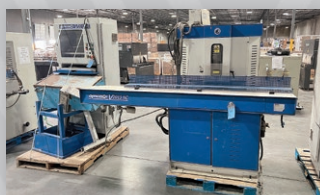
OMGA CNC Mitre Saws