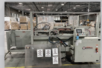
Marq Case Sealer