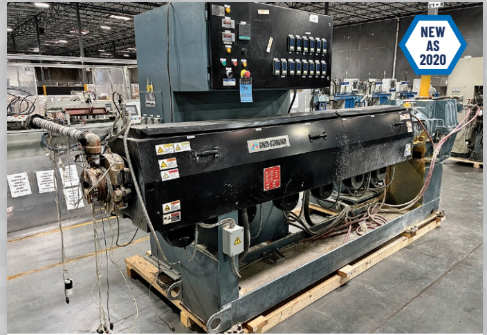
(5) 100-MM Davis-Standard Super Blue 100 Single Screw Extruders