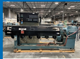
(13) Davis Extruders