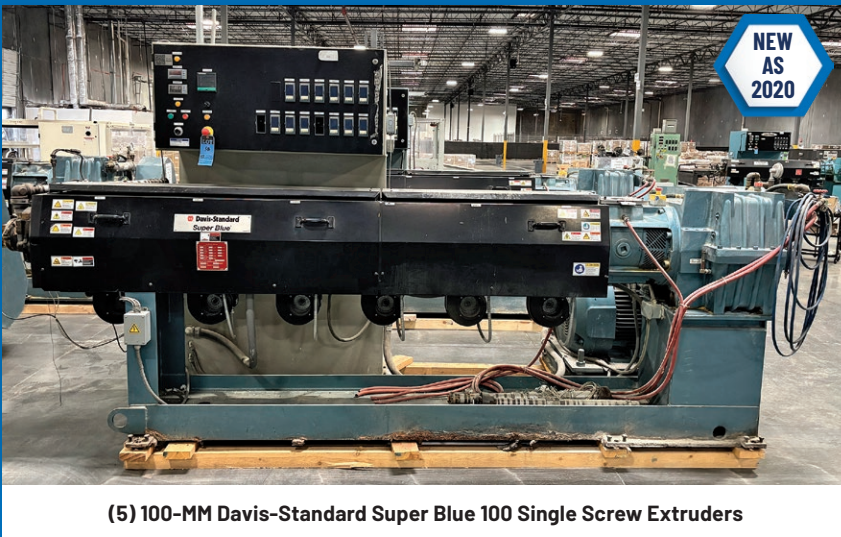
(5) 100-MM Davis-Standard Super Blue 100 Single Screw Extruders

INSPECTION: Day prior to Auction from 10:00AM to 4:00 PM or by appointment with jeffjr@cia-industrial.com