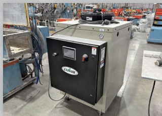
Conair Portable Chillers