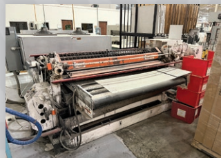
Black Bros. Roll Coater