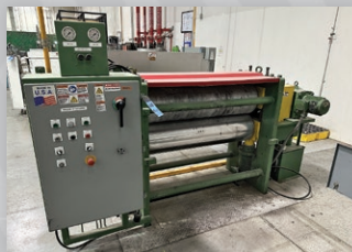
Eastern Engraving Embossing Roll