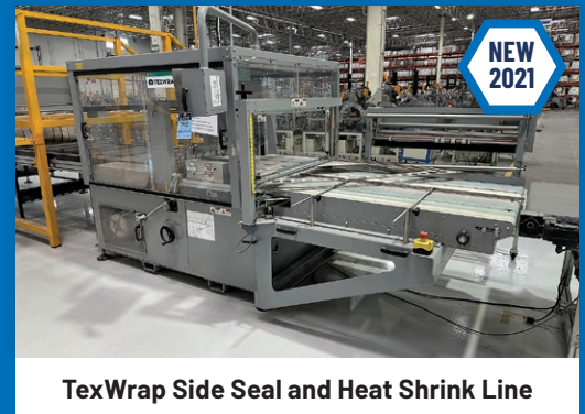
TexWrap Side Seal and Heat Shrink Line