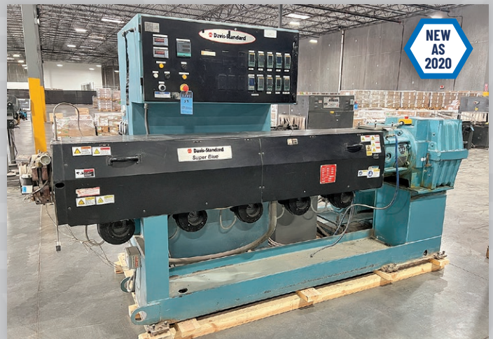
(5) 100-MM Davis-Standard Super Blue 100 Single Screw Extruders