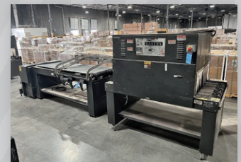
Eastey Shrink Tunnels