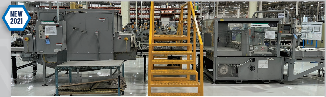
TexWrap 3618ISSR Seal and Heat Shrink Line

ALL EQUIPMENT WILL BE MOVED TO WAREHOUSE IN EL PASO, TEXAS FOR THIS AUCTION