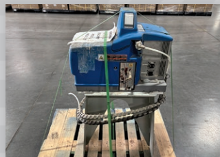
Nordson Glue Systems