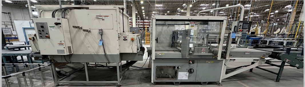
TexWrap STB-3618SSR Seal and Heat Shrink Line