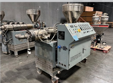
(10) Kiwex SJ65, SJ55 and SJ45 Co-Extruders w/ Control Systems