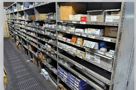
Large MRO Inventory, Bearings, Motors, Electric, Hydraulic Components