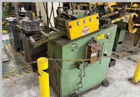
Dallas and COE Feed Lines