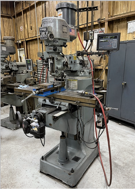
Late Model Bridgeport Mill