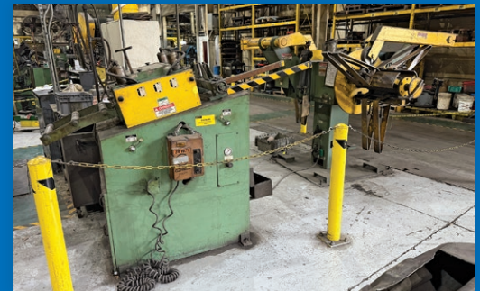
Dallas and COE Feed Lines