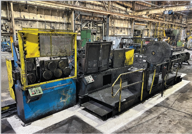
1-1/4" Lewis No. 15 Straighten and Cut Machine