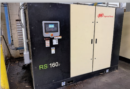
Low Hour 200-HP Air Compressors