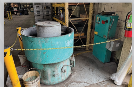
Vibratory Finishing Bowl