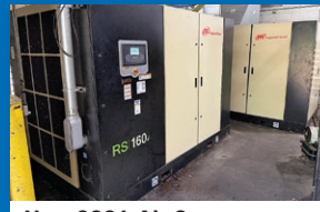
New 2024 Air Compressors