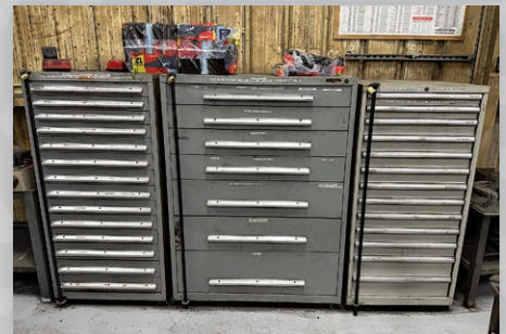
Complete Toolroom, Lathes, Mills, Grinders, Tooling