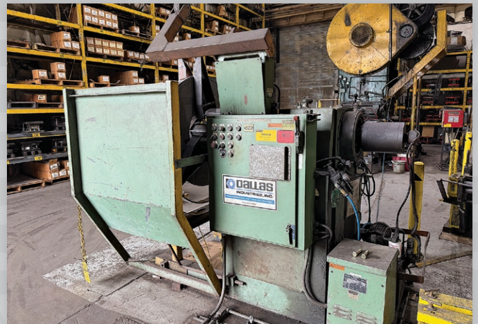
Dallas 10,000 Lb. Uncoiler