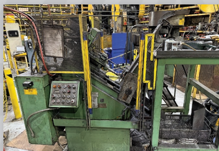
Snow Incline Tapper