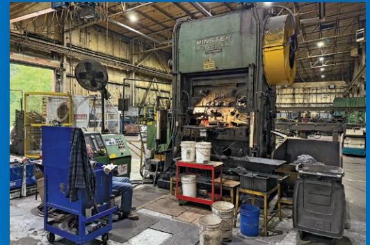
200 Ton Minster P2-200 SSDC Press

1-1/4" Lewis No. 15 Straighten and Cut Machine – Rare Machine!