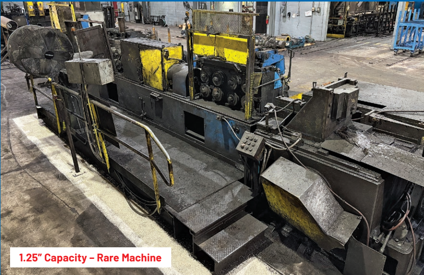
1.25" Capacity – Rare Machine

INSPECTION: Day prior to sale day or by appointment with jeffjr@cia-industrial.com