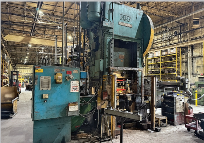
400 Ton Bliss S1-400-36-42 SSDC Press