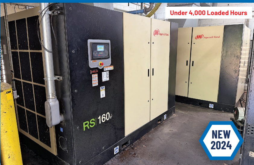
Under 4,000 Loaded Hours