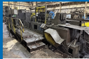
Straighten Cut Machines

CIA-INDUSTRIAL.COM 2020 DUNLAP ST. CINCINNATI, OH 45214 513.241.9701