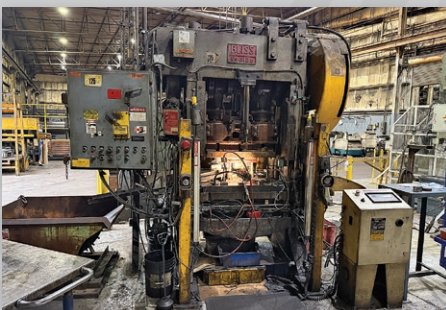
Bliss SSDC Press