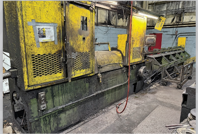
3/4" Lewis No. 11 Straighten and Cut Machine