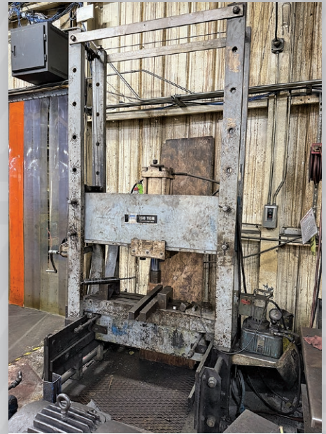
150 Ton Hydraulic Press