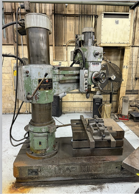
Radial Arm Drill