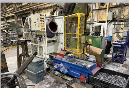
Royson Parts Tumbler