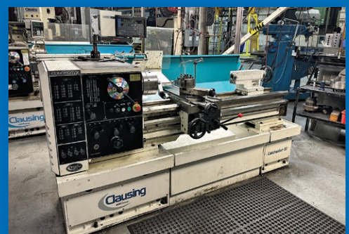
Toolroom Machinery Including Mills, Lathes, Radial Drills