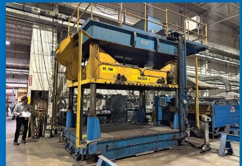
95 Ton Findlay Four-Post Hydraulic Press