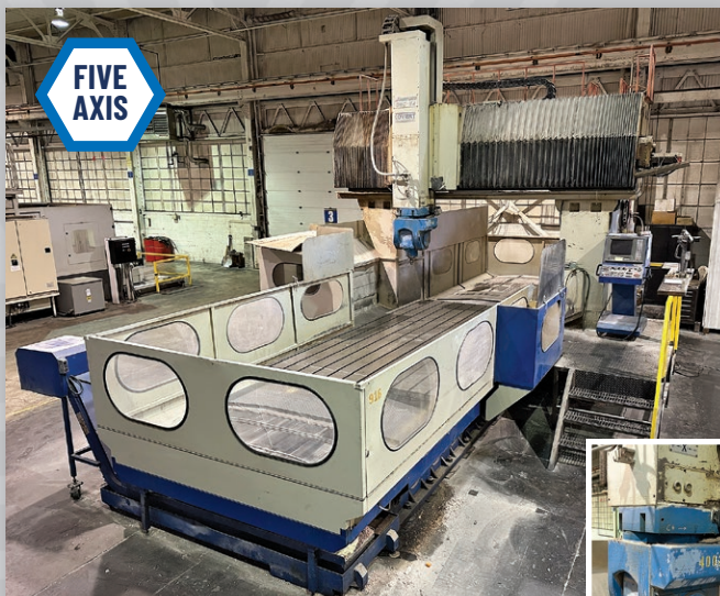
Johnford Model DMC-5A-4000/2500/1500 Five-Axis CNC Bridge Type Vertical Machining Center