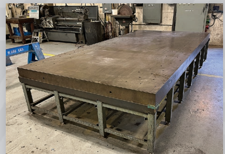
(10) Large Capacity Heavy Steel Mold Repair Tables to 12'