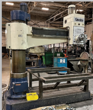
6' x 15' Column Clausing Model CL-C1600 Radial Arm Drill