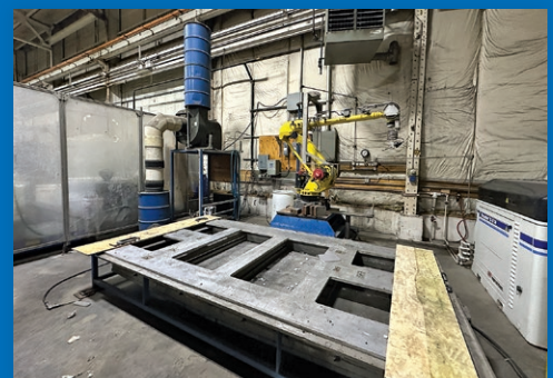
Fanuc / Ingersoll Rand Six-Axis CNC Water Jet Cutting Cell