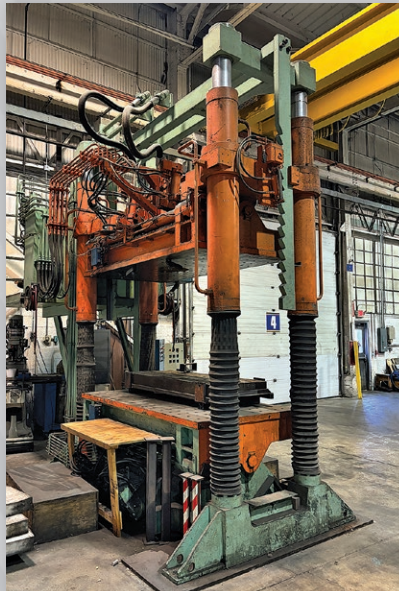
155 Ton Midwest Tilting Bed & Platen Hydraulic Spotting Press