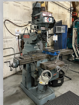
(2) Clausing Model FV-300 Vertical Milling Machines