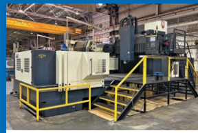
(5) CNC Bridge Type Mills