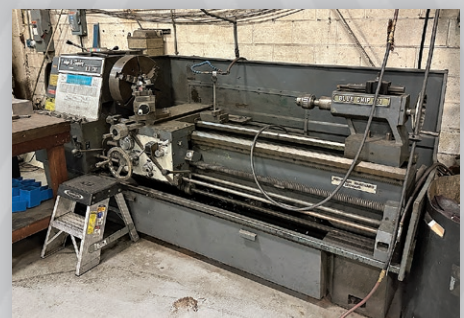
24" x 60" Lodge & Shipley Model Blue Chip Geared Head Engine Lathe