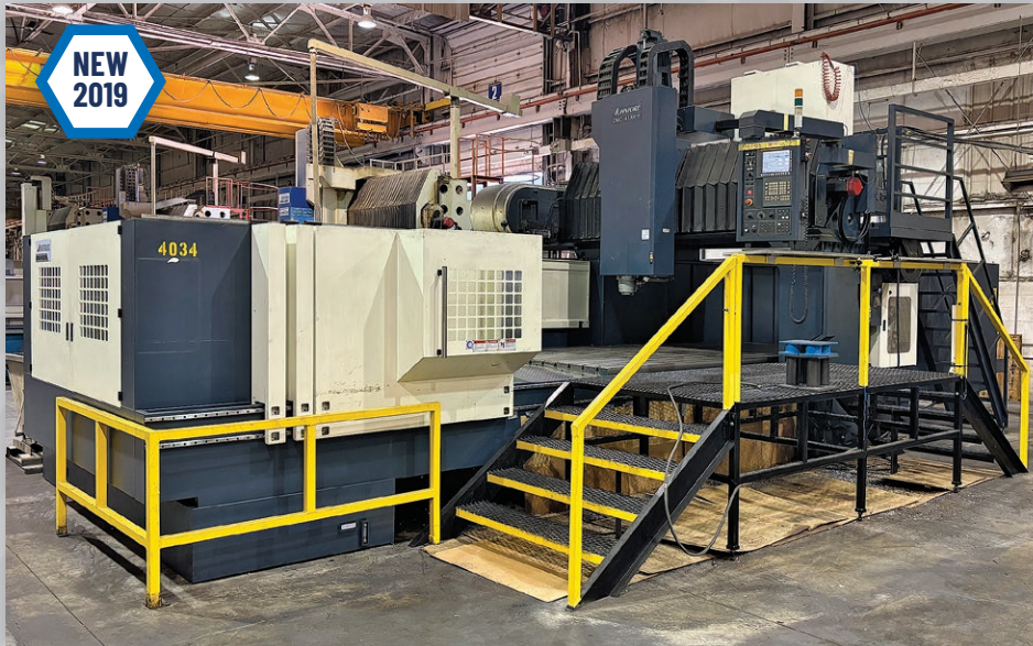
Johnford Model DMC-4100PH Three-Axis CNC Bridge Type Vertical Machining Center (New 1/2019)