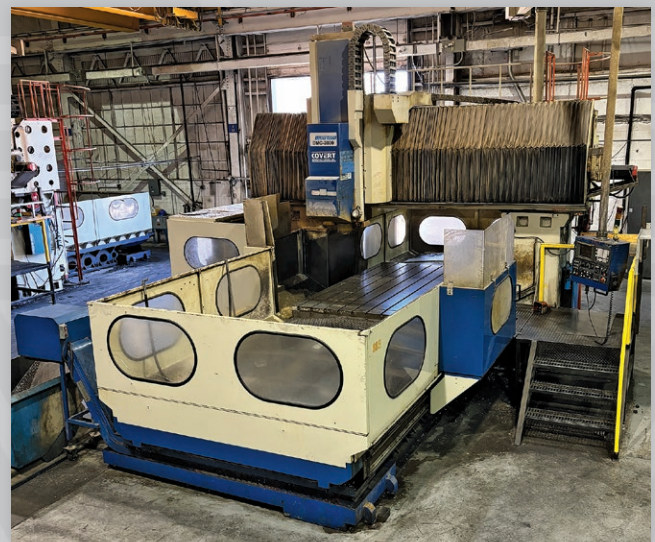
Johnford Model DMC-3000 Three-Axis Bridge Type CNC Mill