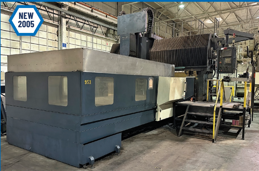
Johnford Model DMC-4000x2500x1066 Three-Axis CNC Bridge Type Vertical Machining Center (11/2005)