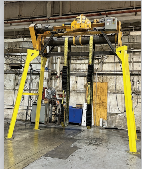
10 Ton Bushman Free-Standing Flip-Rite Mold Flipper