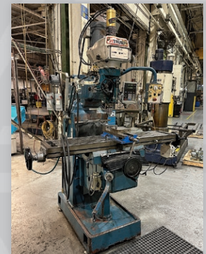
3 HP Atrump Model K3V Vertical Milling Machine