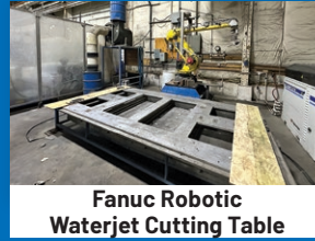
Fanuc Robotic Waterjet Cutting Table