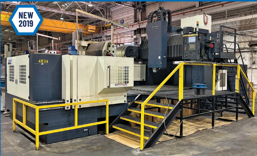
Johnford Model DMC-4100PH Three-Axis CNC Bridge Type Vertical Machining Center (1/2019)

INSPECTION: Day prior to Auction from 10:00AM to 4:00PM or by appointment with jeffjr@cia-industrial.com