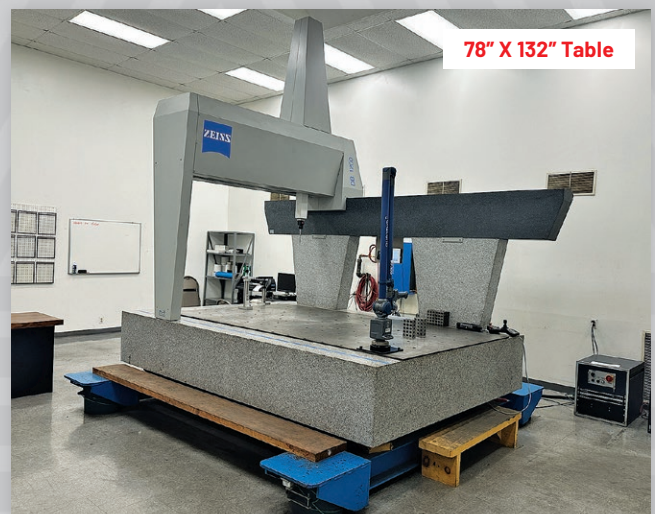
Zeiss Model DB-1200 CNC Coordinate Measuring Machine