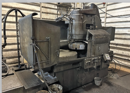
Blanchard Rotary Surface Grinder