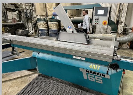
Martin Model T-65 Sliding Table Panel Saw (2015)