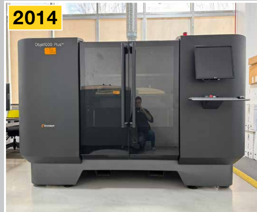
STRATASYS Objet1000 Plus Industrial 3D Printer