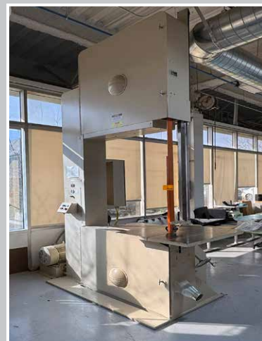
TANNEWITZ 51" Vertical Band Saw