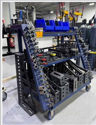
DEMMELE BLUCO Modular Cart