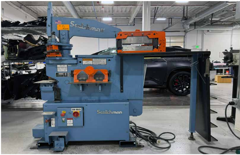
SCOTCHMAN 50-Ton Ironworker