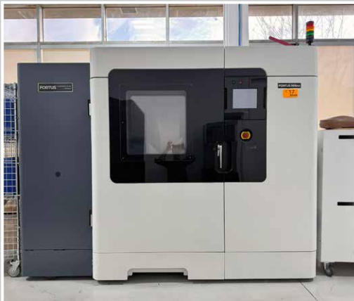
STRATASYS Fortus 900mc Large Industrial 3D Printer