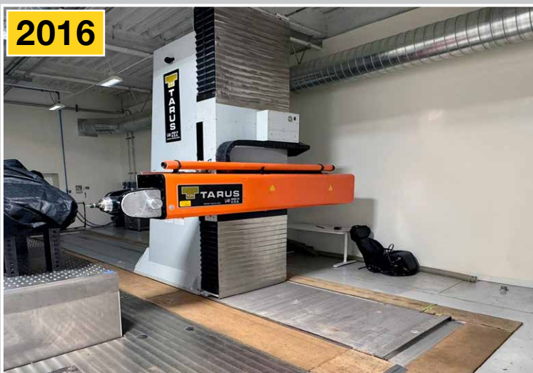
TARUS 5-Axis High Speed Single Column Post Mill