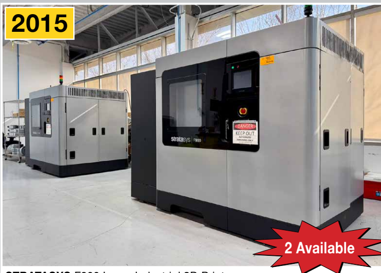
STRATASYS F900 Large Industrial 3D Printers