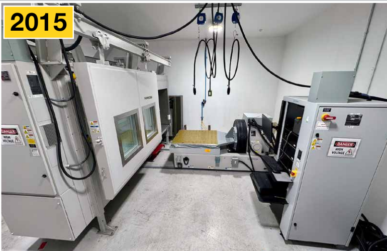
THERMOTRON Electrodynamic Shaker