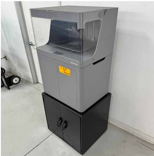
MARKFORGED MARK X7 Carbon Fiber 3D Printer