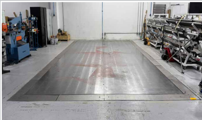
NORTON Equipment Styling Platform, (Approx. Footprint: 15' x 30')