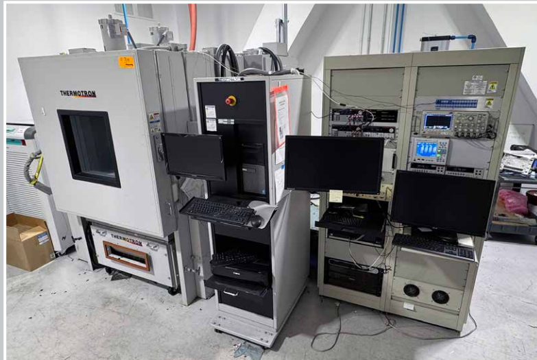
Parametric Test Station for a Traction Inverter Validation