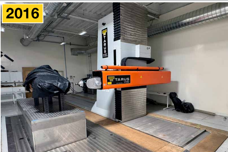
TARUS 5-Axis High Speed Single Column Post Mill