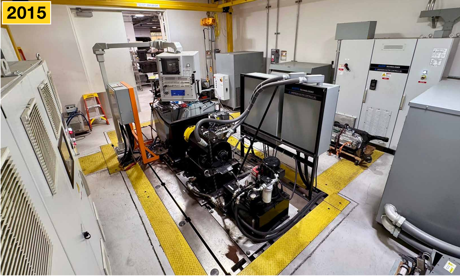
ANDERSON ELECTRIC CONTROLS, INC. Dynamometer