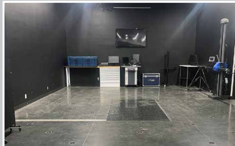
AICON stereoSCAN 3D Scanning Arena