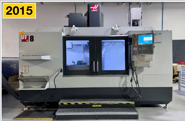
HAAS VF-8/40 3-Axis CNC Vertical Machining Center

For Further Information Email: customerservice@maynards.com