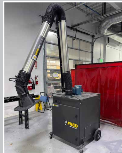
DIVERSITECH Weld Fume Extractor