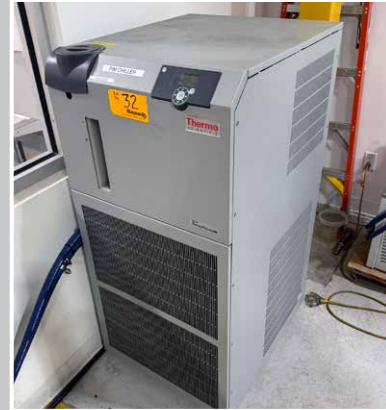
THERMO FISHER Scientific Neslab Recirculating Chiller