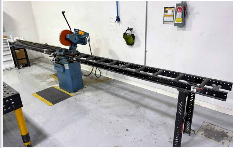
SCOTCHMAN 13.75" Cold Saw