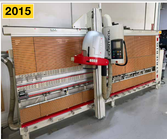
STRIEBIG (Type 5168) Vertical Panel Saw