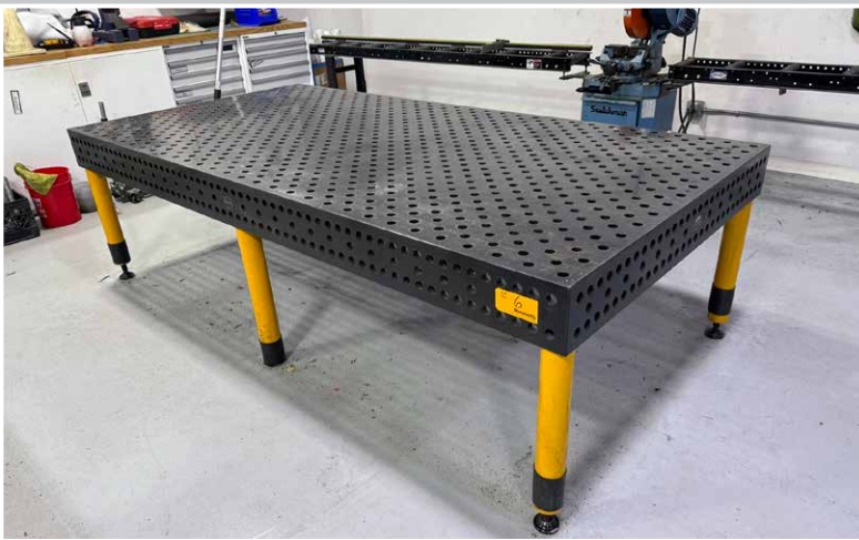
DEMMELE BLUCO Modular Fixturing Table , (59" x 9'-10")