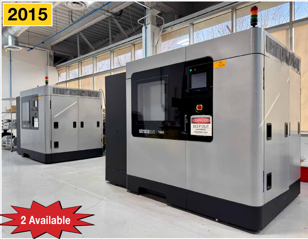
STRATASYS F900 Large Industrial 3D Printers