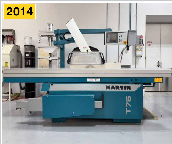
MARTIN T75 PreX Sliding Table Saw