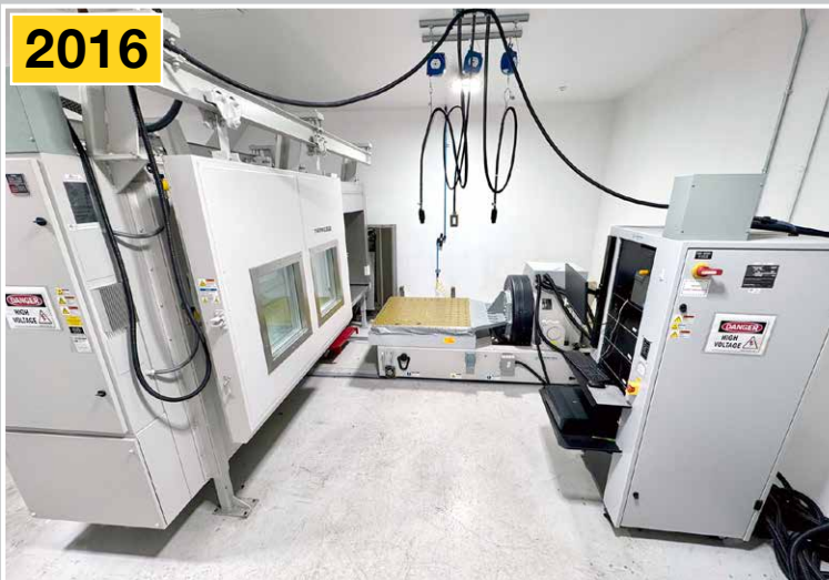
THERMOTRON Electrodynamic Shaker, w/Test Chamber

For Further Information Email: customerservice@maynards.com