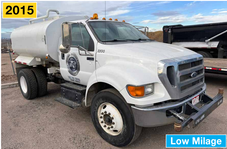
FORD F-750 Water Truck