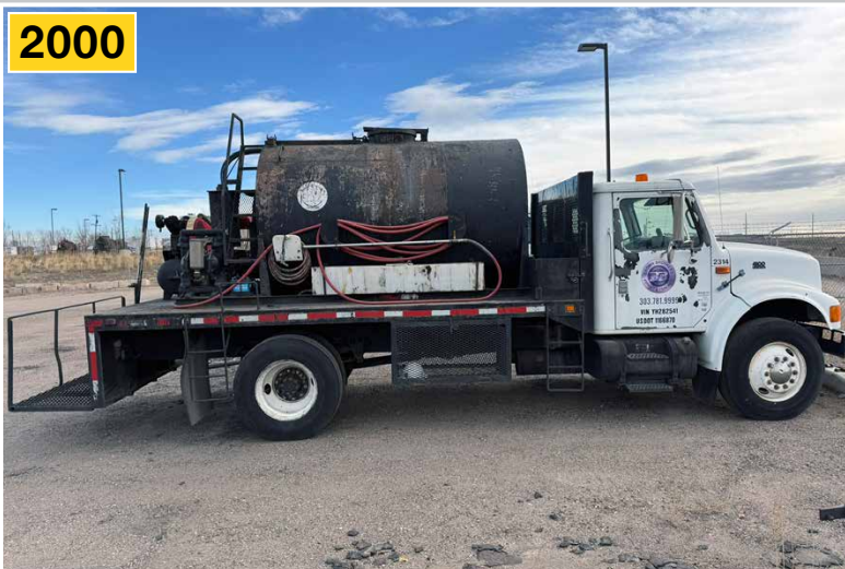
INTERNATIONAL 4900 Sealcoat Tanker Truck