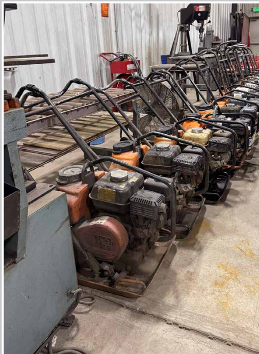
Large Qty. of MIKASA MVC-82VHW Plate Compactors