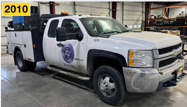
CHEVROLET 3500 HD Utility Truck