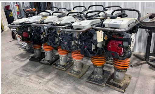
Large Quantity of MULTIQUIP Jumping Jacks