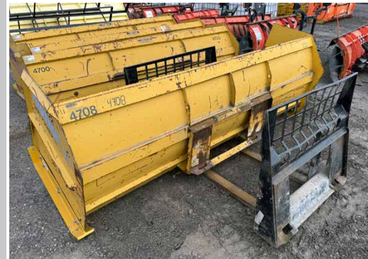
Large Quantity of PROTECH Snow Pushers