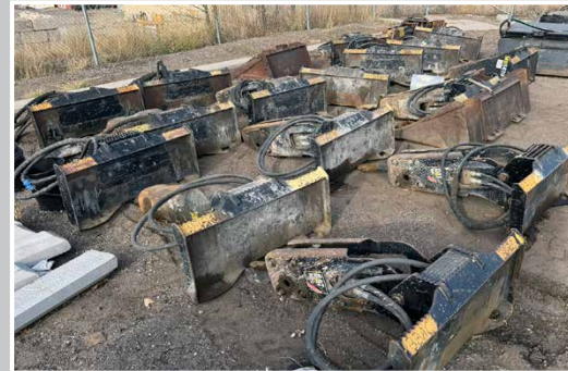
Large Quantity of CAT Breaker Attachments