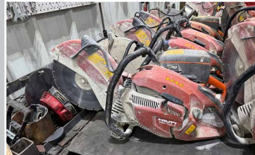
Large Quantity of HILTI DSH 700-X Demo Saws