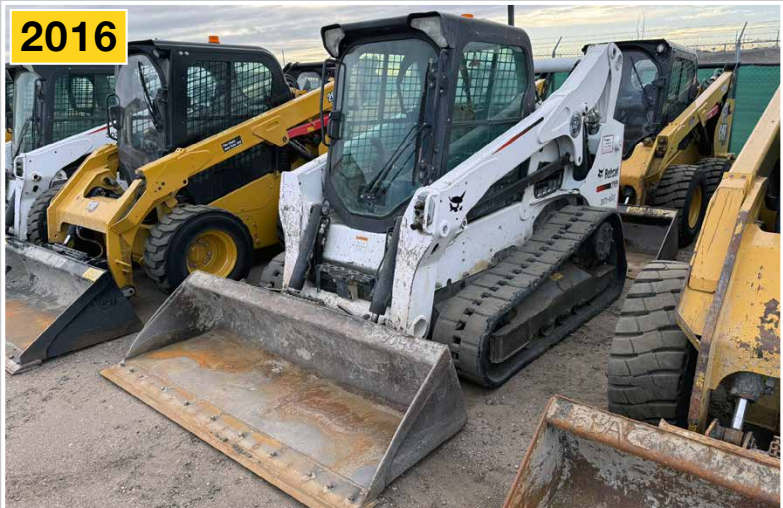
BOBCAT T740 Skid Steer Loader