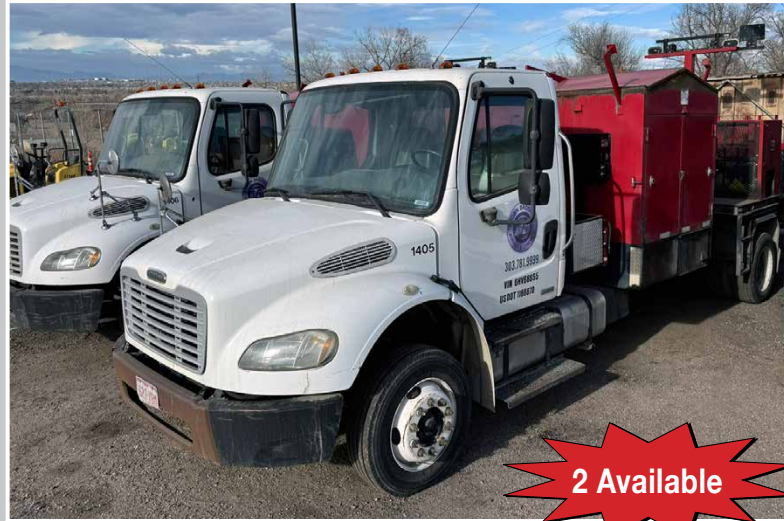
FREIGHTLINER M2 106 Infrared Hot Patch Trucks