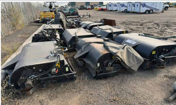
Large Quantity of CAT Sweeper Attachments