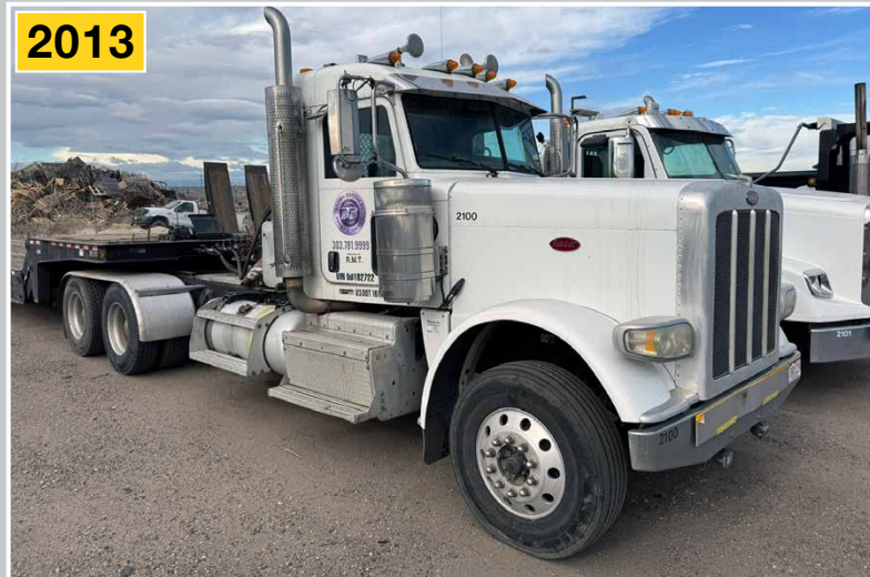
PETERBILT 388 Day Cab Truck