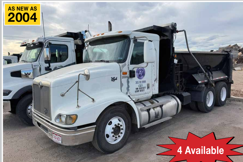
INTERNATIONAL 92001 Dump Trucks