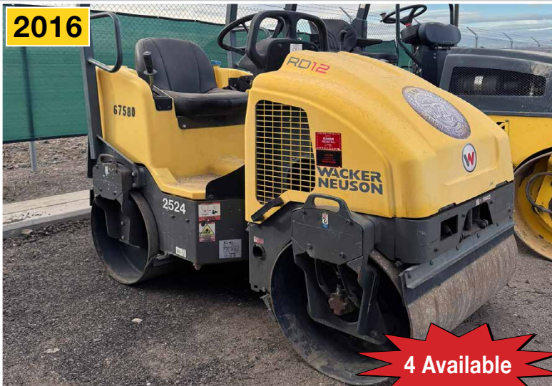
WACKER RD12A-90 Roller