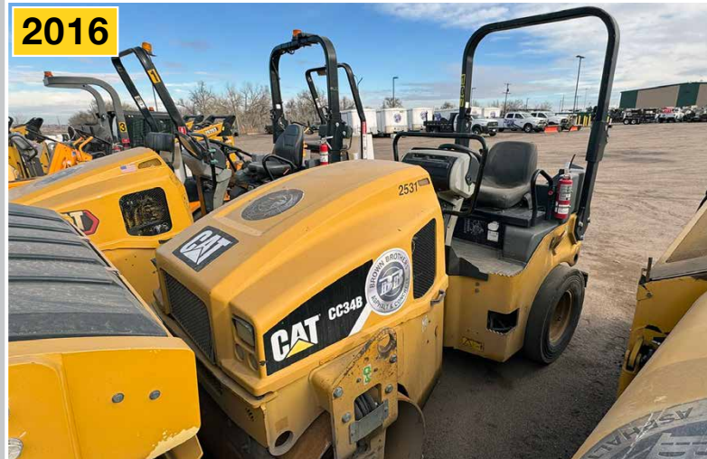
CAT CC34B Combo Roller