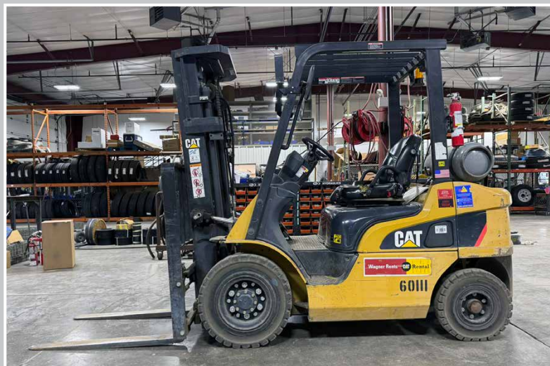
CAT 4,500 Lb. Cap. Propane Forklift, Model 2P5000