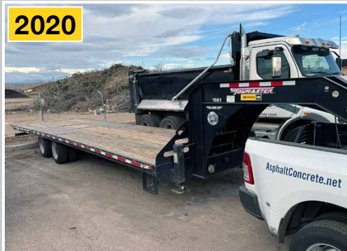
TOWMASTER TEG-24HT Deck-Over Tilt Trailer