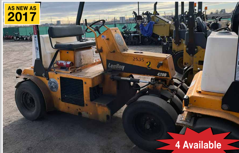
LEEBOY 420 Roller