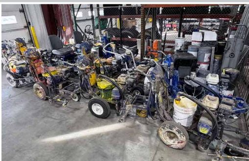
Large Quantity of GRACO Dual Head Power Strippers