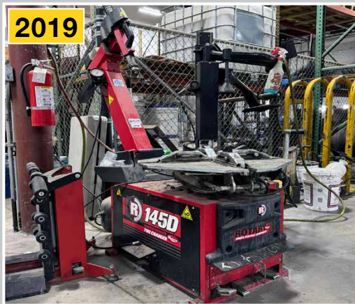
2019 SIRIO RWC645D.26IHRB Tire Changer