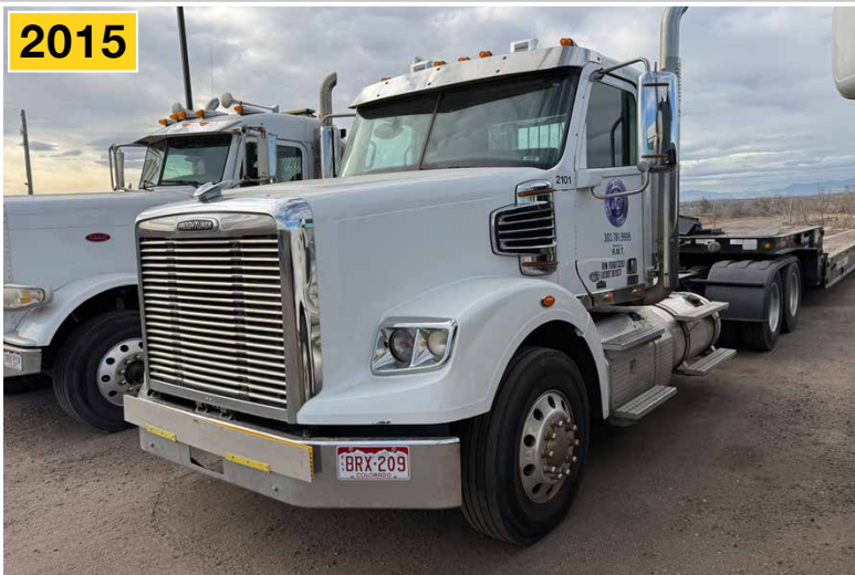
FREIGHTLINER Coronado Day Cab Truck