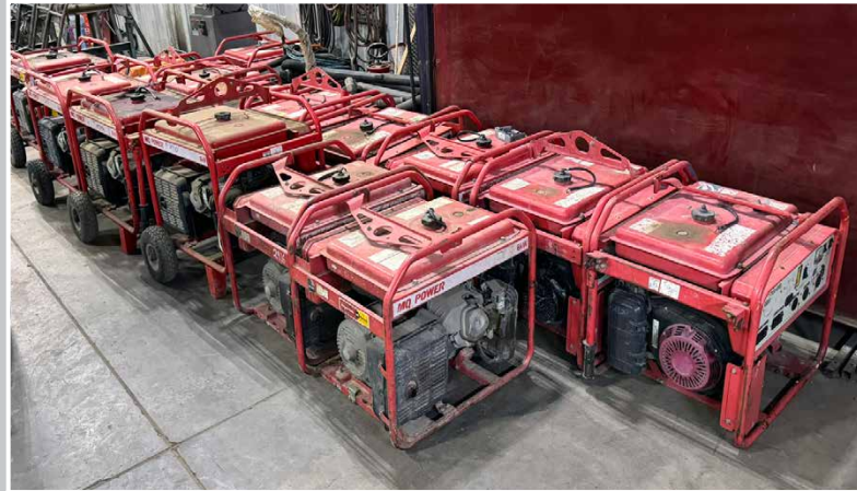
Large Quantity of MULTIQUIP GA6HA / GA6HB / GA6HR Generators