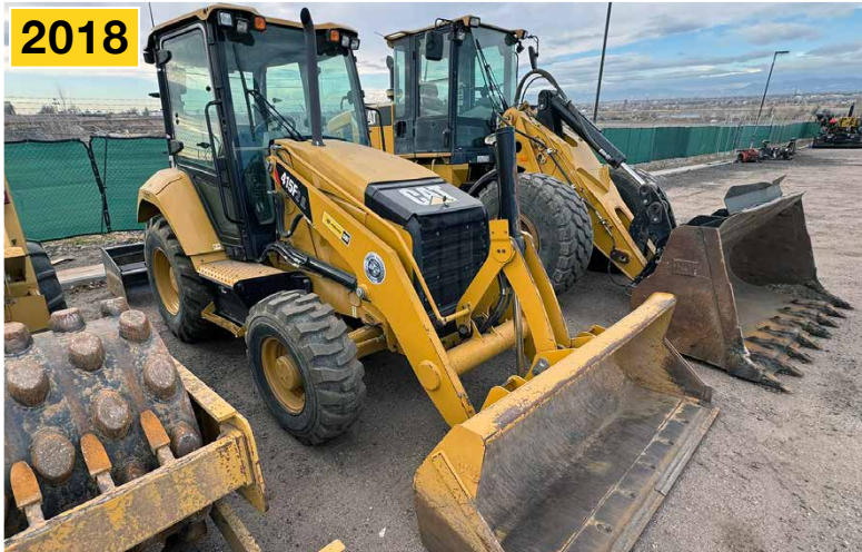
CAT 415F2 IL Industrial Loader