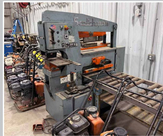
SCOTCHMAN 6509-24M 65-Ton Ironworker

TERMS & CONDITIONS | PAYMENT: Full payment within 24 hours. Payment is Cash, Cashier's check, Certified Check, or Wire Transfer. No other forms of payments will be accepted. Full Payment Must be Made before removal of Purchase. Everything is Sold "As-Is, Where-Is". All Sales Final. Cost and Responsibility for Removal of Purchase Remains with the Purchaser. Every Effort will be Made to Facilitate Removal. While Qty. and Descriptions are Believed to be Accurate, the Auctioneer, Owners or Counsel Make no Warranties or Guarantees Either Expressed or Implied as to Authenticity, Genuineness of, or Defects in Any Lot and will not be Held Responsible for any Advertising Discrepancies or Inaccuracies. No Warranties whatsoever are Made as to Condition Merchantability or Fitness for Use of Any Item. May we Suggest you Take Full Advantage of the Preview and Inspection Period. Sale Subject to Additions, Deletions and Prior Sales. Please Check Availability of Equipment. Last Date of Removal (No Exceptions) is Friday, March 28th. AN ONLINE BUYER'S PREMIUM OF 20% WILL BE CHARGED ON ALL SUCCESSFUL BIDS.