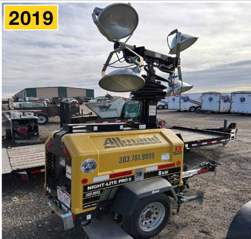
ALLMAND BROS. Night-Lit Pro II V-Series Light Tower Trailer