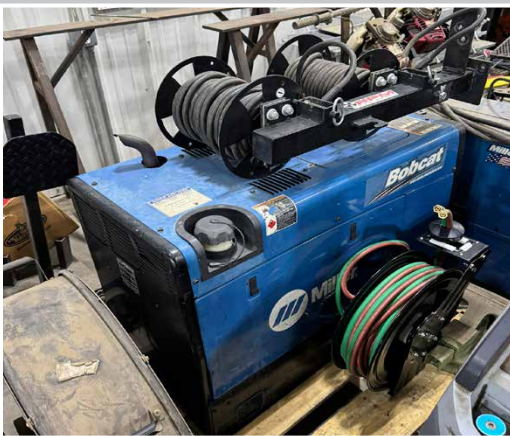
Miller BOBCAT 250A Welder