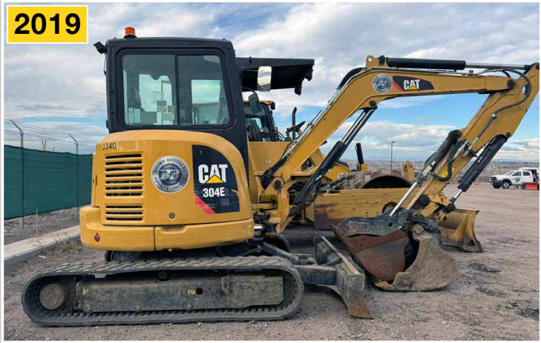
CAT 304E2 Mini Excavator