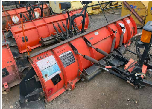
Large Quantity of CURTIS Sno-Pro 3000 Snowplows