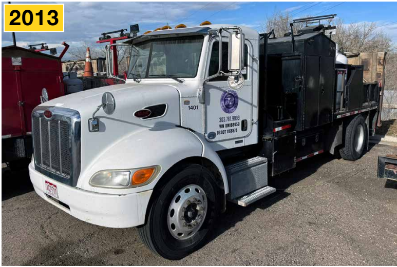
PETERBILT 337 Hot Patch Truck