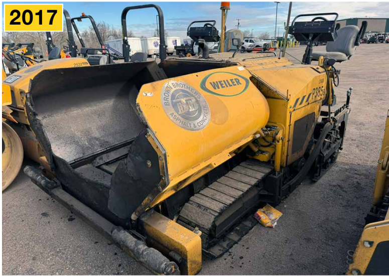
WEILER P385B Asphalt Paver