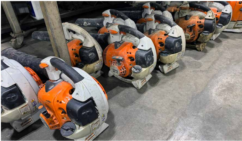
Large Quantity of SCHILLER LITTLE WONDER Optimax 13 HP Blowers