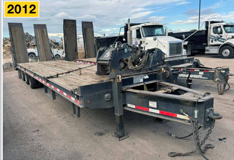
KAUFMAN 25T-Pintle Flatbed Trailer