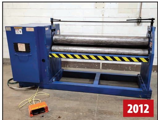
NEW DIMENSION 6500 N0E 1/2" X 6' POWER BENDING ROLLS

HEM VT130 HA 60 20" X 24" CNC AUTOMATIC VERTICAL BANDSAW, s/n 1069809