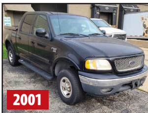
2001 FORD F-150 XLT CREW CAB PICKUP TRUCK