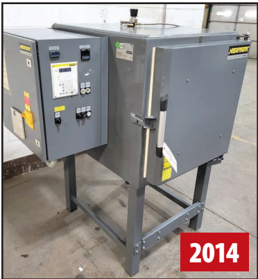
NABERTHERM N120/65HA FORCED CONVECTION SINTERING FURNACE

ZOLLER SATURN 2 V420E2 TOOL PRESETTING MACHINE, s/n V420E2-00282