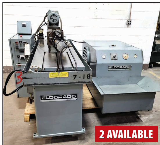
ELDORADO MEGA M-75-1041 3/4" X 30" PRECISION DEEP HOLE GUN DRILL