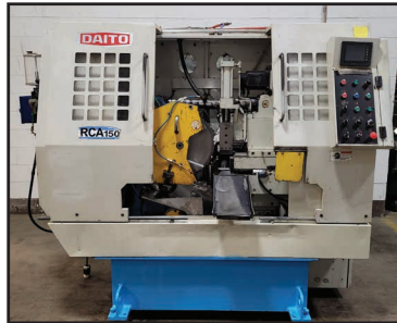
DAITO RCA 150 6" HIGH SPEED PRODUCTION CIRCULAR COLD SAW