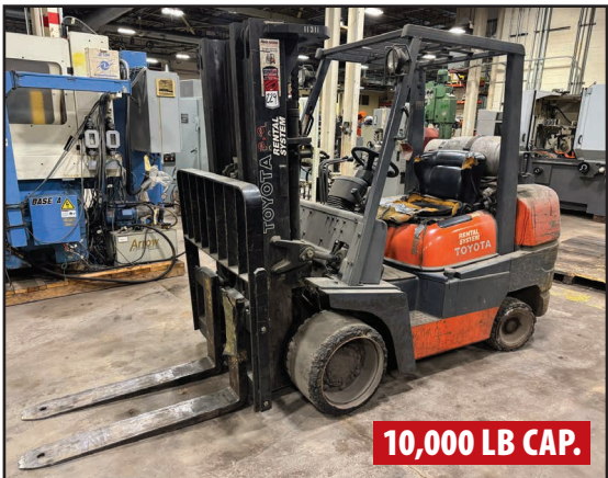
TOYOTA 52-6FGCU45 LP FORKLIFT

ASSORTED FORKLIFT BOOMS, FORK EXTENSIONS, COUNTERWEIGHTS, BASKETS