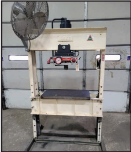
DAKE 6-275 75-TON H-FRAME SHOP PRESS