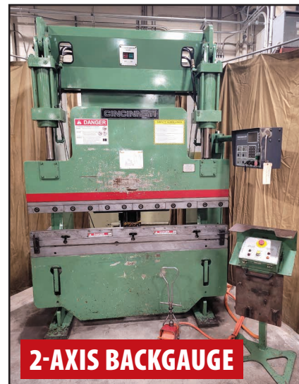
CINCINNATI 60CB II X 4 HYDRAULIC PRESS BRAKE