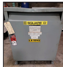
LARGE QTY OF TRANSFORMERS