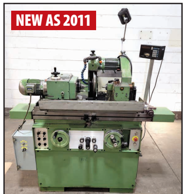
(2) TSCHUDIN HTG310 11.8" X 13.3" UNIVERSAL CYLINDRICAL GRINDERS

ALSO: (2) ROYAL MASTER TG-12x4 & TG-12x3 Precis-O-Matic Centerless Grinders, s/n 1409, 1742, OKAMOTO ACC-124DXII 12" x 24" Programmable High-Precision Surface Grinder, s/n 63134, OKAMOTO IGM-2M Micro Processor Controlled Internal Grinder, s/n 11574, RUSH FC 500D PCD Carbide HSS Tool Grinder, s/n RF-9024