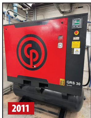
2011 CHICAGO PNEUMATIC QRS30 HP UL ROTARY SCREW AIR COMPRESSOR