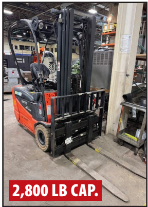
LINDE RX50-16 ELECTRIC FORKLIFT