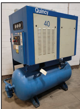
QUINCY 40 HP ROTARY SCREW AIR COMPRESSOR