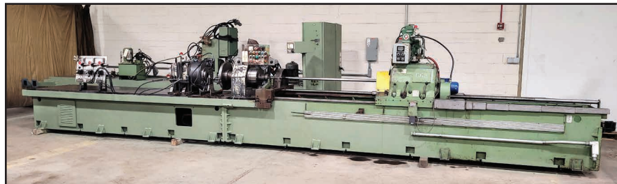
HEGENSCHEIDT 7925 SR3000 TUBE SKIVING AND FINISHING MACHINE

HEGENSCHEIDT 7925 SR3000 TUBE SKIVING AND FINISHING MACHINE, s/n na