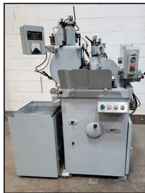
(2) ROYAL MASTER PRECIS-O- MATIC CENTERLESS GRINDERS