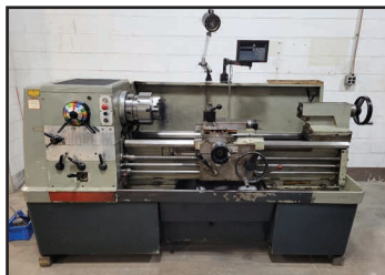
CLAUSING COLCHESTER 17" X 40" ENGINE LATHE