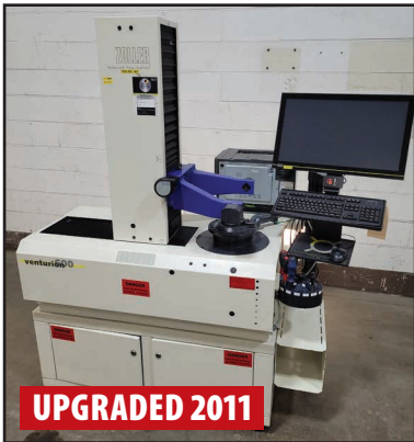
ZOLLER VENTURION 500 TOOL PRE-SETTING AND MEASURING MACHINE