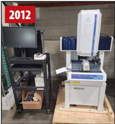
MITUTOYO QUICK VISION APEX QVT1-X302P1L-C MEASURING SYSTEM