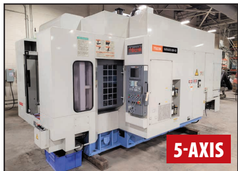
MAZAK VARIAXIS 630 5X DUAL PALLET VMC

2013 HWACHEON CUTEX-240B SMC TURNING AND MILLING CENTER WITH SUB SPINDLE, s/n M035361J2L, w/ Fanuc 0i-TD Control 2011 HAAS SL40 XP 4-AXIS LIVE MILLING TURNING CENTER, s/n 3088026, w/ Haas CNC Control HARRISON ALPHA 400 GAP BED-FLAT COMBINATION CNC TEACH LATHE, s/n A30036, w/ GE Fanuc Alpha CNC Control 2003 MAZAK VARIAXIS 630 5X DUAL PALLET 5-AXIS VERTICAL MACHINING CENTER, s/n 164502, w/ Mazak 640 M5X CNC Control 2003 MAZAK FH-6000 4-AXIS HORIZONTAL MACHINING CENTER, s/n 162397, w/ Mazatrol PC Fusion 640M CNC KIWA KNH-400 HORIZONTAL MACHINING CENTER, s/n PB6120R, w/ Fanuc 18iM Control 2002 BROTHER TC-22A-O CNC DRILLING & TAPPING CENTER, s/n 112214, w/ CNC-A00 Control KIRA VTC30E CNC DRILLING AND TAPPING CENTER, s/n na, w/ Fanuc 21M Control 2007 SUNNEN SV-310 VERTICAL HONING MACHINE, s/n 1F1-1011