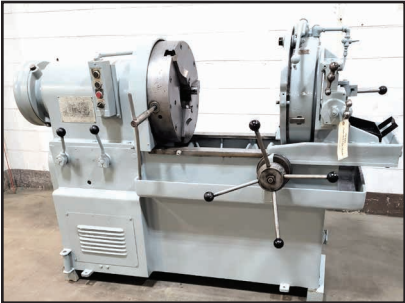
OSTER 716 6" PIPE AND BOLT THREADER