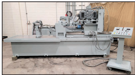
PHILLIPS/TECHNIDRILL 4" X 48" BTA EJECTOR TYPE DEEP HOLE DRILL

2011 DEHOFF 4-SPINDLE 1" X 18" 1018 4-SPIN GUN DRILLING MACHINE, s/n na, AB MicroLogix PLC Control