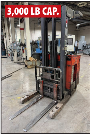
RAYMOND EASI R30TT ELECTRIC STAND-UP REACH FORKLIFT