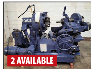
GLEASON #12 STRAIGHT BEVEL GEAR GENERATOR