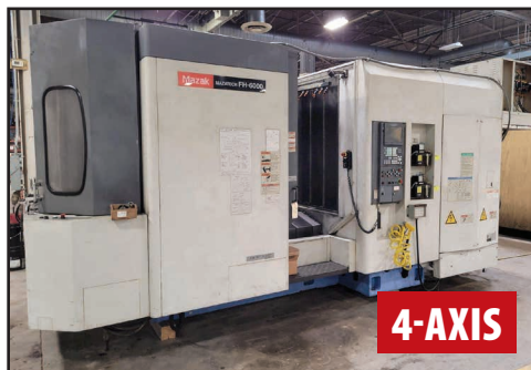
MAZAK FH-6000 HMC