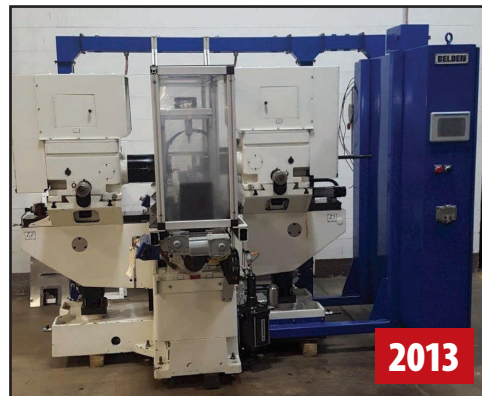
(2) NICHOLS BIG TWIN BELDEN CNC DUPLEX MILLING MACHINES

For auction inquiries, please contact Jennifer Reiner at (847) 545-6374 or jennifer@perfectionindustrial.com