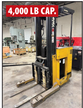
YALE MR040ACNM24TE095 ELECTRIC STAND-UP REACH FORKLIFT