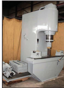
EITEL RP-160 STRAIGHTENING PRESS