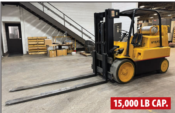
HYSTER S150 LP FORKLIFT