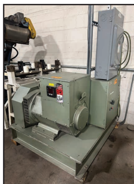
GEORATOR 75 HP 60 TO 50 HZ FREQUENCY CONVERTER