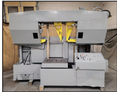
HYD-MECH H-26 26" X 26" DUAL POST HORIZONTAL BAND SAW

DENISON MULTIPRESS T120MC2 C-FRAME HYDRAULIC PRESS, s/n 17725