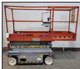
SKYJACK SJIII 3219 SCISSOR LIFT