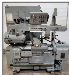
BARBER COLMAN NO. 16-16 MULTICYCLE GEAR HOBBER