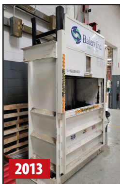
2013 BACE V63HD VERTICAL BALER