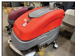
POWER BOSS PHOENIX 3030 FLOOR SCRUBBER

FORD Pickup Truck, Enclosed Semi Trailer, Floor Scrubbers, Air Compressors, Scissor Lift, Balers, Large Selection of Transformers, Frequency Converter, Electrical Components, Wire, CAT 50 Tool Holders, CAT 40 Tool Holders, HSK Tool Holders, Chucks, Tooling, DEVILIEG Rotary Table, Bench Centers, Angle Plates, Spare Machine Parts, Bearings, Work Benches, Pallet Racking, Vises, Power, Pneumatic & Hand Tools, Spreader Bars, Rigging Skates & Chains, and Much More