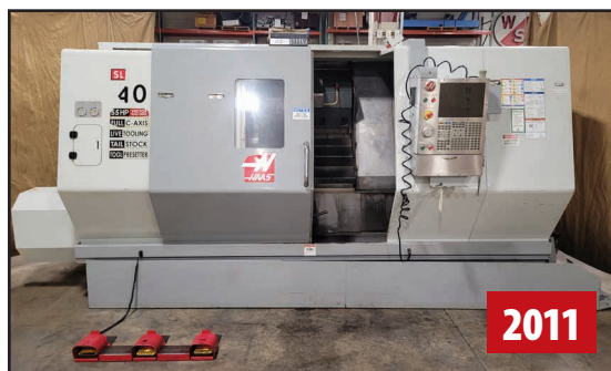
HAAS SL40 XP 4-AXIS LIVE MILLING TURNING CENTER