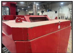
COUNTERWEIGHT FOR TAYLOR FORKLIFT