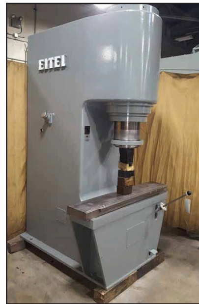
EITEL RP-200 STRAIGHTENING PRESS