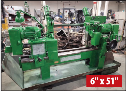
HEY NO. 3 DOUBLE END FACING AND CENTERING MACHINE

HEY No. 3 6" x 51" Double End Facing and Centering Machine, s/n na, YIEH-CHEN YC-3T Cam Driven Thread Rolling Machine, s/n 1453, BERTOLETTER 300 Straight-O-Matic Round Parts Straightener, s/n 30021, OSTER 716 6" Pipe and Bolt Threading Machine, s/n na, PETER WOLTERS AL001K 12" Fine Double-Sided Grinding & Lapping Machine, s/n 127, PRAB SMD-12A12" Metal Turnings Shredder, s/n na, DAKE 6-275 75-Ton H-Frame Shop Press, s/n 173528, SUMMIT 3XHD Twin Spindle Drill Press, s/n 82, 2006 OMGA RN 900 FM US 14" Radial Arm Saw, s/n 01-305537, ANTON WIMMER UFT300 Immersion Type Abrasive Cut-Off Machine, s/n 374-02, OSBORN SINJET IBX2 2-Position Programmable Deburring Machine, s/n na, 2008 TRUMPF Trumark Station 7000 Laser Marking Machine, s/n E0852A0169