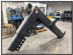
HEAVY DUTY FORKLIFT BOOM