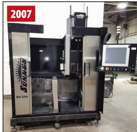
SUNNEN SV-310 VERTICAL HONING MACHINE