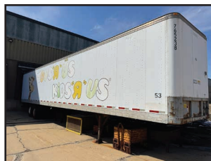
FRUEHAUF FB9 1.5 NF2-53W 53' ENCLOSED SEMI TRAILER