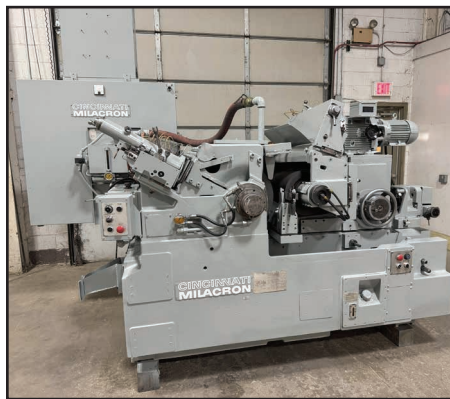
CINCINNATI MILACRON 340-20 TWIN GRIP CENTERLESS GRINDER