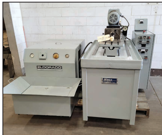
ELDORADO MEGA M-75-1003 3/4" X 15" PRECISION DEEP HOLE GUN DRILL