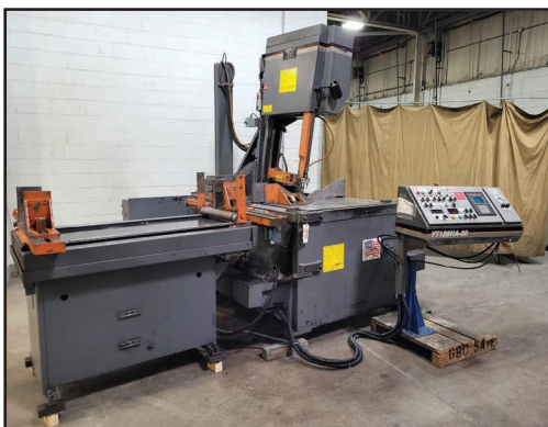
HEM VT130 HA 60 20" X 24" CNC AUTO. VERTICAL BANDSAW