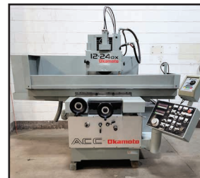
OKAMOTO ACC-124DXII PROGRAMMABLE SURFACE GRINDER