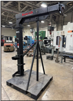
BRUTE HEAVY LIFT BM15 BOOM ATTACHMENT