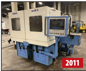
DEHOFF 4-SPINDLE 1" X 18" 1018 4-SPIN GUN DRILL