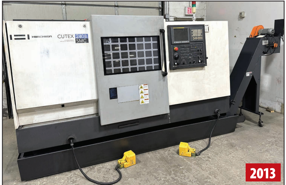
HWACHEON CUTEX-240B SMC TURNING & MILLING CENTER