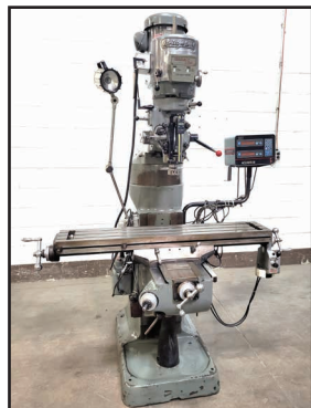
BRIDGEPORT SERIES I 2 HP VERTICAL MILL

(2) 2013 NICHOLS BIG TWIN BELDEN CNC DUPLEX MILLING MACHINES, s/n 1358A, 1358B, w/ AB MicroLogix PLC Controls, PanelView Color HMI BRIDGEPORT SERIES I 2 HP VERTICAL MILL, s/n 245516, w/ 2-Axis DRO BRIDGEPORT SERIES I 1.5 HP VERTICAL MILL, s/n 140499 SOUTHWESTERN INDUSTRIES TRAK-DPMV3 CNC VERTICAL BED MILL, s/n 031AV11978, w/ ProtoTrak VM 3-Axis Control (Updated 2021) CLAUSING COLCHESTER 17" X 40" ENGINE LATHE, s/n na