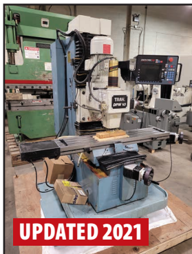
SWI TRAK-DPMV3 CNC VERTICAL BED MILL