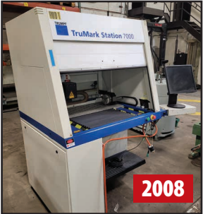
TRUMPF TRUMARK STATION 7000 LASER MARKER