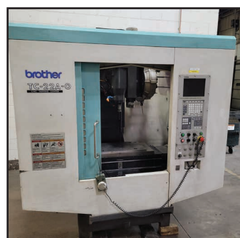
BROTHER TC-22A-O CNC DRILLING & TAPPING CENTER