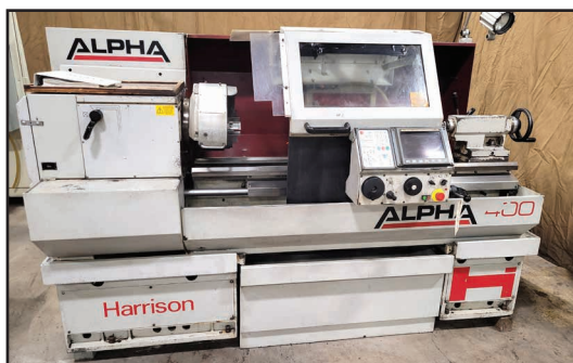
HARRISON ALPHA 400 CNC TEACH LATHE