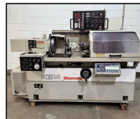
OKAMOTO IGM-2M MICRO PROCESSOR CONTROLLED INTERNAL GRINDER