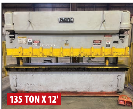
PACIFIC J135-12 HYDRAULIC PRESS BRAKE