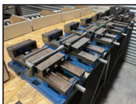
KURT MACHINE VISES