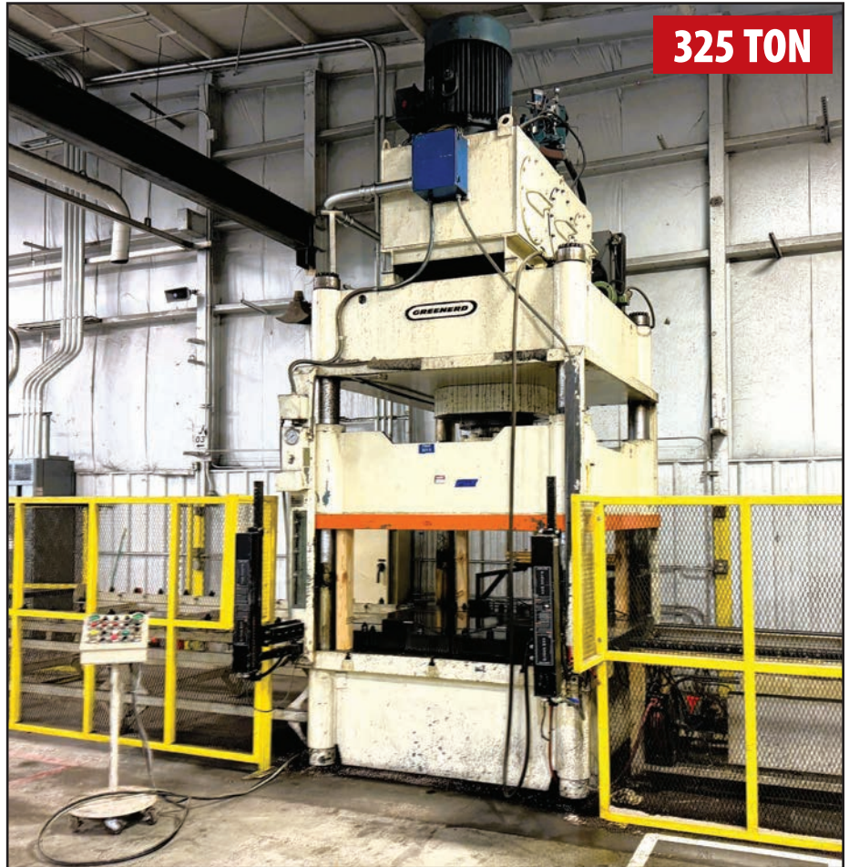
GREENERD 4D-325 4-POST HYDRAULIC PRESS

FEATURING: PACIFIC 300 OBL-8 Straight Side Hydraulic Press, GREENERD 325 Ton Press, PACIFIC 500 Ton x 30' Press Brake, (2) PACIFIC K225 X 20' Press Brakes, Other Brakes up to 135 Ton, AMERICOR LH-150/6 Bending Roll, BPR CPH60REV Bending Roll, (2) Angle Bending Rolls, HYD-MECH S-23A Horizontal Band Saw, Coil Lines & Feeds, Forklifts, Pallet Wrapper, GROVE Articulating Boom Lift, SUPERIOR 5 Ton Free- Standing Crane System, Facility Support & Much More!