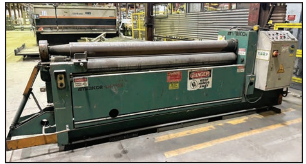
AMERICOR LH-160/6 3-ROLL PLATE BENDING ROLL