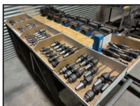
CAT 40 TOOL HOLDERS