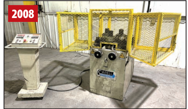
IMCAR CPHV60 ANGLE BENDING ROLL