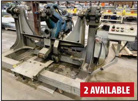
NIAGARA NO. 180 ROTARY CRIMPING AND BEADING MACHINE