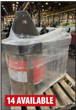
BARRELS OF WELDING WIRE