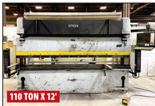
PACIFIC J110-12 HYDRAULIC PRESS BRAKE