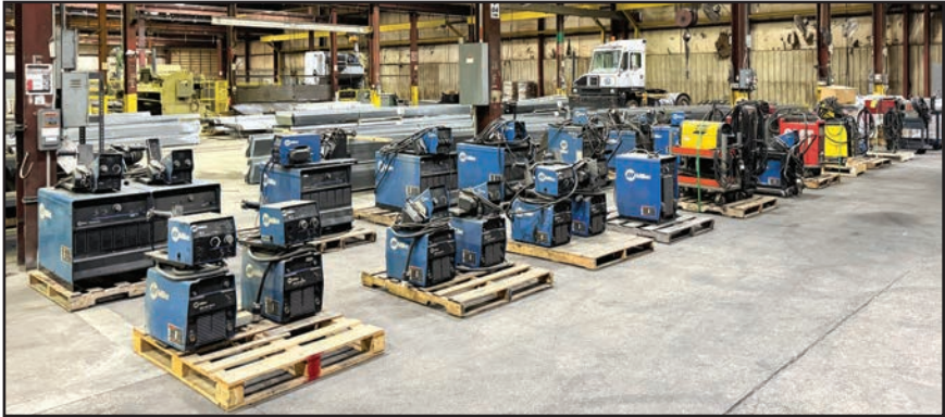
HUGE WELDING DEPARTMENT