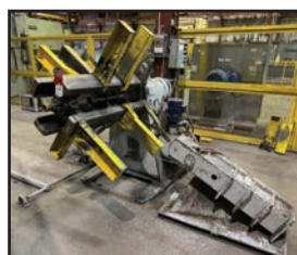
LITTELL 60-36 AUTO CENTERING REEL