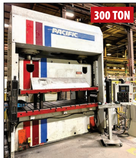
PACIFIC 300 OBL-8 STRAIGHT SIDE HYDRAULIC PRESS

DALLAS / LITTELL COIL LINE , w/ Dallas D400 24X24RH 24" Feeder/Straightener, s/n 18424, LITTELL No. 60-36 Auto Centering Reel, s/n S5599-73, 6000 lb. Capacity, 16-20"ID, 48" Max. OD, 36" W, (Used with Niagara SC2-200-60-42, Offered Separately)