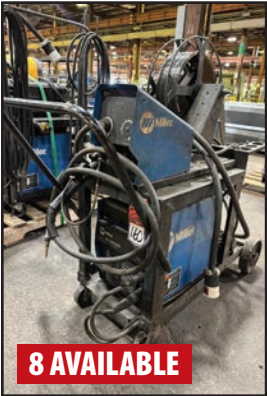
MILLER XMT304 CC/CV MULTIPROCESS WELDER