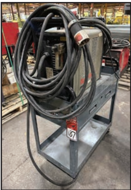
HYPERTHERM G3 POWERMAX 1000 PLASMA CUTTER