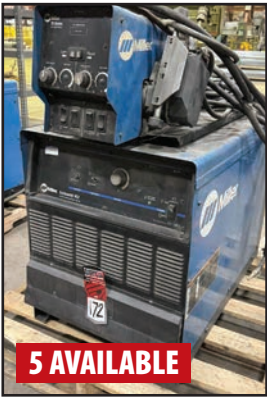
MILLER DELTAWELD 452 MIG WELDER