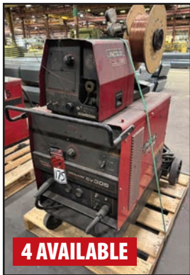
LINCOLN IDEALARC CV 305 MIG WELDER