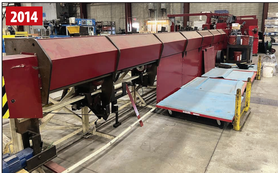
MODERN 6MNC CNC TUBE CUT-OFF