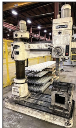
SUPERMAX SRD-1000 4' RADIAL ARM DRILL