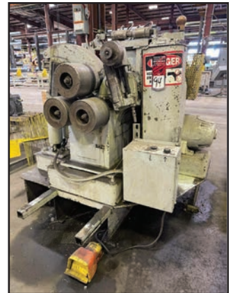
BUFFALO 3-ROLL ANGLE BENDING ROLL