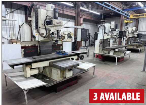
FRYER MB16Q CNC MILLING MACHINES

FRYER MB16Q CNC MILLING MACHINE, s/n 16137, w/ TOUCH 2100 Control, 18" x 70" Table, 7.5 HP, Power Draw Bar, 60"X, 25"Y, 24"Z, 4500 RPM FRYER MB16Q CNC MILLING MACHINE, s/n 16097, w/ ANILAM 5000M Control, 18" x 70" Table, 7.5 HP, Power Draw Bar, 60"X, 25"Y, 24"Z, 4500 RPM FRYER MB16Q CNC MILLING MACHINE, s/n 16024, w/ ANILAM 1400 Control, 18" x 70" Table, 7.5 HP, Power Draw Bar, 60"X, 25"Y, 24"Z, 4500 RPM