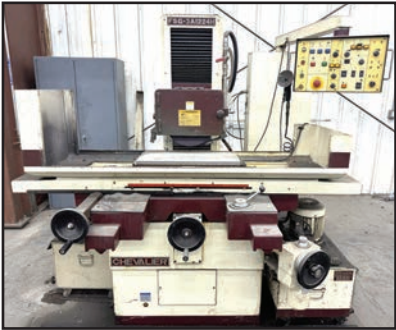
CHEVALIER FSG-3A1224H AUTOMATIC SURFACE GRINDER

(3) MILLER XMT304 CC/CV Multiprocess Welders w/ MILLER 22A Wire Feeders ; (4) MILLER XMT304 CC/CV Multiprocess Welders w/ MILLER 70 Series Wire Feeders ; MILLER XMT 304 CC/CV Multiprocess Welder w/ MILLER Suitcase 12RC Wire Feeder ; MILLER Axxess 450-DI Multiprocess Welder ; LINCOLN DC-655 Multi Process Welder ; (4) MILLER Deltaweld 452 MIG Welder w/ 70 Series Wire Feeders ; MILLER Deltaweld 452 MIG Welder w/ 22A Wire Feeder ; (4) LINCOLN Idealarc CV 305 MIG Welder w/ LF-72 Wire Feeders ; (2) MILLER Deltaweld 302 MIG Welder w/ 22A Wire Feeders ; MILLER Deltaweld 302 MIG Welder w/ 70 Series Wire Feeder ; FRONIUS TransPuls Synergic 4000 CMT MV MIG Welder ; ESAB MIG 4002C MIG Welder ; MILLER S-74 MPa Plus Wire Feeder ; MILLER 70 Series Wire Feeder ; NELWELD 4500 Model 101 Stud Welder ; HYPERTHERM G3 Series Powermax 1000 Plasma Cutter ; HYPERTHERM Powermax 600 Plasma Cutter ; ESAB Powercut 875 Plasma Cutter ; Various Drums of NATIONAL STANDARD and ESAB Welding Wire, Welding Tables, Welding Consumables, Clamping and Snorkel Fume Extractors