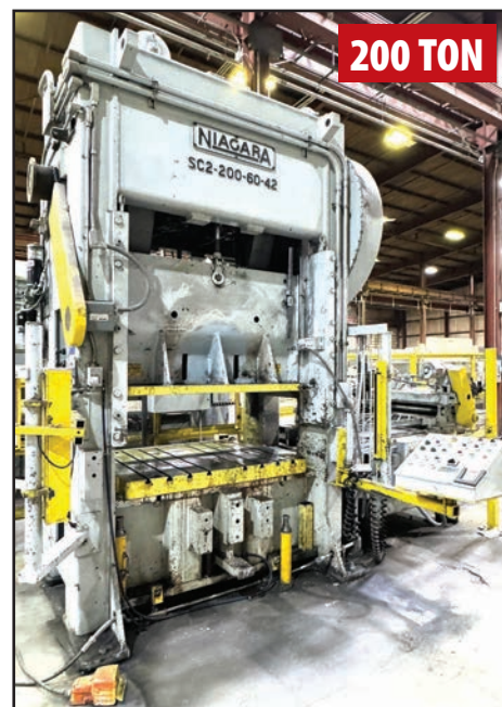
NIAGARA SC2-200-60-42 STRAIGHT SIDE PRESS