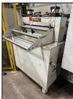
CWP SMX30 SERVO FEED