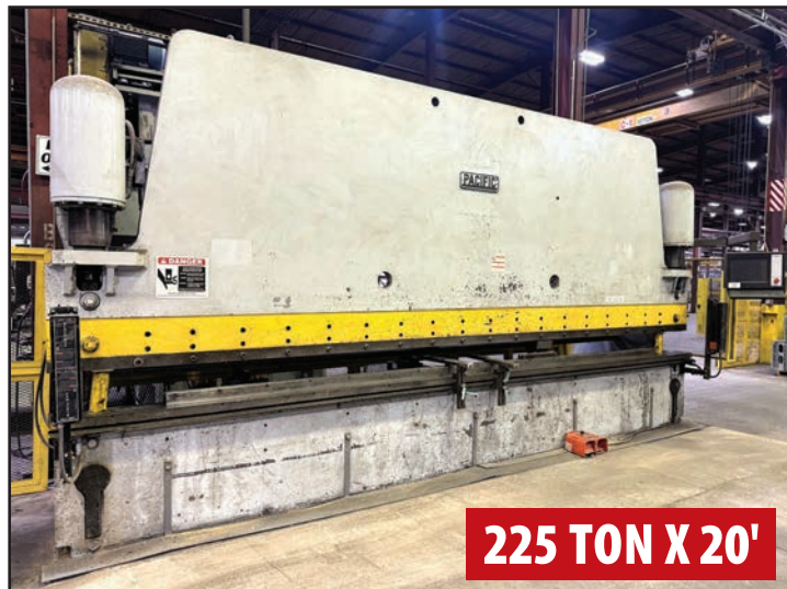
PACIFIC K225-20 HYDRAULIC PRESS BRAKE