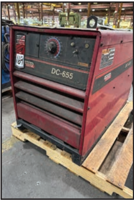
LINCOLN DC-655 MULTI PROCESS WELDER