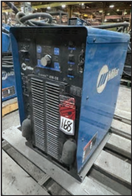
MILLER AXCESS 450-DI MULTIPROCESS WELDER