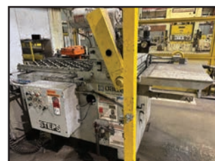
DALLAS D400 24X24RH FEEDER/ STRAIGHTENER