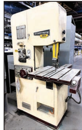
STARTRITE 216H VERTICAL BAND SAW