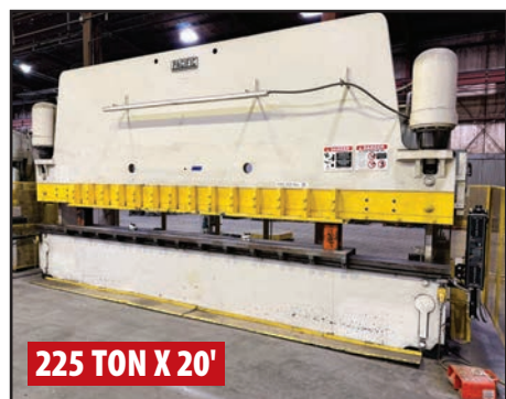
PACIFIC K225-20 HYDRAULIC PRESS BRAKE