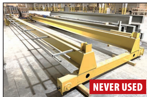
SUPERIOR 5-TON FREE STANDING BRIDGE CRANE SYSTEM

ALSO: CAT 40 Tool Holders, KURT Machine Vises, Lathe Chucks, RIDGID Pipe Threader, Pipe Dies, Pipe Wrenches, Mag Drills, Power Tools, Cordless Tools, Hand Tools, Ladders, Tool Boxes, Self Dumping Hoppers, Inspection Items Including Granite Surface Plates, Digital Calipers, Portable Hardness Testers, Parallel Sets, Precision Squares, Digital Gaging Instruments, DILLON Dynamometers, Spreader Bars, Sheet Lifts, Coil Hooks, Lifting Chain and Slings, Pallet Jacks, Hoists, Shop Carts, Shop Fans, Strapping Machines, Banding Carts, Saw Horses, Maintenance Crib, and More