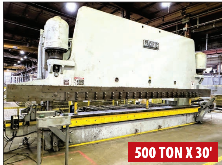
PACIFIC 500-30 HYDRAULIC PRESS BRAKE

CHICAGO DREIS & KRUMP 458-D MECHANICAL PRESS BRAKE , s/n P-8168, 1/4" @ 8' Capacity, 102" Between Housing, Dual Palm Buttons