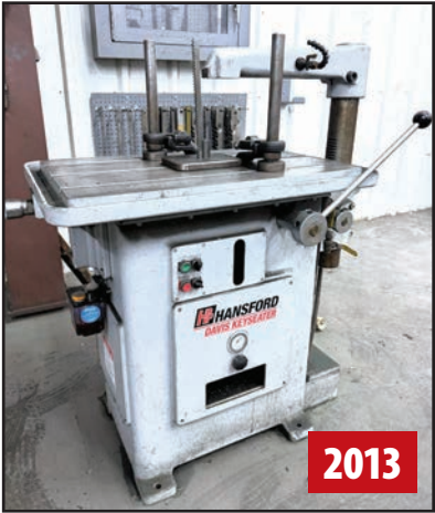
HANSFORD DAVIS 15 1.5" KEYSEATER

BRIDGEPORT SERIES I MILLING MACHINE , s/n na, 2 HP, 9" x 48" Power Feed Table, Power Draw Bar, Acu-Rite 3-Axis DRO EXACTO 942B MILLING MACHINE , s/n 101645, w/ 9" x 42" Power Feed Table, 2 HP, 80-2720 RPM Spindle Speed SUPERMAX SRD-1000 4' RADIAL ARM DRILL , s/n 712165, w/ 9" Column, 63-2900 RPM, Box Table CADILLAC 17" X 80" LATHE , s/n 868352, w/ 10" 3-Jaw Chuck, Steady Rest, Aloris Quick Change Tool Post, Tailstock, 32-1800 RPM, Additional 12" 4-Jaw Chuck CHEVALIER FSG-3A1224H AUTOMATIC RECIPROCATING SURFACE GRINDER , s/n P3878002 (2) NIAGARA NO. 180 ROTARY CRIMPING AND BEADING MACHINES , s/n 65315 & 68660 2013 HANSFORD DAVIS 15 1.5" KEYSEATER , s/n 15-1769, w/ Assorted Broaches and Tooling ALSO: DAKE 50-Ton H-Frame Hydraulic Press, s/n 1130190, (2) CLAUSING 2275 20" Drill Presses , s/n 520410 and na, 150-2000 RPM, 10" Throat, 15.5" x 18" Table, 1.5 HP, SOLBERGA SE2030M Drill Press , s/n 400794, 12.5" Throat, 90-3610 RPM, 2 HP, BALDOR 7307 7" Pedestal Grinder , s/n W398, .5 HP, 3600 RPM, TOOLMASTER Dual End Grinder , 6" Belt Sander, FAMCO No. 3 Arbor Press , PRYORMARK Series 2000 2M3500 Marking Press , s/n 000781