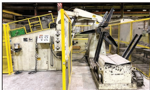
CWP UNCOILER & STRAIGHTENER