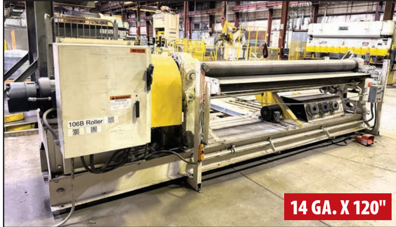
HENDLEY BELOIT 4-H 3-ROLL PLATE BENDING ROLL

HENDLEY BELOIT 4-H 14 GA. X 120" 3-ROLL PLATE BENDING ROLL, s/n 16687 AMERICOR LH-160/6 3-ROLL PLATE BENDING ROLL, s/n 3100274 2008 IMCAR CPHV60 ANGLE BENDING ROLL, s/n B 3031742 BPR CPH 60 REV ANGLE BENDING ROLL, s/n 9910063 BUFFALO 3-ROLL ANGLE BENDING ROLL, s/n na