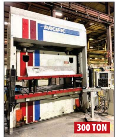
PACIFIC 300 OBL-8 STRAIGHT SIDE HYDRAULIC PRESS