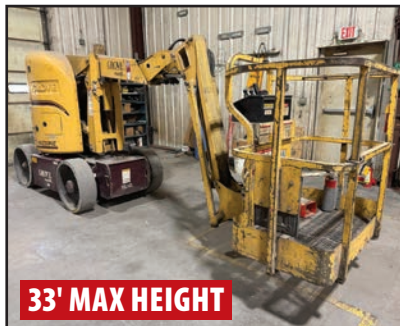
GROVE AMZ39NE ARTICULATING BOOM LIFT