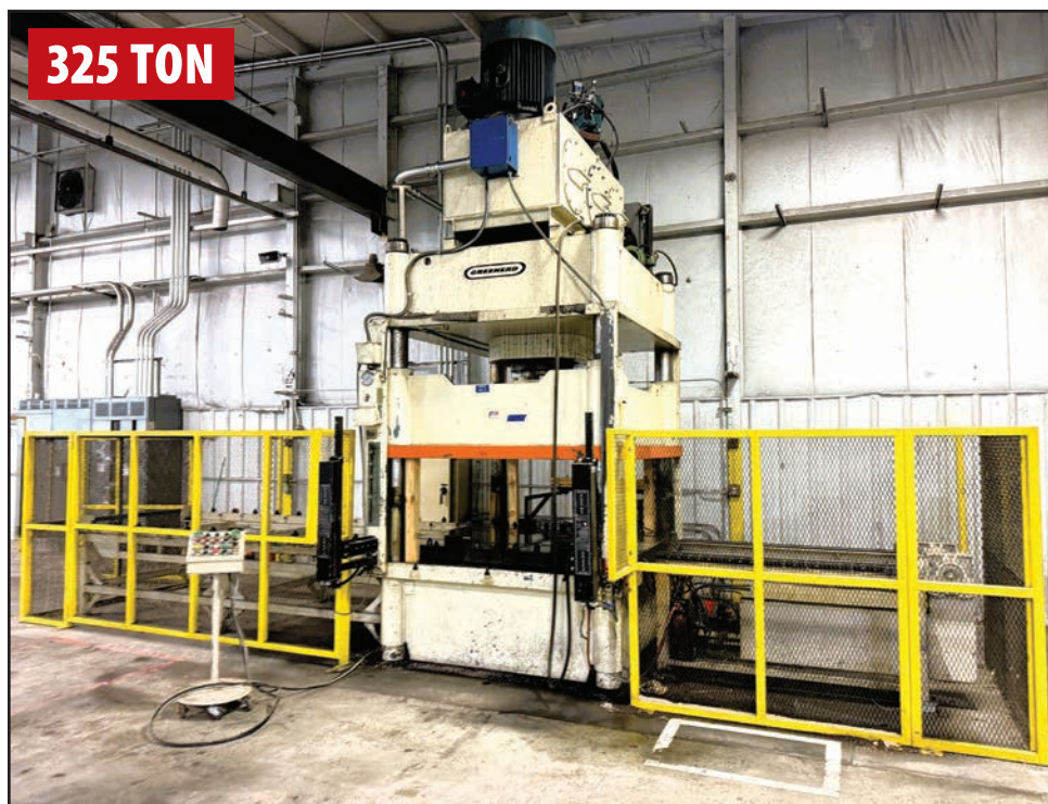
GREENERD 4D-325 4-POST HYDRAULIC PRESS