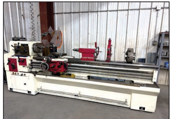
CADILLAC 17" X 80" LATHE