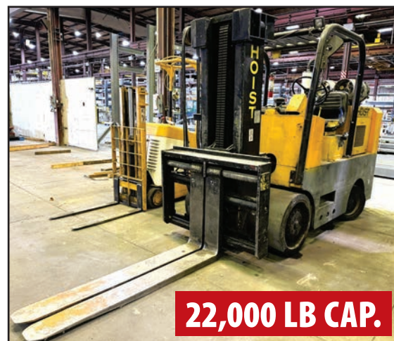
HOIST HKS-11 LP FORKLIFT