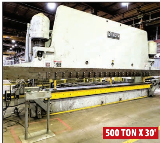
PACIFIC 500-30 HYDRAULIC PRESS BRAKE