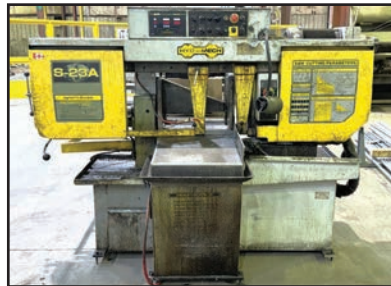
HYD-MECH S-23A HORIZONTAL BAND SAW

HYD-MECH S-23A HORIZONTAL BAND SAW, s/n XA0100098, w/ 16" x 18" Capacity, 5 HP HYD-MECH S-20 HORIZONTAL BAND SAW, s/n 20790657, w/ 13" x 18" Capacity, 3 HP STARTRITE 216H VERTICAL BAND SAW, s/n 14479, w/ 15.5" Throat, 26" x 26" Table, BSO-25 Blade Welder