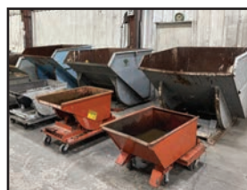
SELF-DUMPING SCRAP HOPPERS