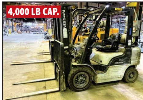
NISSAN MU1F2A25LV LP FORKLIFT

GROVE AMZ39NE ARTICULATING BOOM LIFT , s/n 250369, w/ 500 Lb. Load Rating, 33' Max. Platform Height