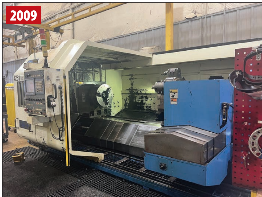
L&L MACHINERY LL950-4000 CNC LATHE

FEATURING: MAZAK QTN 400 II Turning Center, OKUMA LB-35-II Turning Center, OKUMA Crown 1420 CNC Lathe, (3) OKUMA 2SP-35HG 2-Spindle CNC Lathe, (6) MURATEC MW-200 2-Spindle CNC Lathe, L&L MACHINERY LL950-4000 CNC Lathe, MORI SEIKI ZT2500Y CNC Lathe, OKUMA LT-300M Twin Star CNC Lathe, MORI SEIKI NH5000 DCG/50 CNC HMC, DOOSAN VC 3600 4-Axis VMC, JOHNFORD DMC-1600H 4-Axis Bridge Mill, RAYMOND Sideload Forklift, AIMCO SAJ900-6-P9 Integrated Jib Crane System, BIG JOE BIG LIFT T-40 Tugger, and NILFISK-ADVANCE Condor 4530C Floor Scrubber