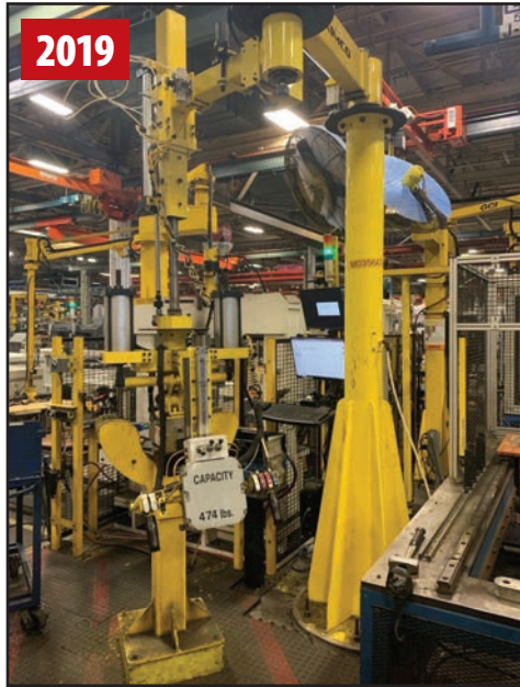
AIMCO SAJ900-6-P9 INTEGRATED JIB CRANE