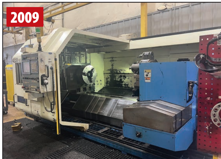
L&L MACHINERY LL950-4000 CNC LATHE

2001 OKUMA CROWN 1420 TURNING CENTER , s/n 0364, w/ OSP-U10L CNC Control, 15" 3-Jaw Chuck, 40" Center Distance, 12 Pos Turret, 3.5" Spindle Hole, Chip Conveyor, Coolant, Mist Collector, No Tooling or Workholding Jaws Included (Located in Fort Worth, TX)