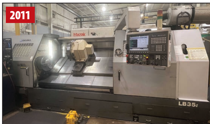
OKUMA LB-35-II TURNING CENTER