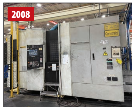
MORI SEIKI NH5000 DCG / 50 HMC