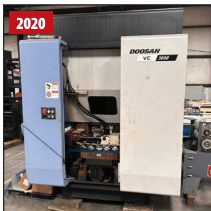
DOOSAN VC 3600 TWIN PALLET 4-AXIS VMC