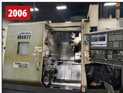
OKUMA LT-300M TWIN STAR 2 TURRET CNC LATHE