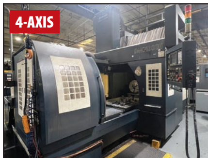
JOHNFOR DMC-1600H CNC BRIDGE MILL

2008 MORI SEIKI NH5000 DCG/50 HORIZONTAL MACHINING CENTER , s/n NH502HH0854, w/ MSX-701 III CNC Control, (2) 19.7"x19.7" Pallets, 8000 RPM Spindle, CAT 50, 97-ATC, 0.001 B-Axis, Chip Conveyor, Chip Blaster Through Spindle Coolant, No Tooling Included (Located in Winston Salem, NC)