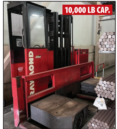
RAYMOND 076-SL100TF SIDE LOADER

2019 AIMCO SAJ900-6-P9 INTEGRATED JIB CRANE SYSTEM W/ MANIPULATOR , s/n AIM6473, 474 lb Capacity, 215 lb End Tool Weight, 180 lb Torqlift Weight, 42" Span, 360° Rotation, 90° Power Tilt Manipulator (Located in East Peoria, IL)