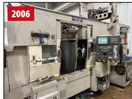
OKUMA & HOWA 2SP-35HG DUAL SPINDLE CNC TURNING CENTER