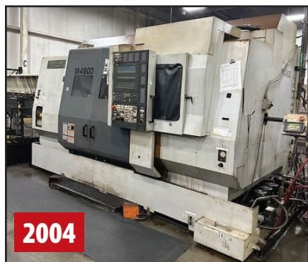
MORI SEIKI ZT2500Y TWIN TURRET TURNING CENTER