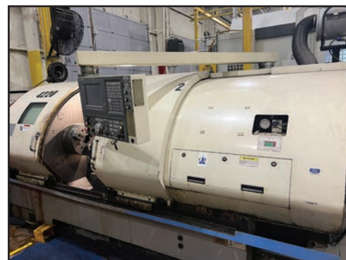
2001 OKUMA CROWN 1420 CNC LATHE