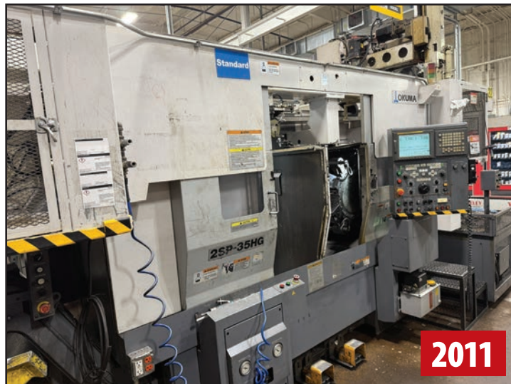
(1 OF 3) OKUMA 2SP-35HG DUAL SPINDLE TURNING CENTER