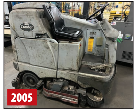
NILFISK-ADVANCE CONDOR 4530C ELECTRIC FLOOR SCRUBBER