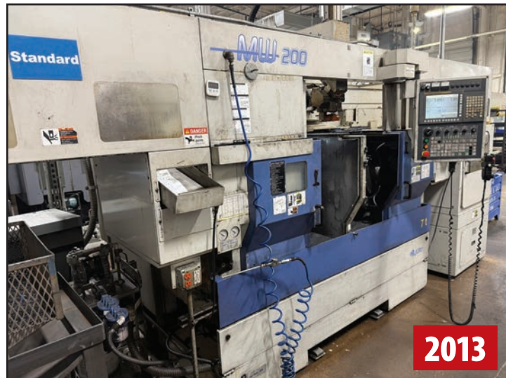
(1 OF 6) MURATEC MW-200 DUAL SPINDLE TURNING CENTER

(3) 2011-2005 OKUMA 2SP-35HG DUAL SPINDLE TURNING CENTERS , s/n 156401, 6003, 5029, w/ FANUC 18iTB Control, (2) 10" 3-Jaw Chucks, 3500 RPM, (2) 12 Position Tool Turrets, Gantry Loader, (16) Position Loading Stand, Chip Conveyor, Coolant System, No Tooling or Workholding Jaws Included (Located in Fort Worth, TX)