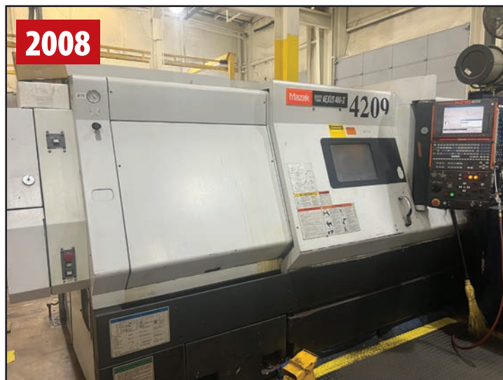
MAZAK QTN 400 II TURNING CENTER