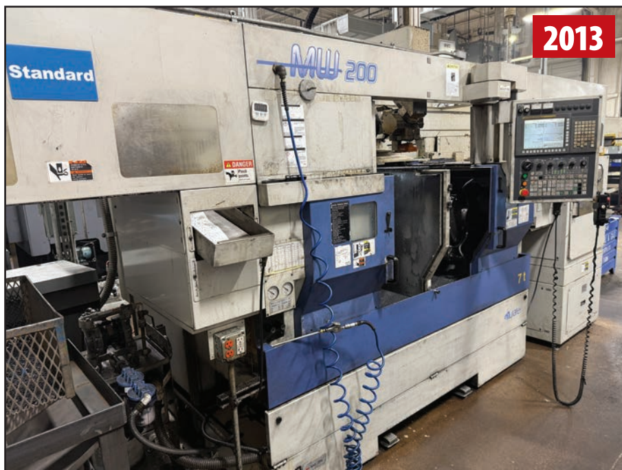
(1 OF 6) MURATEC MW-200 DUAL SPINDLE TURNING CENTER