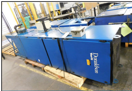
Donaldson Torit Mist Collector

Large Quantity of Donaldson Torit Mist Collectors