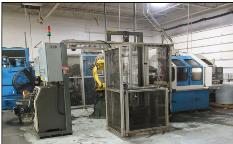
Automated Edgetech Super Abrasive Grinding Cells