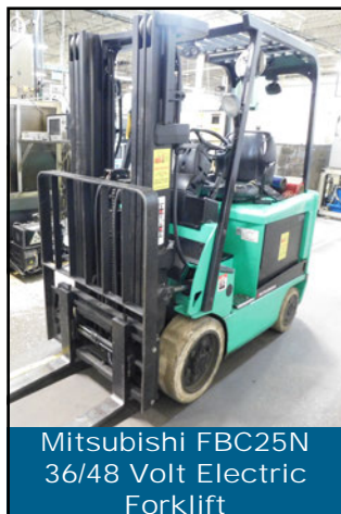
Mitsubishi FBC25N 36/48 Volt Electric Forklift

Forklift Boom, Assembled/ Disassembled Pallet Racking, Large Quantity of HD Steel Shop Carts, Rolling Self Dumping Hoppers, etc.