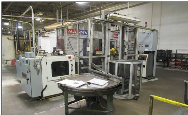
Automated Max - Tek Super Abrasive Grinding Cells

CELLS SOLD IN THEIR ENTIRETY OR PIECEMEAL