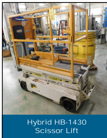
Hybrid HB-1430 Scissor Lift