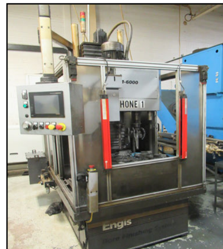
Engis LPM 6000 CNC 6 Spindle Hone