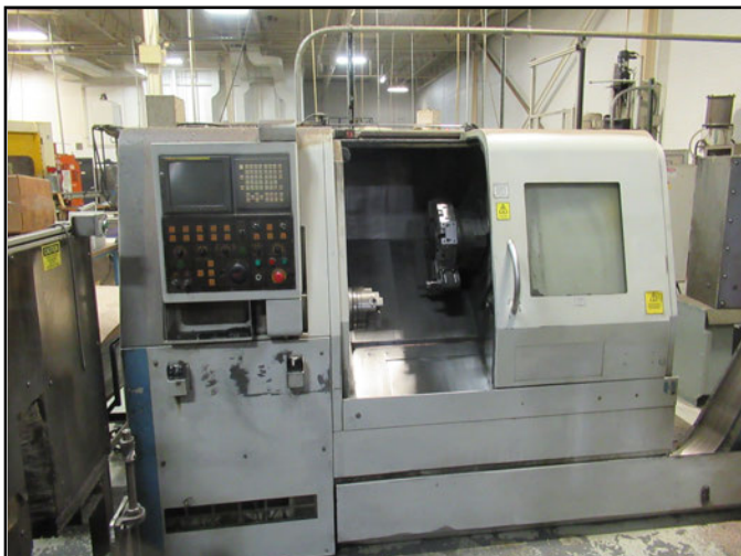
Hardinge QC CNC Lathe

Large Quantity of 48" Diameter Rotary Accumulator Tables, Vibratory Feeders, Bearing Presses, etc.