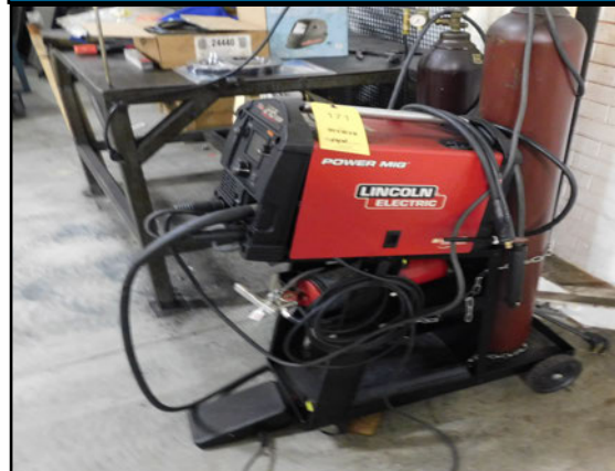
Lincoln Power Mig 210 MP Mig Welder