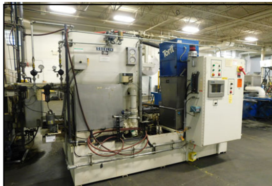
Oberlin Filtration System Model OPF-7