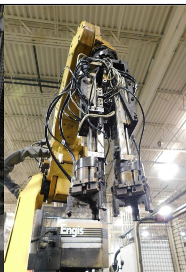
Fanuc M-10iA 6-Axis Robot w/R-30iA Controller & Dual Schunk 3-Jaw Grippers on Air Slides