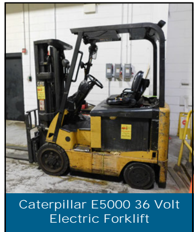
Caterpillar E5000 36 Volt Electric Forklift

For information, contact us at 224.927.5320 or sales@pplauctions.com