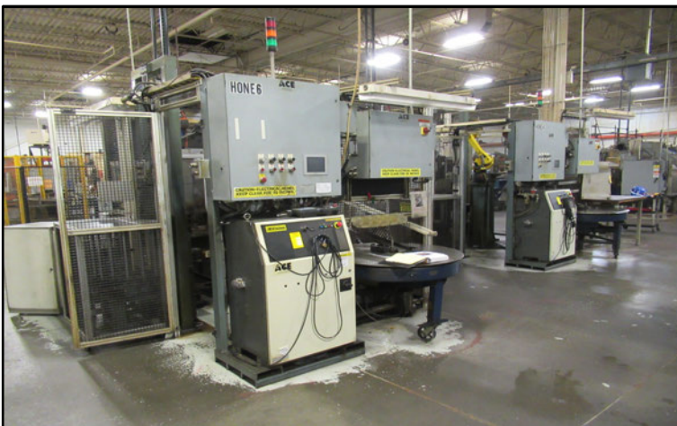
Automated Engis LPM Honing Cells

For information, contact us at 224.927.5320 or sales@pplauctions.com