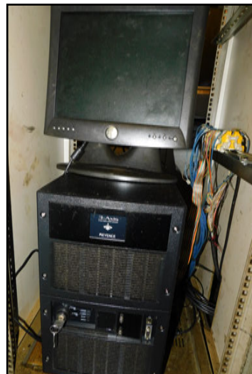
Keyence MD-F3000W Laser Marking System