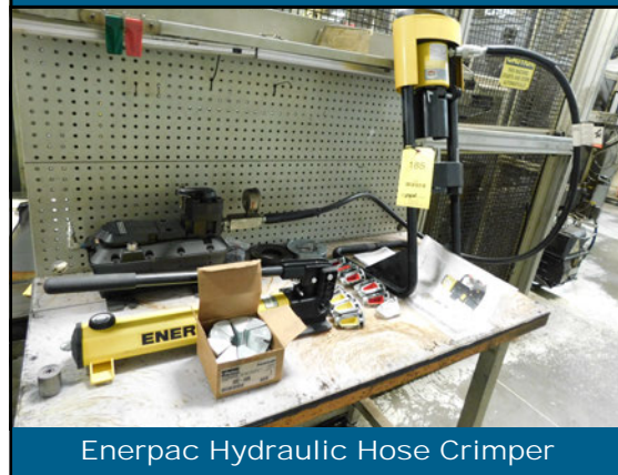
Enerpac Hydraulic Hose Crimper