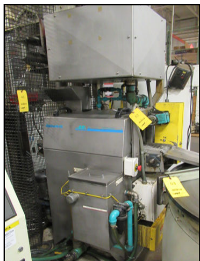
Alliance Mfg. Model CB-800E Pass Thru Parts Washing & Drying System