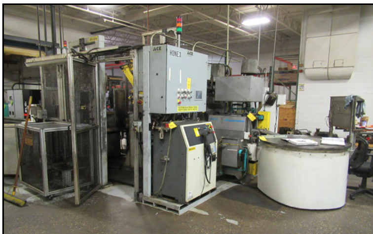
Automated Hardinge Turning & Engis Lathe