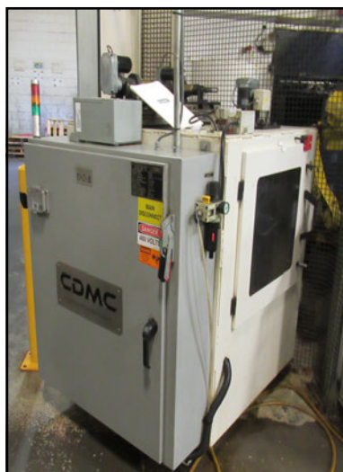
CDM 306-B 3-Head Automated Wire Brush Deburring Machine