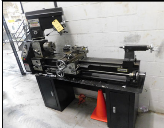
Smithy Industries 13" x 36" Geared Head Lathe

(2) Bridgeport Vertical Mills, Lista, Lyon & Equipto Industrial Cabinets, Spare Parts, Maple Top Work Benches, Pedestal & Drum Shop Fans, etc.