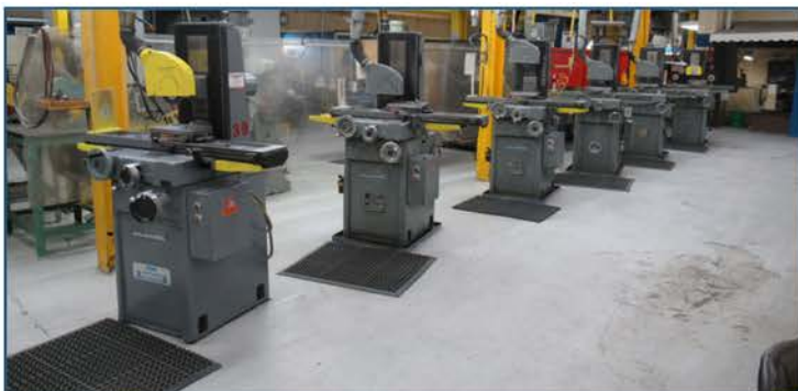
(6) Reid Surface Grinders