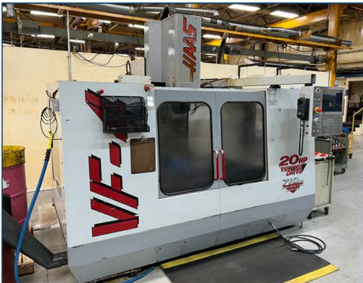
Haas VF-4 Vertical CNC Machining Center