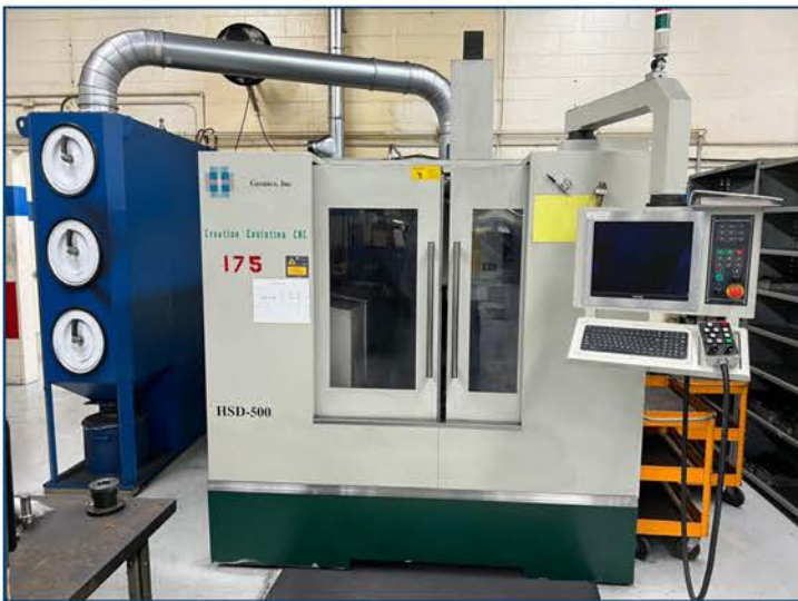
2013 Creative Evolution HSD-500 Vertical Milling Machine