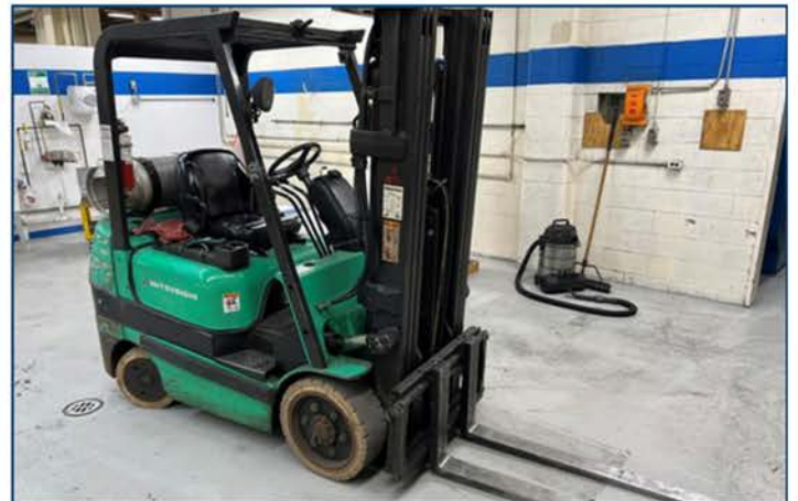
Mitsubishi FGC25K1 LP Forklift: 4,250 lb capacity