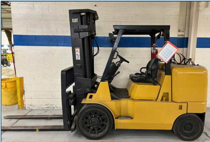
Caterpillar GC70K LP Forklift: 13,790 lb capacity