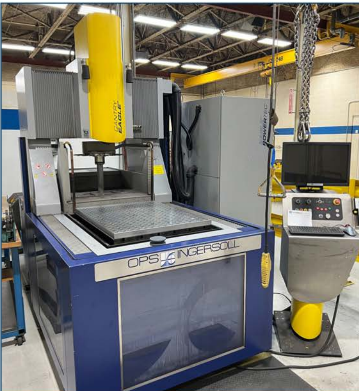
2017 OPS Ingersoll Gantry Eagle 800 Sinker EDM