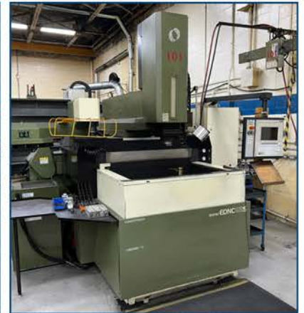
Makino EDNC85W MA Sinker EDM