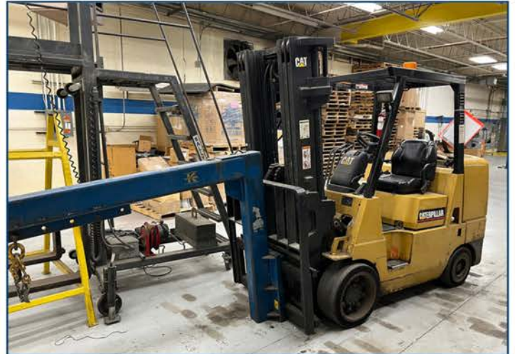
Caterpillar GC45K-SWB LP Forklift: 6,550 lb capacity