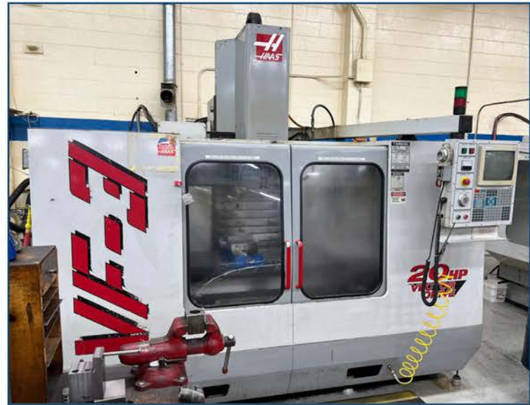
Haas VF-3 Vertical CNC Machining Center

PLEASE VISIT WEBSITE AND BIDSPOTTER FOR COMPLETE SPECIFICATIONS: BidSpotter