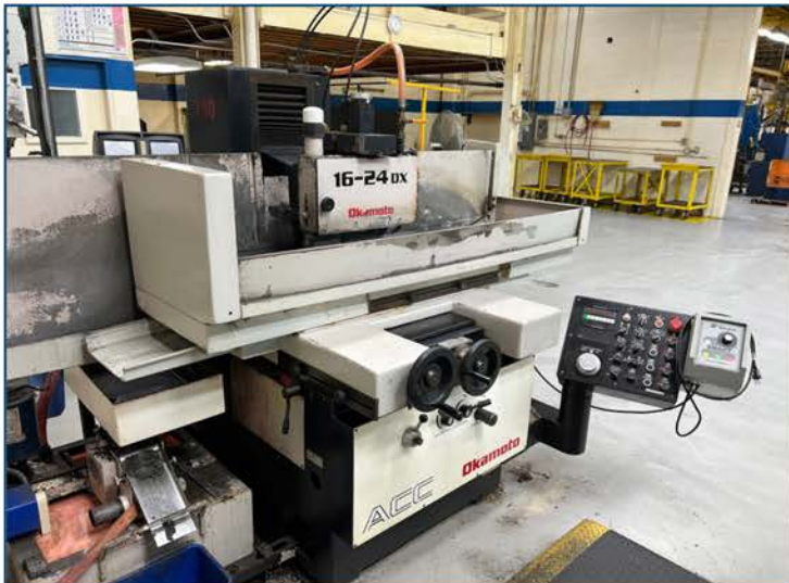
Okamoto ACC-16-24DX Surface Grinder