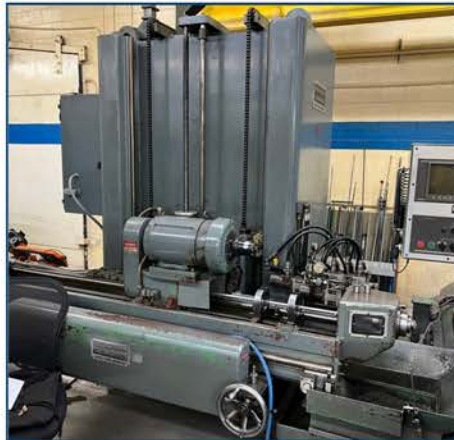
Tarus TPGD4896 Gun Drill