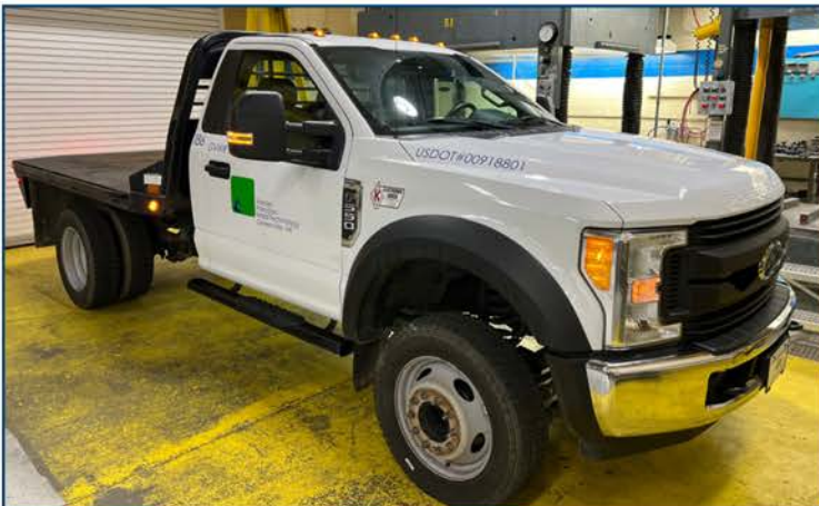
2017 Ford F-550 XL Flatbed Truck: V-10 Engine