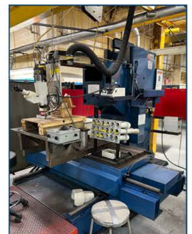
Pratt & Whitney Laser Welder with Trumpf HL54P Laser and Chiller

PLEASE VISIT WEBSITE AND BIDSPOTTER FOR COMPLETE SPECIFICATIONS: BidSpotter