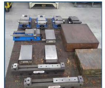
Huge Quantity of Kurt Vices, Angle Plates, and Tooling

PLEASE VISIT WEBSITE AND BIDSPOTTER FOR COMPLETE SPECIFICATIONS: BidSpotter