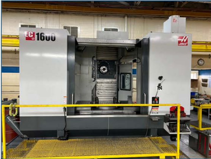
2019 Haas EC1600 Horizontal Machining Center