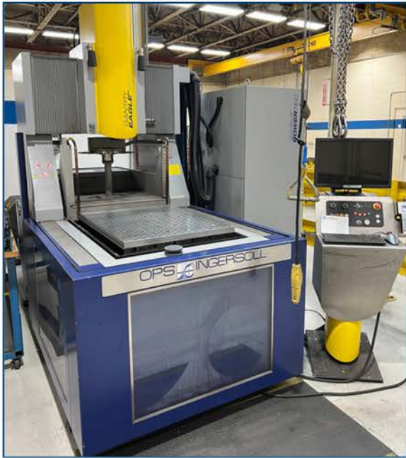
2017 OPS Ingersoll Gantry Eagle 800 Sinker EDM