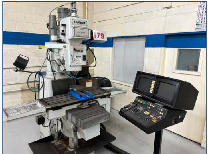
Hurco Hawk 5M CNC Vertical Milling Machine