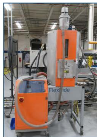
(2) Motan Material Dryers: 50 CFM and 80 CFM