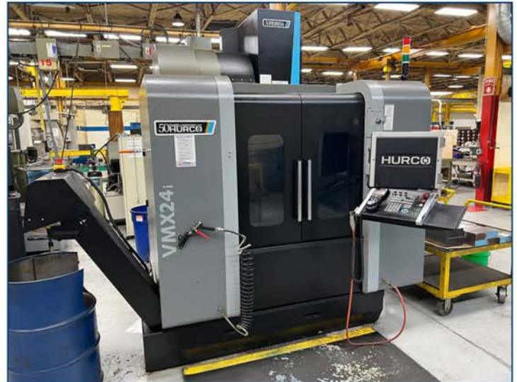
2019 Hurco VMX241 Vertical Milling Machine