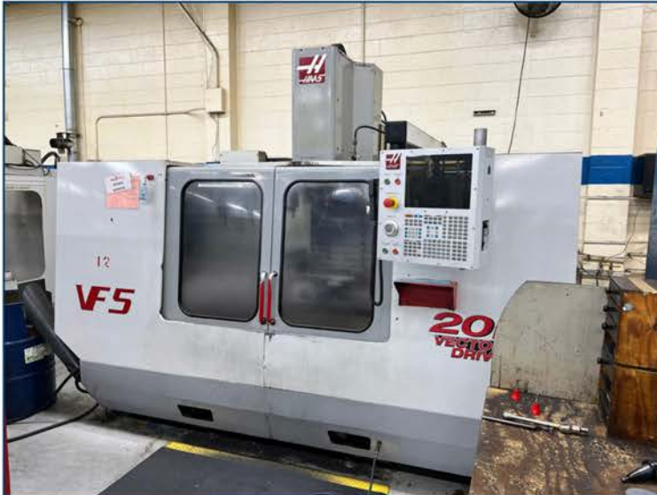
Haas VF-5 Vertical CNC Machining Center