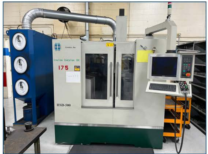
2013 Creative Evolution HSD-500 Vertical Milling Machine