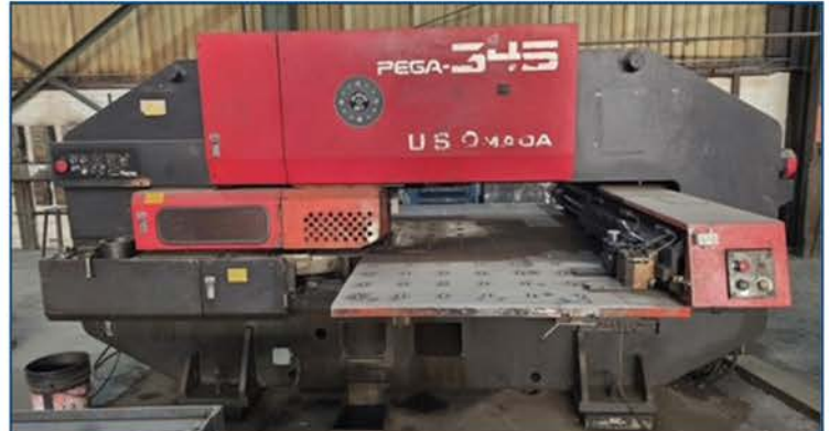
Amada Pega 354 CNC Turret Punch Press

Pacific 400 Ton 16 ft. Press Brake and Large Qty. Press Brake Dies & Rack