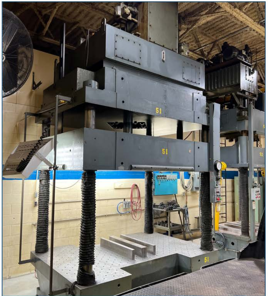
(2) 4 Post Spotting Presses: 113 Tons and 200 Tons

PLEASE VISIT WEBSITE AND BIDSPOTTER FOR COMPLETE SPECIFICATIONS: BidSpotter