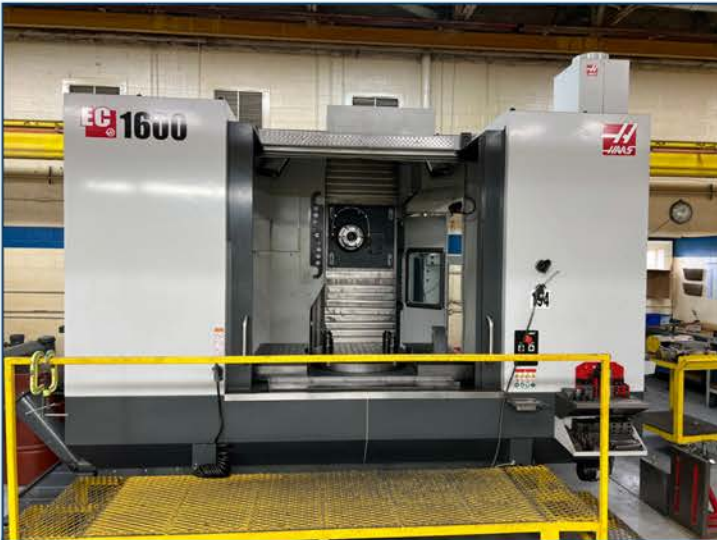
2019 Haas EC1600 Horizontal Machining Center

1212 E. Fairplains St. Greenville, MI 48838