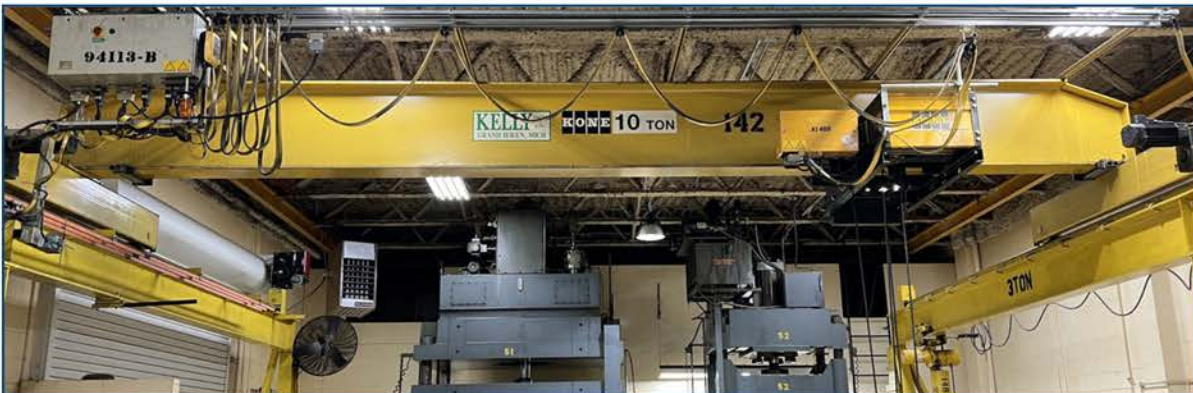
10 Ton Kone Overhead Bridge Crane

PLEASE VISIT WEBSITE AND BIDSPOTTER FOR COMPLETE SPECIFICATIONS: BidSpotter