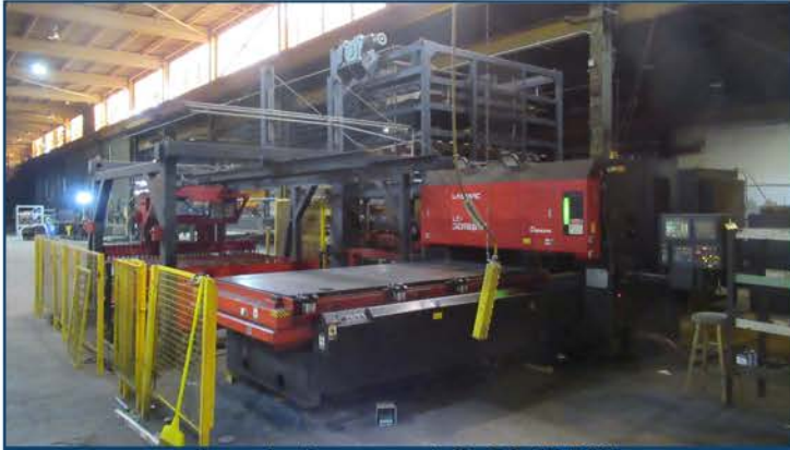
Amada Lasmac LC-3015 BIII 2,000W Laser Cutting Machine

Additional Lots Added from Metal Fab Shop in Milwaukee