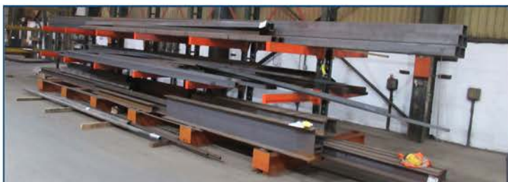
HD Cantilever Rack with Raw Material