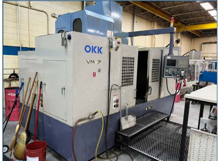
OKK VM-7 Vertical CNC Machining Center