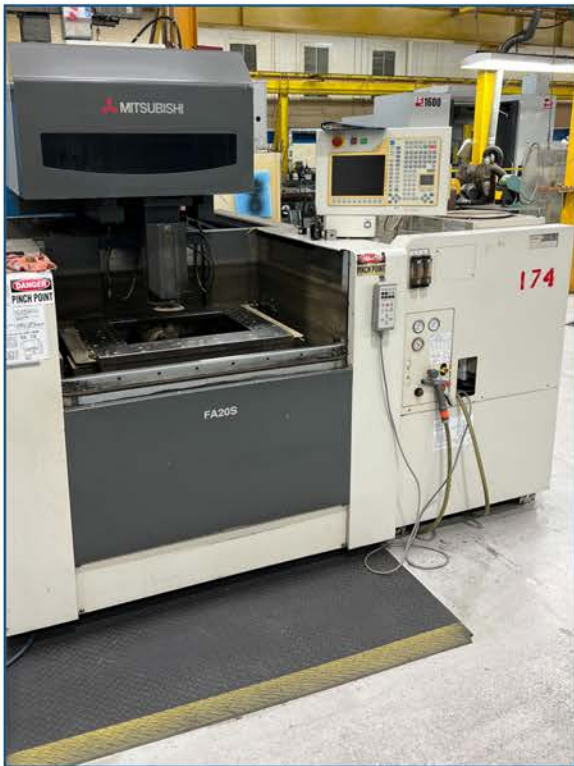
(2) Mitsubishi FA20S Wire EDM