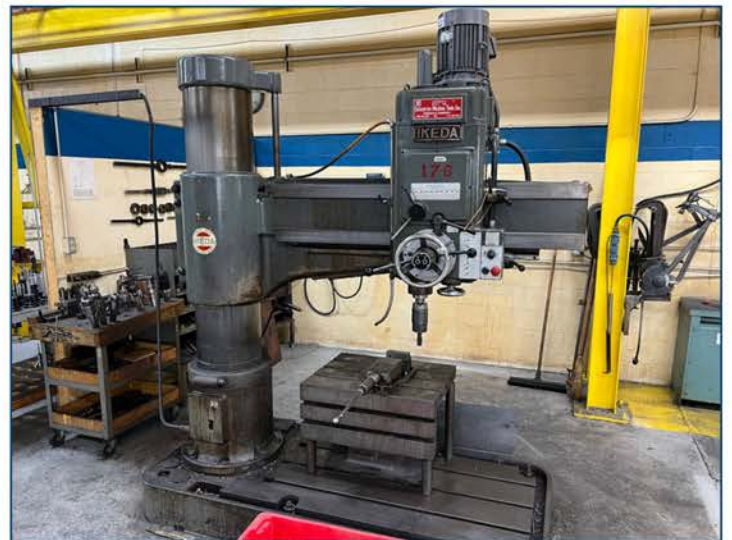
Ikeda Radial Arm Drill: 5'x13"