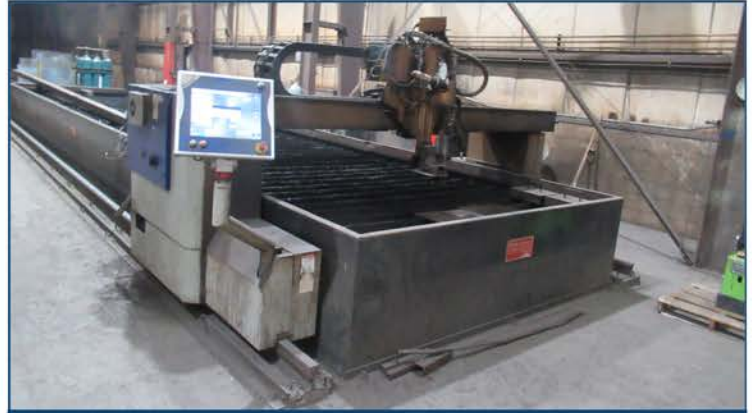
2011 Messer Platemaster CNC Plasma Cutting Table