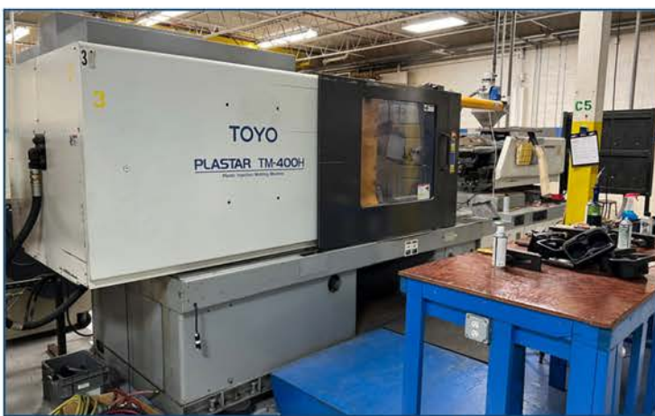
400 Ton Toyo TM-400H Plastic Injection Molding Machine