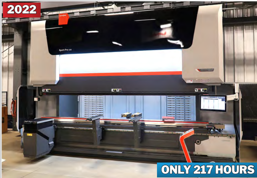
2022 BYSTRONIC XPERT PRO 320/4300 EXTENDED 8-AXIS CNC HYDRAULIC PRESS BRAKE