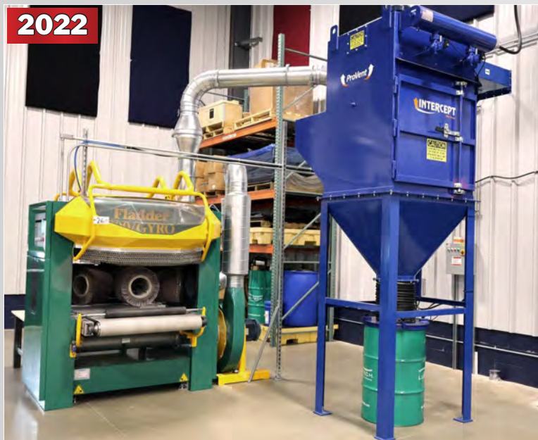
2022 FLADDER MDL. 200/GYRO-1000VAC BRUSH TYPE DEBURRING MACHINE

LARGE QUANTITY OF BYSTRONIC PRESS BRAKE TOOLING AND TOOL CABINET