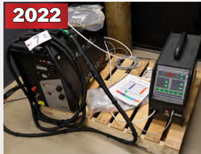
IPG PHOTONICS LIGHT WELD XL SYSHHWXC0000002U LASER WELDING MACHINE