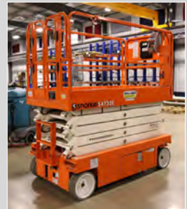
SNORKEL S4732EANSI SCISSOR PLATFORM LIFT