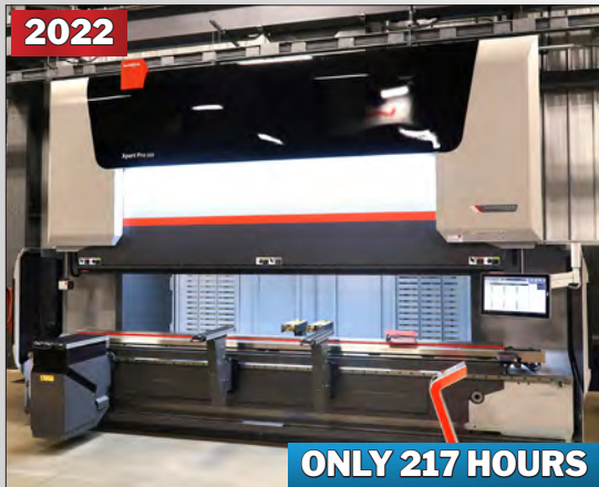
BYSTRONIC XPERT PRO 320/4300 EXTENDED 8-AXIS CNC HYDRAULIC PRESS BRAKE