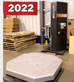
DURAVANT WULFTEC WSMH-SPL-B PALLET WRAPPER