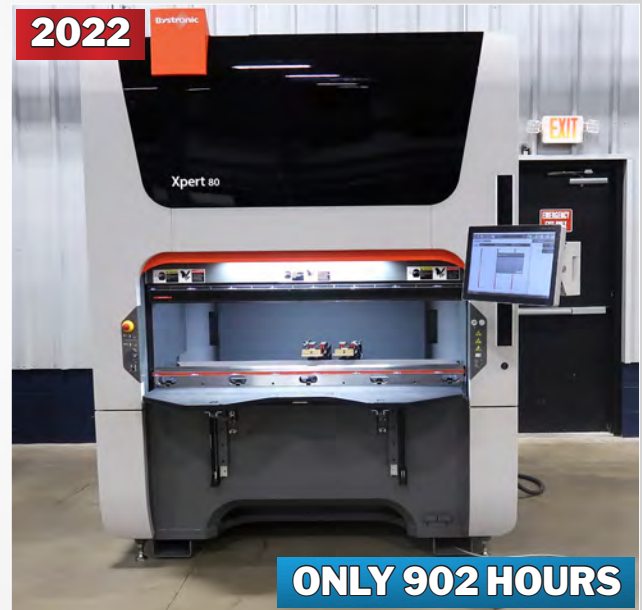
2022 BYSTRONIC XPERT 80/1530 8-AXIS CNC HYDRAULIC PRESS BRAKE