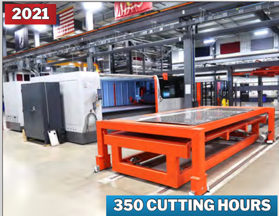
BYSTRONIC BYSTAR 10KW 4020 DYNAMIC EDITION FIBER LASER

FEATURING 2021 BYSTRONIC BYSTAR FIBER 4020 10 KW LASER WITH AUTOMATION, 2022 BYSTRONIC XPERT PRO 320/4300 PRESS BRAKE, 2022 BYSTRONIC XPERT 80/1530 PRESS BRAKE, 2021 BLM LT7 FIBER TUBE LASER, 2021 BLM ELECT-80 CNC ELECTRIC TUBE BENDER, NEVER COMMISSIONED, BRAND NEW, 2021 LIBERTY N2/AC GENERATOR SYSTEM, 2022 FLADDER 200/GYRO-1000 DEBURRER, WELDING DEPARTMENT, 2022 YALE 10000 LB. & (2) YALE 5,000 LB. FORKLIFTS, COMBI-LIFT C10000 MULTI-DIRECTIONAL FORKLIFT & MORE!