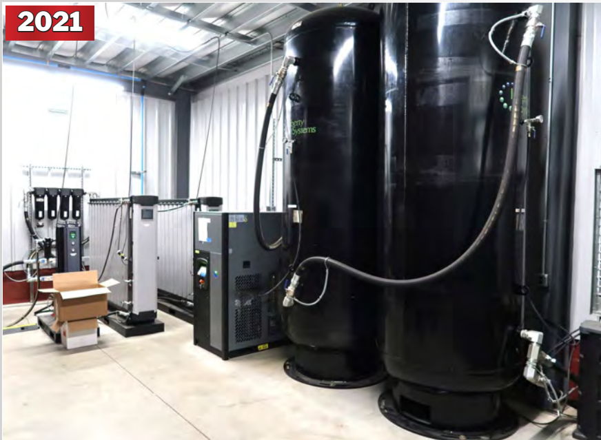
LIBERTY SYSTEMS PRESSURE SWING ABSORPTION (PSA) NITROGEN GAS GENERATOR SYSTEM