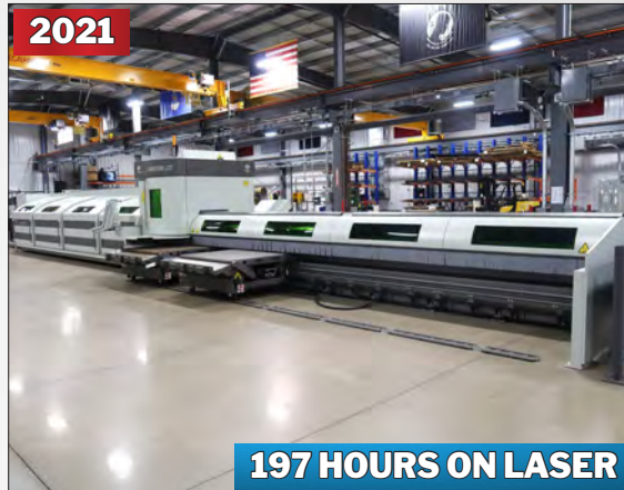
BLM ADIGE LASER TUBE LT7 FIBER TUBE LASER