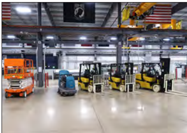
VIEW OF FORKLIFTS & MANLIFT