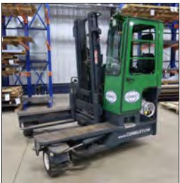
COMBI-LIFT C1000 MULTI-DIRECTIONAL FORKLIFT