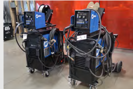
VIEW OF MILLER WELDERS