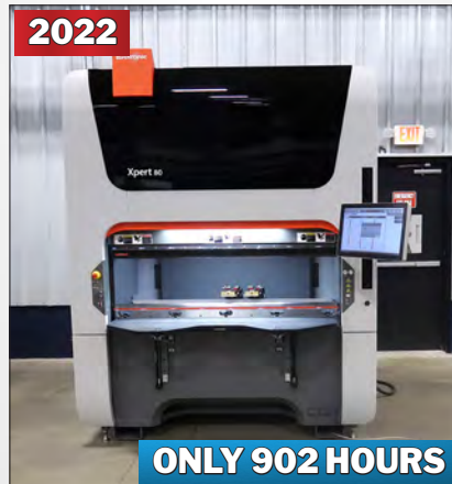
BYSTRONIC XPERT 80/1530 8-AXIS CNC HYDRAULIC PRESS BRAKE