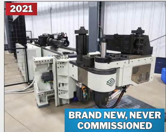
BLM ELECT 80 9-AXIS ELECTRIC TUBE BENDER

Inspection: Monday, June 16th 8:00 AM - 3:00 PM ET or By Appointment