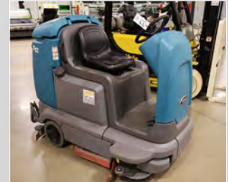
TENNANT T-12 36VDC FLOOR SCRUBBER