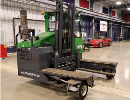
COMBI-LIFT C1000 MULTI-DIRECTIONAL FORKLIFT TRUCKBENDER