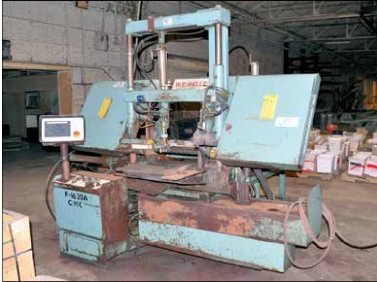
W.F. Wells F1620-A, CNC Twin Column Horizontal Bandsaw

OFFERING ONLINE BIDDING ONLY, SIGN UP NOW!