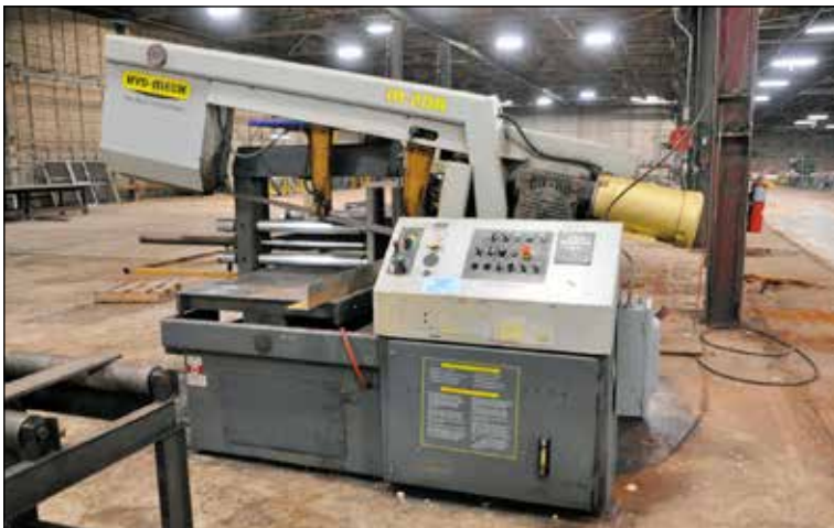
Hyd-Mech M-20A Fully Automatic Mitring Bandsaw with Bundle Clamps