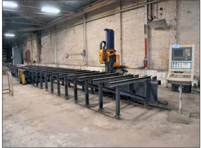
Peddinghaus MDL 1000/1B Ocean Avenger II 42" x 480" CNC Beam Drill Line