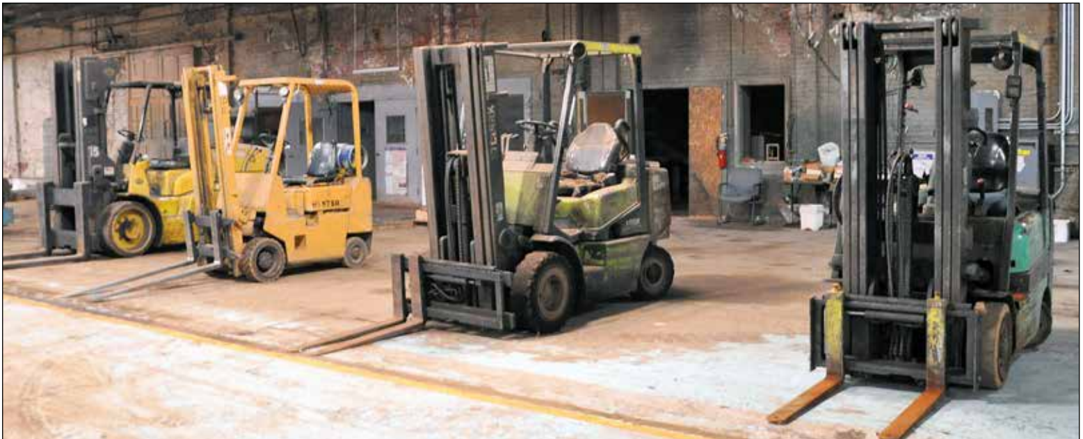
Large Assortment of Forklifts