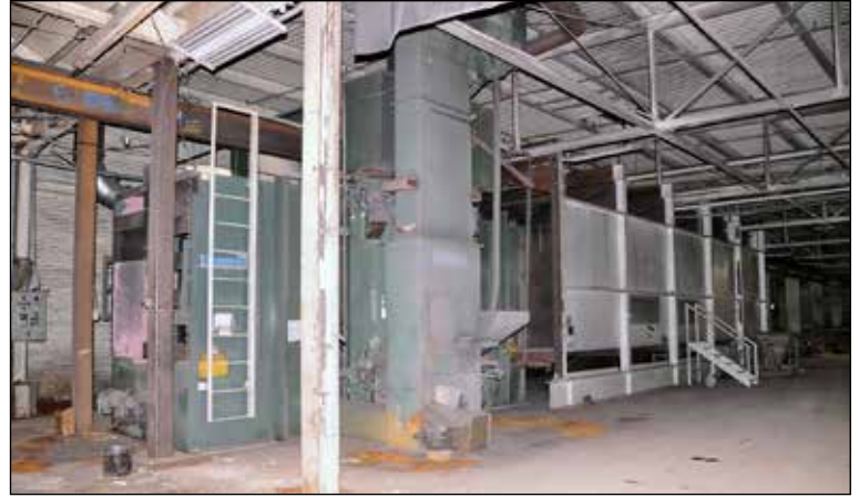
Pangborn ES 1986-20K, 48" x 60" Shot Blasting Machine with Monorail Conveyor System