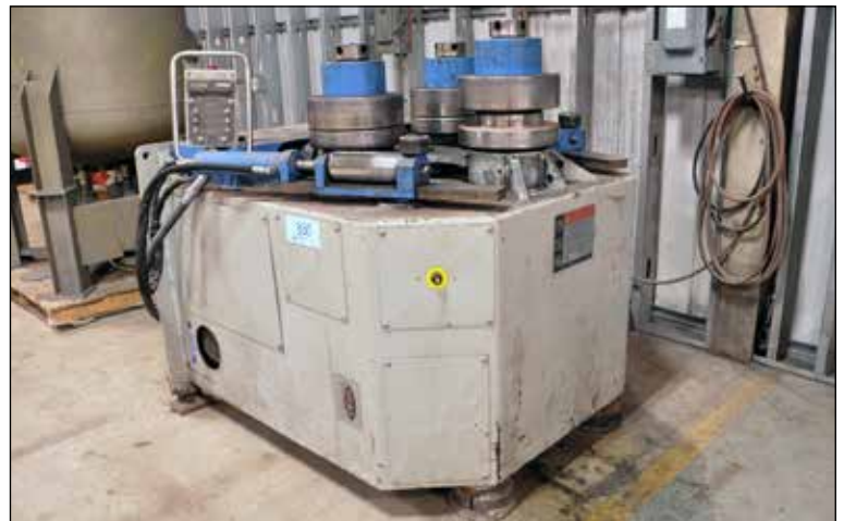
WDM 4" x 4" x 1/2" Hydraulic Angle Roll with AR-520 Pendant Control