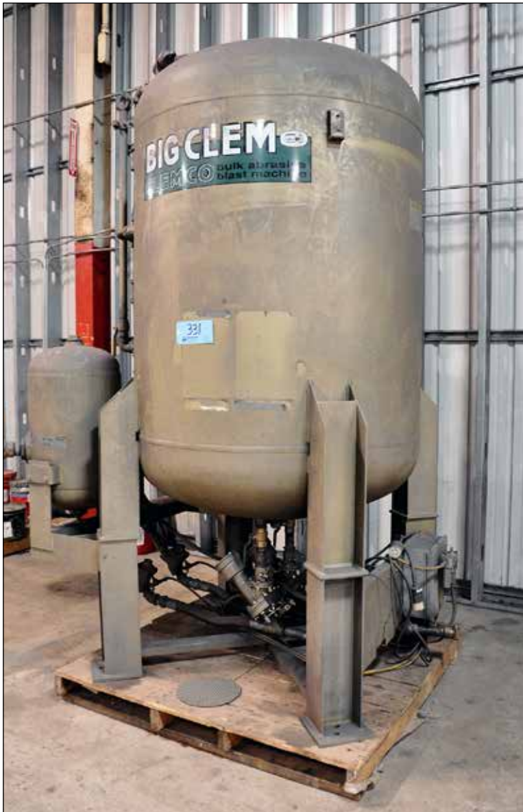
Clemco Big Clem Bulk Blaster