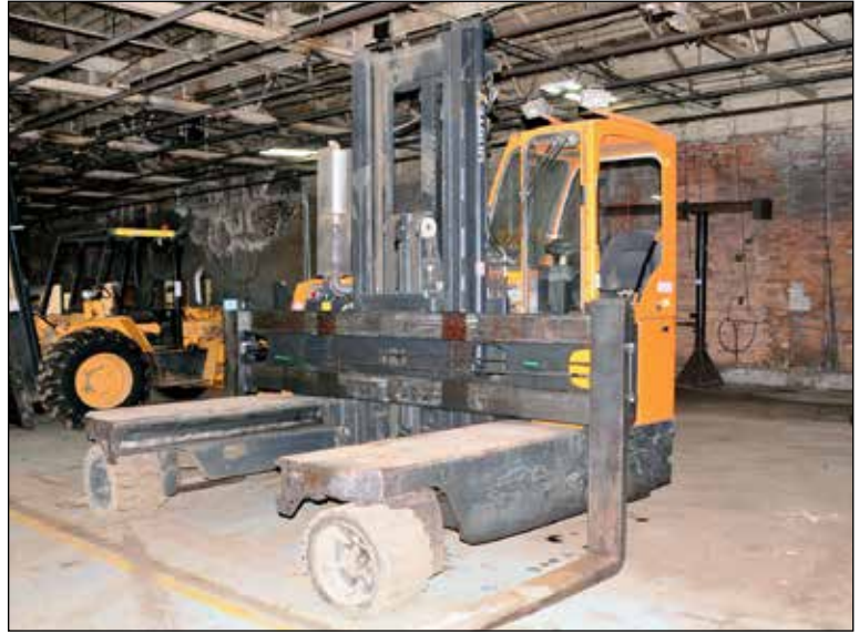
(2) Hubtex 18,000lb. Capacity, Side Loader Forklifts