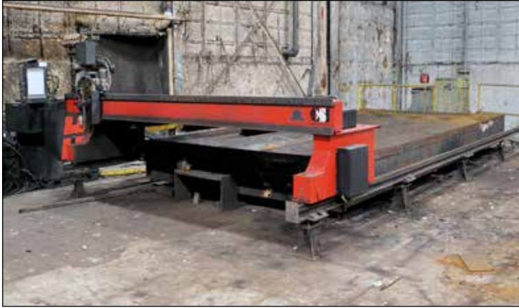
CSI Kodak HPR 400 CNC Plasma Cutting System, 12' x 25' Table, 400 AMP Power Supply

LOCATION: 2300 East Ganson Street, Jackson, MI 49202