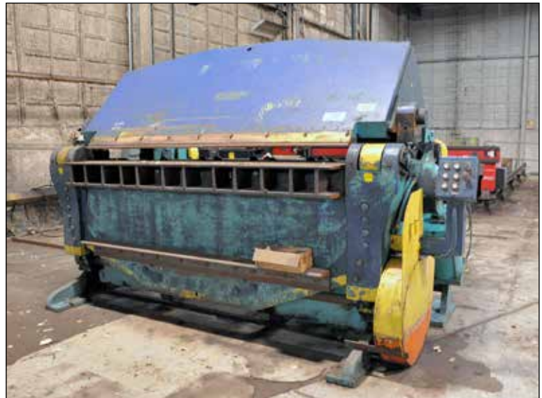
Dreis & Krump 3/4" x 96" Power Leaf Brake