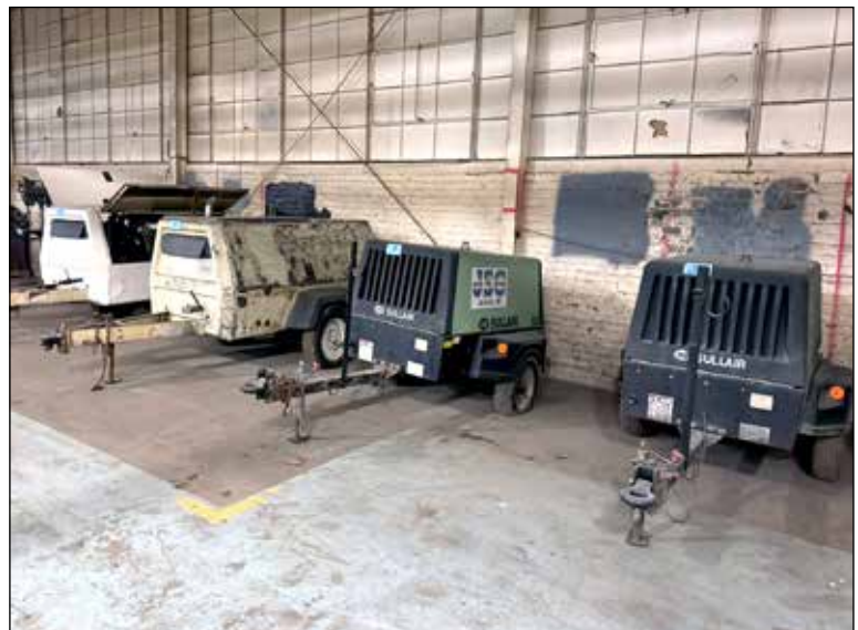
(4) Portable Air Compressors to 250 CFM