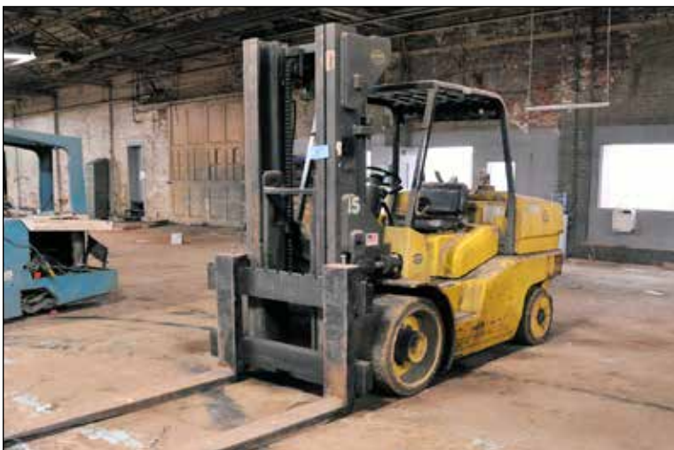
Hoist 18,000 Lb. Capacity Forklift