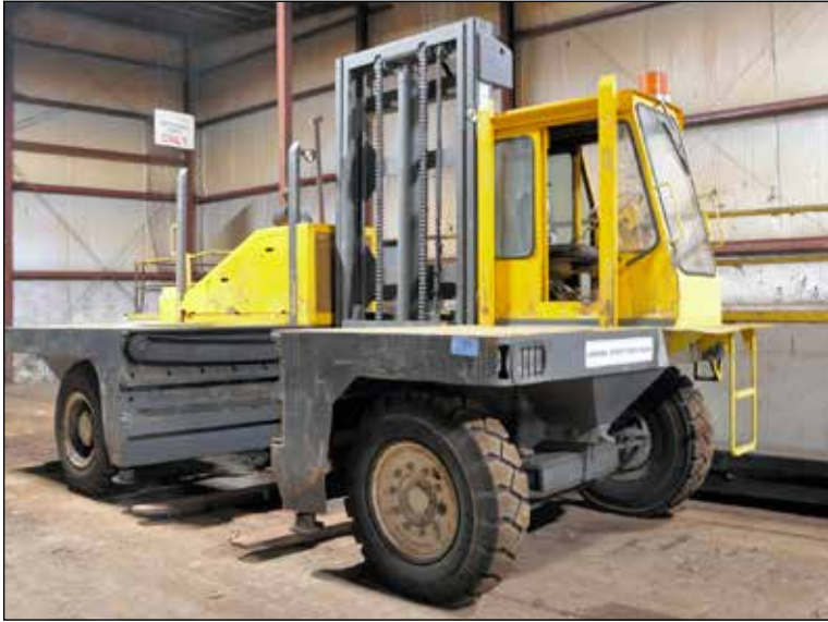
Lansing Henley 10-Ton Side Loader Forklift

OFFERING ONLINE BIDDING ONLY, SIGN UP NOW!