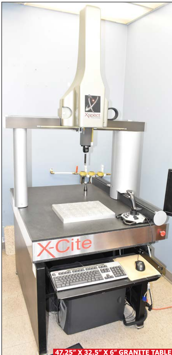
47.25" X 32.5" X 6" GRANITE TABLE

WENZEL XSPECT X-CITE AXIOM T00 shop floor CMM