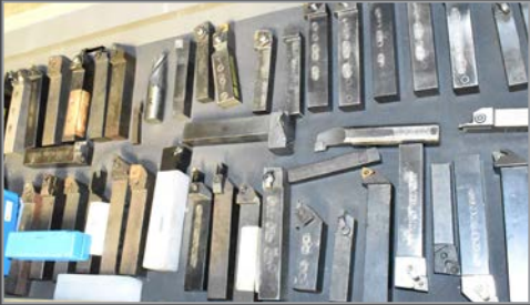
Selection of perishable tooling available