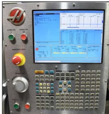
HAAS CNC control