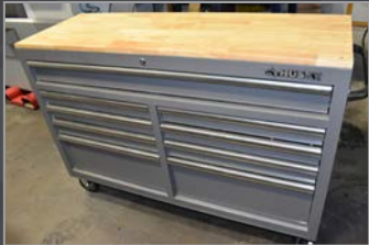
Selection of rolling tool cabinets available

ALSO: LARGE ASSORTMENT (150+) of quality brand name CAT 40 tool holders; KURT machine vises; LANG MAKRO-GRIP 5-axis precision vises; XIN DIAN machine vises; LISTA tool cabinets; work benches; perishable tooling comprising carbide end mills, drills, taps, reamers, carbide insert cutters, carbide insert boring tools, carbide inserts; inspection tooling and equipment featuring vernier calipers, ID and OD micrometers, gauges and equipment, hydraulic pallet jacks, rolling tool cabinets and MORE!