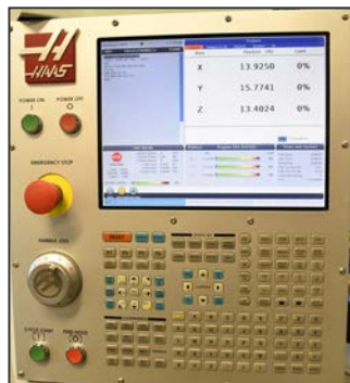
HAAS CNC control