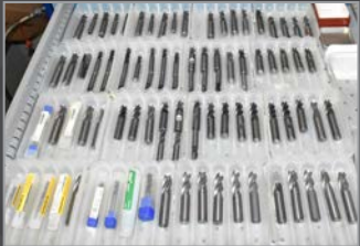
Selection of perishable tooling available