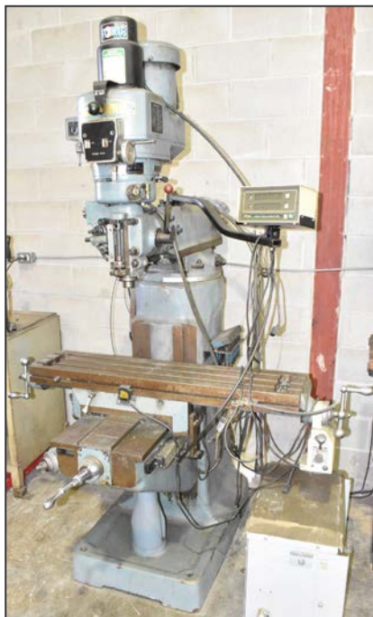
NANTONG turret milling machine

WENZEL XSPECT X-CITE AXIOM T00 shop floor CMM