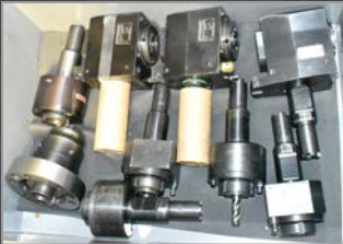
Selection of live tooling available