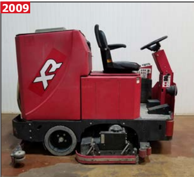
FACTORY CAT GTX 46-C 36V ELECTRIC RIDE-ON floor scrubber