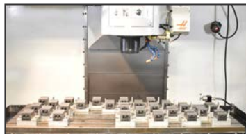
Interior view HAAS VF-4SS 5-axis ready CNC high speed vertical machining center

HAAS (2005) VF-4SS 5-axis ready CNC high speed vertical machining center with HAAS CNC control, 52" x 18" t-slot table, travels: X-50", Y-20", Z-25", speeds to 12,000 rpm, CAT 40 spindle taper, 24 station ATC, coolant, RENISHAW TS27R tool probing system, chip auger, 8899 hrs. cycle start time, 8341 hrs. feed cutting time recorded on meter at time of listing, s/n: 41756