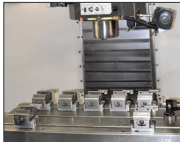
Interior view HAAS VF-2SS CNC high speed vertical machining center