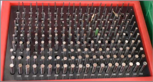
Selection of inspection equipment available