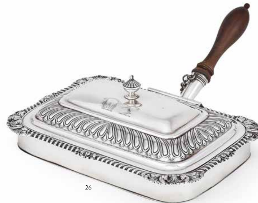
26 A GEORGE IV SILVER OBLONG CHEESE WARMING DISH REBECCA EMES & EDWARD BARNARD I, LONDON 1820 With a detachable wooden handle, a lobed domed finial to the ogee domed and lobed cover, engraved with two crests, a gadrooned border with shells and foliage at intervals 25cm (9 3/4in) long 1083g (34.8 oz)

The crests for JOHNS(T)ON(E) and KIRKPATRICK.