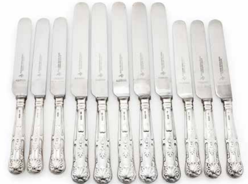
132 (part lot)