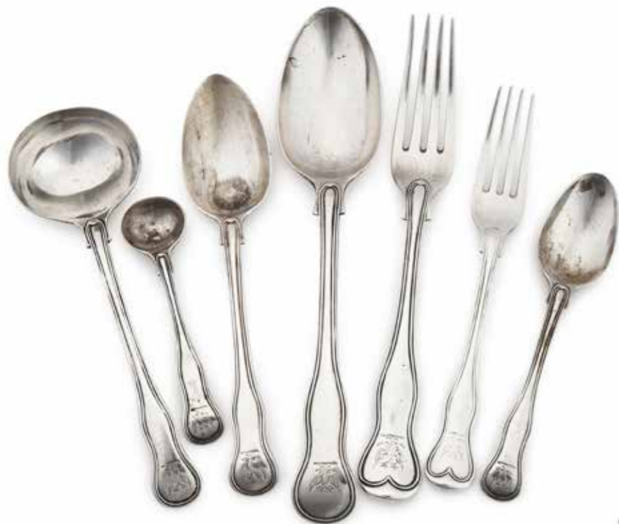
70 (part lot)

70 A VICTORIAN SILVER HOUR GLASS PATTERN PART TABLE SERVICE GEORGE ADAMS, LONDON 1873 Engraved with a crest, comprising: Nine table forks, five table spoons, three dessert forks, two dessert spoons, six tea spoons, a sauce ladle and a mustard spoon 1880g (60.45 oz)