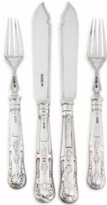
129 (part lot)

129 A SET OF TWELVE SILVER KING'S PATTERN FISH KNIVES AND FORKS ATKIN BROTHERS, SHEFFIELD 1930 The knives 22cm (8 3/4in) long, the forks 18.5cm (7 1/4in) long Loaded