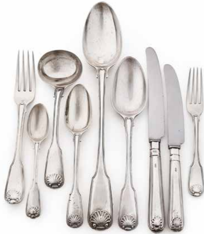
130 (part lot)

130 A MATCHED SILVER FIDDLE, SHELL AND THREAD PATTERN PART TABLE SERVICE VARIOUS MAKERS AND DATES Some crested, comprising: Twenty five table forks, eight table spoons, seventeen dessert forks, thirty five dessert spoons, eighteen tea spoons, four sauce ladles, a basting spoon 7186g (231.05 oz)