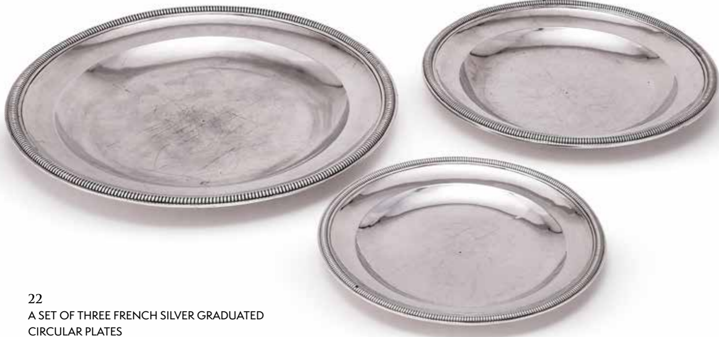
22 A SET OF THREE FRENCH SILVER GRADUATED CIRCULAR PLATES JOHN BAPTISTE CLAUDE ODIOT, PARIS 1809-1819 .950 STANDARD With nulled borders 25cm (9 3/4in), 30cm (11 3/4in) and 38cm (15in) diameter 3047g (97.95 oz)