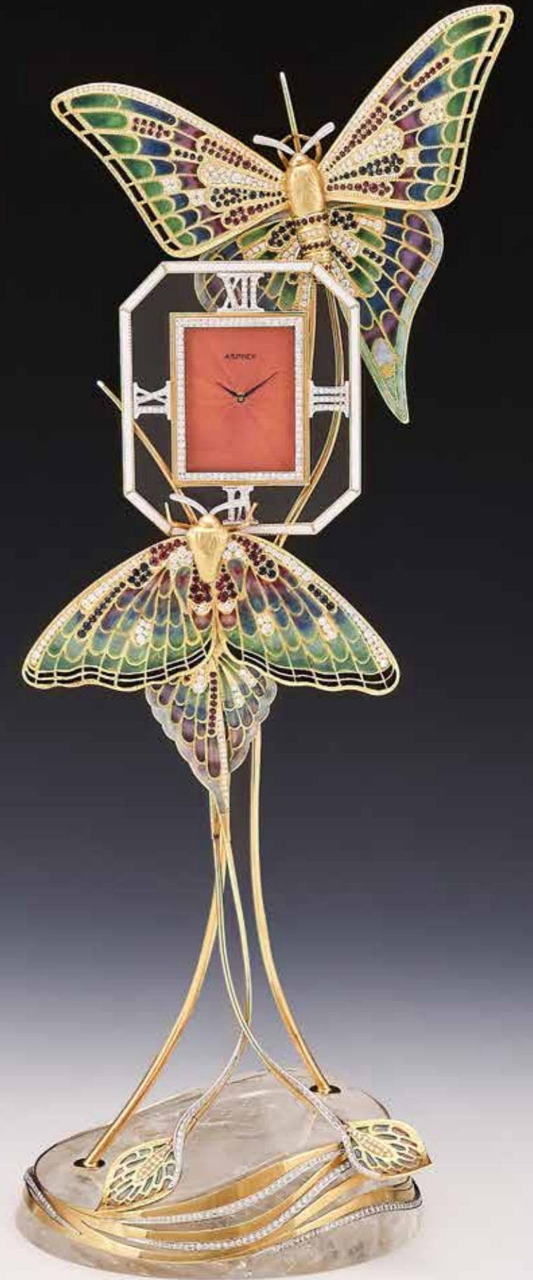
170 AN 18 CARAT GOLD, ENAMEL AND DIAMOND SET BUTTERFLY CLOCK ASPREY & CO. LTD., LONDON 1987

The two 18 carat gold and plique a jour enamelled butterflies set with diamonds, sapphires and rubies, to a gold mounted and diamond set rock crystal base, the clock with a pink guilloché enamel dial, diamond set bezel and Roman numerals, quartz movement, screwed down case back with four screws, mounts and dial signed Asprey 37cm high