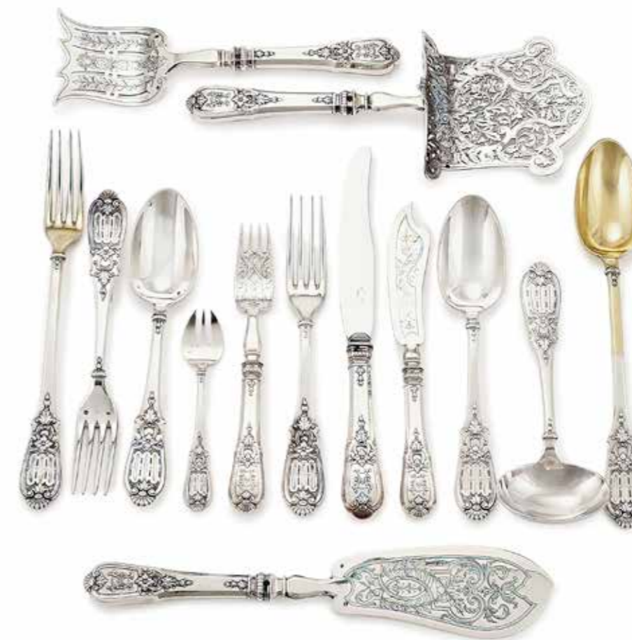
128 (part lot)