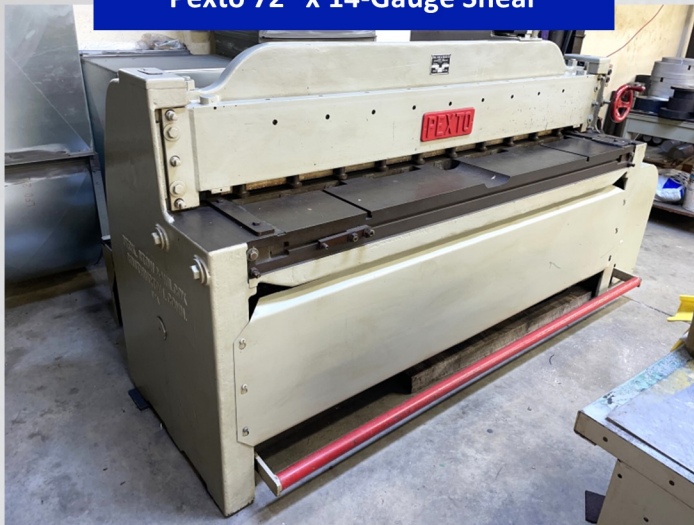
Pexto 72" x 14-Gauge Shear