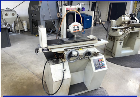
Harig Mdl. 618 Surfacer Grinder