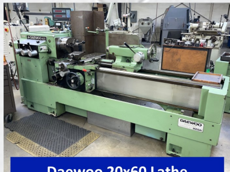
Daewoo 20x60 Lathe