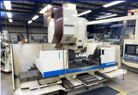
Okuma MC-60VAE CNC VMC