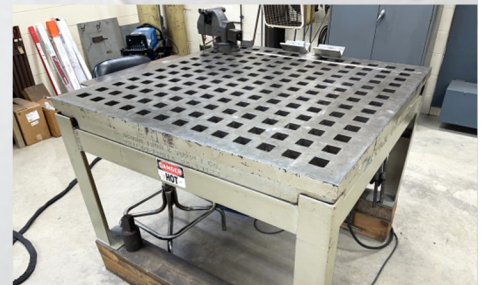
Acorn 48" x 48" Welding Table