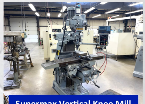
Supermax Vertical Knee Mill