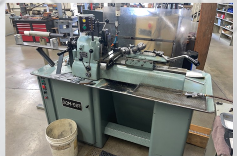
Taiwan Machinery Lathe