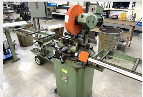
Bewo Mdl. 350LT Cold Saw