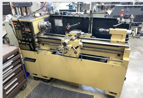
Romi 13-5 14" x 48" Lathe