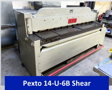
Pexto 14-U-6B Shear