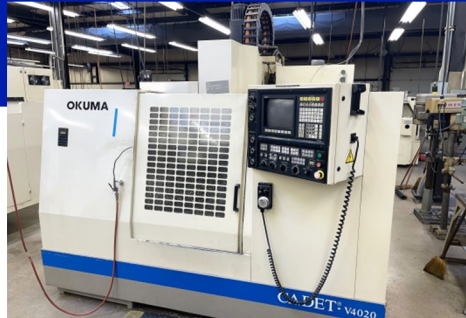
Okuma CadetV4020 CNC VMC