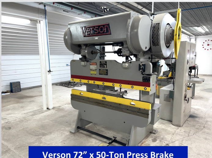
Verson 72" x 50-Ton Press Brake