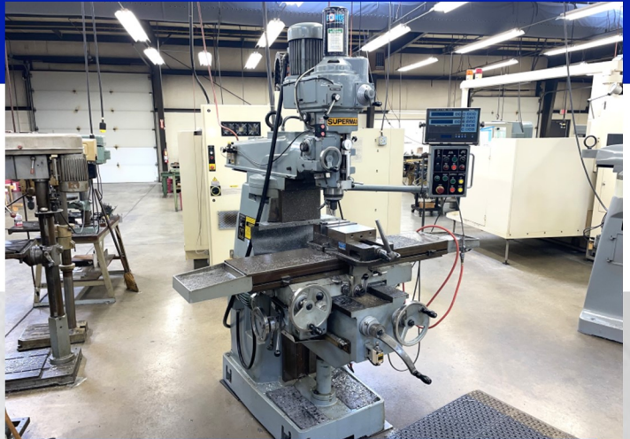
Supermax Mdl. YCM-2VAS Vertical Knee Mill