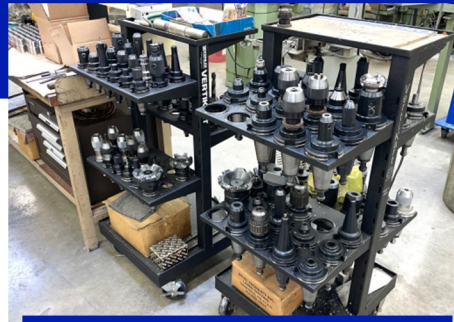
CAT 40 & CAT 50 Tooling