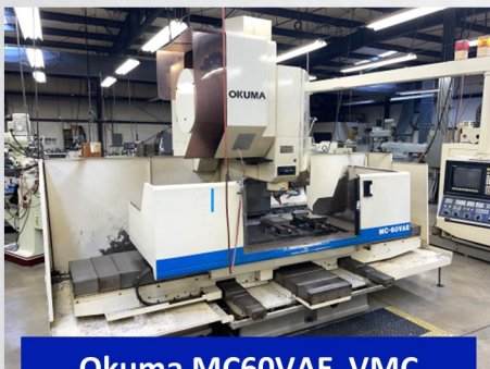
Okuma MC60VAE VMC

Public Inspection · Monday, February 24th from 8:30am - 3:30pm