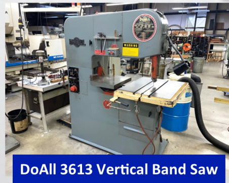
DoAll 3613 Vertical Band Saw