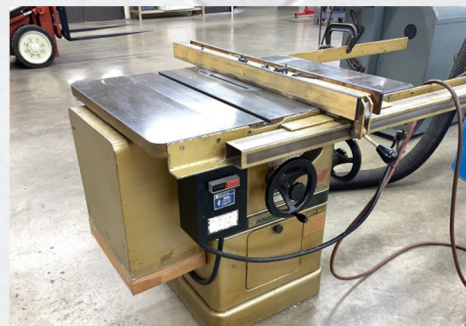
Powermatic Table Saw