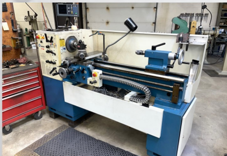
Romi T14 14" x 40" Lathe