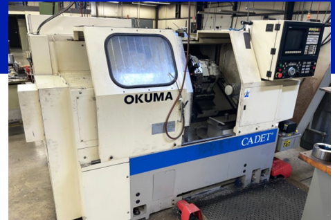
Okuma LNC8 Turning Center