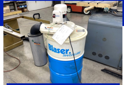
Blaser Swisslube Collector