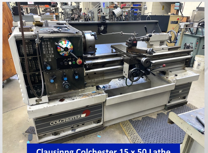
Clausing Colchester 15 x 50 Lathe