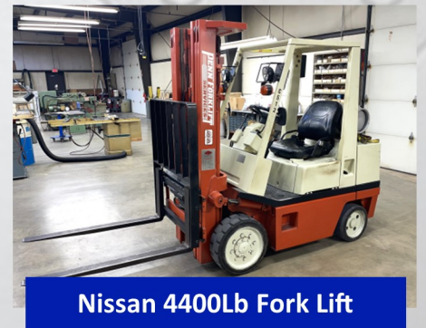
Nissan 4400Lb Fork Lift