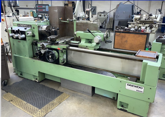
(2) Daewoo Mdl A20 20" x 60" Lathes