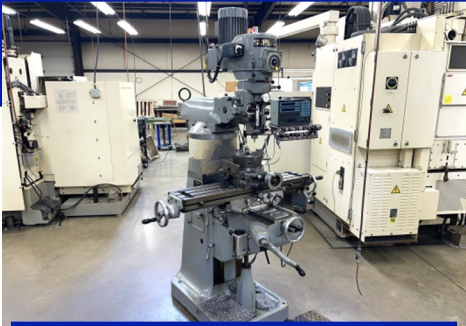
Supermax Vertical Knee Mill