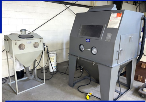
Abrasive Dry Blast Cabinets