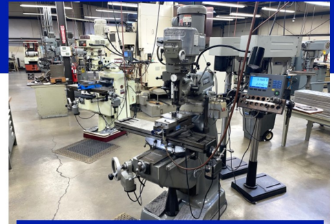
Bridgeport Vertical Knee Mill