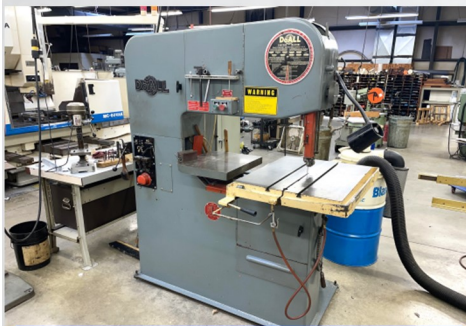
DoAll Vertical Band Saw