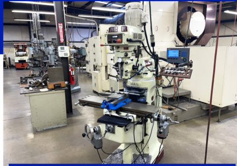
Acer Vertical Knee Mill