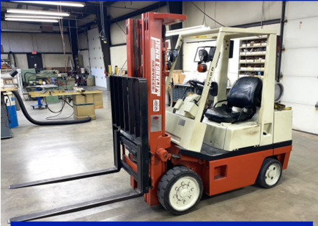
Nissan 4400Lb Fork Lift