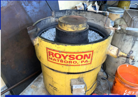
Royson Vibratory Finisher