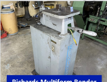
Richards Multiform Bender