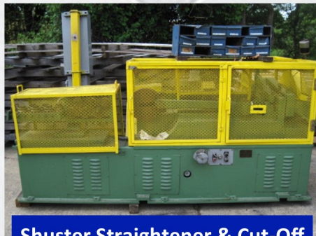
Shuster Straightener & Cut-Off