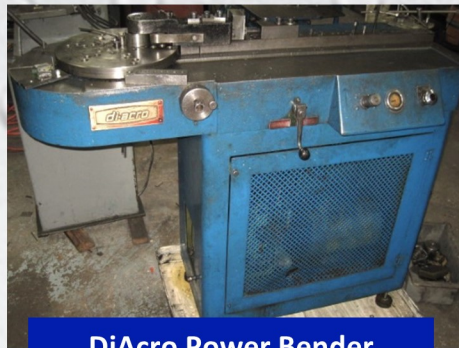
DiAcro Power Bender