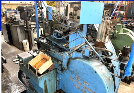
Waterbury #20 Thread Roller