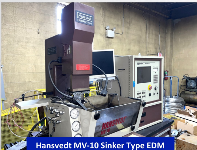
Hansvedt MV-10 Sinker Type EDM