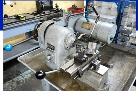
Hardinge HSL-59 Speed Lathe