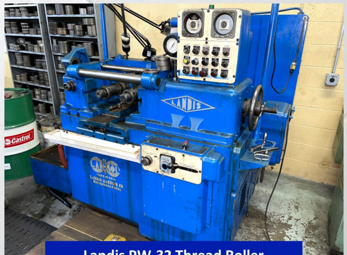
Landis PW-32 Thread Roller