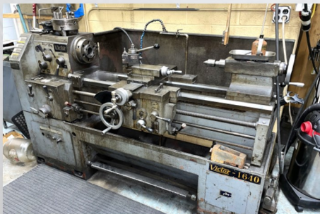
Victor 16 x 40 Lathe