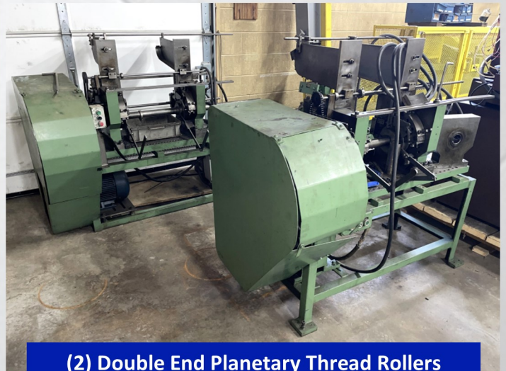
(2) Double End Planetary Thread Rollers