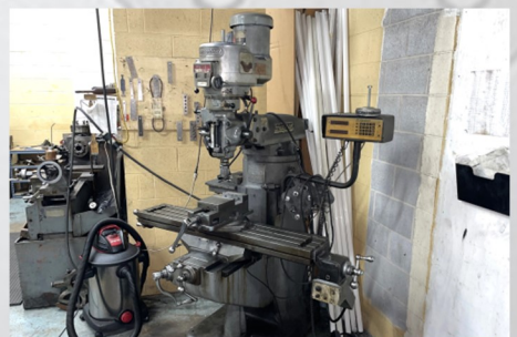
Bridgeport Vertical Knee Mill