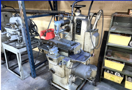
Sundstrand Production Mill