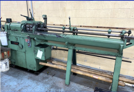
Lewis Straightener & Cut-Off