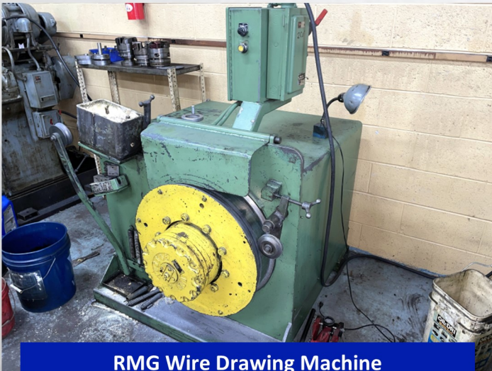
RMG Wire Drawing Machine