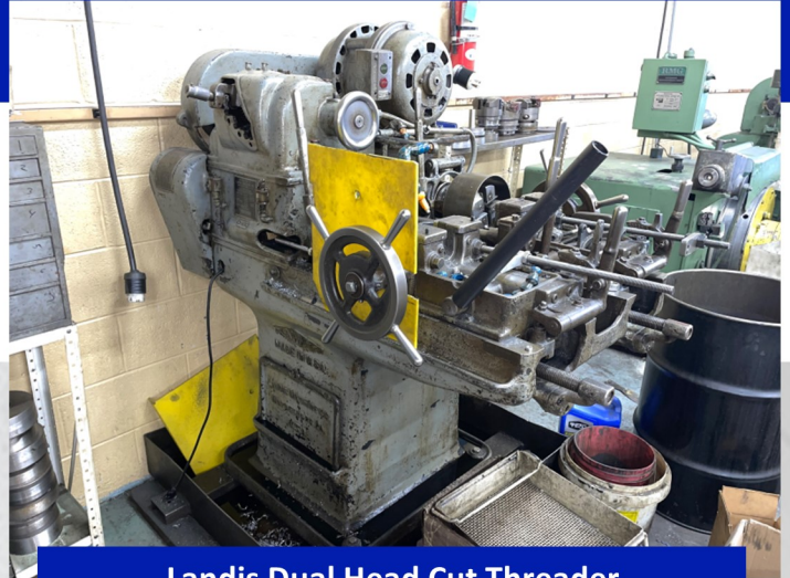
Landis Dual Head Cut Threader