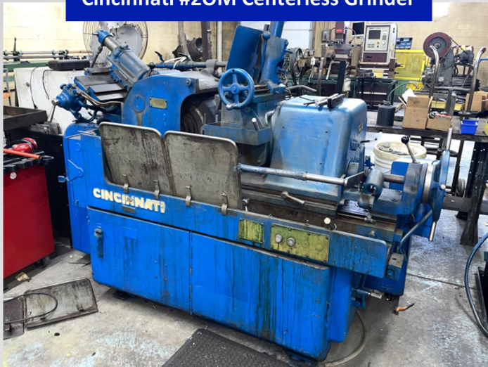
Cincinnati #20M Centerless Grinder