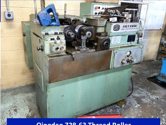
Qingdao Z28-63 Thread Roller