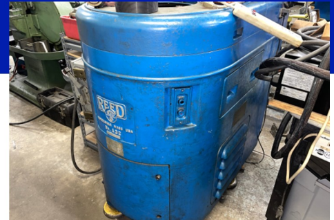
Reed A-22 Thread Roller