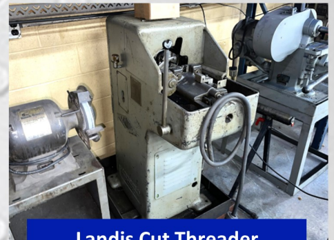
Landis Cut Threader