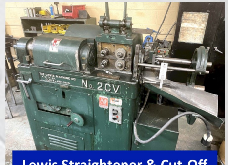
Lewis Straightener & Cut-Off