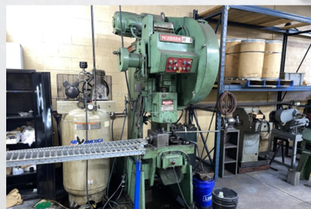
Niagara 45-Ton OBI Press