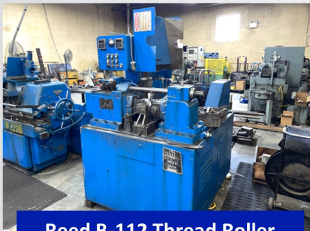
Reed B-112 Thread Roller

Public Inspection · Wednesday, April 16th from 8:30am - 3:30pm