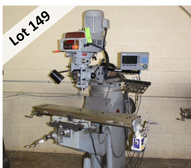
ACER E-MILL EVS11 VERTICAL MILL