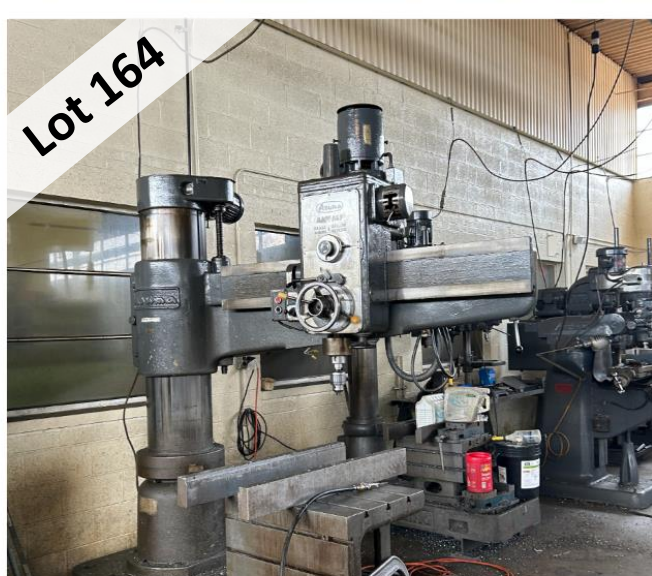
AZUMA RADIAL BORING & DRILLING MACHINE