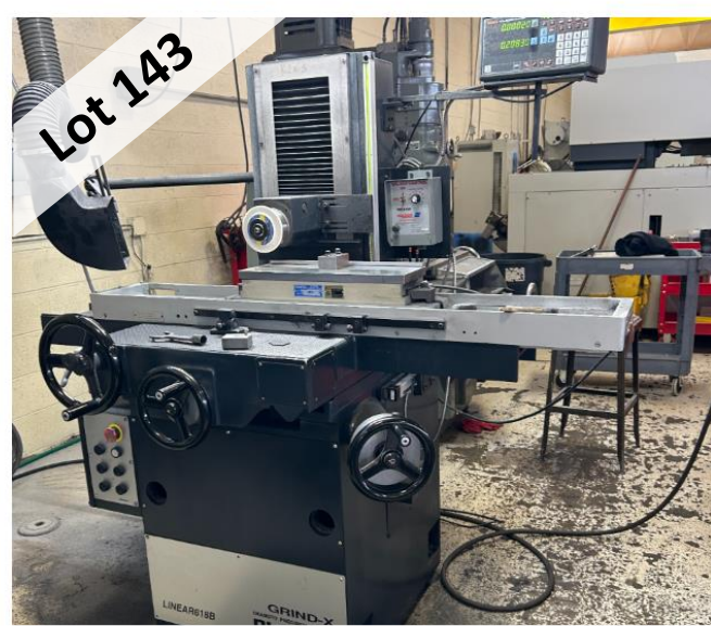
OKAMOTO 618B SURFACE GRINDER