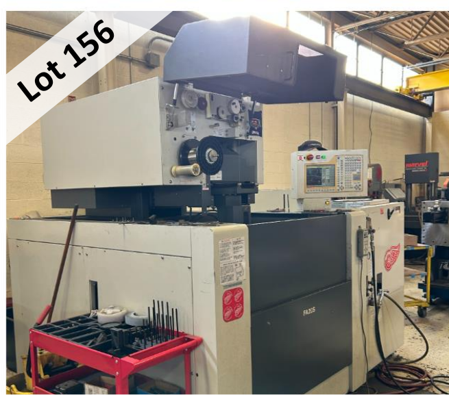
MITSUBISHI TFA20SM CNC MACHINE