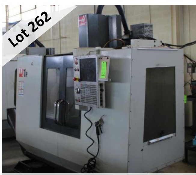
HAAS TM-1P CNC MILL MACHINE