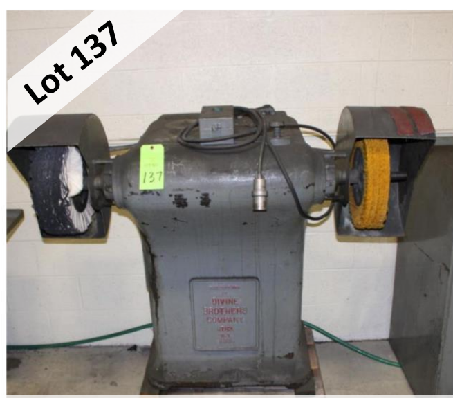
DIVINE BROTHERS CO. DOUBLE ENDED BUFFER