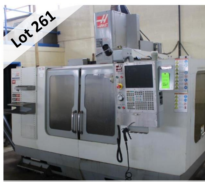
HAAS VF-4B CNC MILL MACHINE