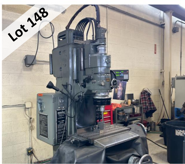
MOORE PRECISION TOOLS #3 JIG GRINDER