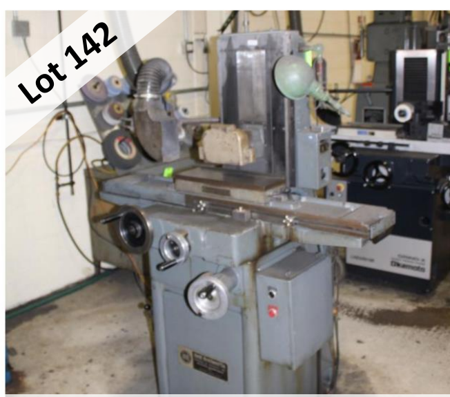
REID BROTHERS CO. SURFACE GRINDER