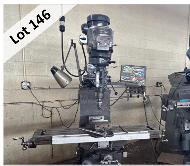
BRIDGEPORT VERTICAL MILLING MACHINE