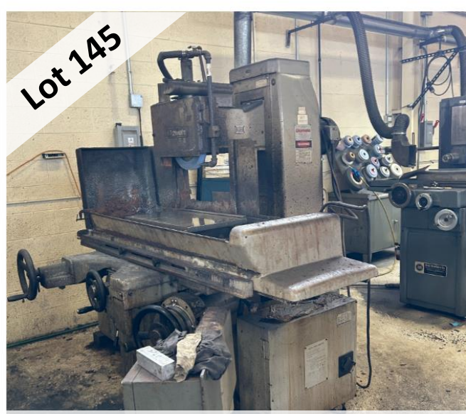
OKAMOTO ACC-124N SURFACE GRINDER