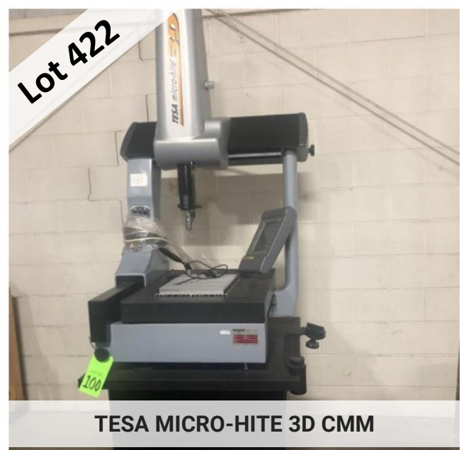
TESA MICRO-HITE 3D CMM

Preview by appointment only, contact Jamie at (248)602-1980 to schedule. Auction located in multiple cities throughout Michigan.