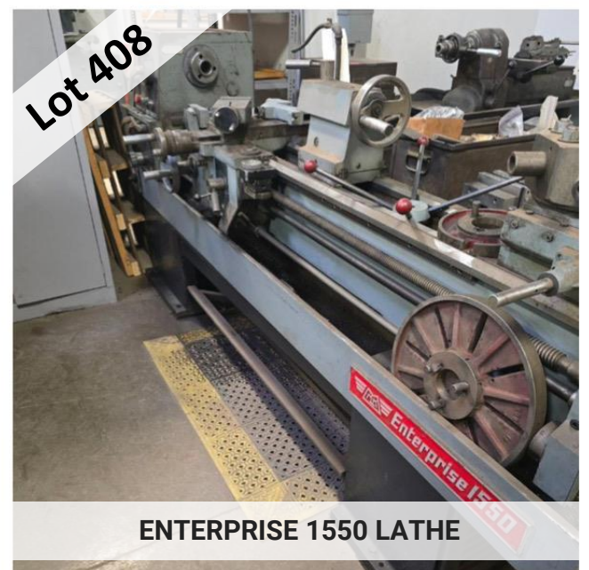
ENTERPRISE 1550 LATHE