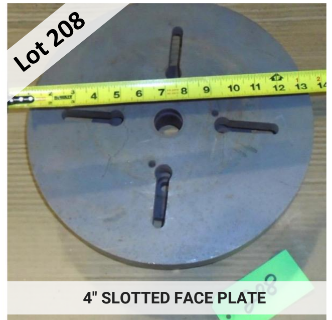
4" SLOTTED FACE PLATE