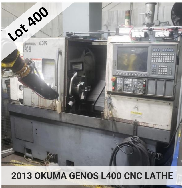
2013 OKUMA GENOS L400 CNC LATHE