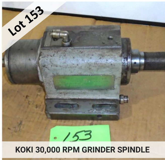
KOKI 30,000 RPM GRINDER SPINDLE