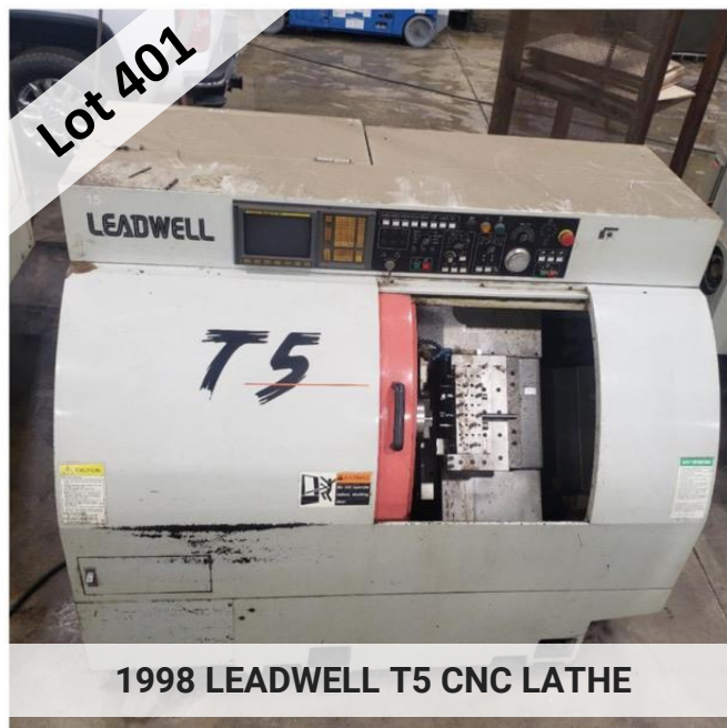
1998 LEADWELL T5 CNC LATHE