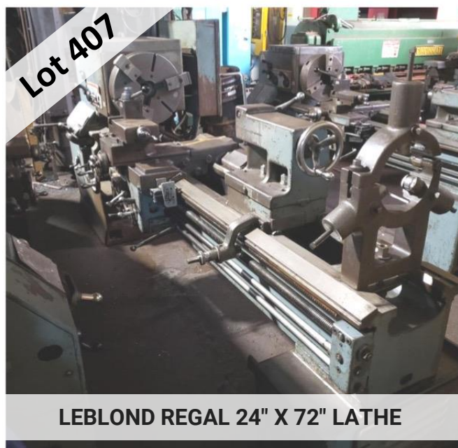
LEBLOND REGAL 24" X 72" LATHE