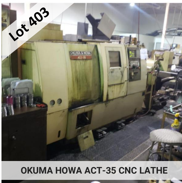
OKUMA HOWA ACT-35 CNC LATHE