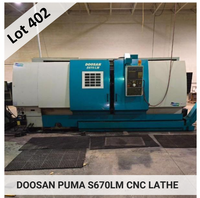
DOOSAN PUMA S670LM CNC LATHE