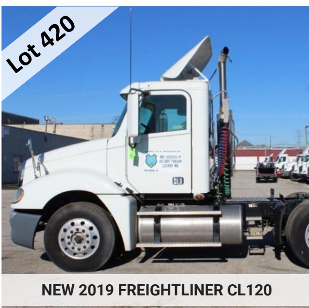
NEW 2019 FREIGHTLINER CL120