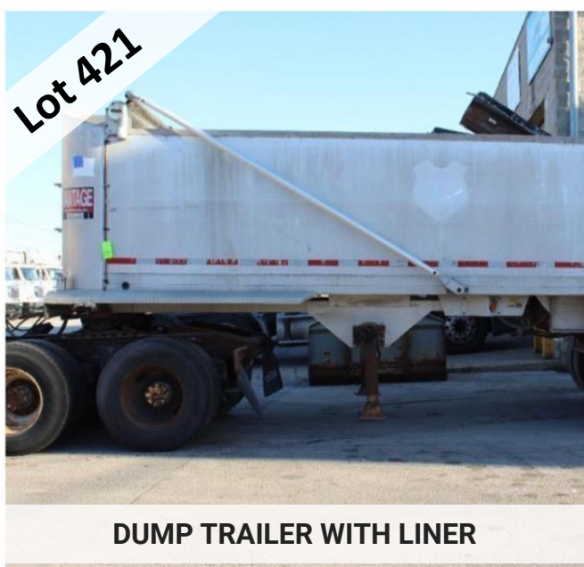
DUMP TRAILER WITH LINER