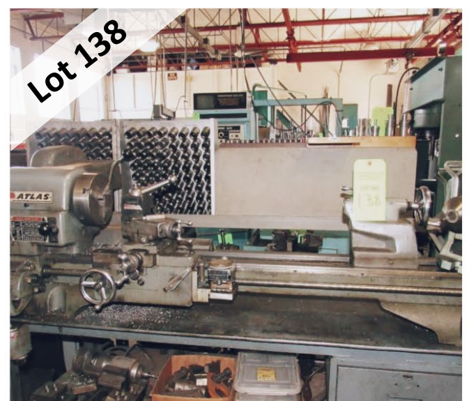
ATLAS METAL LATHE #3981