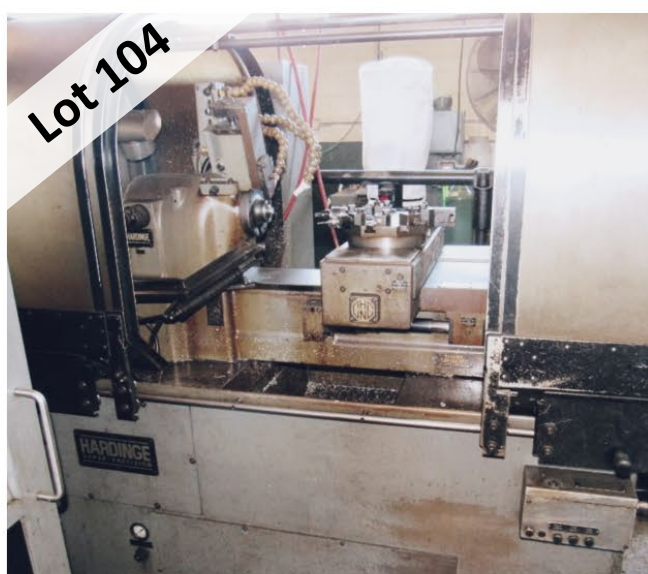
HARDINGE CNC SUPER-PRECISION LATHE