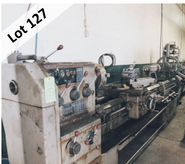
ABATE KR 320-UNIVERSAL LATHE