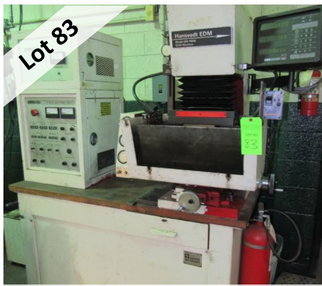
HANSVEDT EDM MACHINE