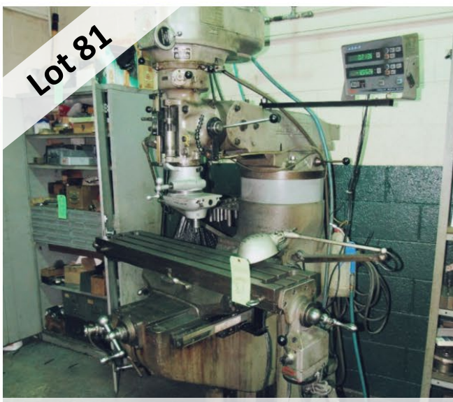
BRIDGEPORT SERIES 1 MILLING MACHINE

Auction sale for the complete closure of Allmet Industries in Royal Oak, Michigan. CNC Machines, Manual Machine Tools including multiple lathes, Hand Tools, Fork Truck, and more!