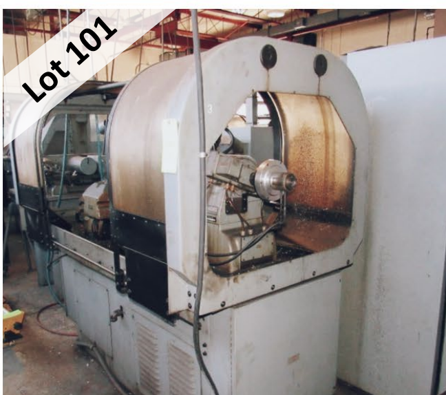
HARDINGE CNC SUPER-PRECISION LATHE