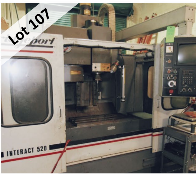
BRIDGEPORT 520 CNC MILLING MACHINE