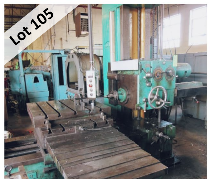
NOMURA HORIZONTAL BORING MILL