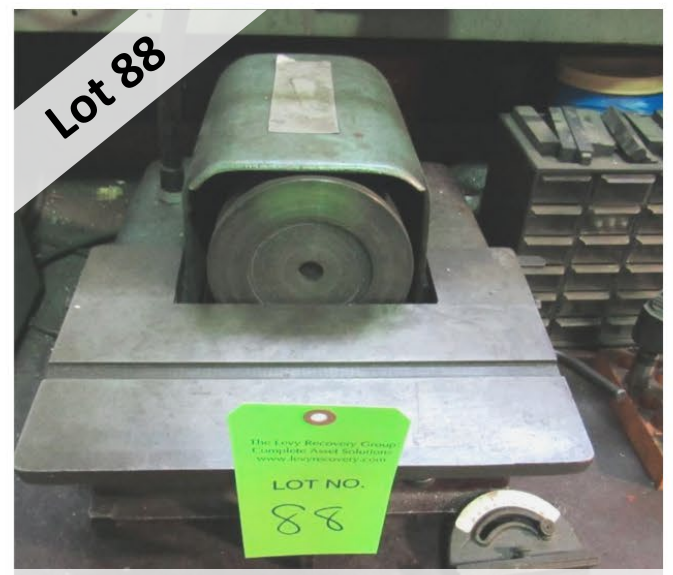
STORM VULCAN CRANKSHAFT GRINDER