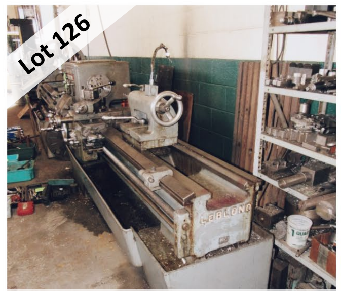
LEBLOND REGAL METAL LATHE 13"