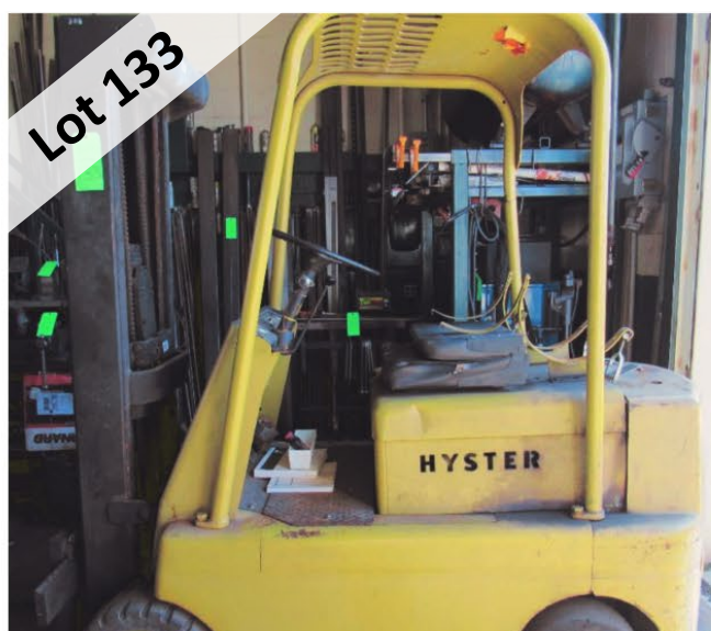
HYSTER 48" FORK TUCK